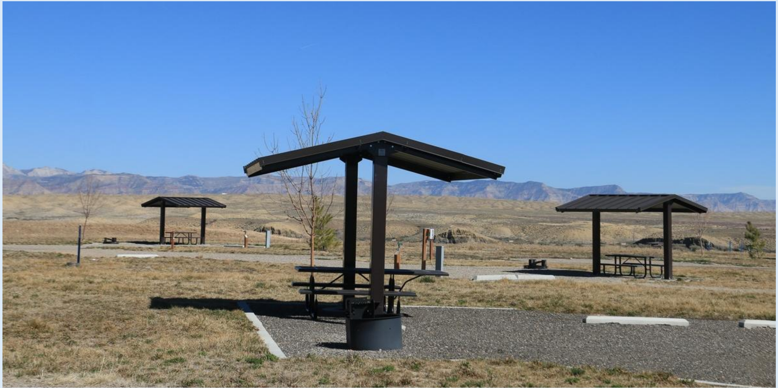
653-Stefanie Coppock – 3 picnic tables