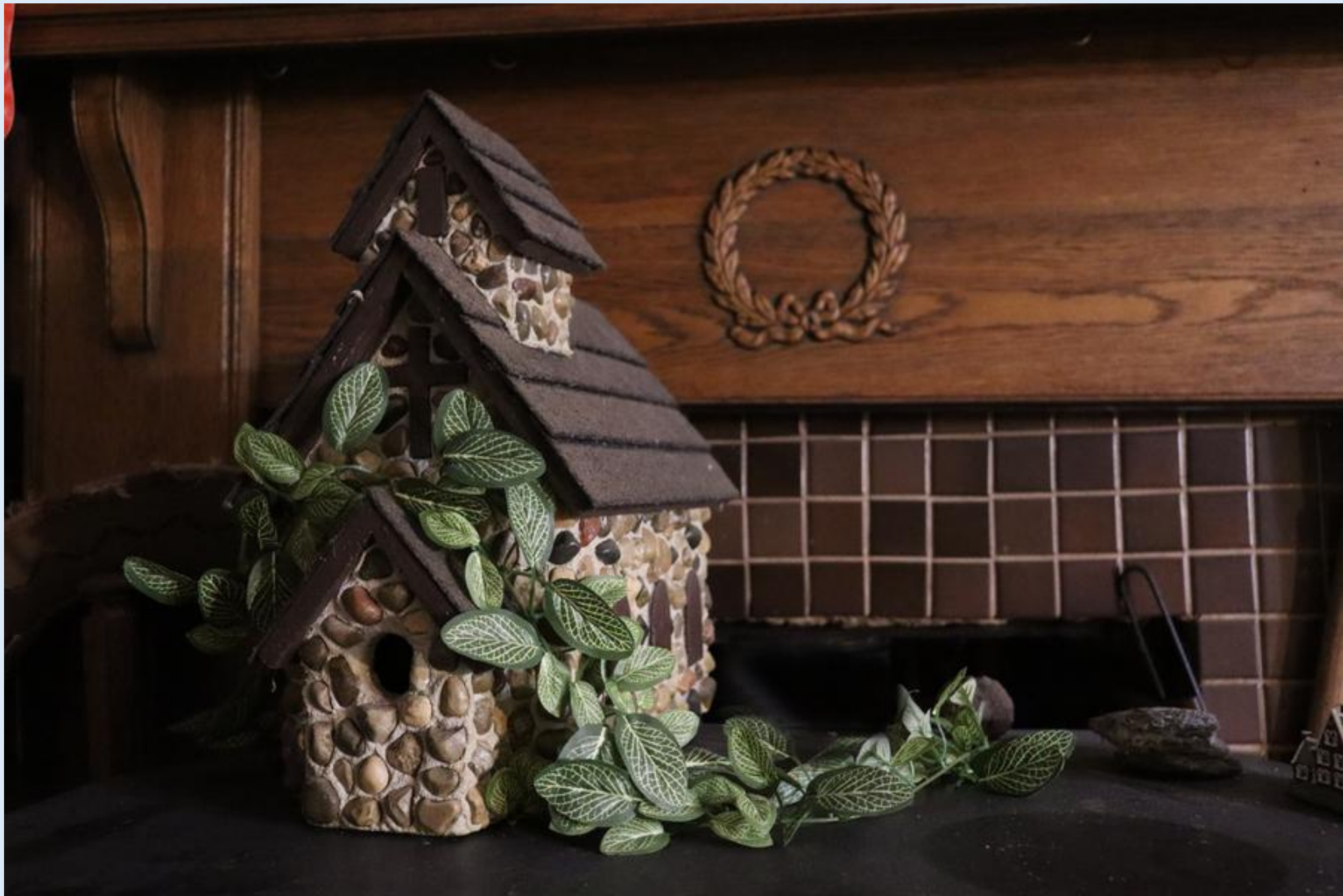
608-Carol Renfro – Stone church birdhouse with three peaks, lower, middle and top