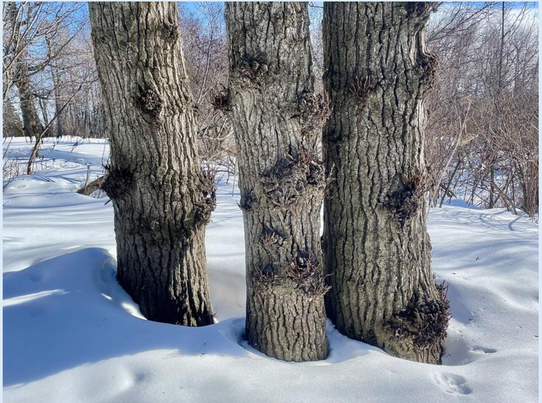
607-Susan Barrickman Cottonwood Triad