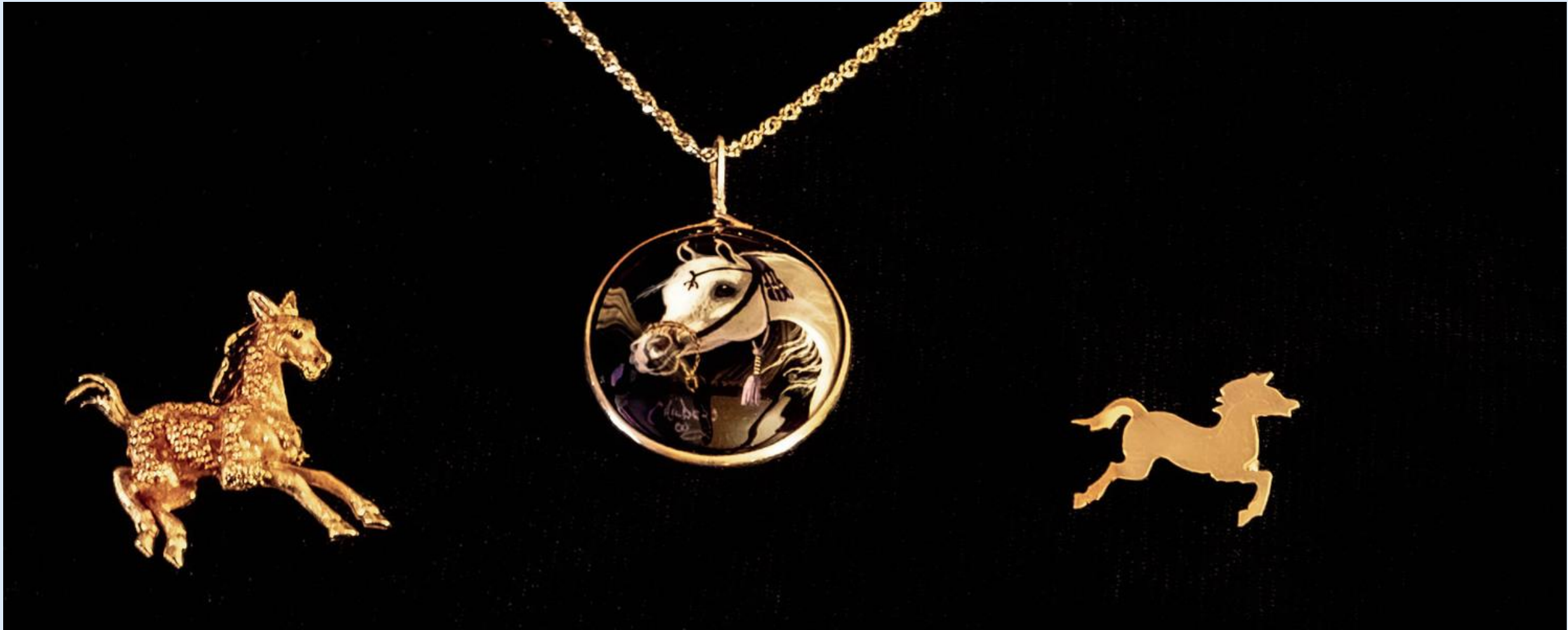
612-Karen Cole-Loy – necklace and pins