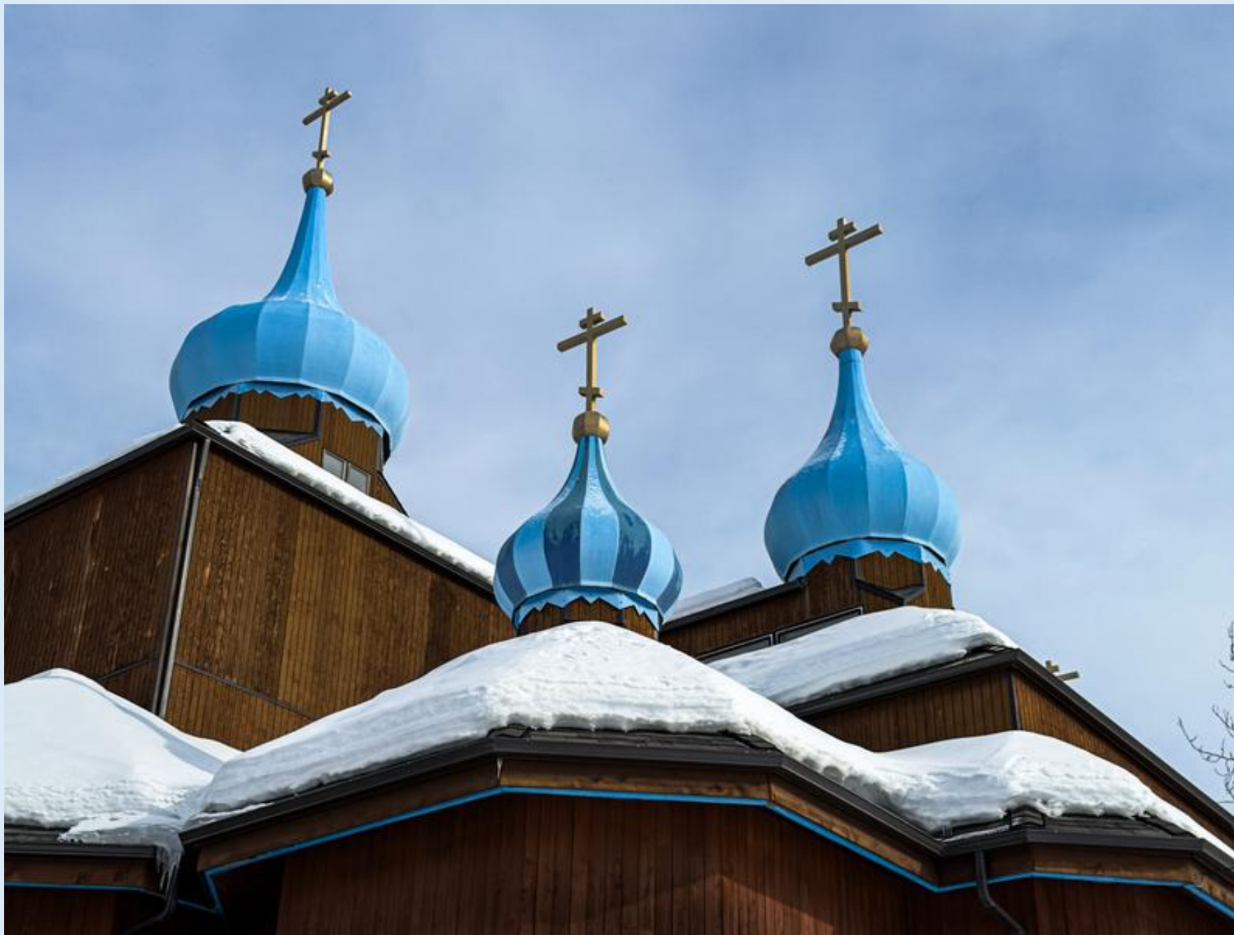
616-Chuck Iliff - 3 domes