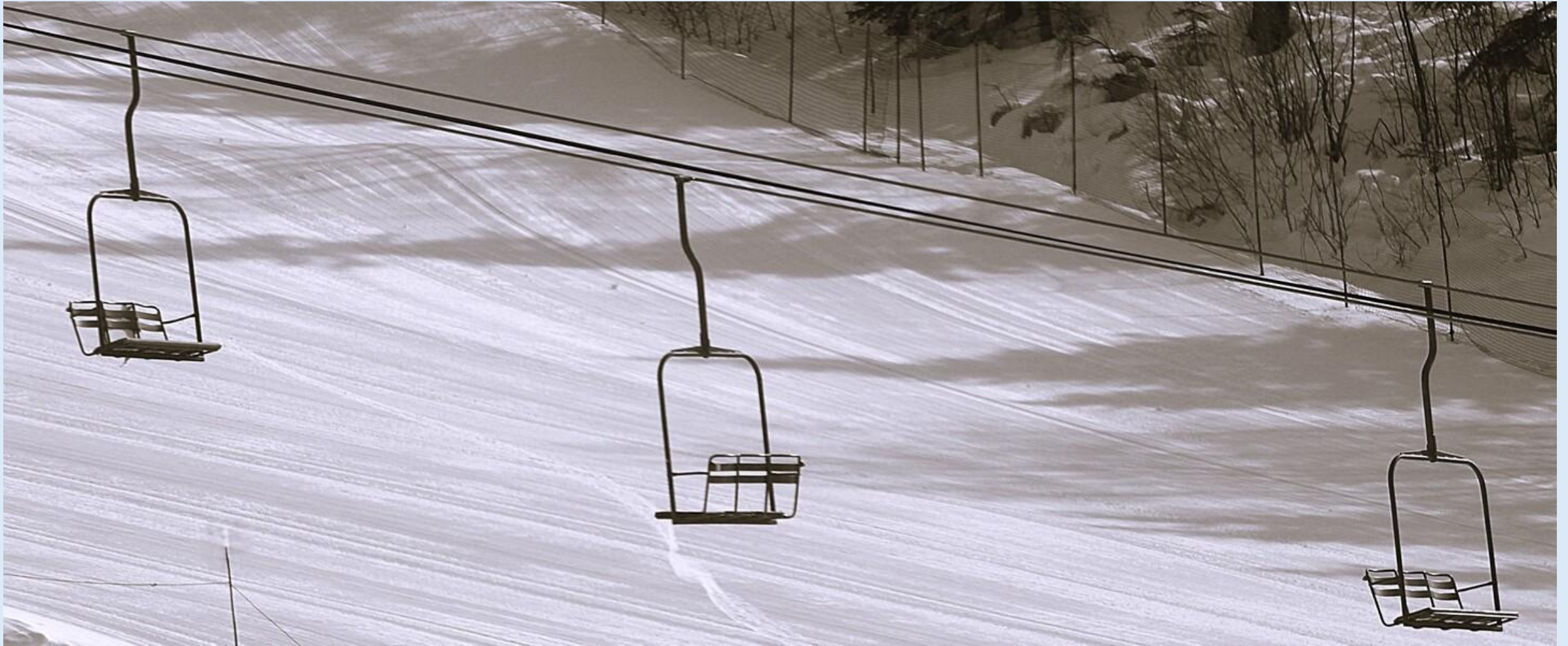
605-Ron Brandeberry Three X Three Empty Seats BW