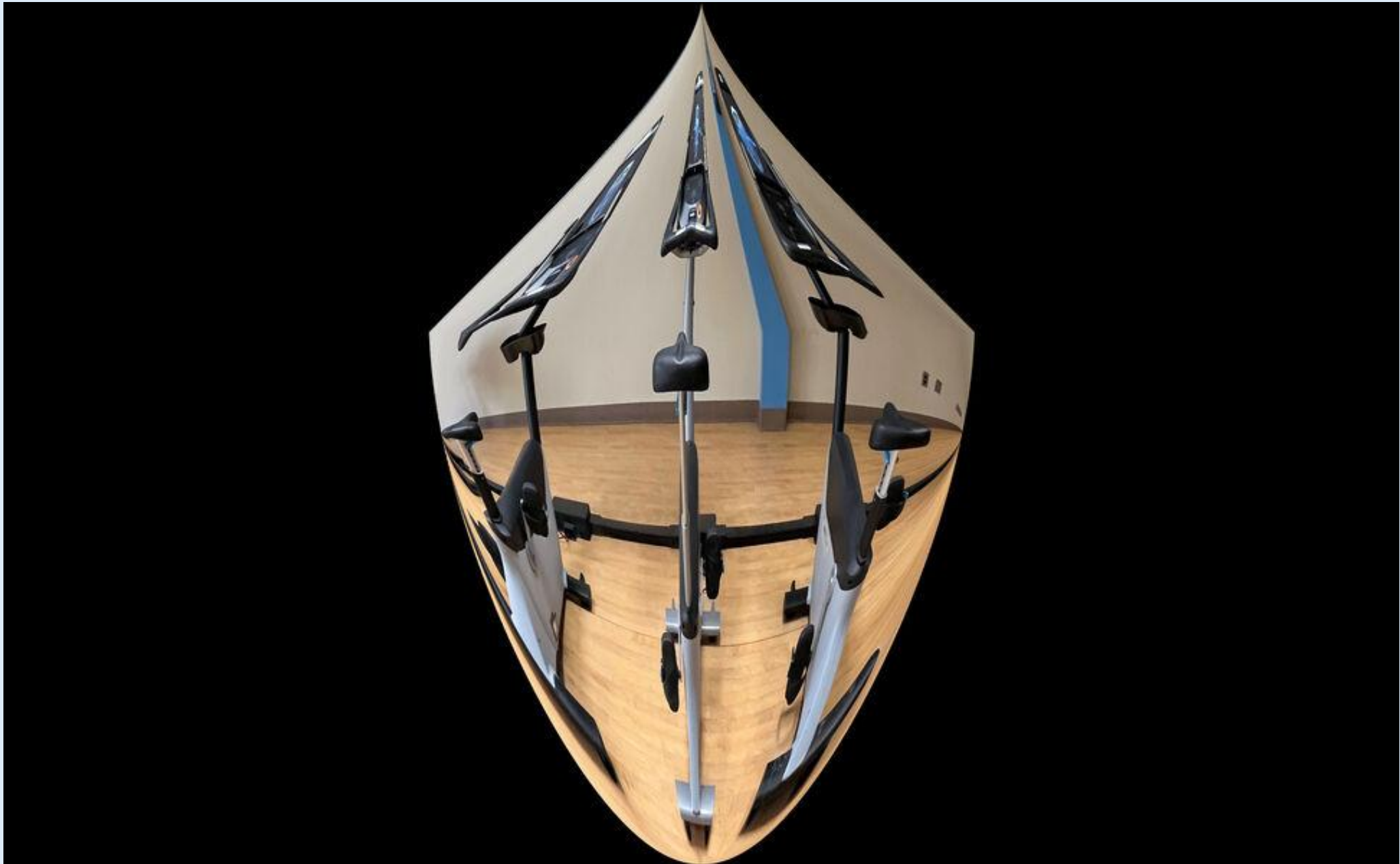
606-marty lyman – cycling in the pentagon