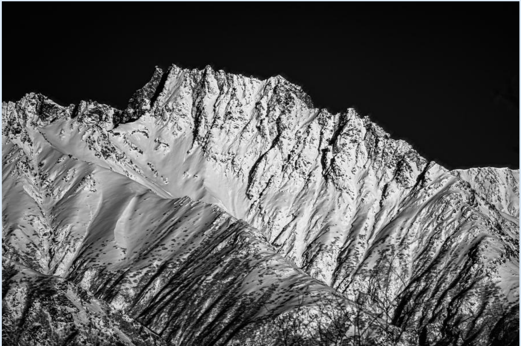
514-Chuck Iliff - 2026 Moksha Peak