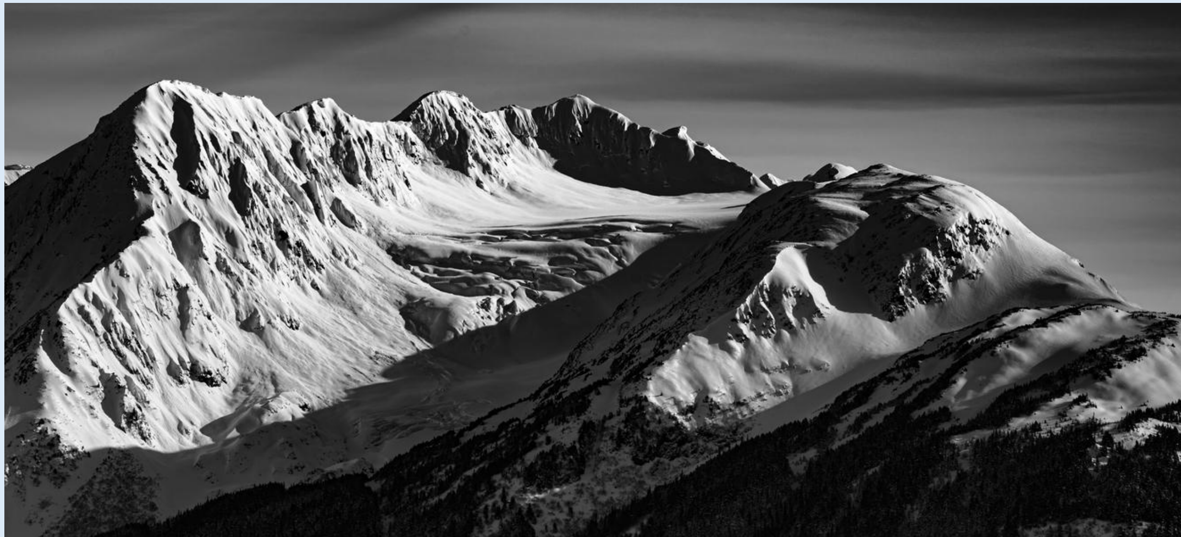
504-Bill Cole – Explorer Glacier above upper Turnagain Arm