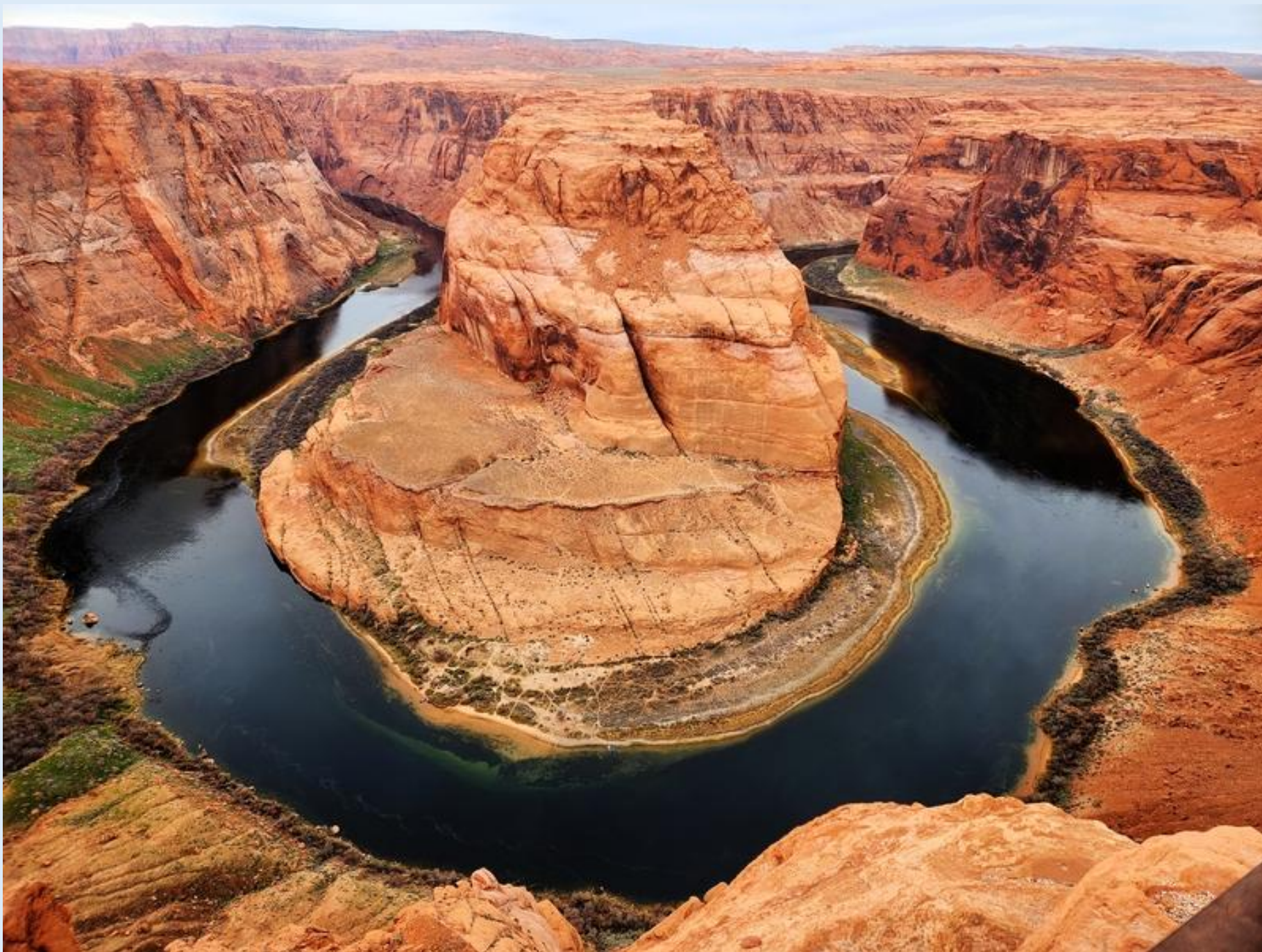
502-Stefanie Coppock Horseshoe Bend