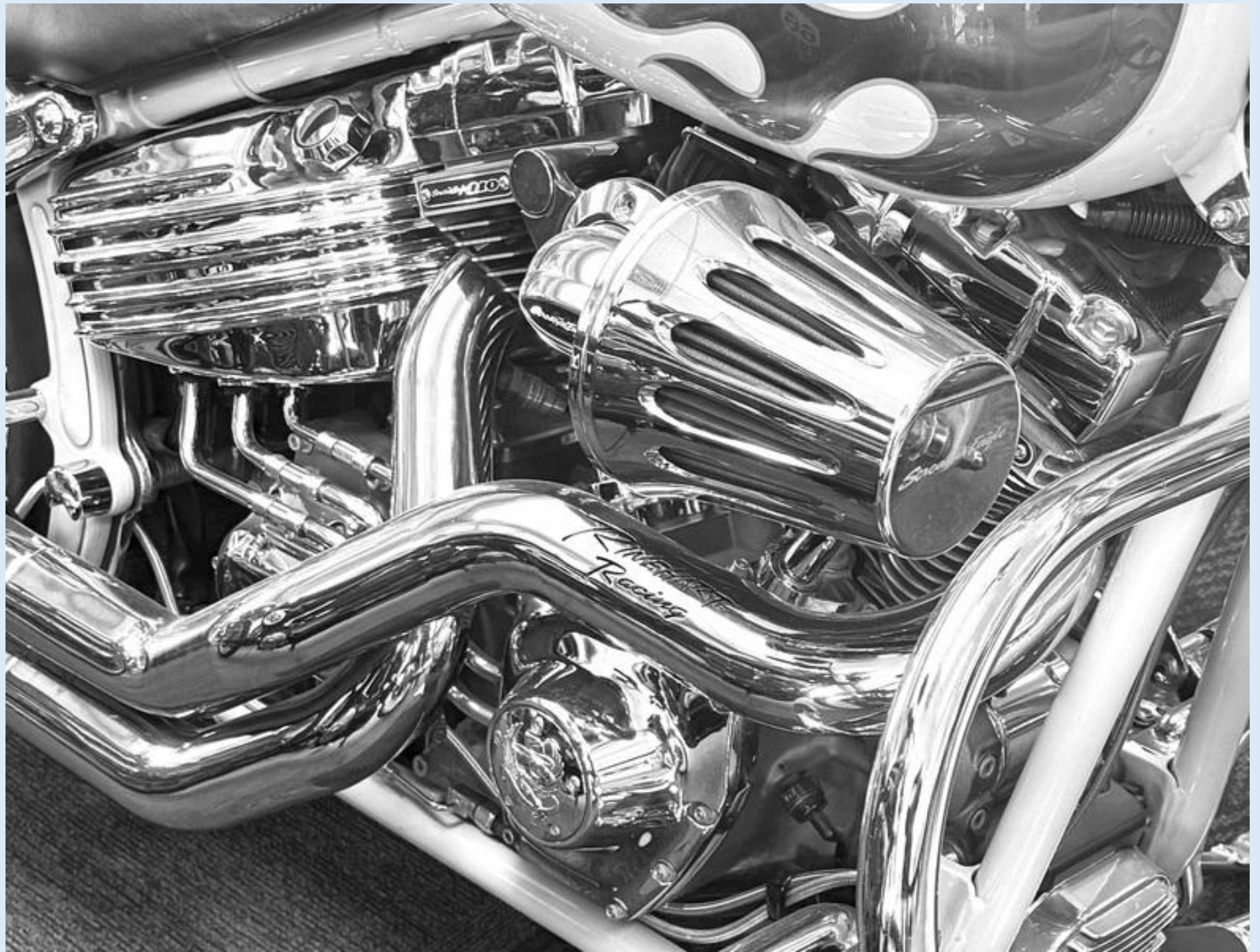
509-Daveb – Shiny Object