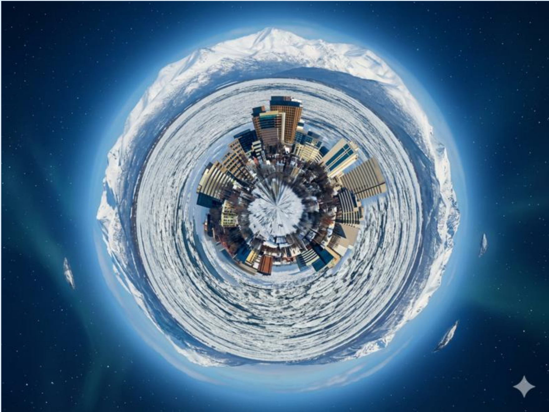
556-Paula Pics AI's Tiny World Effect