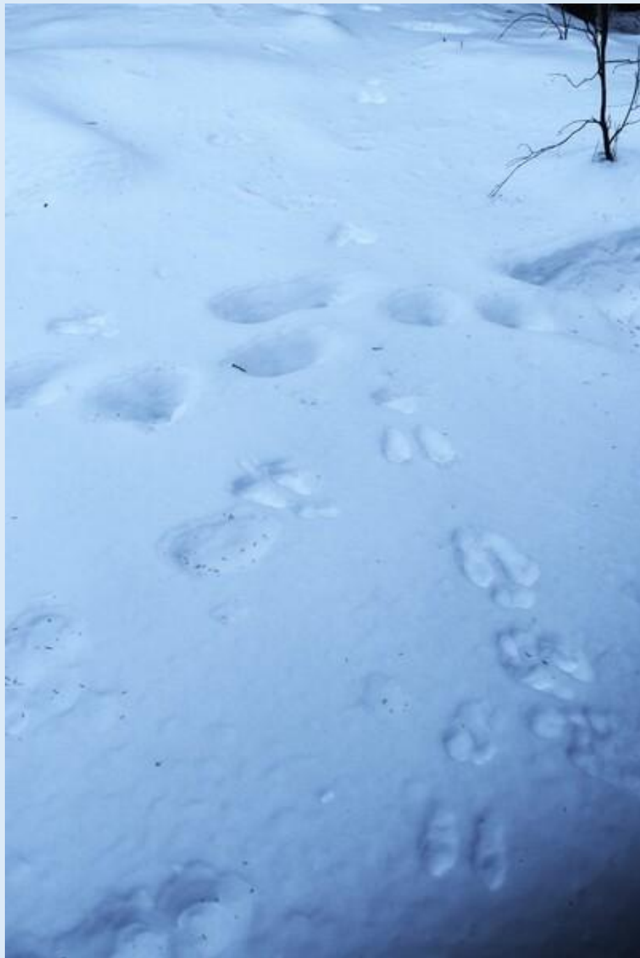
510-Jim Somerville Large and small