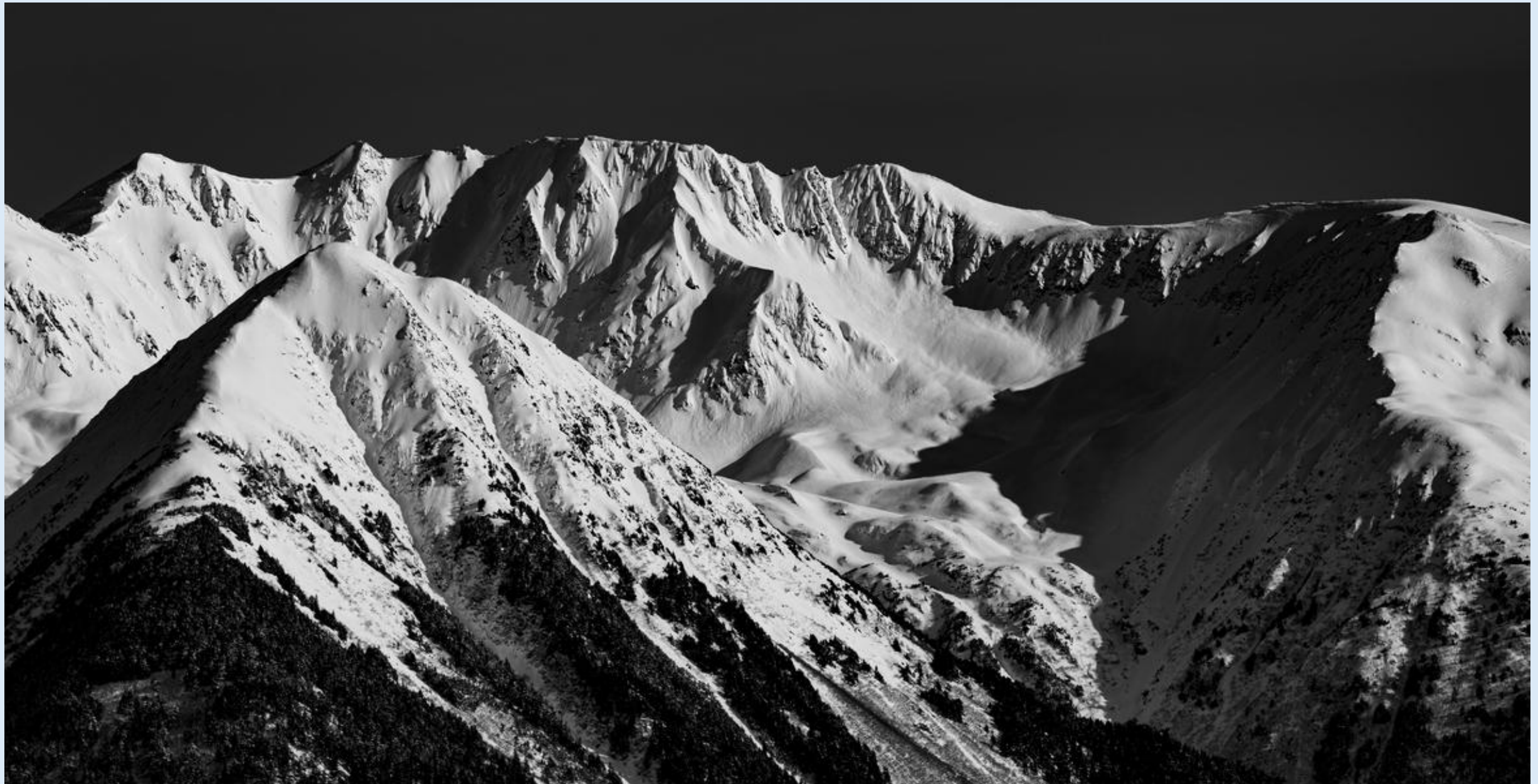
17553-Bill Cole – Mountains above Turnagain Arm