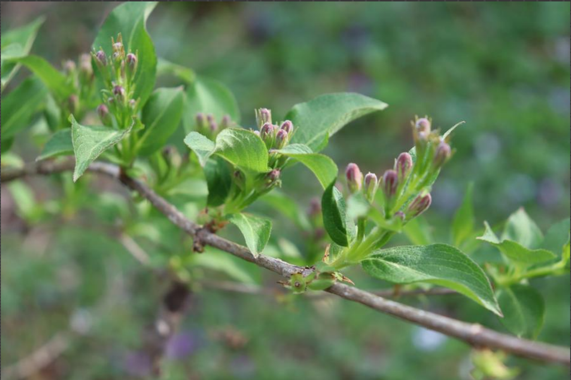
707b-Carol Renfro – Green leaves and buds of a pink wygelia