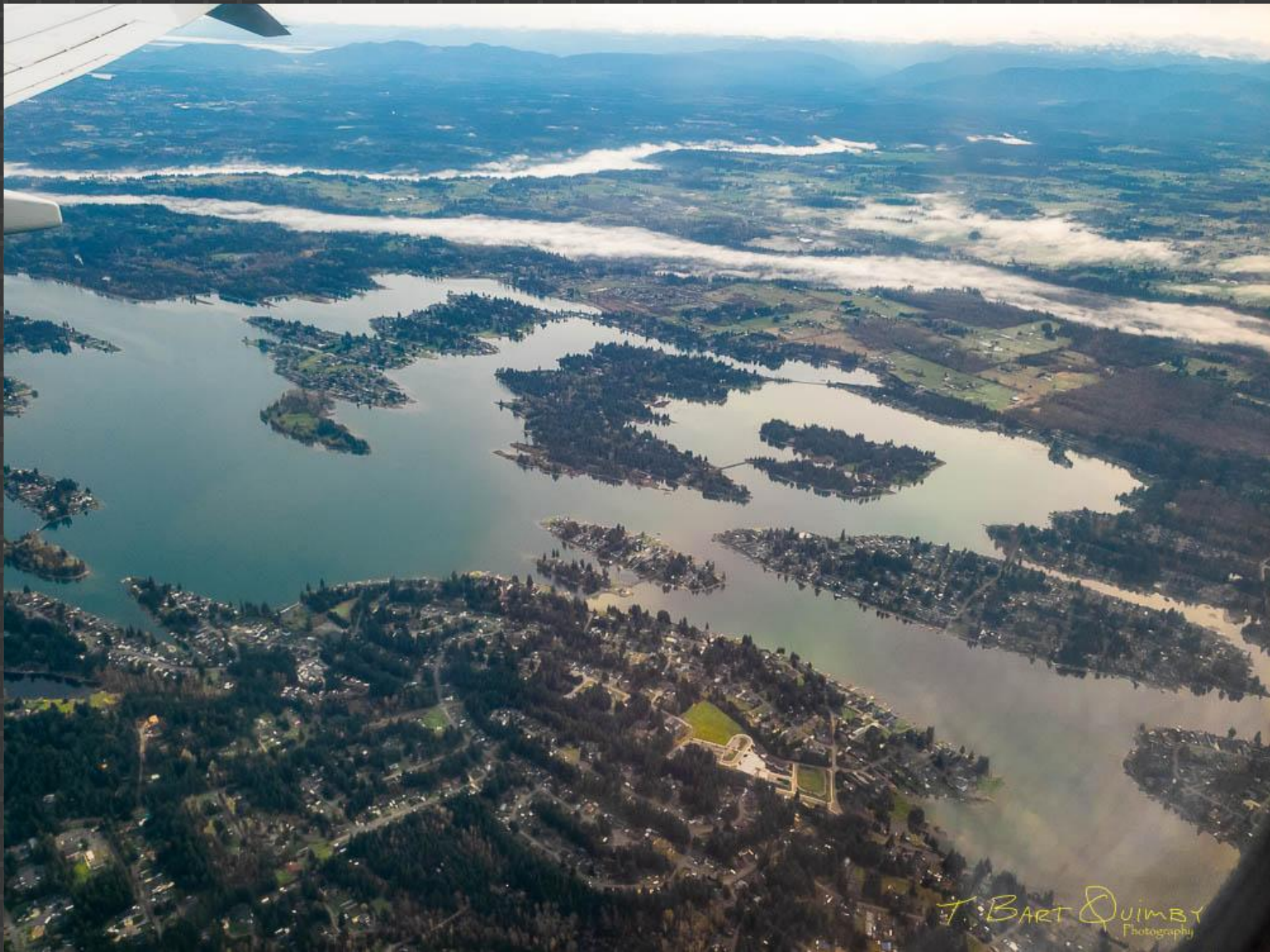
756a-Bart Quimby – Not Arizona!