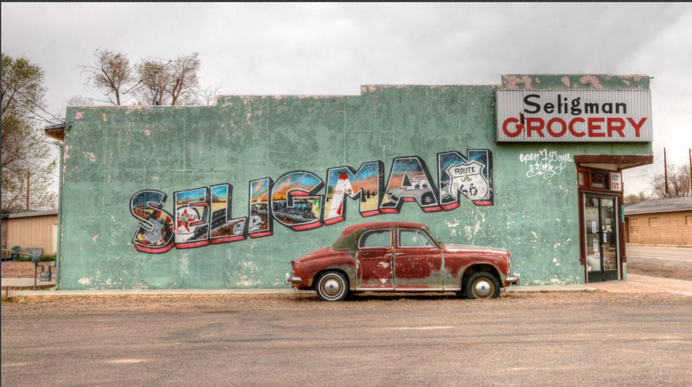
703a-Stefanie Coppock – green grocer