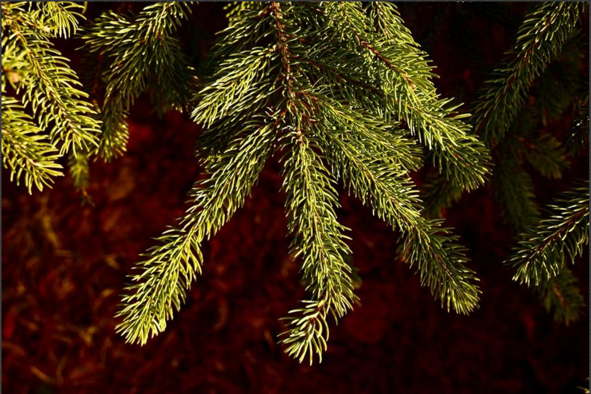
753a-marty – evergreen