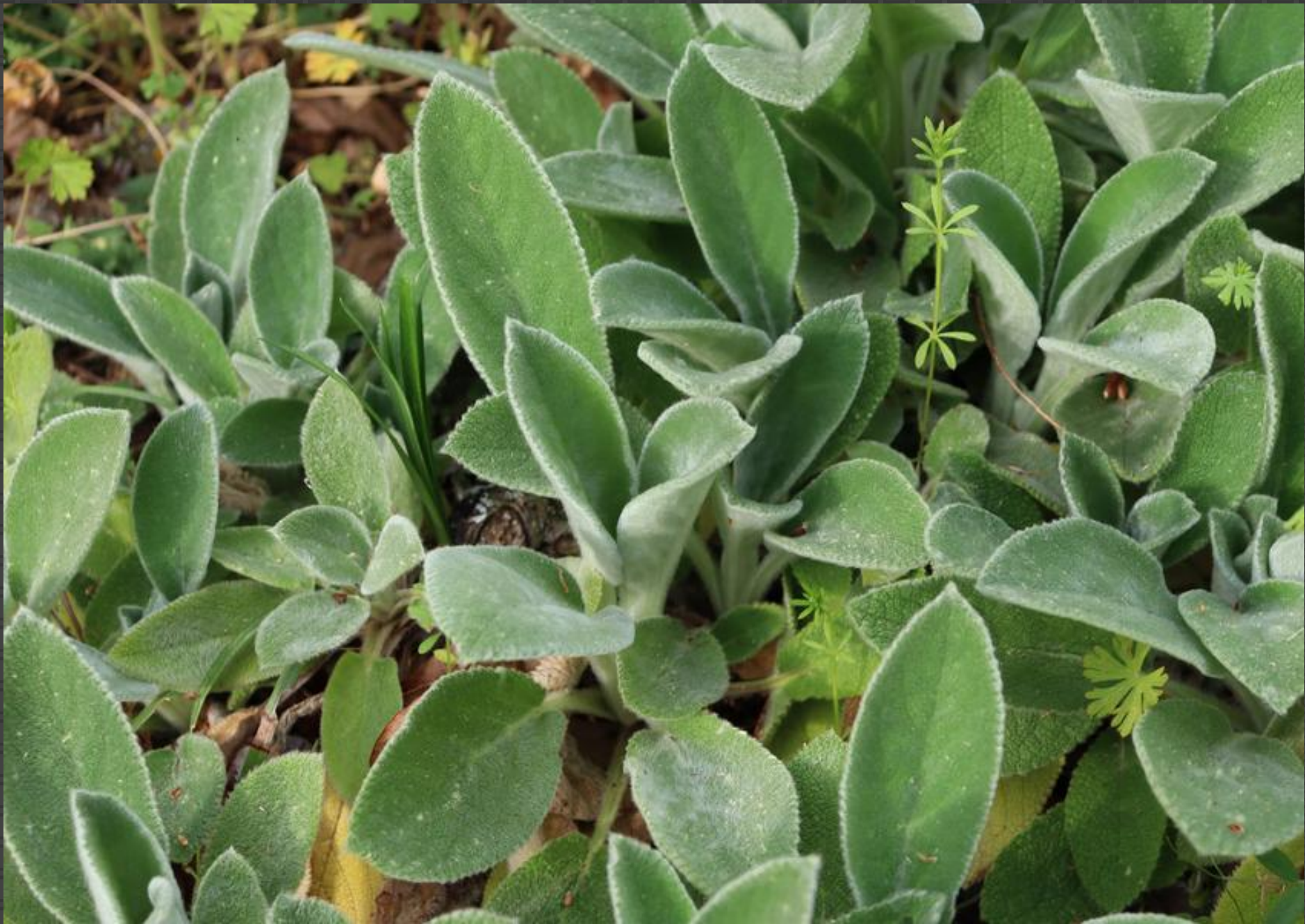
755a-Carol Renfro – Soft green lamb's ears