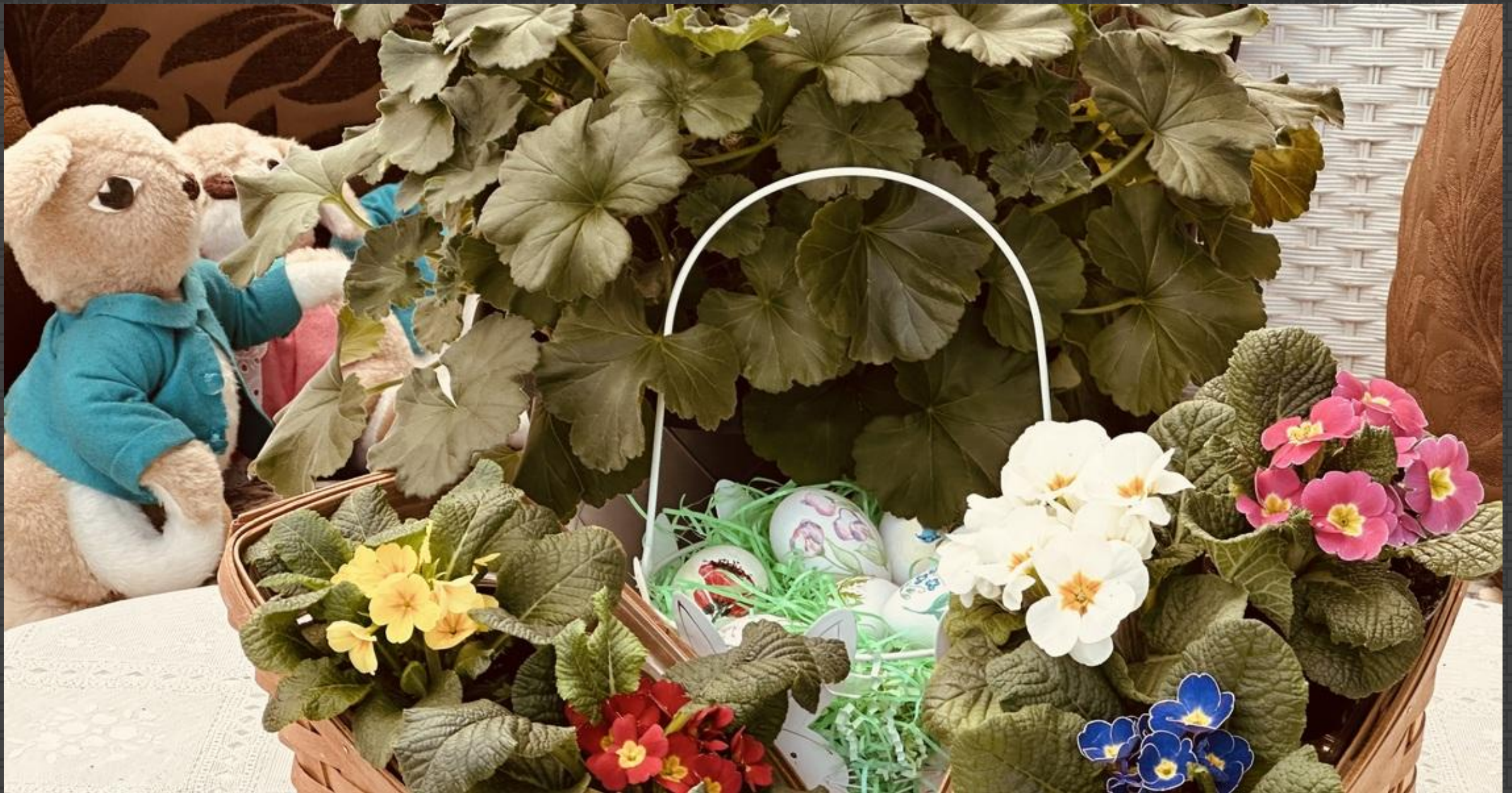
701 a-Dana Klinkhart