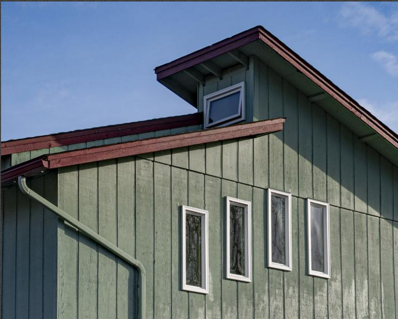
754a-Bill Cole – Geometric Green