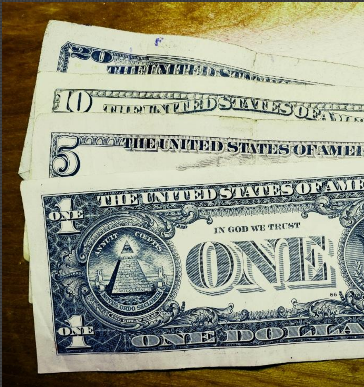
710b-Bart Quimby – Greenbacks