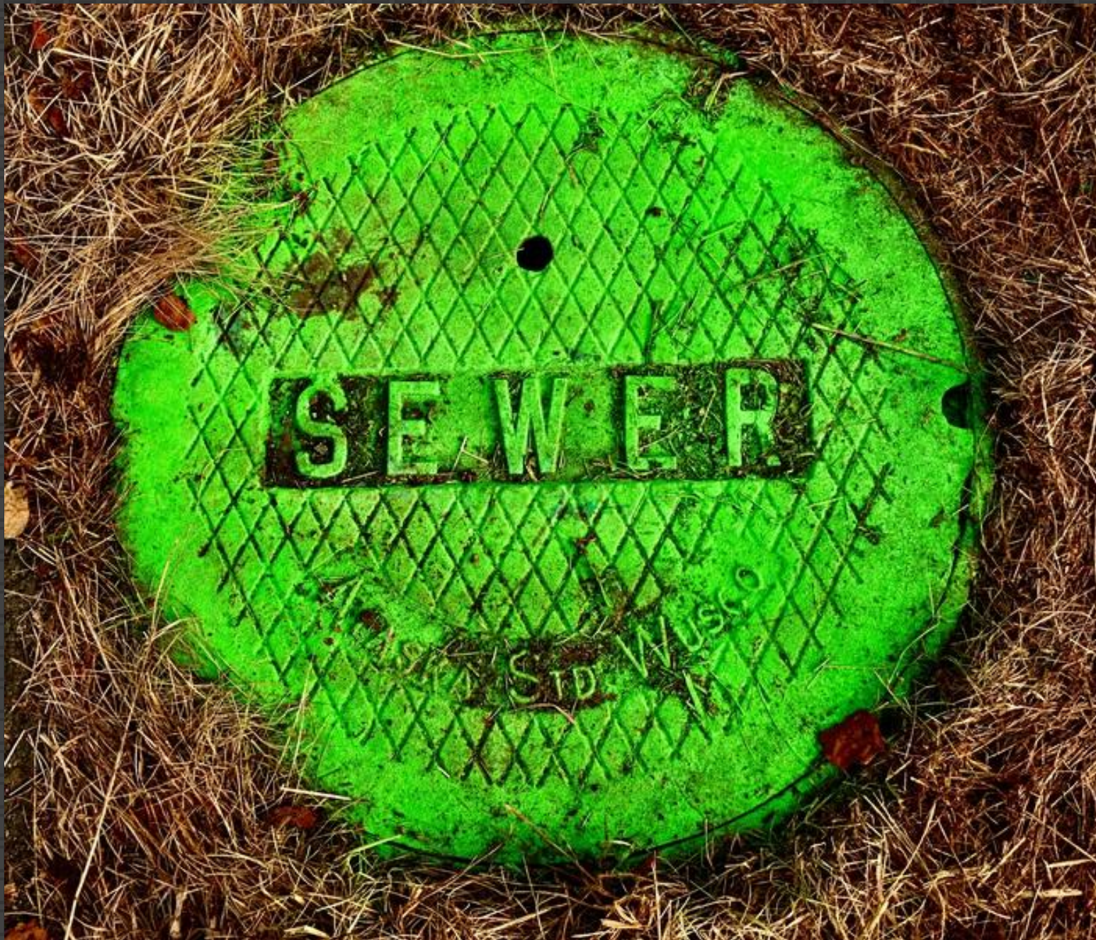
704b-marty – green sewer