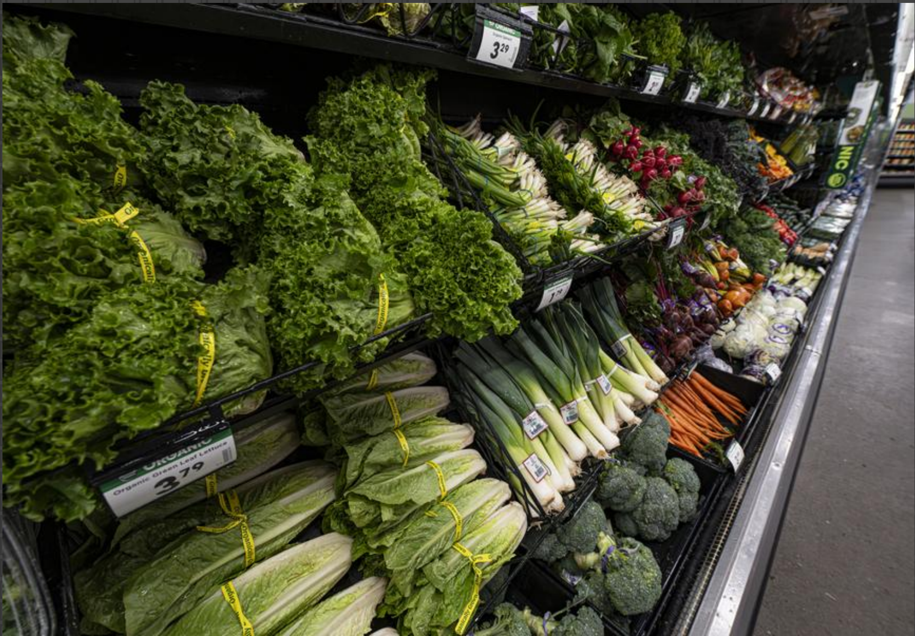
706b-Bill Cole – Grocery Green