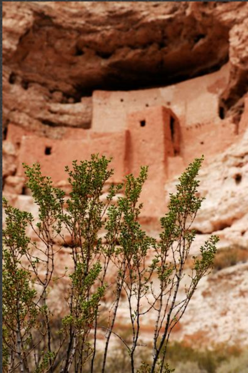
703b-Stefanie Coppock – montezuma's castle