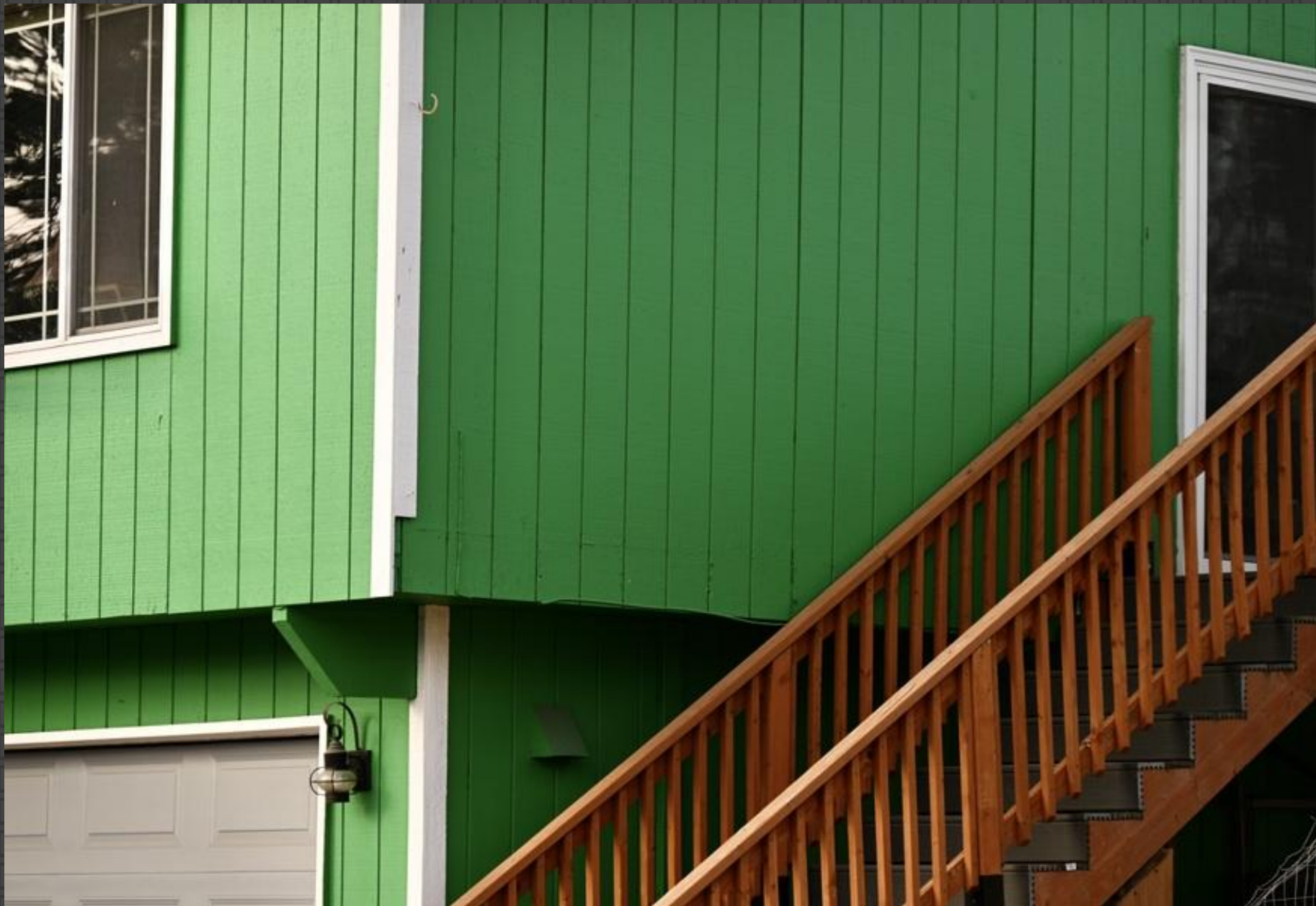
704a-marty – the green house