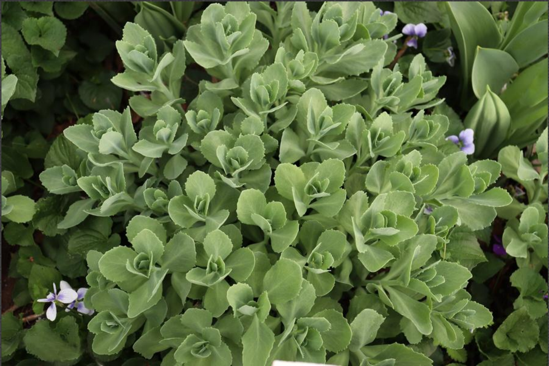
707a-Carol Renfro – Young sedum leaves in spring