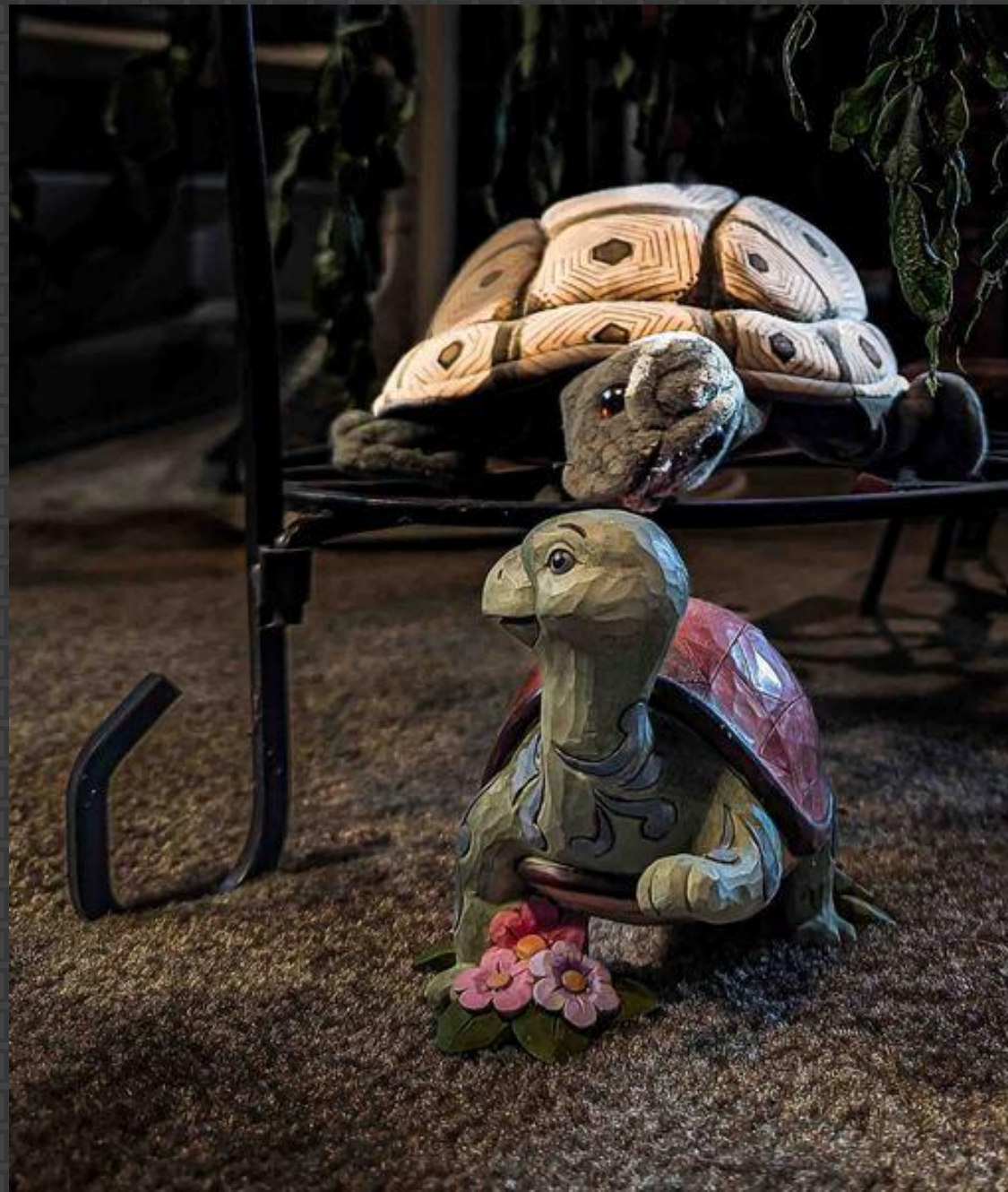
708b-Karen Cole-Loy – turtles visiting