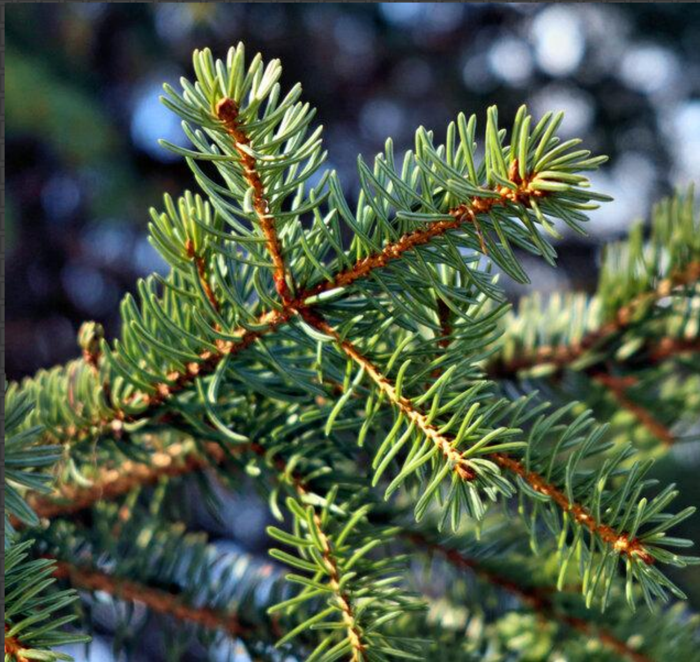
755a-Bob Estey - Green3