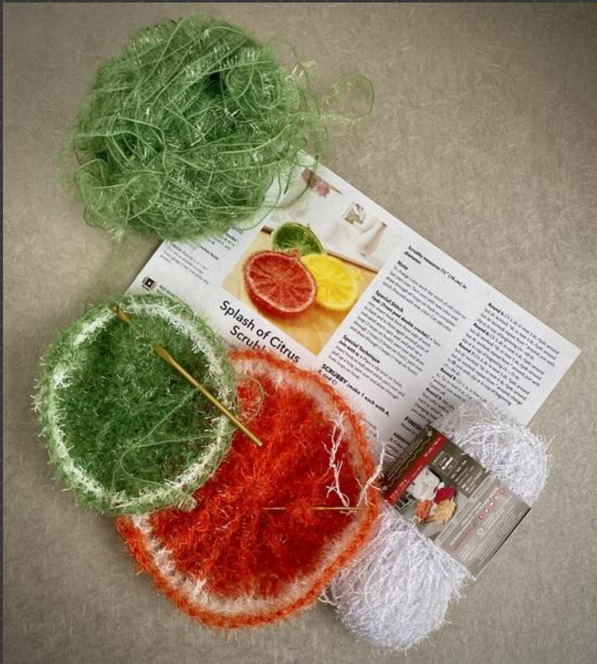
703a-Shirley – Crocheted scrubbie project