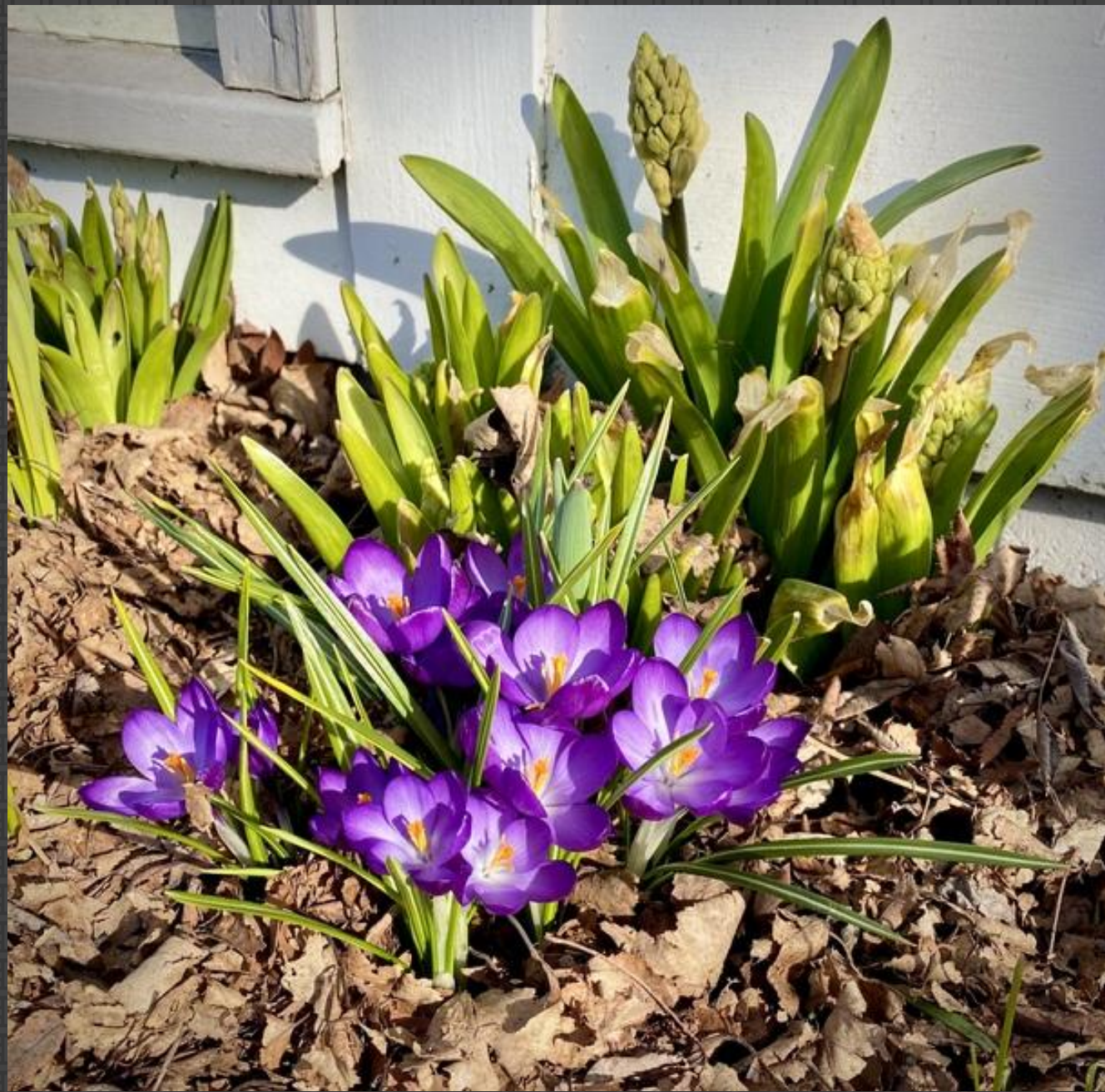
703b-Shirley – Spring Green!