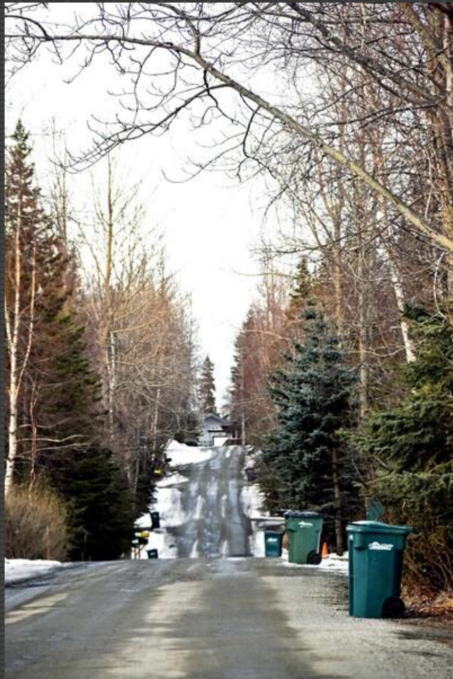
701b-Jim Somerville – Bins