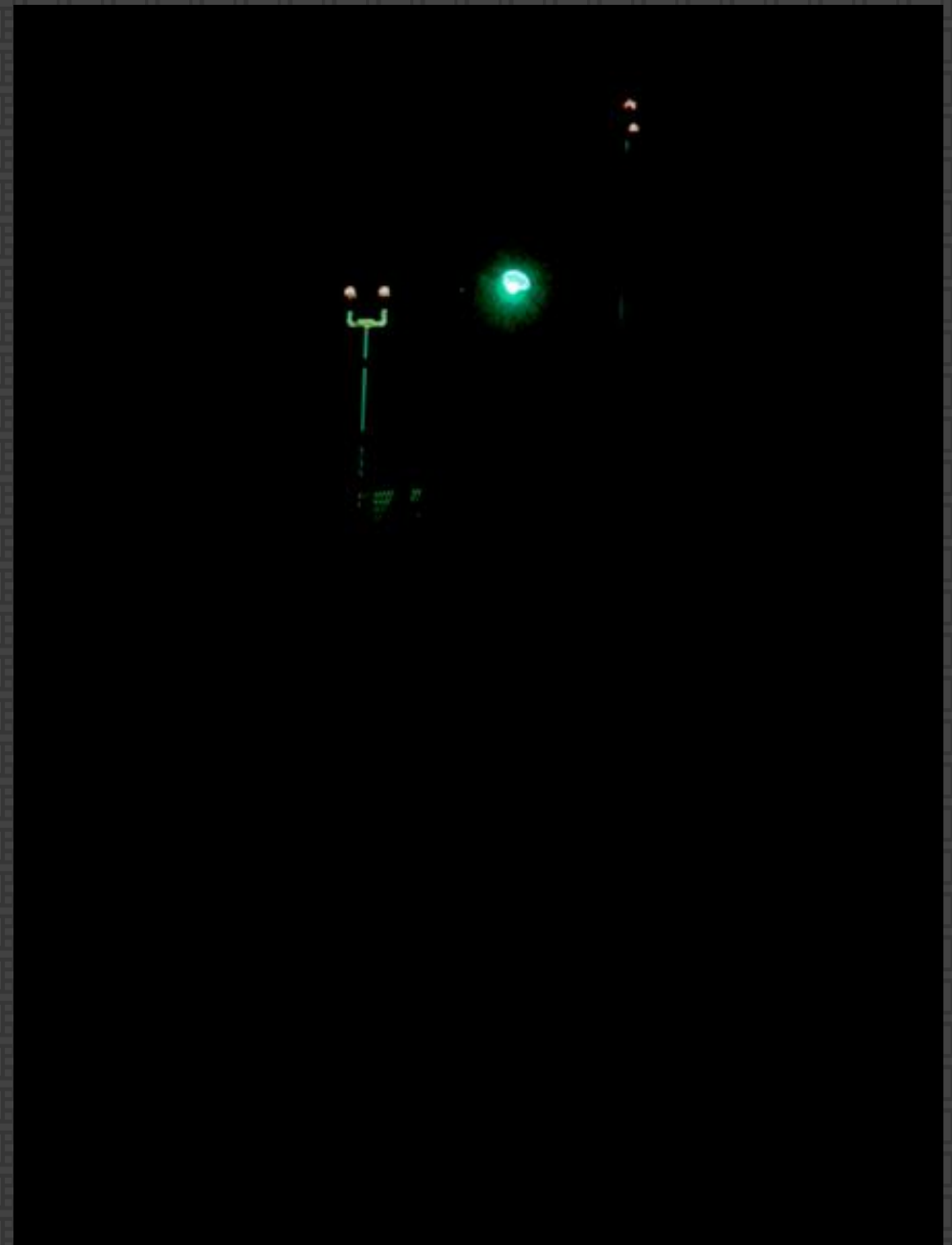
Palmer Green Airport Beacon