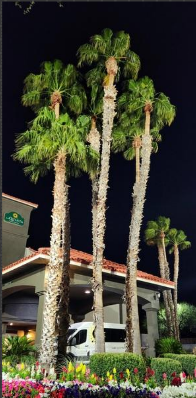
709b-Sandy A Quimby