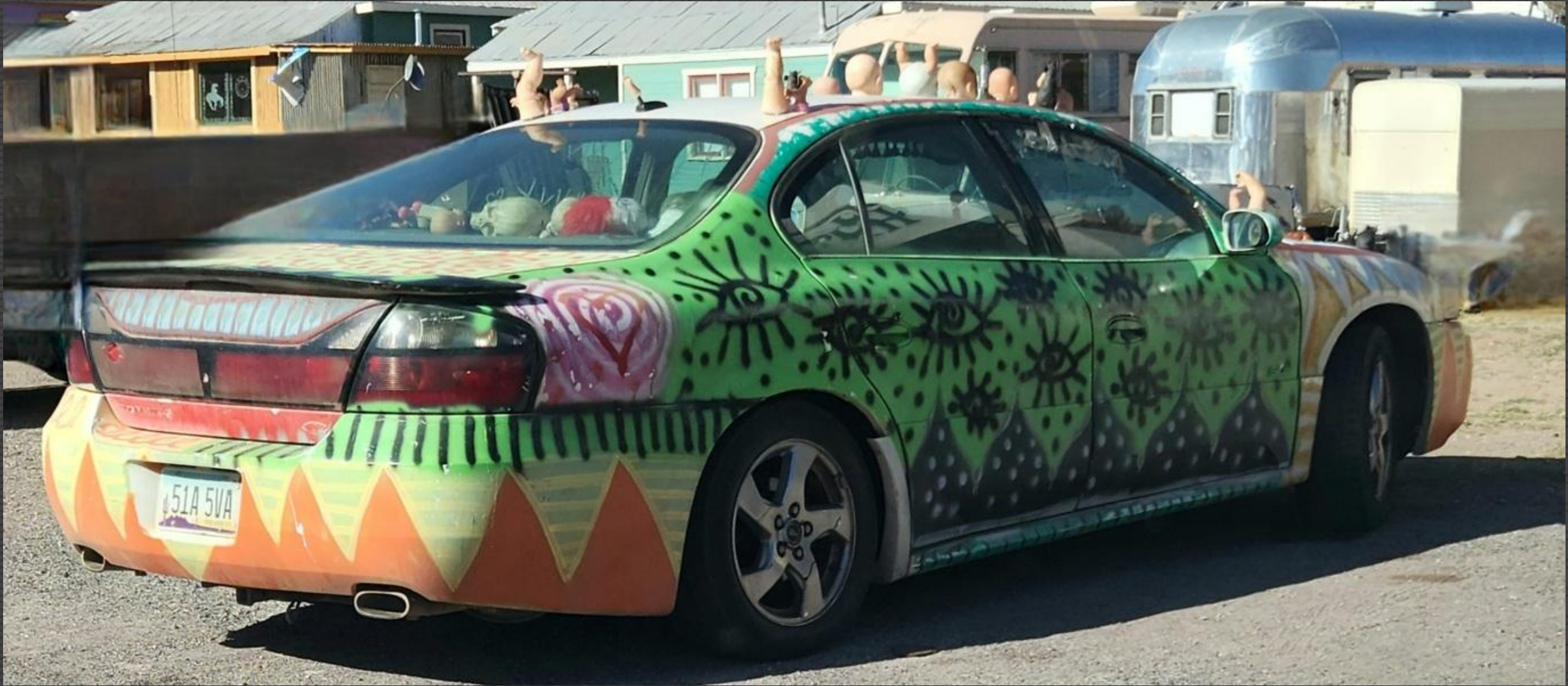
709a-Sandra A Quimby