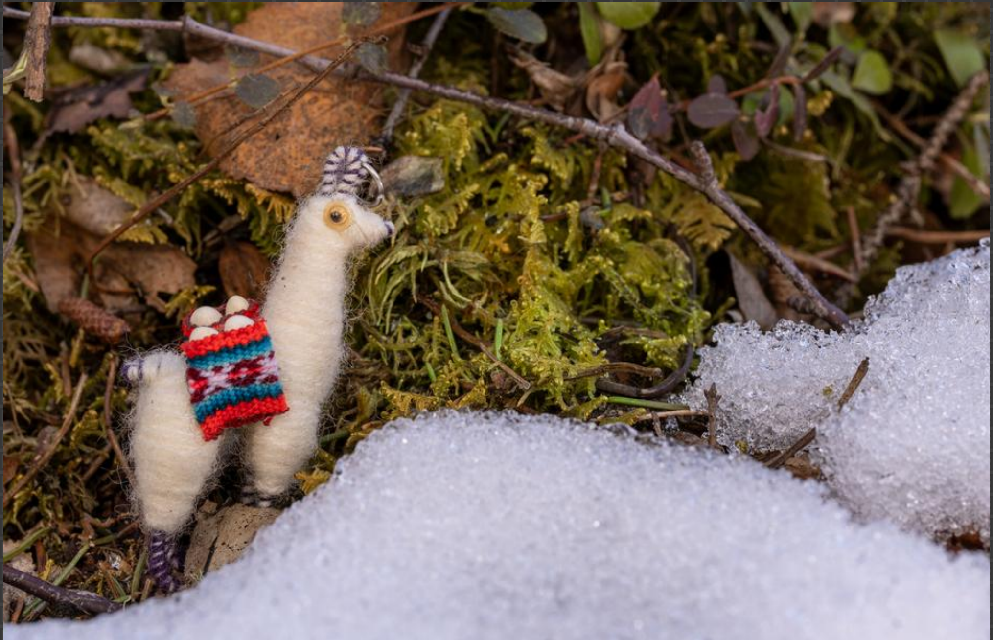
704a-James Cantor – Green 1