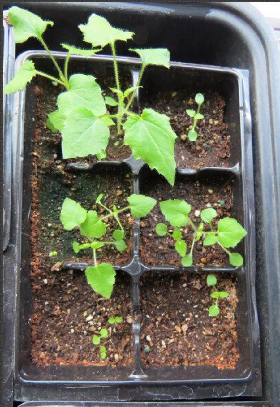
706a-Bob Estey – Green