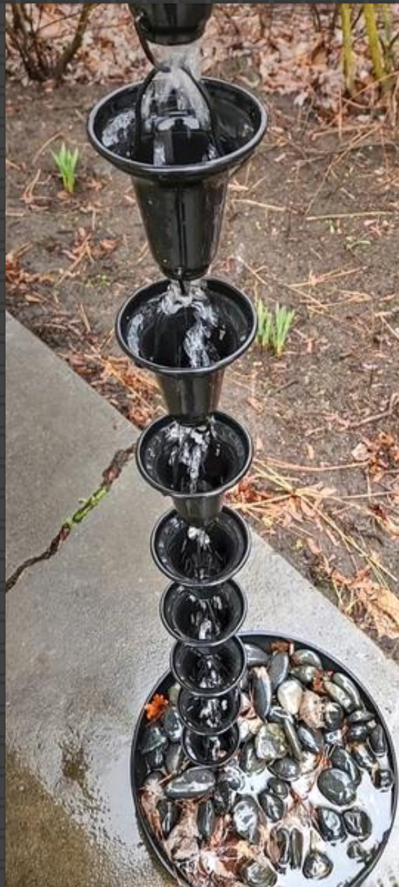
651-Stefanie Coppock - rain drops