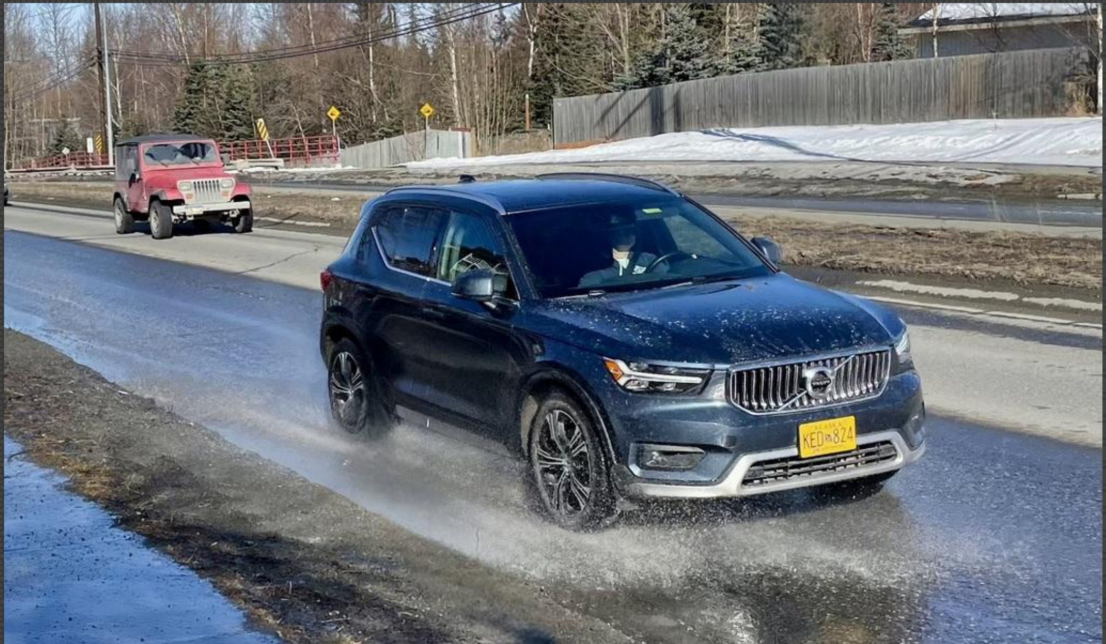
605a-Susan Barrickman - Break up