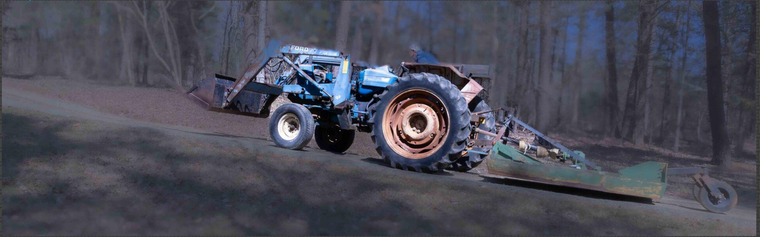
652-Karen Cole-Loy - Frustrated Nascar driver