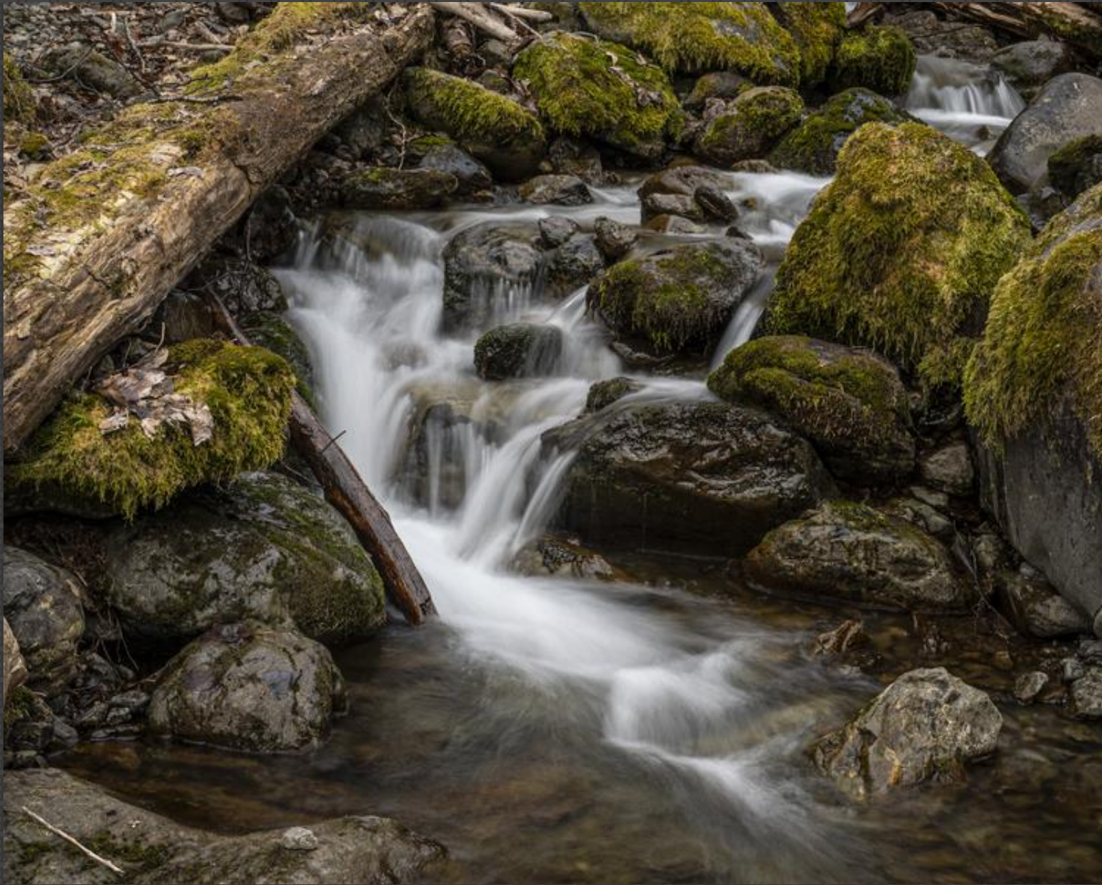
604a-Bill Cole - Falls Creek