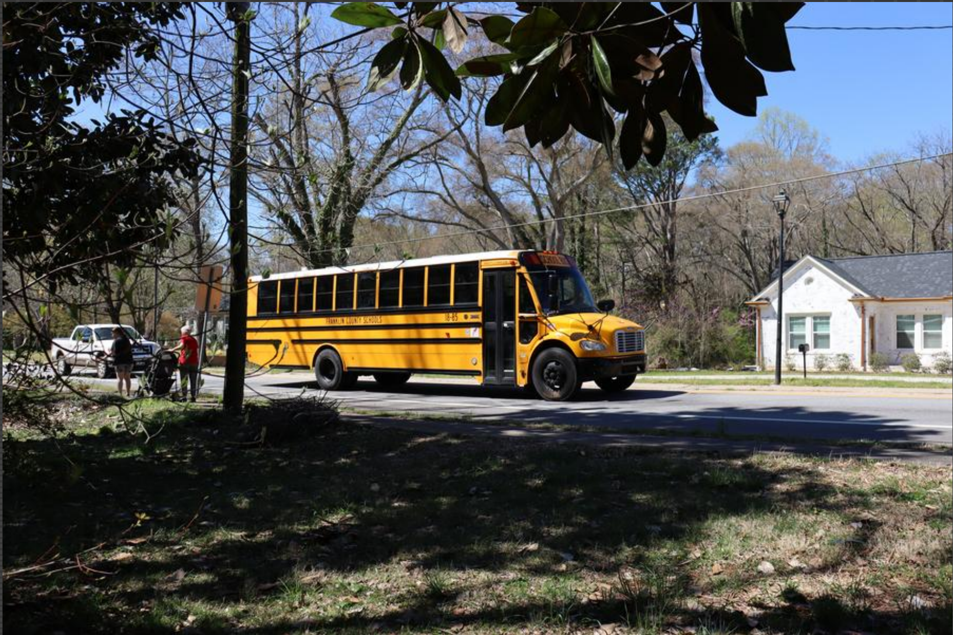
607b-Carol Renfro - Yellow-orange school bus, people walking