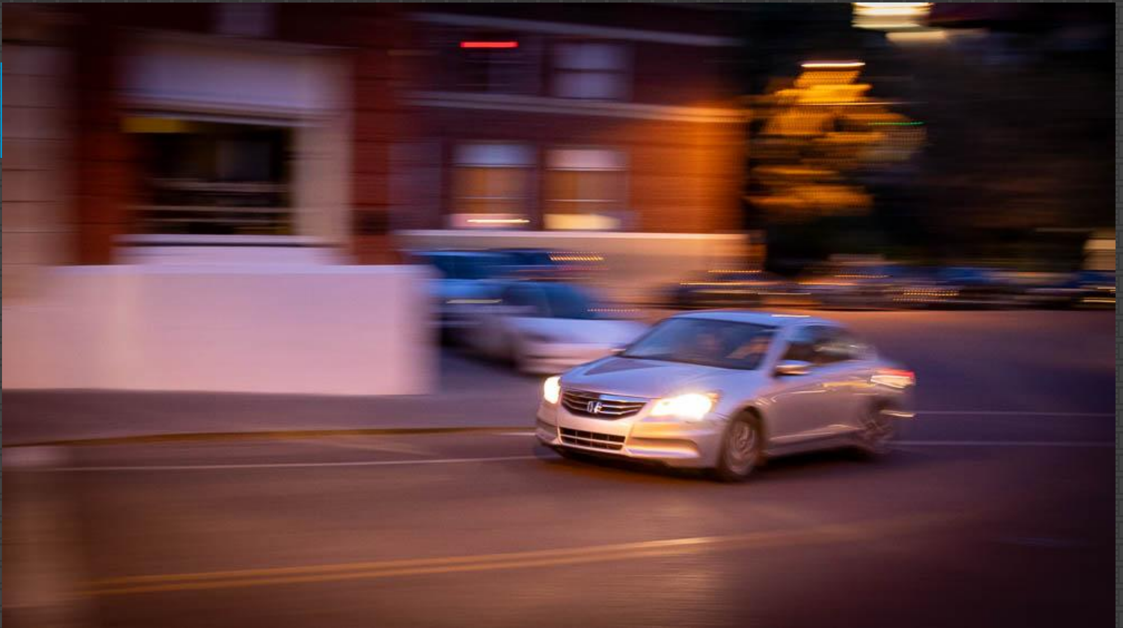
610a-Bart Quimby – Driving Through Old Town Bisbee