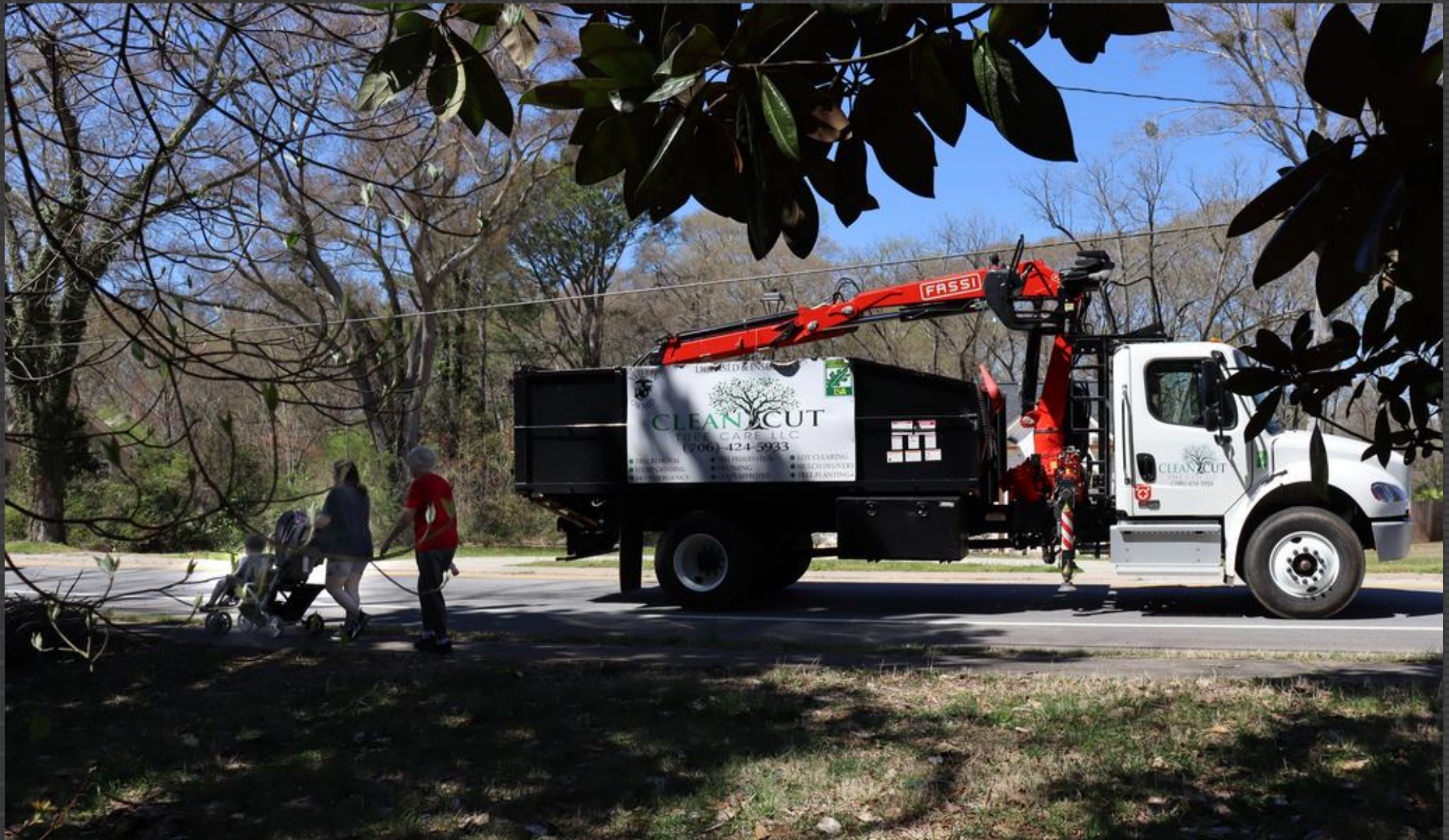
607a-Carol Renfro - Clean Cut truck, people walking