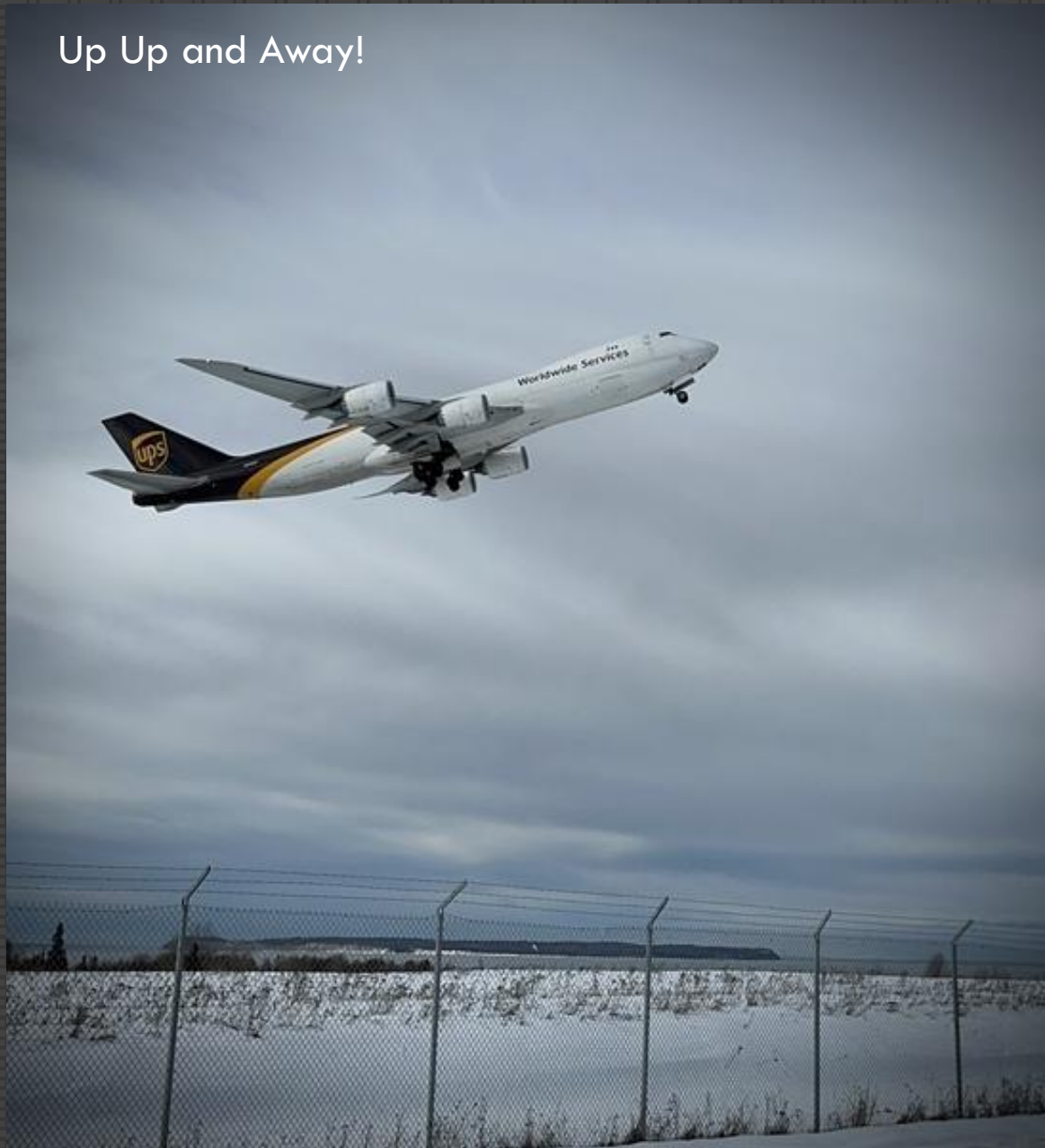
Up Up and Away!