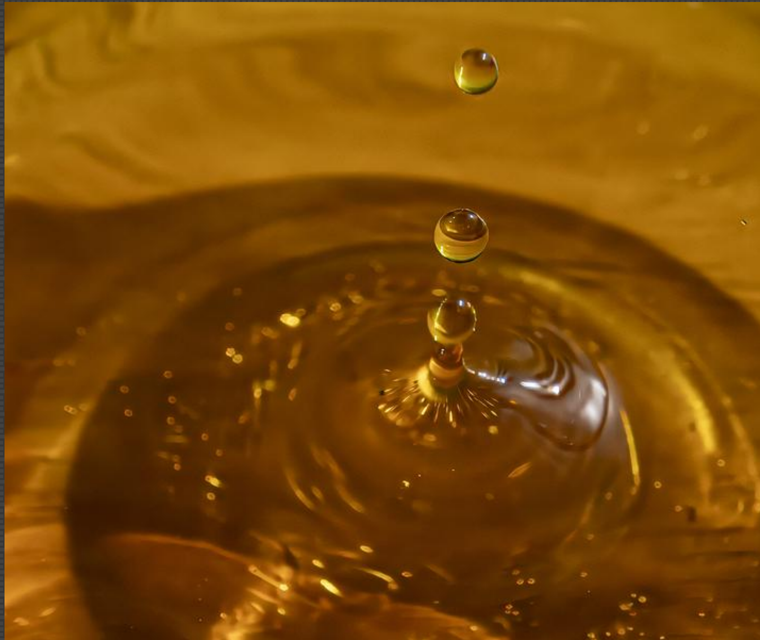
653-Bill Cole - Water Drops