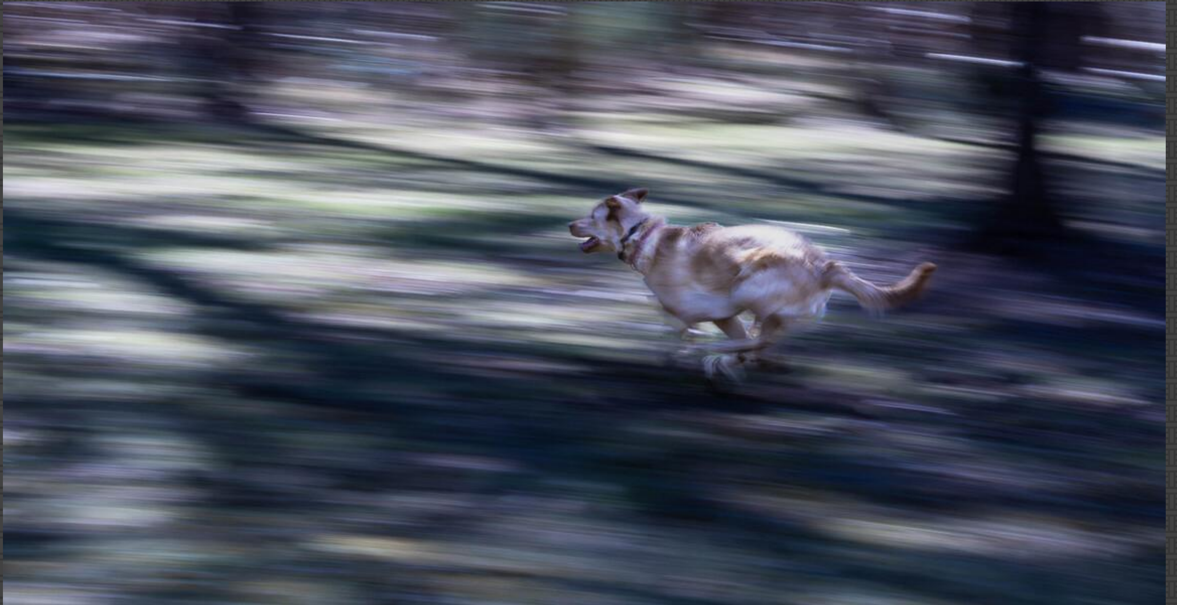
603b-Karen Cole-Loy - Happy dog