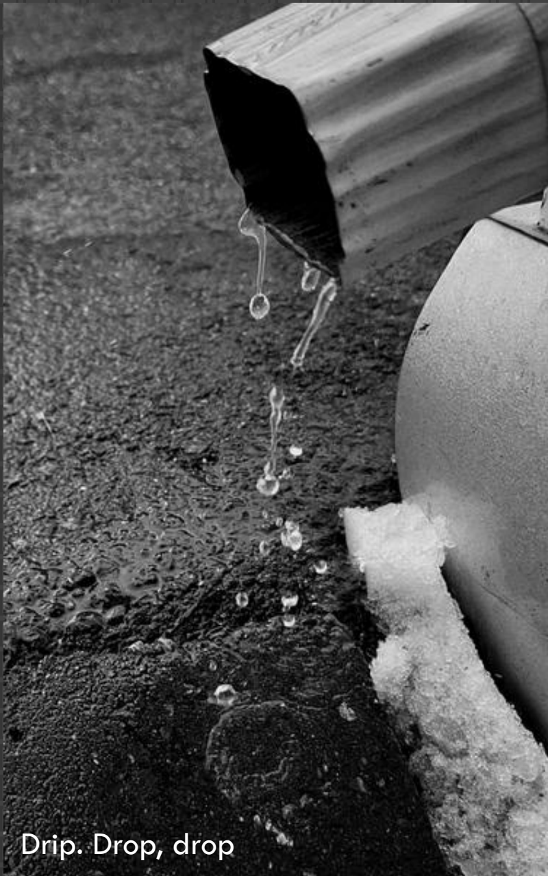
Drip. Drop, drop