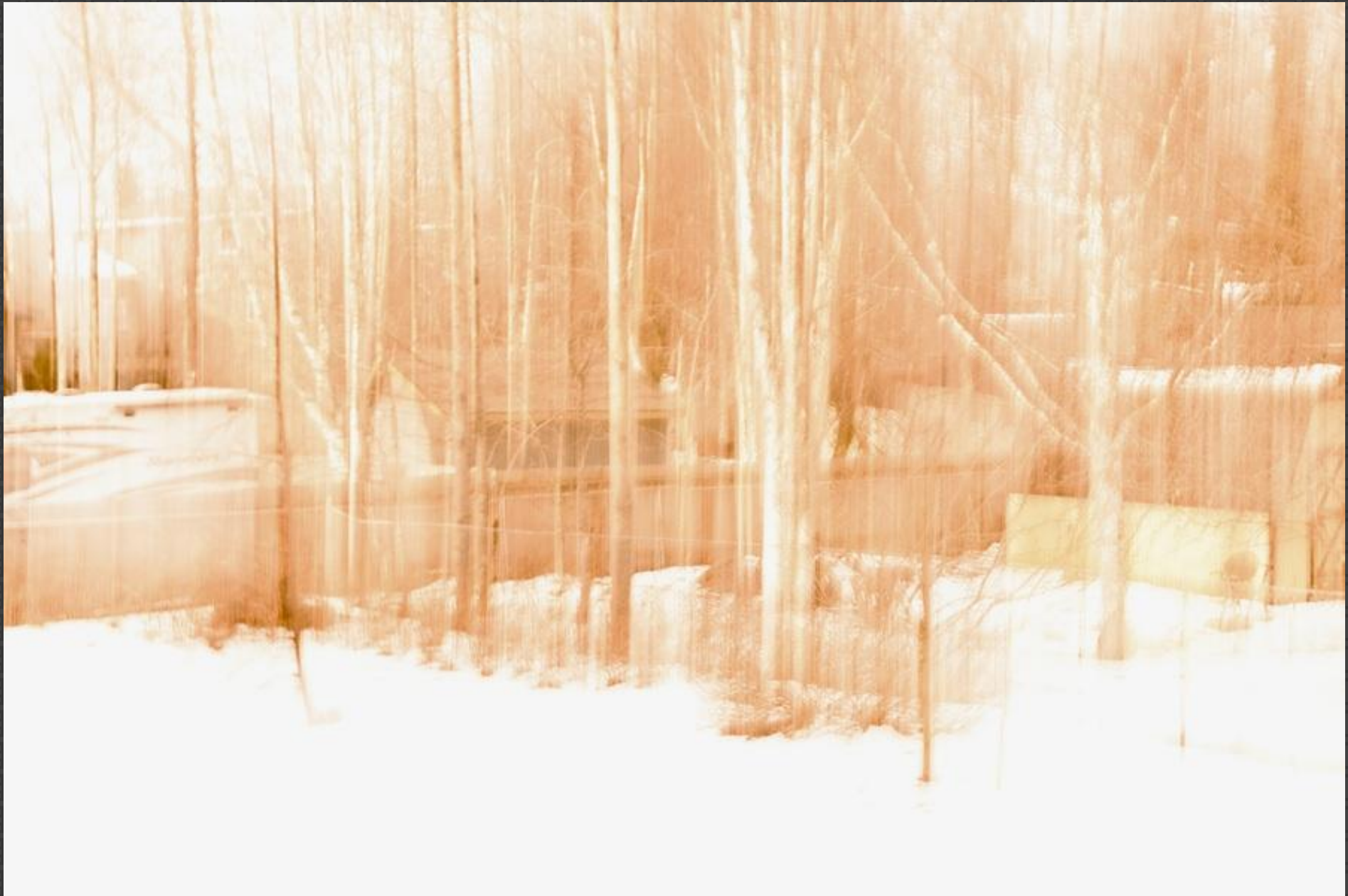
602a-marty lyman - backyard