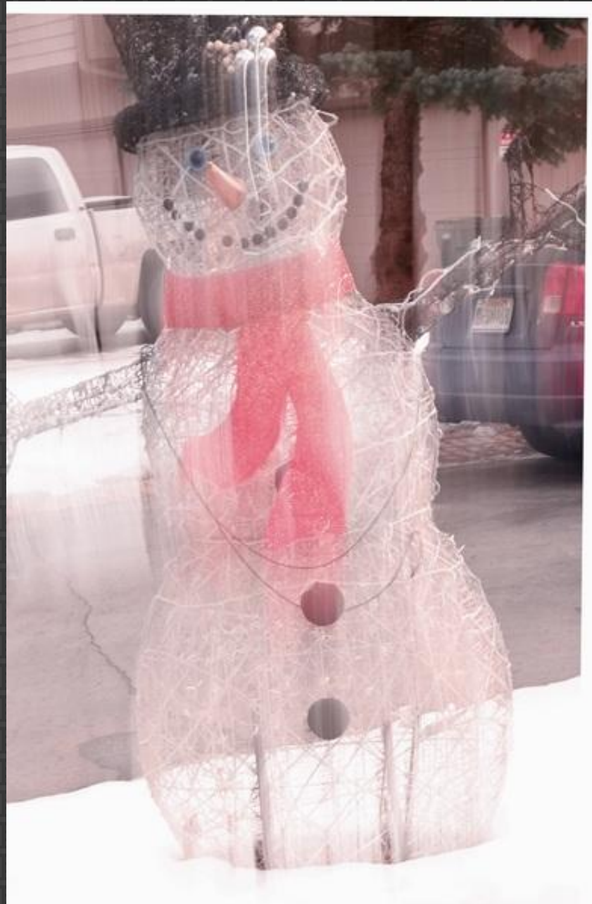
602b-marty lyman - snowman