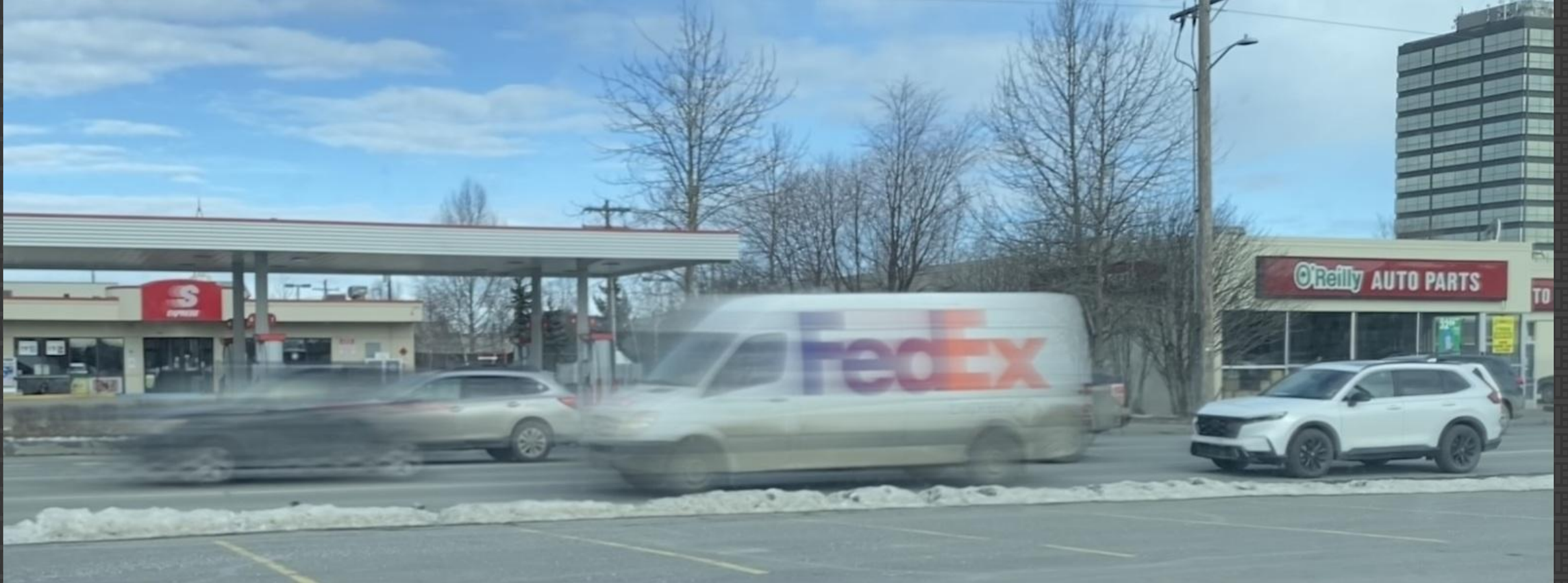
603b-Shirley - Traffic!