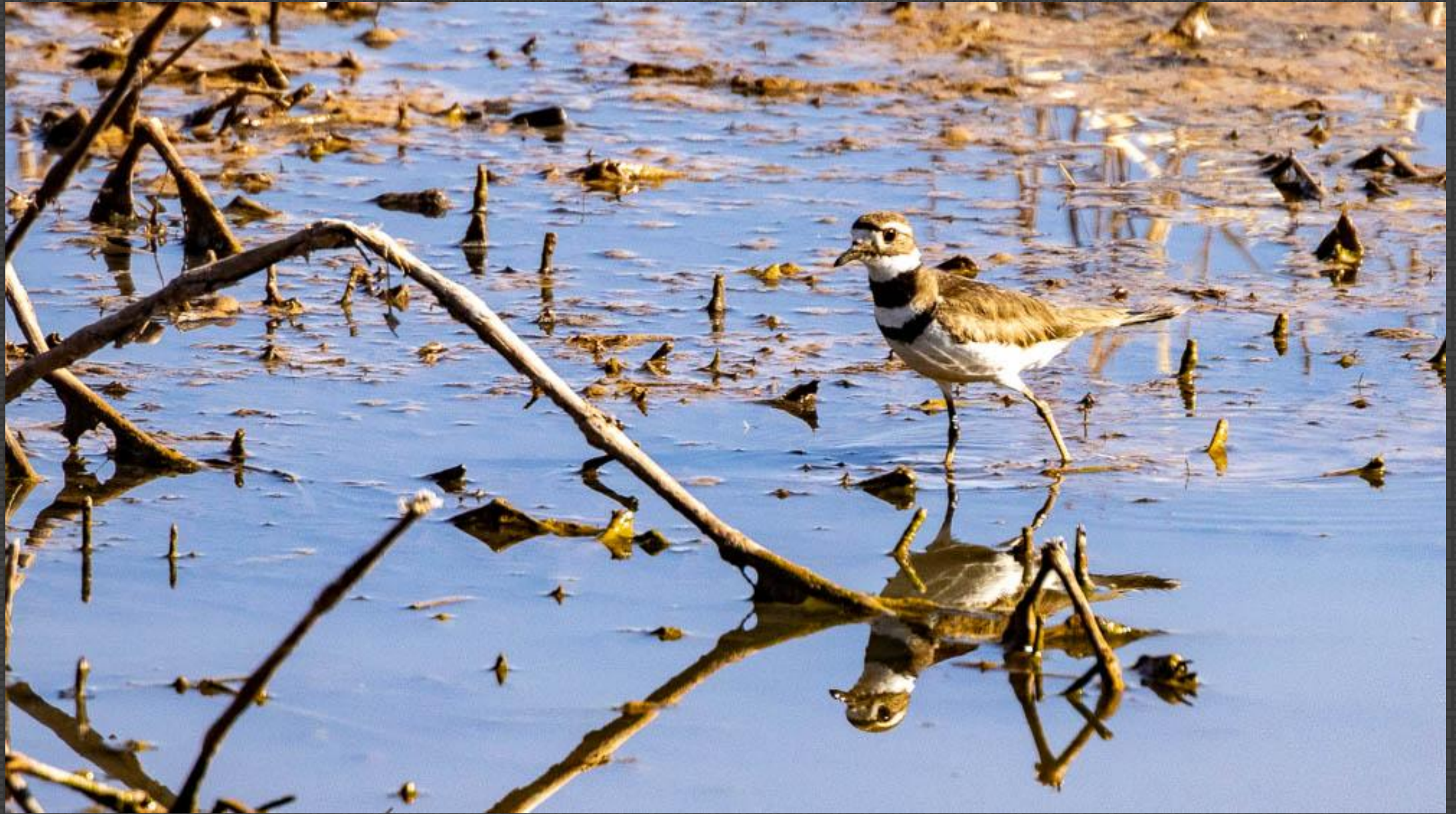
13610b-Bart Quimby – Foraging Killdeer