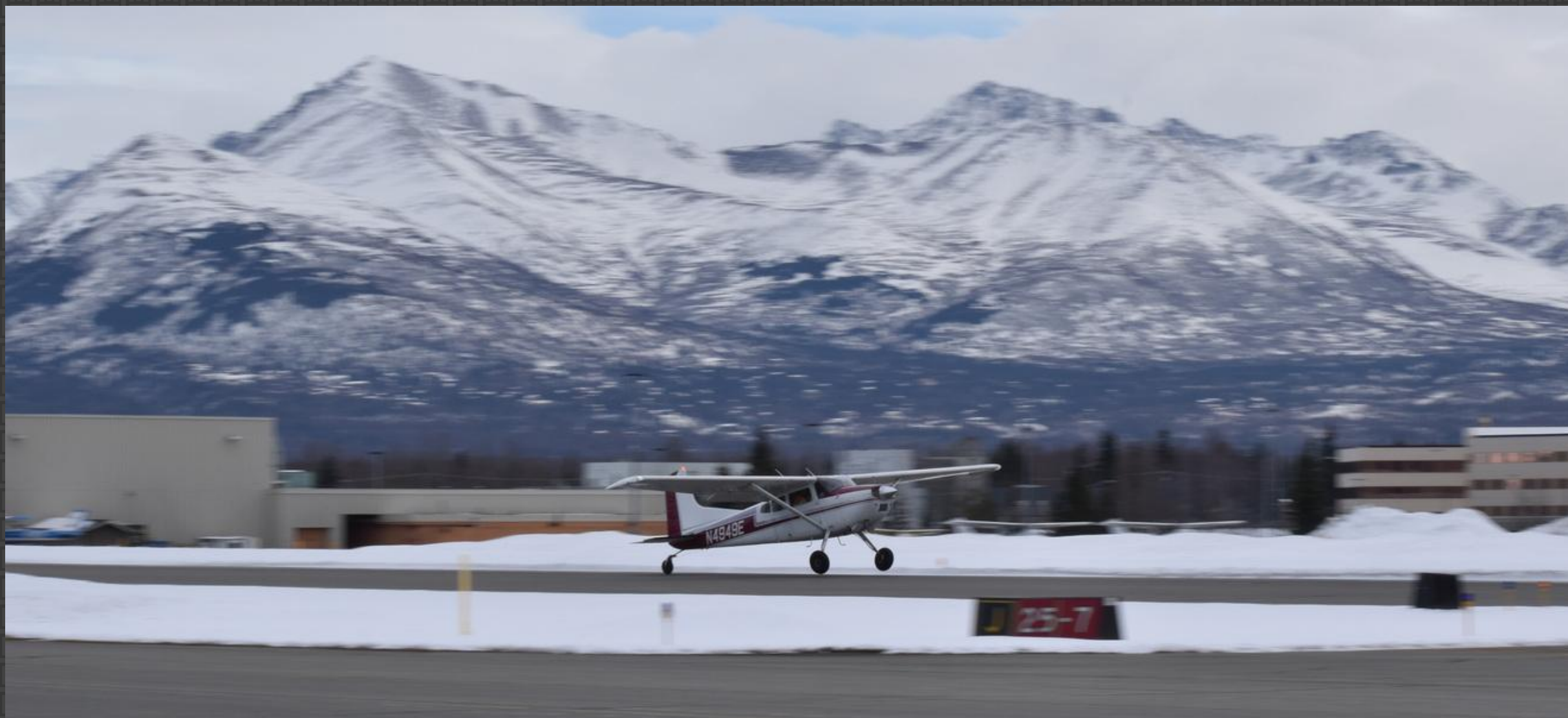
601a-James Somerville - landing