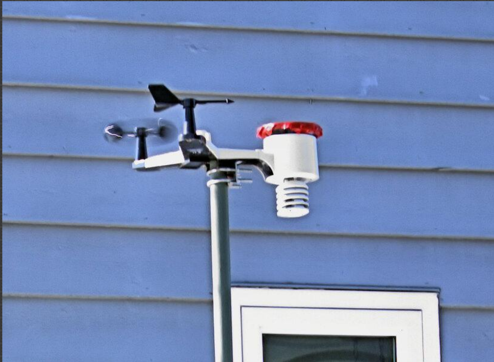
605a-Bob Estey - breeze