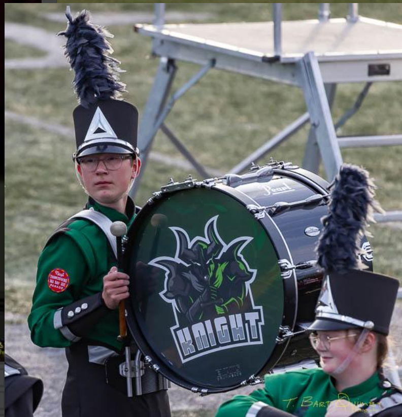
People Wearing Green