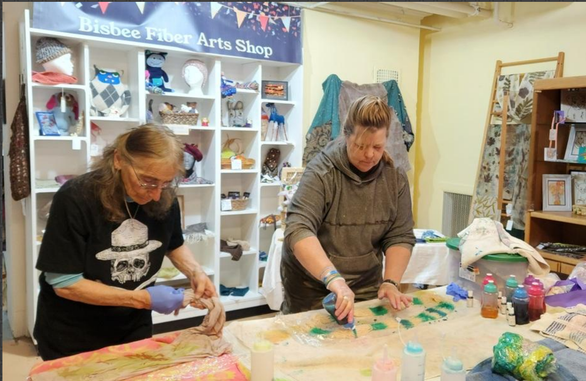
606b-Sandra A Quimby - Dying - Painted Warp