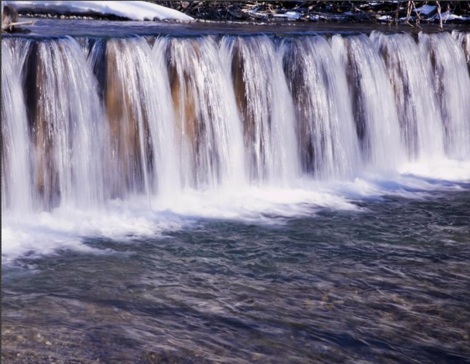
652a-Janine Forrest - Water Over The Falls