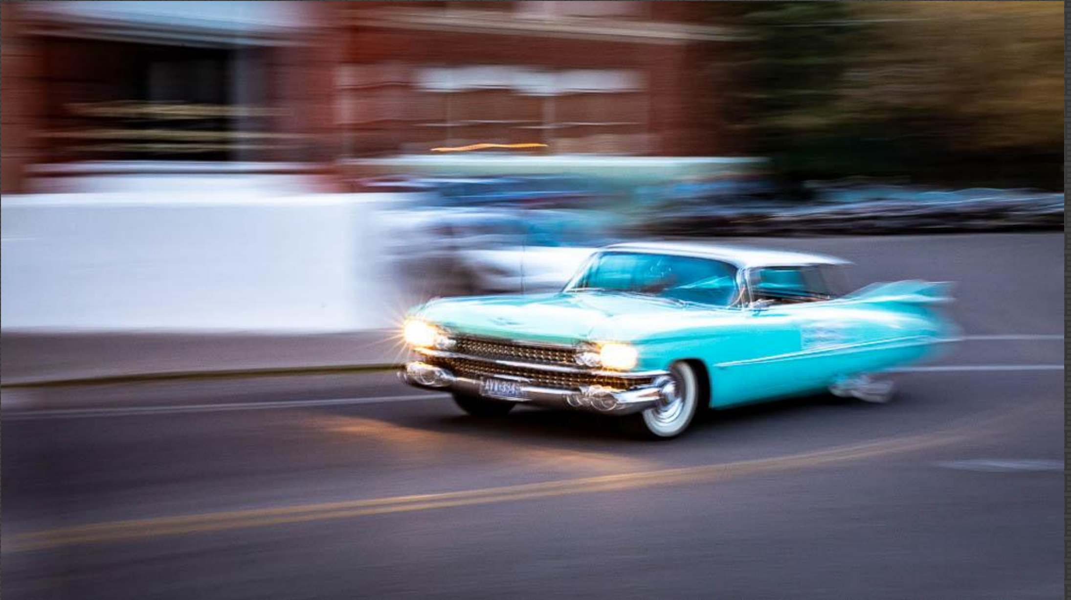
13610a-Bart Quimby – Driving through Old Town Bisbee