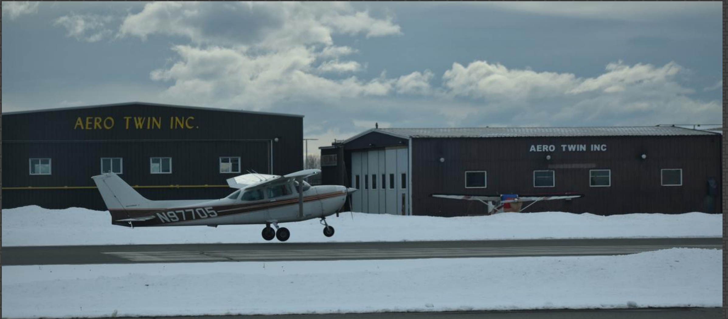
601b-James Somerville - touchdown