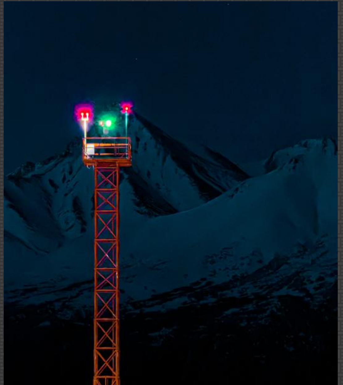
608-Charles Iliff - 2025 Palmer Rotating Airport Beacon