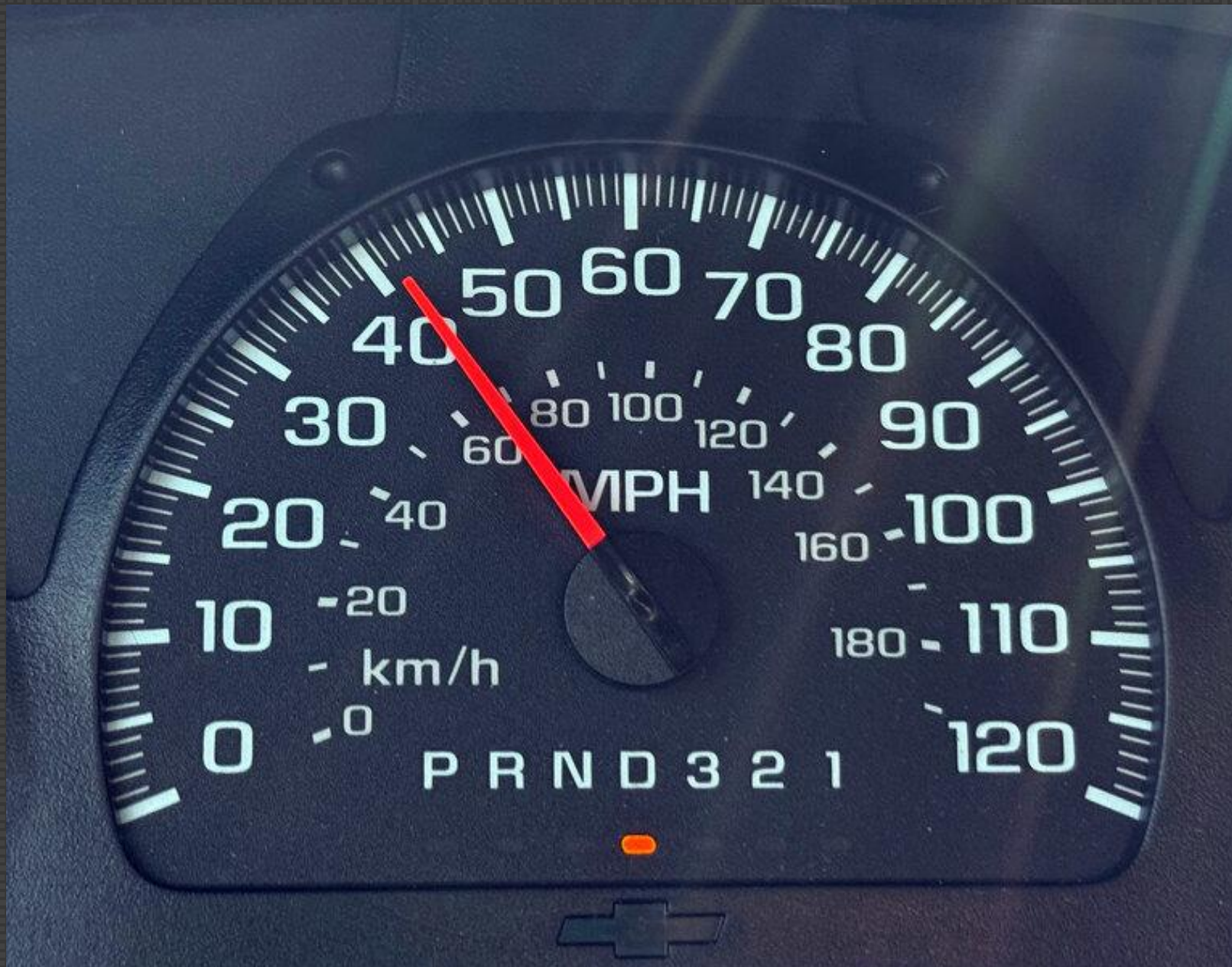
605b-Bob Estey - not racing