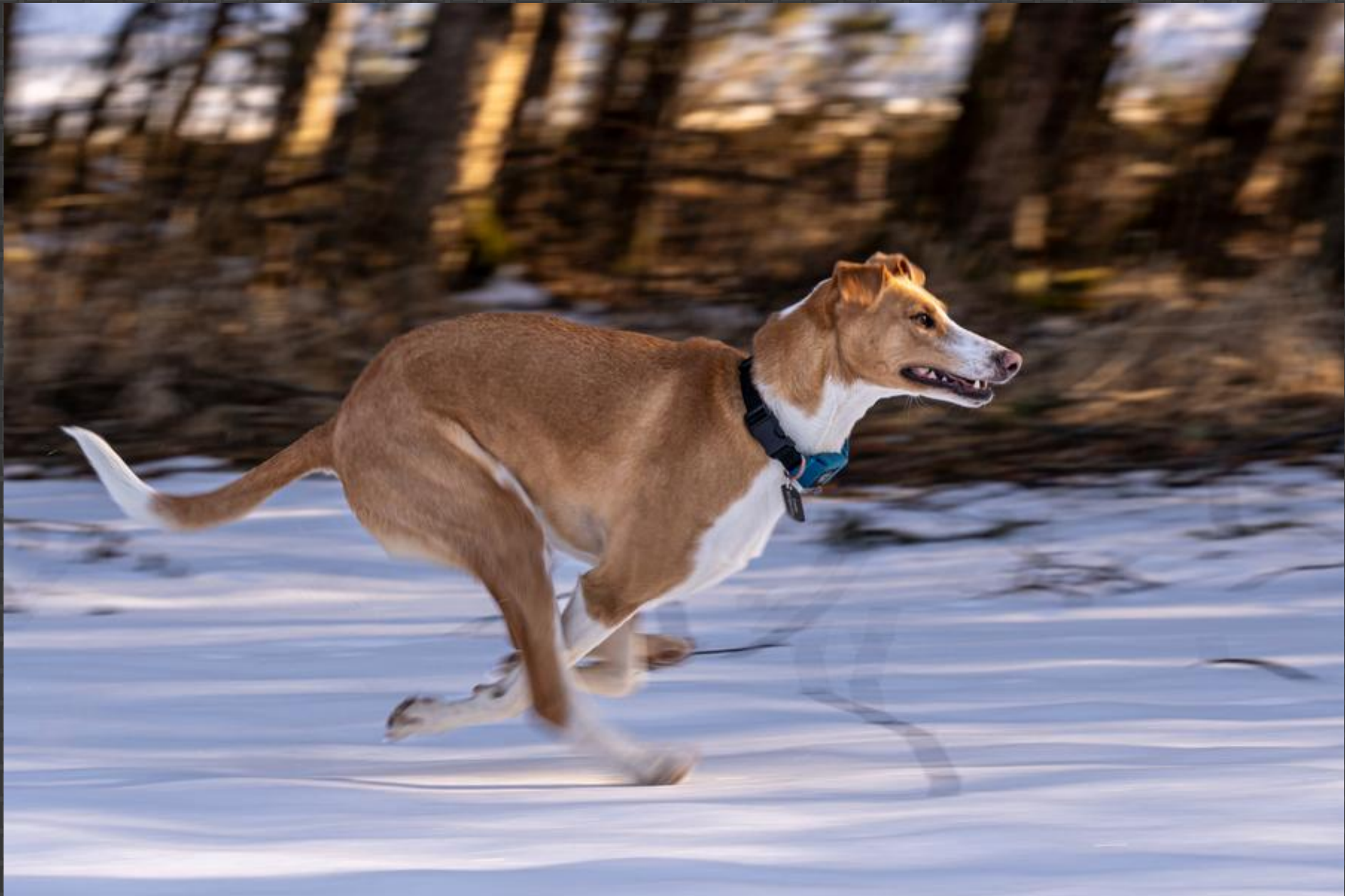
607a-James Cantor - Fast Movement