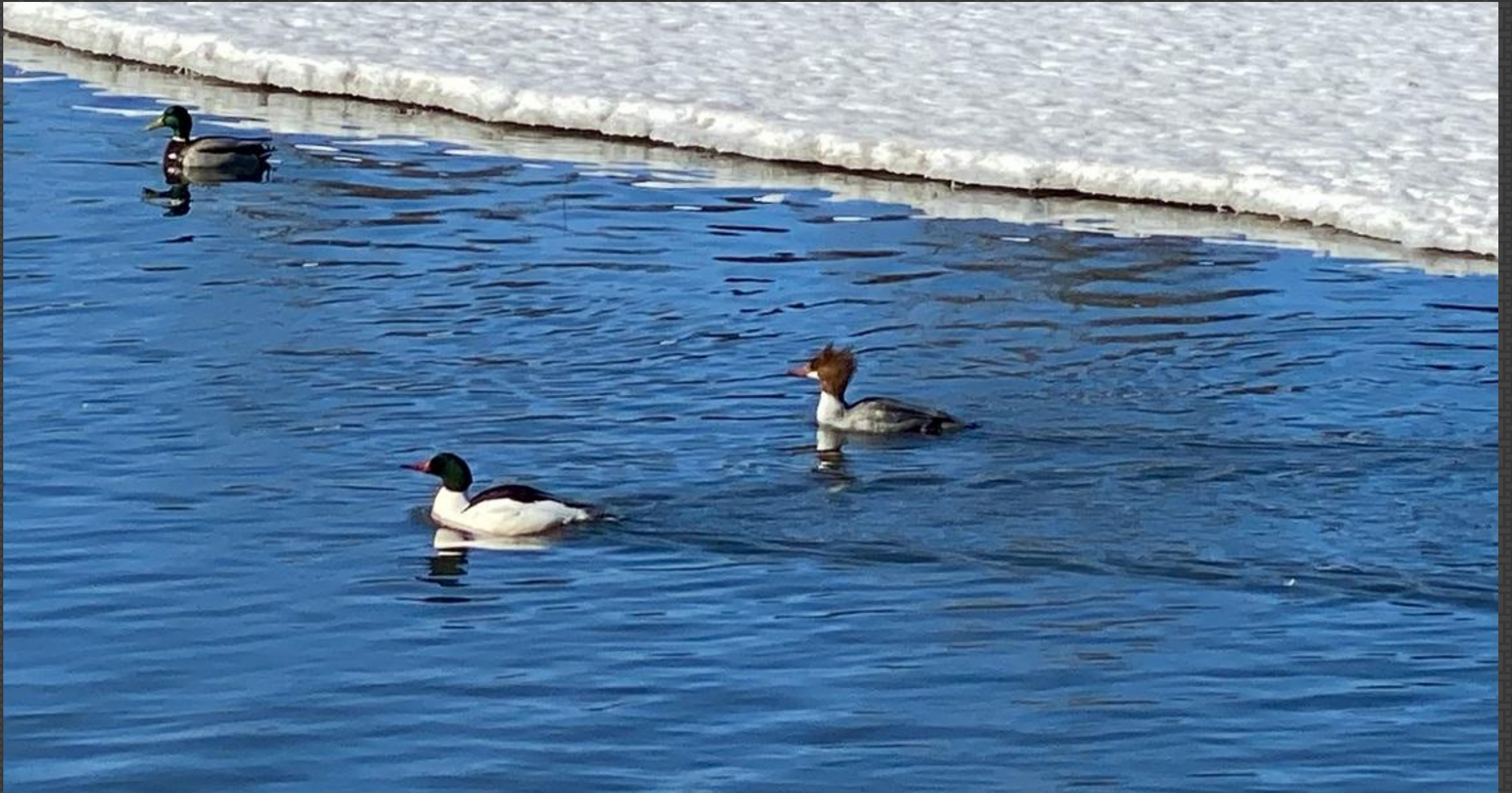
651α-Shirley - Swimming with Friends