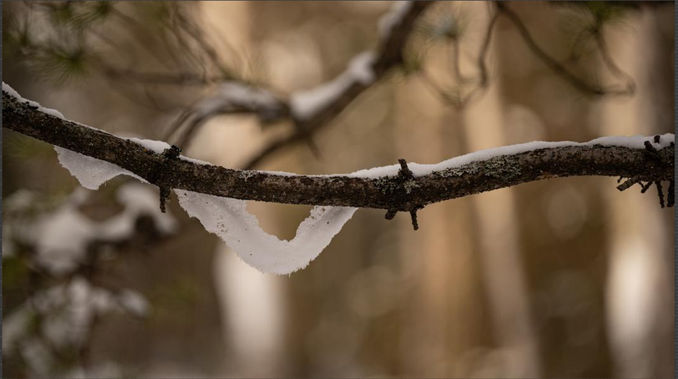
607b-James Cantor - Slow Movement