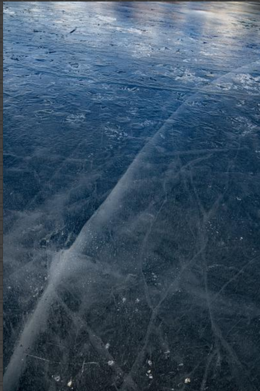
557-Bill Cole – Ice Crack