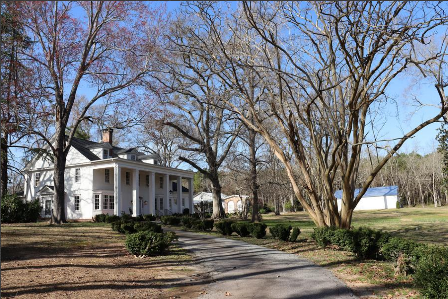
551-Carol Renfro – Yow Vandiver house and grounds