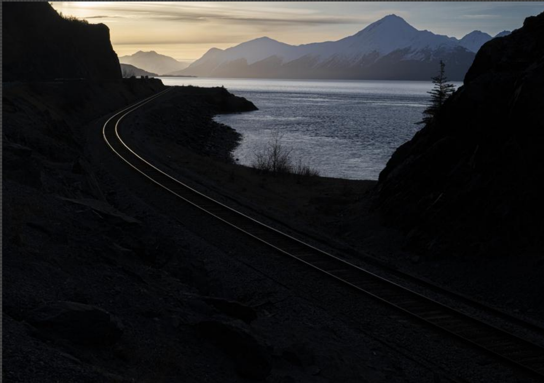
508b-Bill Cole – Rail Line to Sunrise