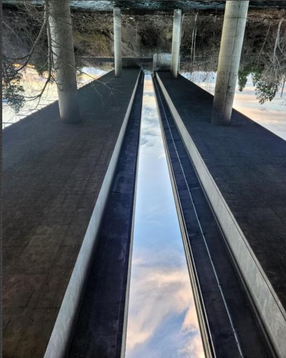
555-Stefanie Coppock – right side