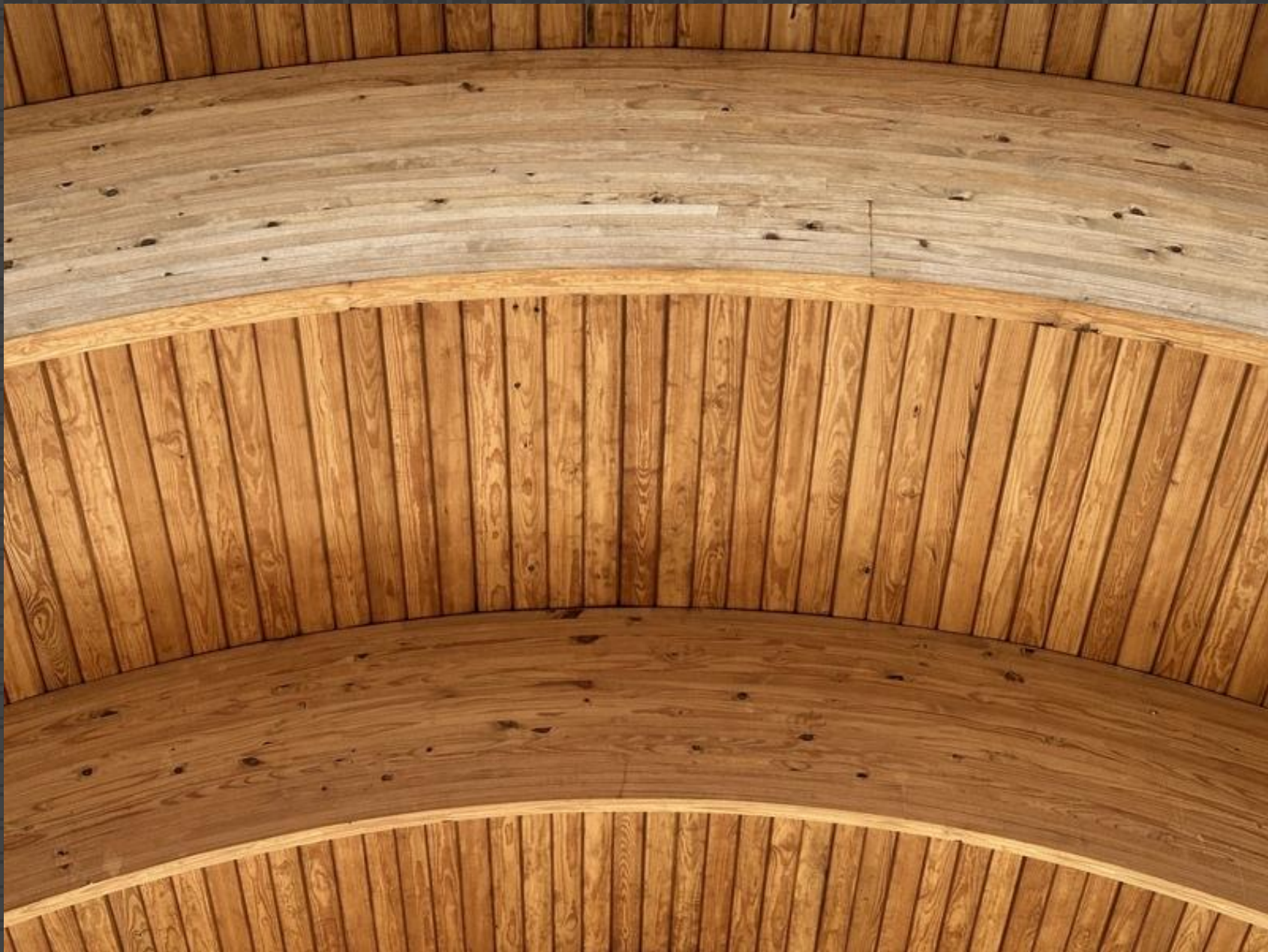
509a-Paula Saindon – Look up!