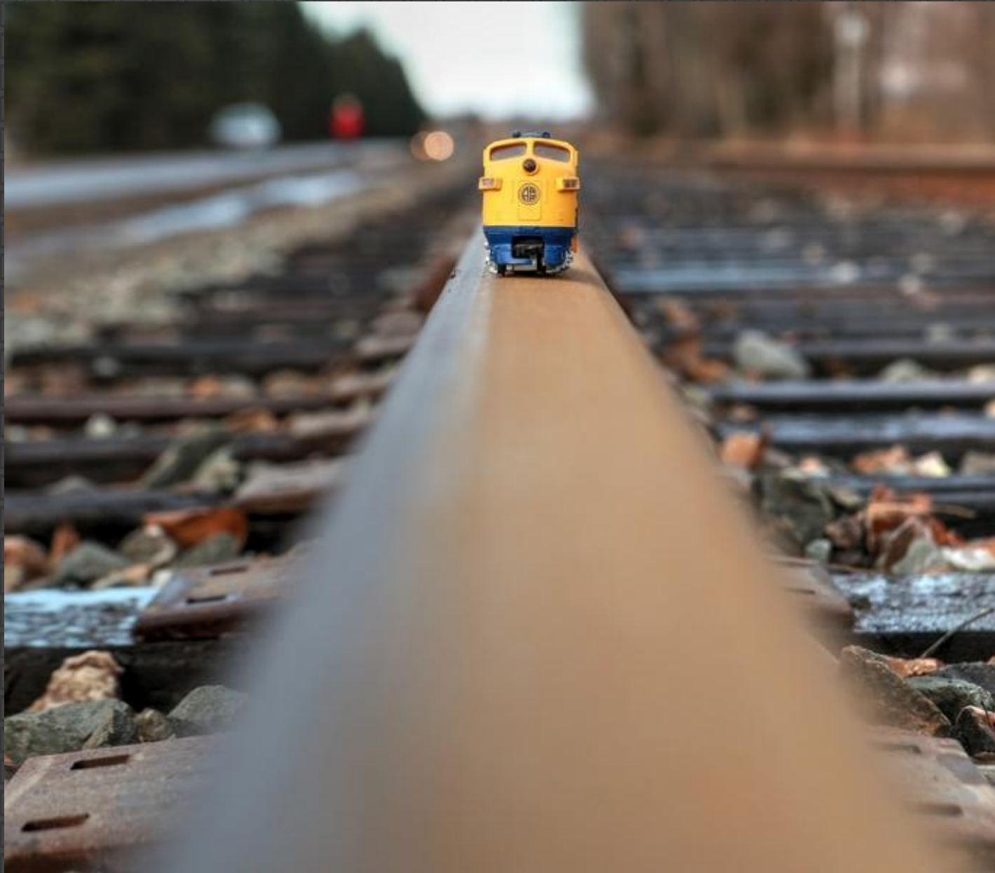
506b-Stefanie Coppock – train