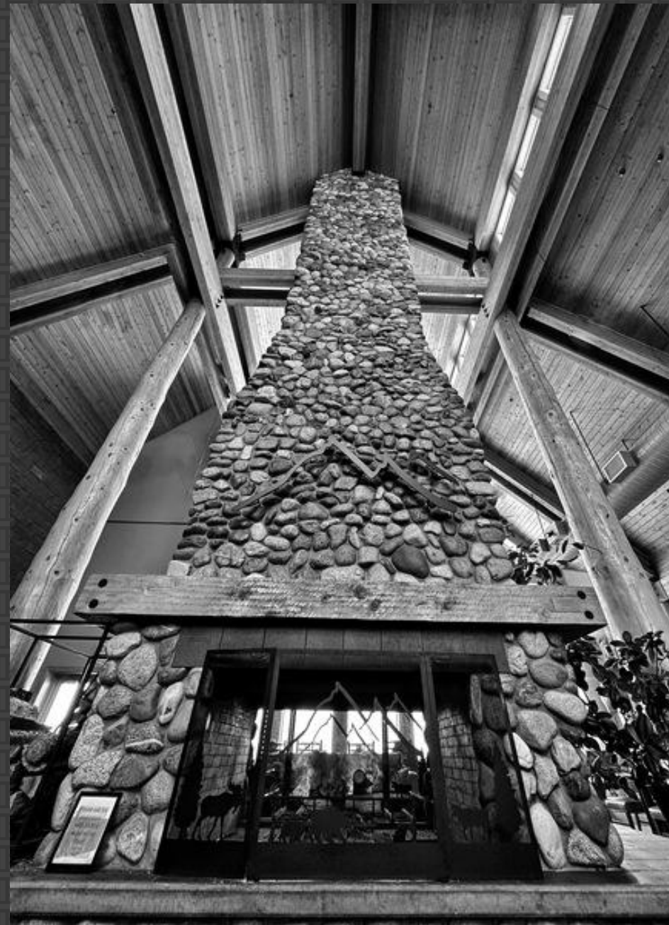
509a-Paula Saindon – Grand Fireplace