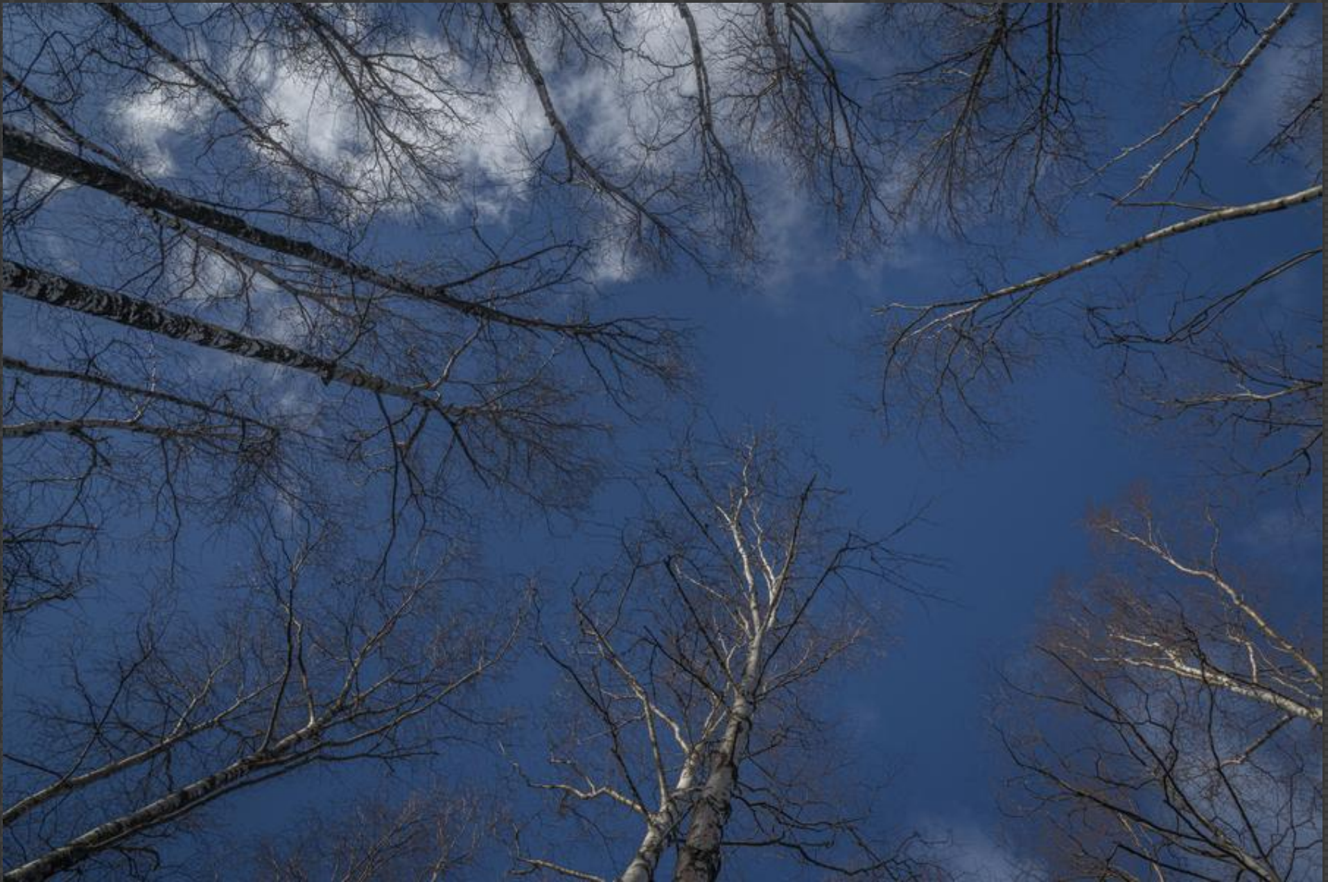
508a-Bill Cole – Birch Trees and Sky