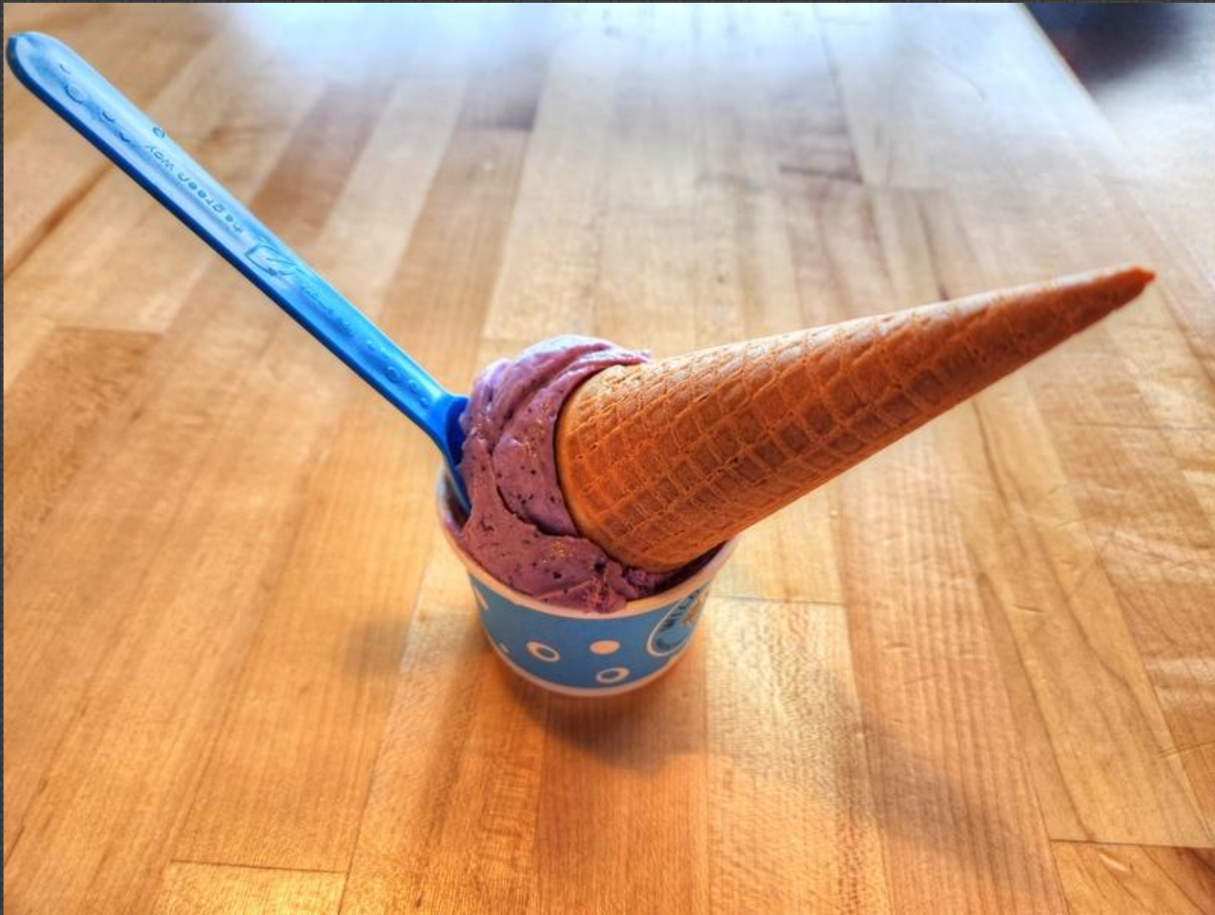
506a-Stefanie Coppock – cone