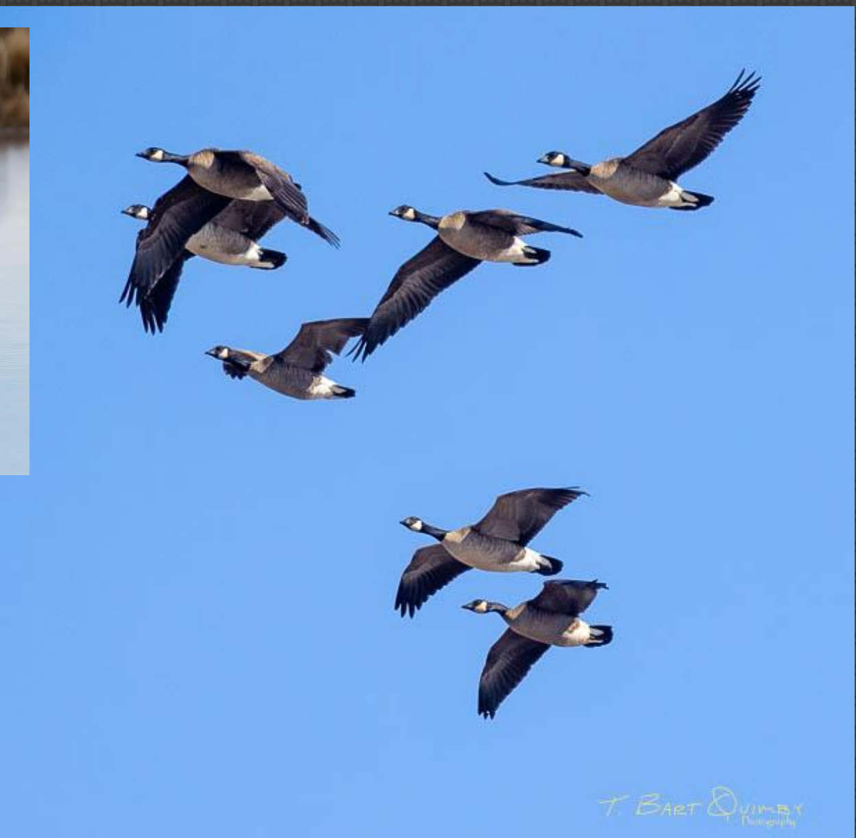
Motion in Nature