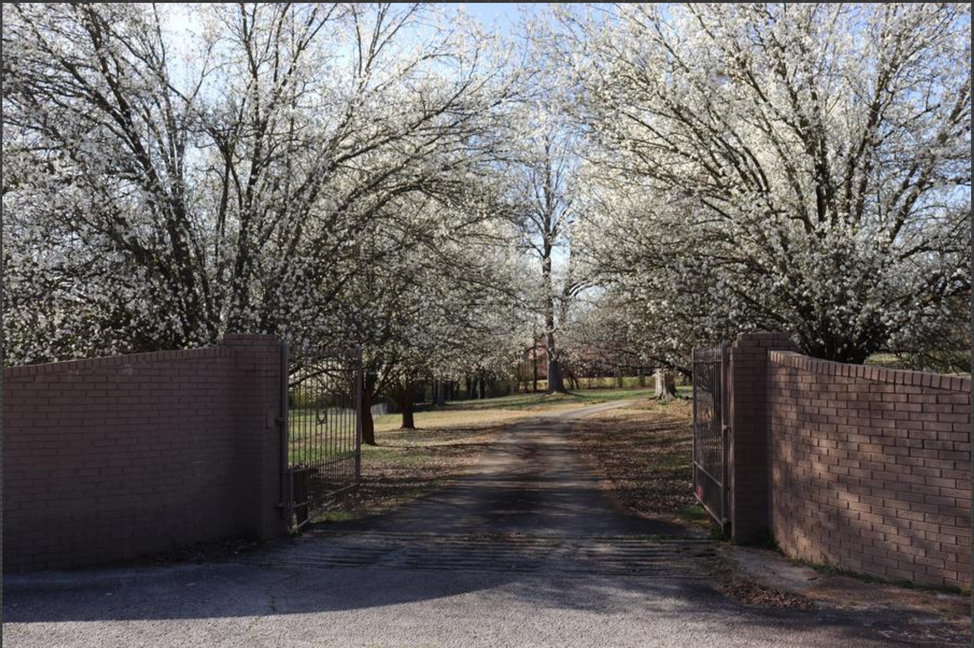
501 a-Carol Renfro – Bartlett pears with white blossoms