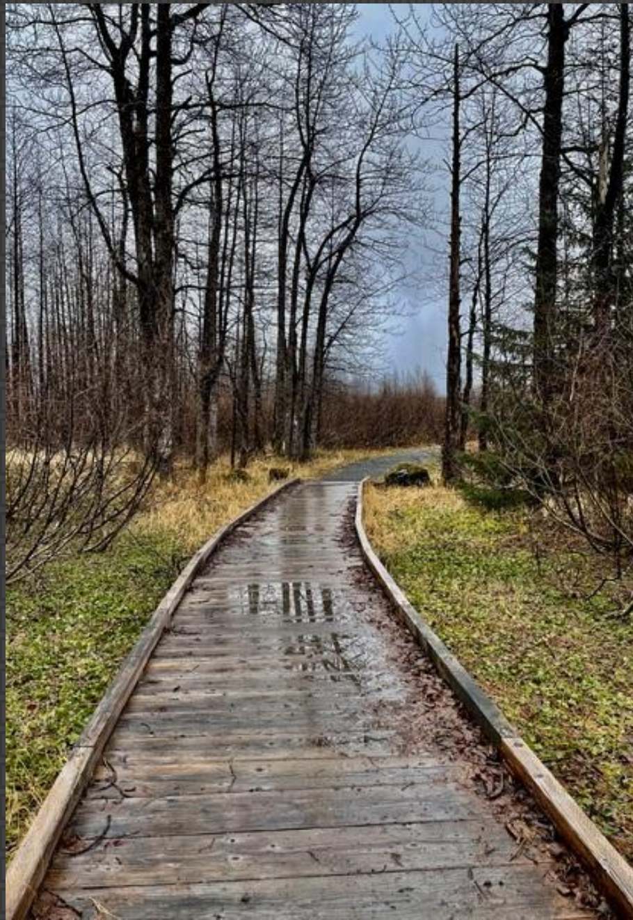
502a-Susan Barrickman – The Trail Beckons