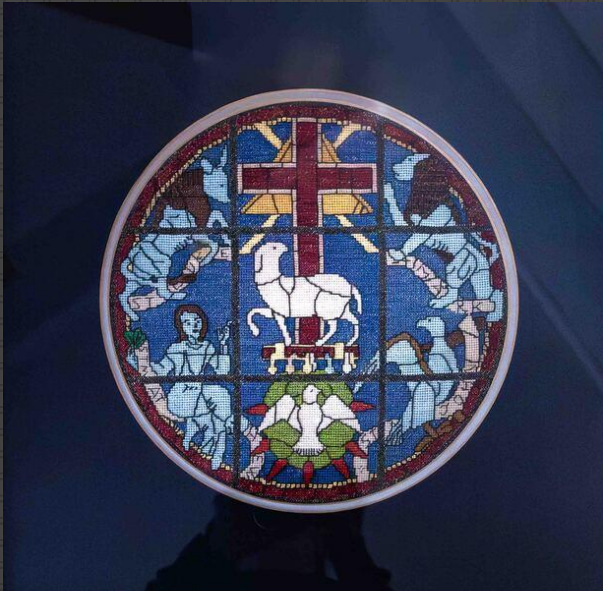
554-Karen Cole-Loy – Stained glass window at Front Street Church Mama's crosstich, Burlington NC