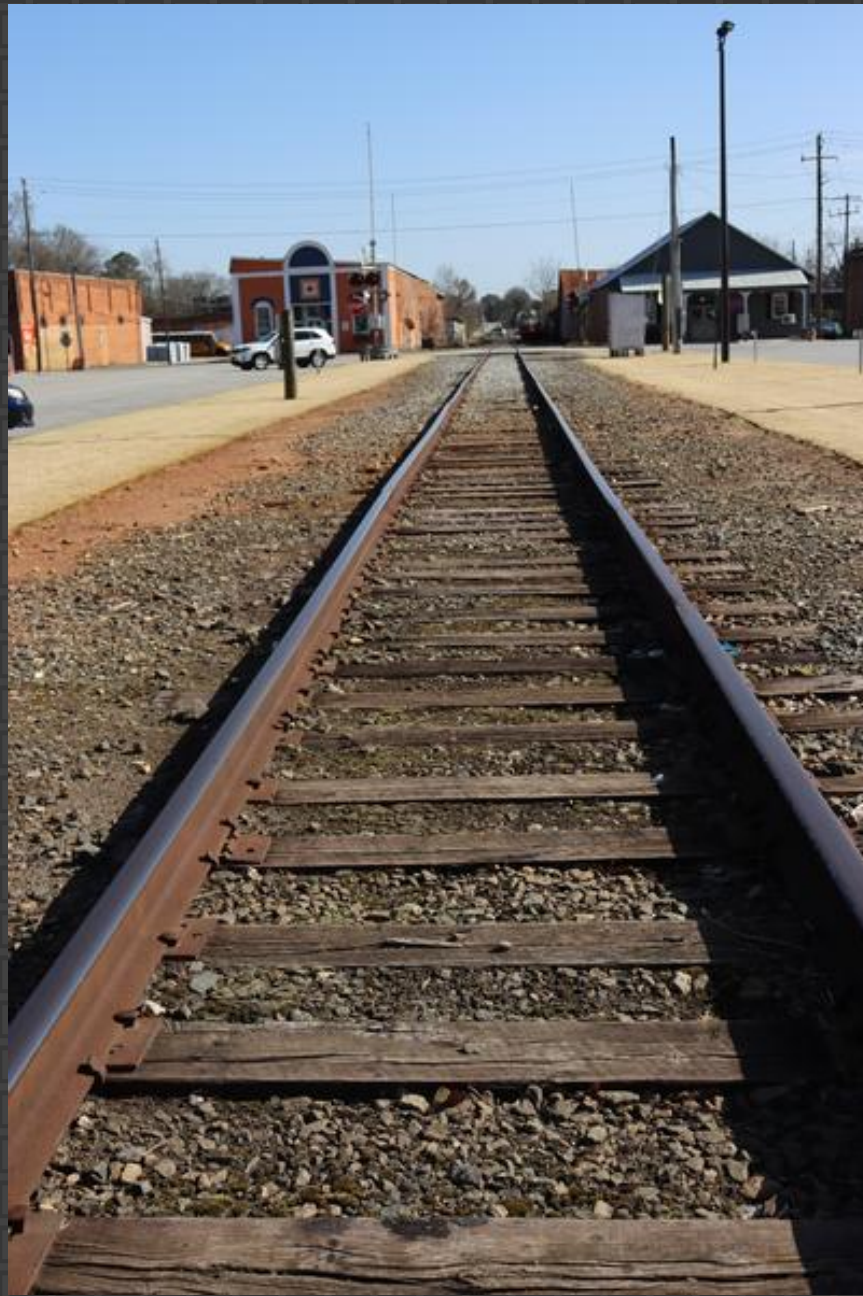
501b-Carol Renfro – Railroad running through Lavonia