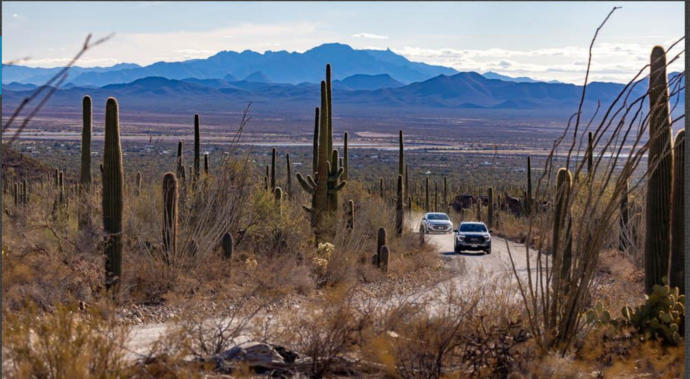
511 a-Bart Quimby – Through the Desert