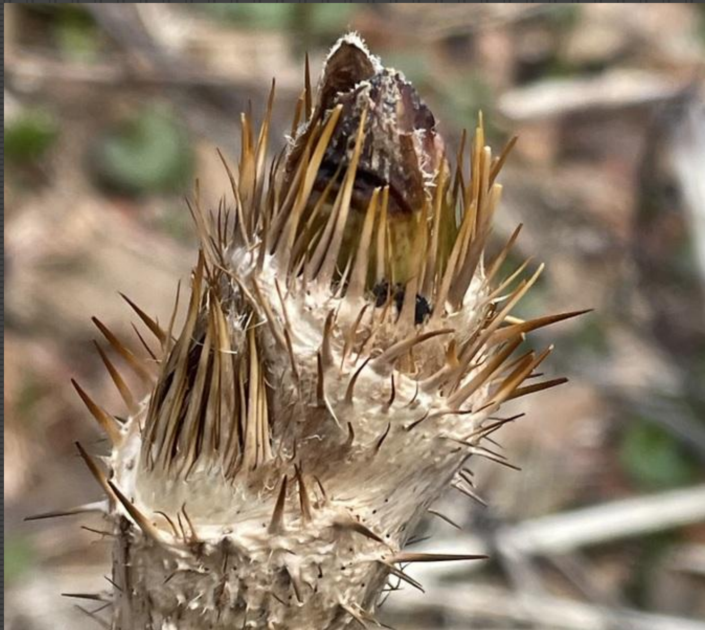
311b-Elly Scott – Bird Ridge Devil