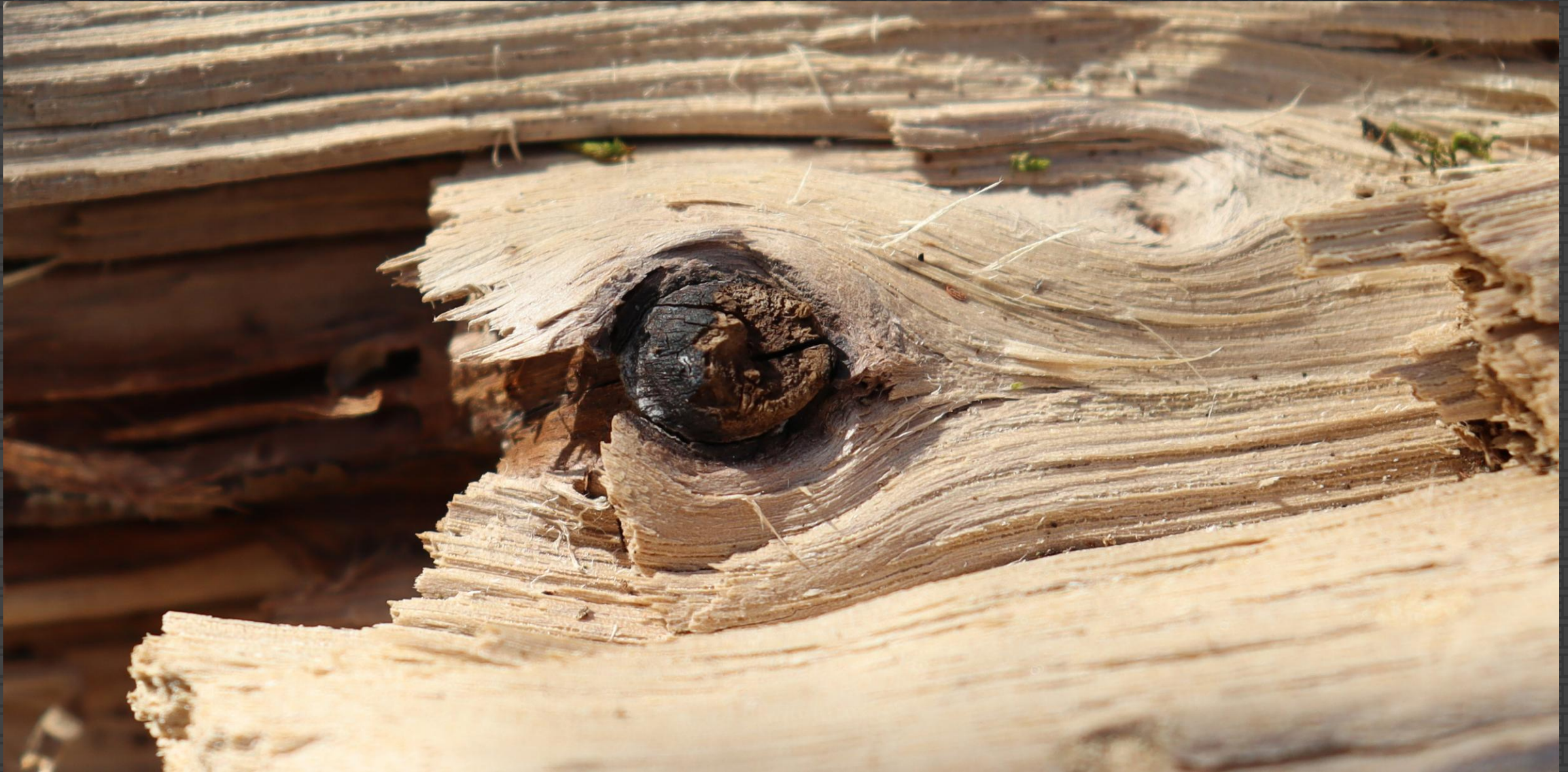
307b-Carol Renfro – Broken pecan limb with limb