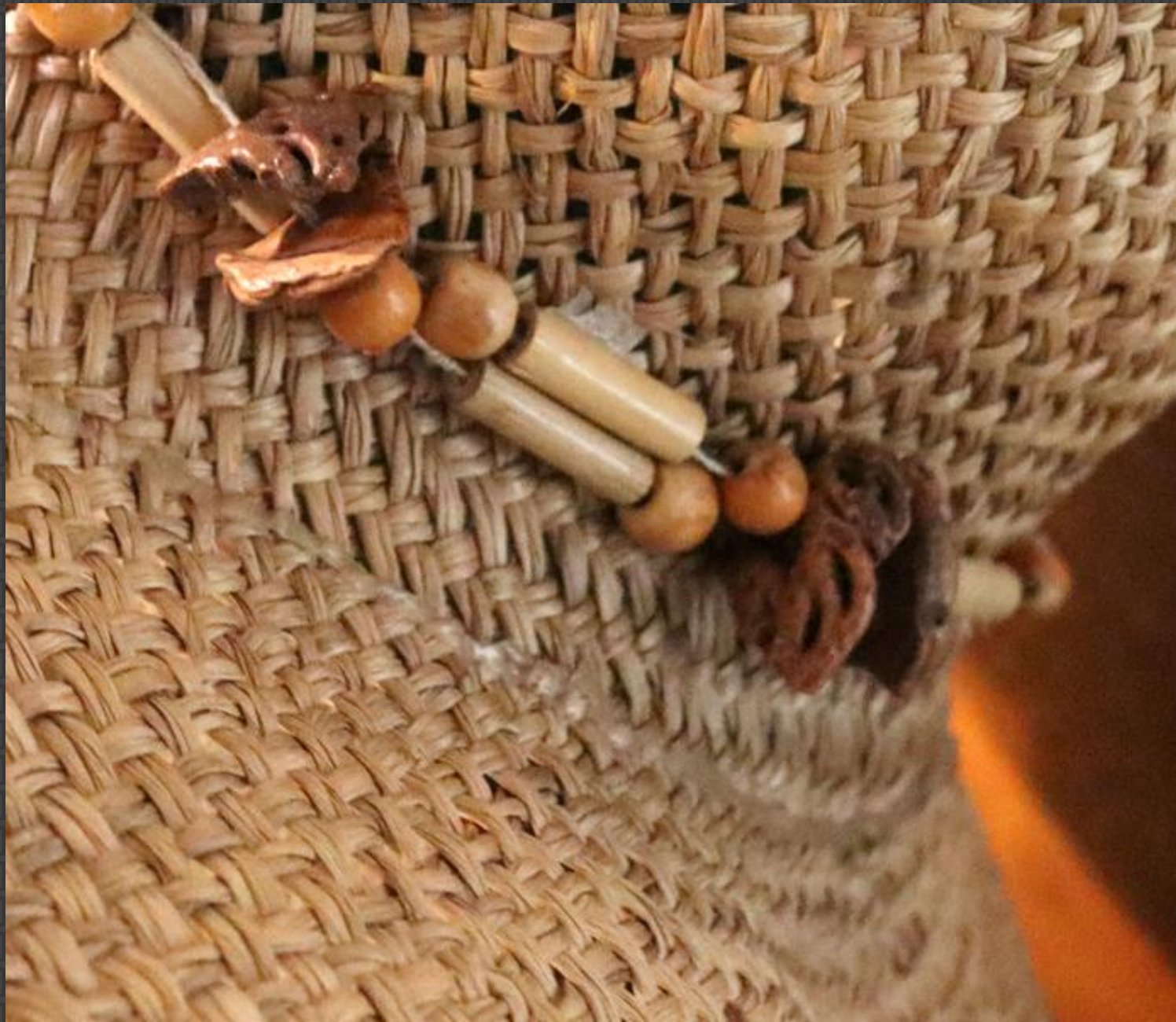
307a-Carol Renfro – Straw hat with beaded band