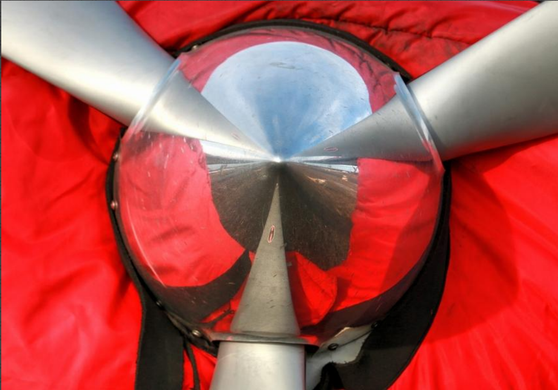
303a-Stefanie Coppock – spinner