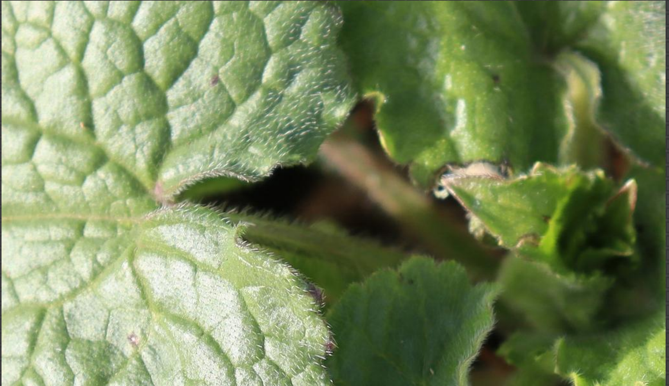
354a-Carol Renfro – New lunaria coming up