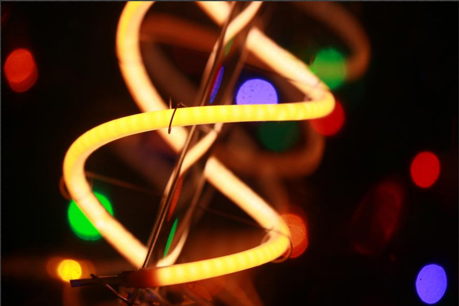
303b-Stefanie Coppock – twisted