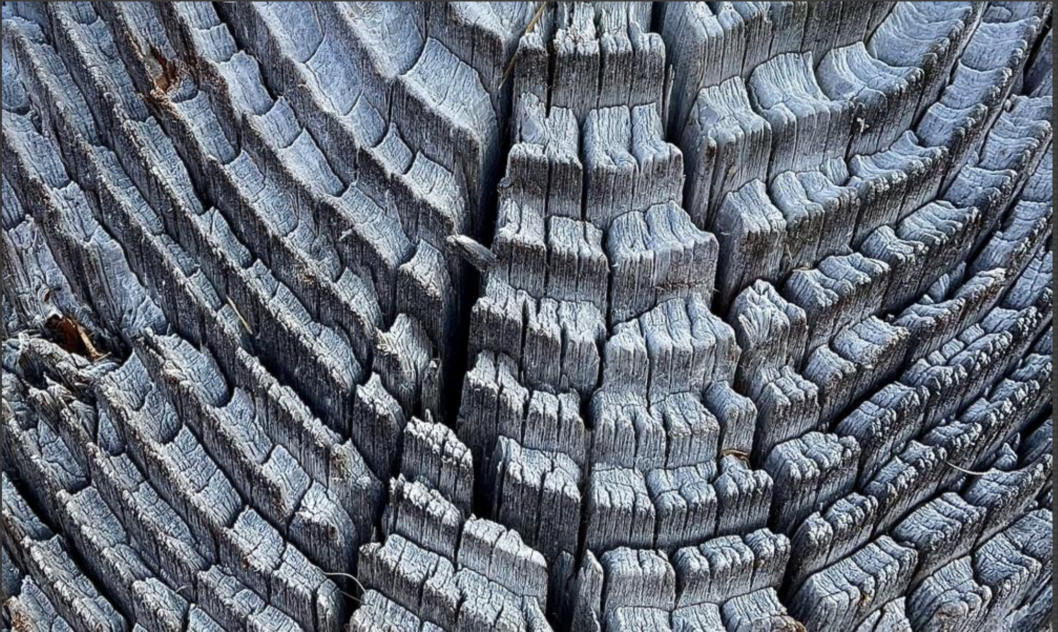
356a-Susan Barrickman – Weathered Tree Rings