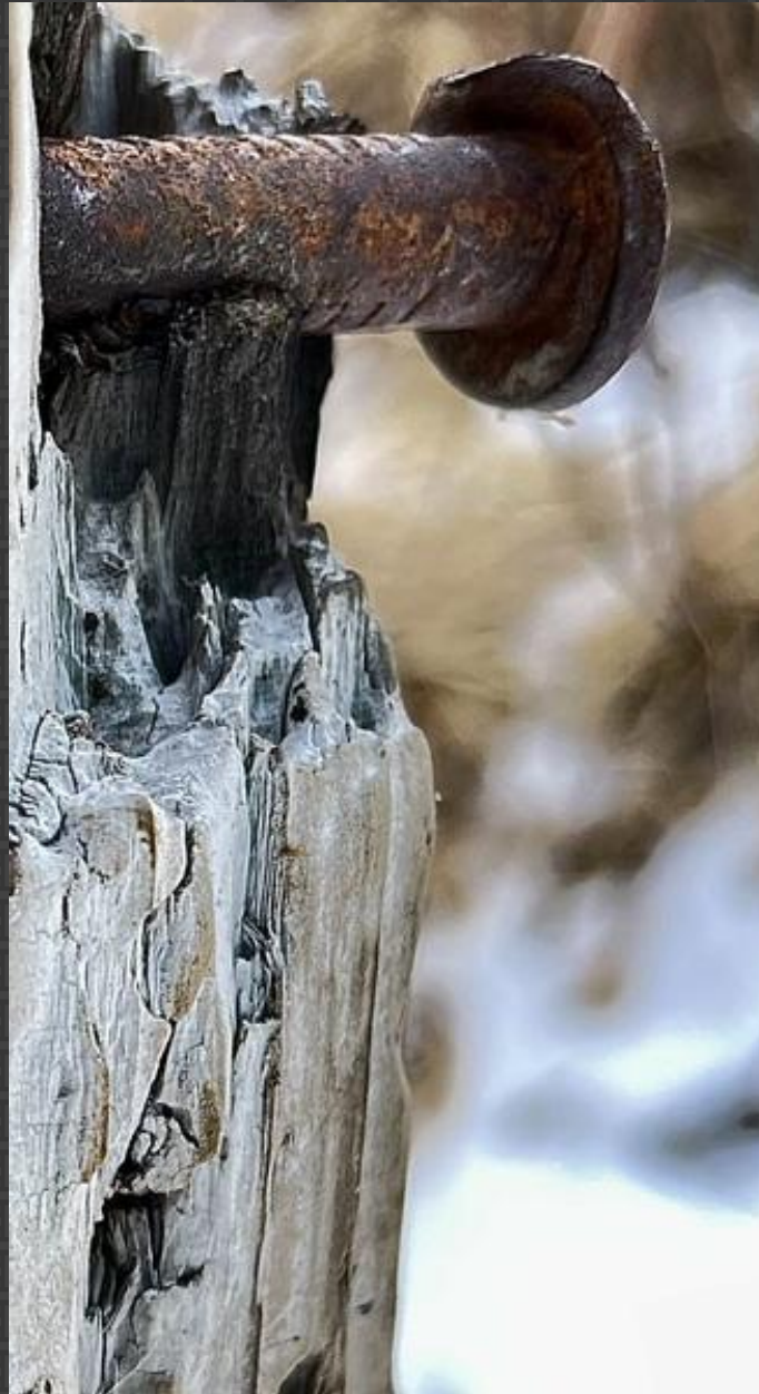
309b-Susan Barrickman – Signpost on the Trail