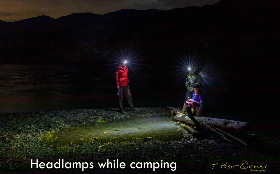
Headlamps while camping