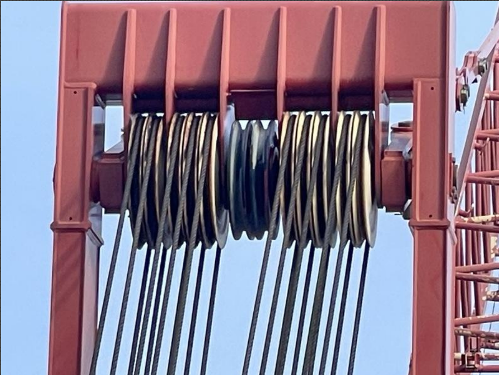
311a-Elly Scott – Bird Ridge Bridge Builder