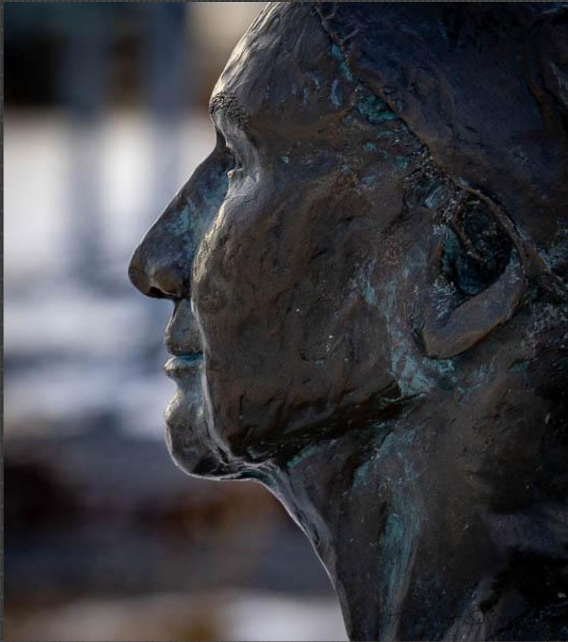
311a – Bart Quimby