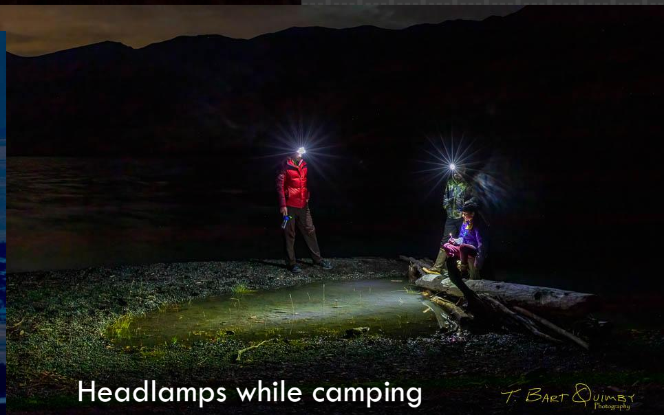
Headlamps while camping