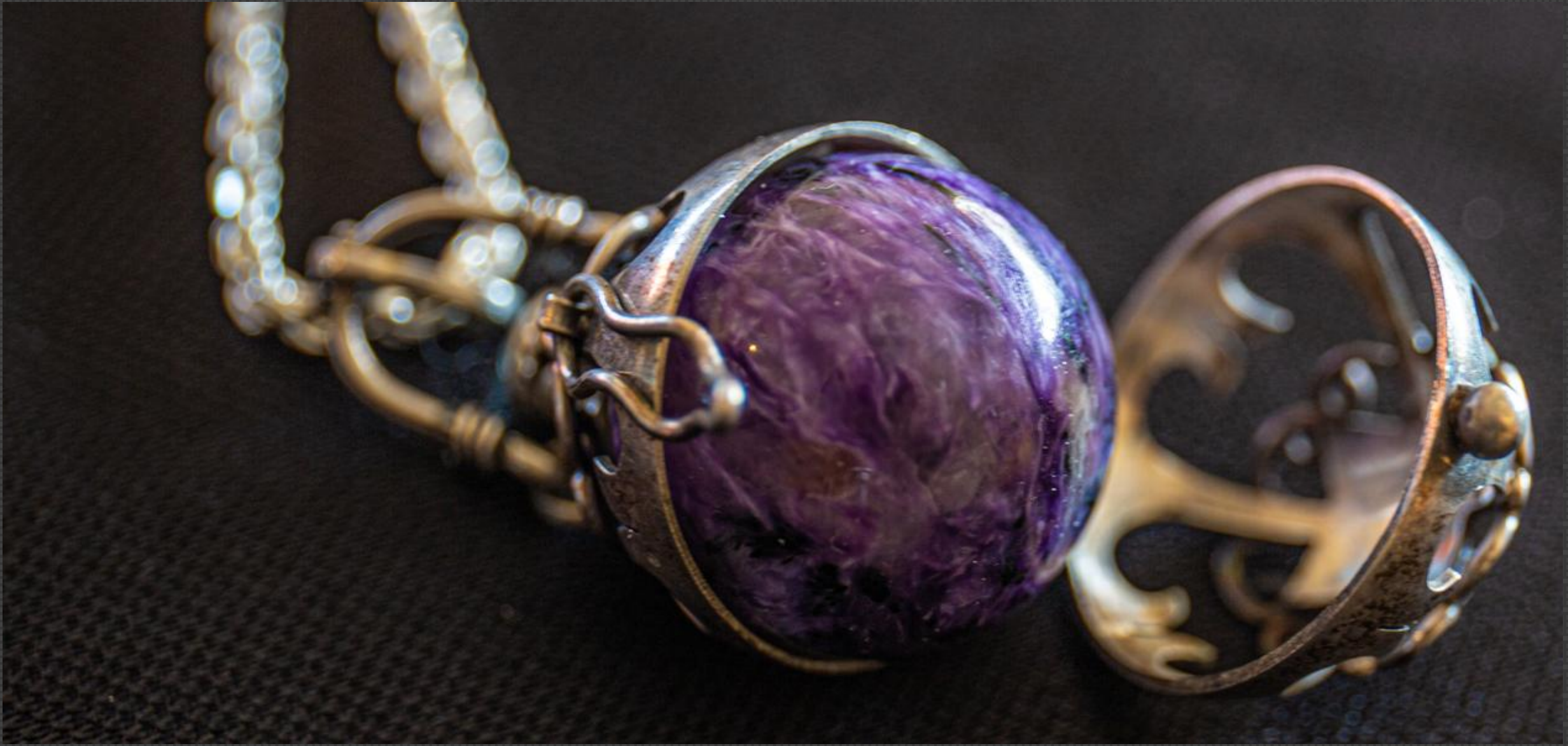
310a-Charles Iliff – Charoite