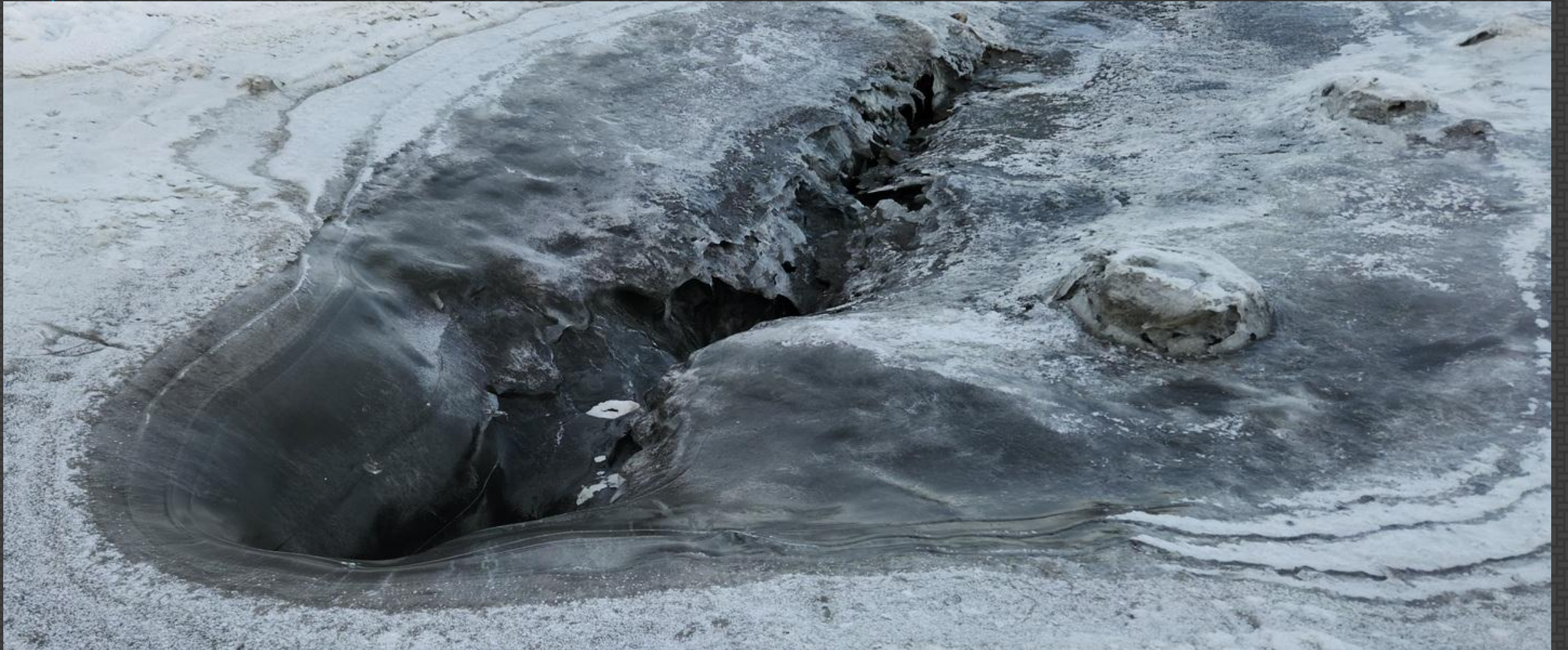
351-Sandy – Into the Unknown