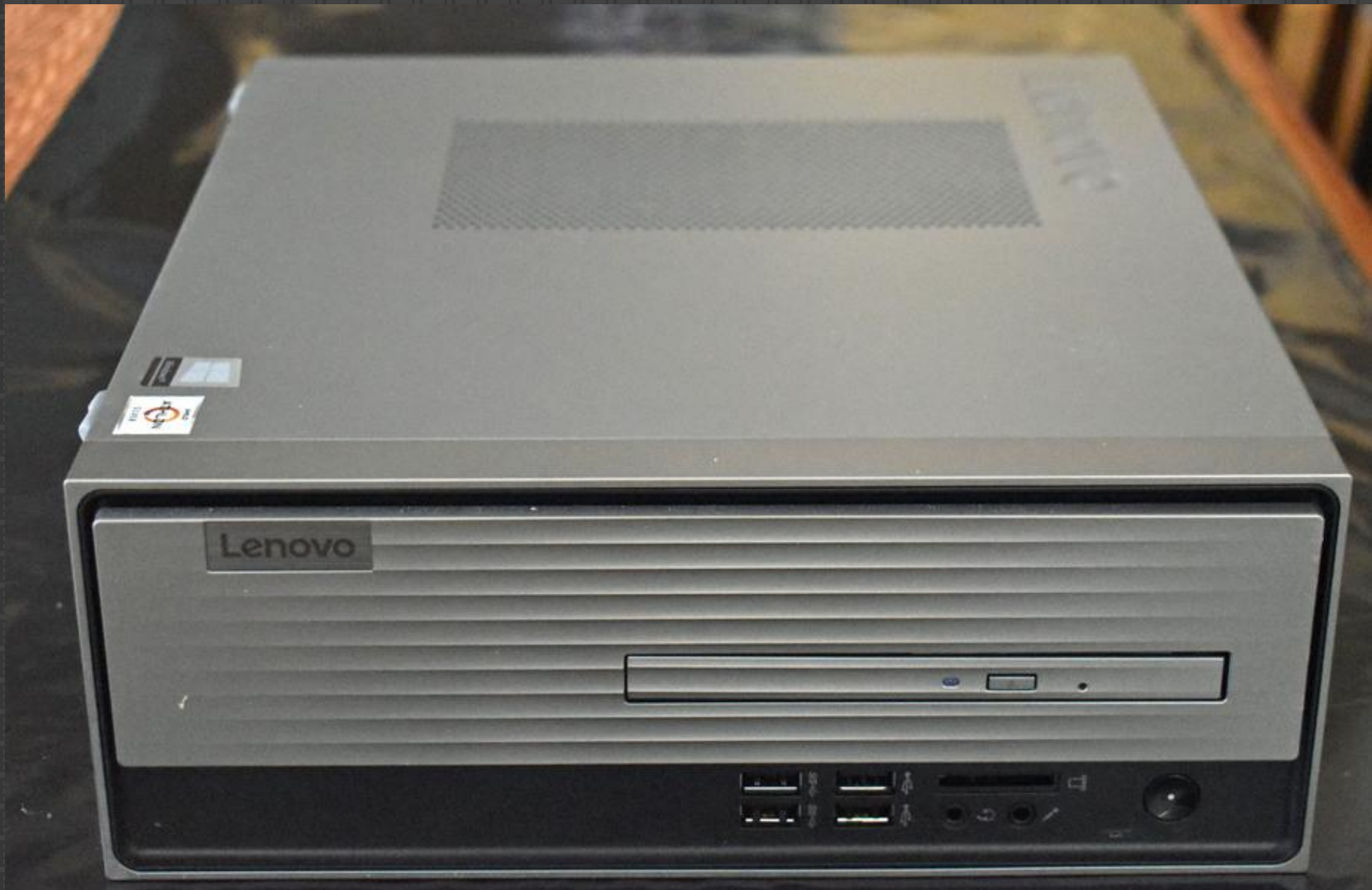
301b-Jim Somerville – The box