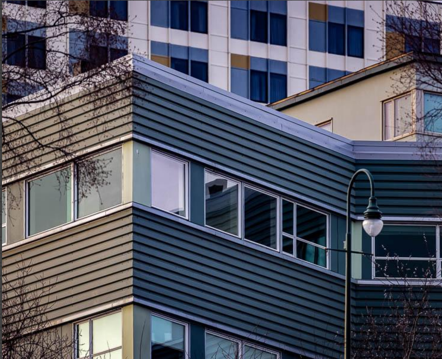
311b – Bart Quimby