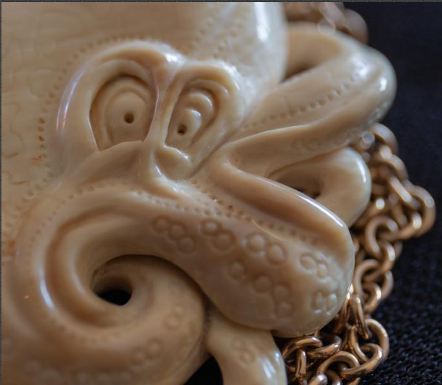
310b-Charles Iliff – Octopus