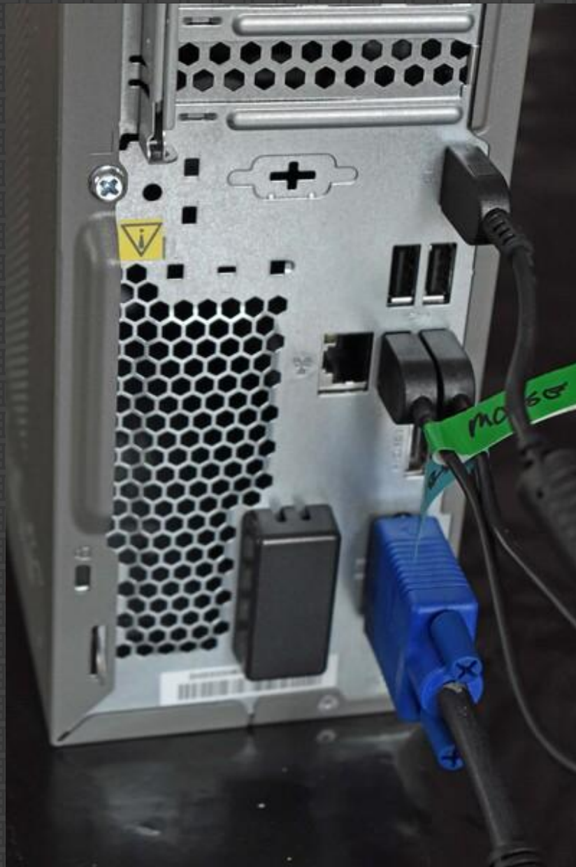
301a-Jim Somerville – The back