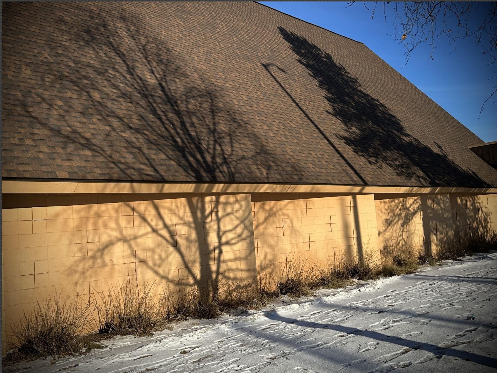
108b – Paula Saindon – Shadows About Town