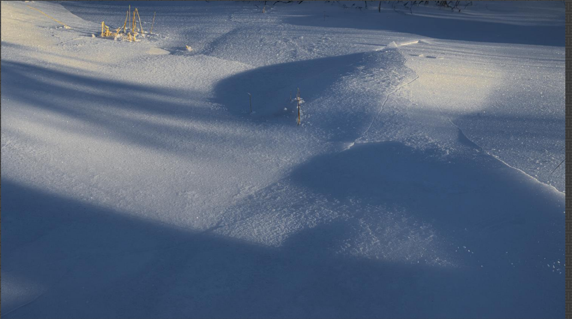
104a – Bill Cole