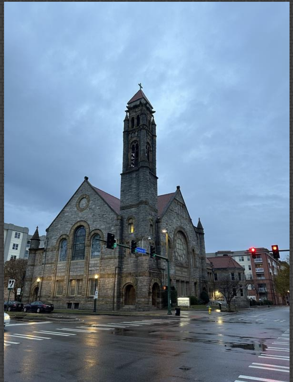
before Post Processing