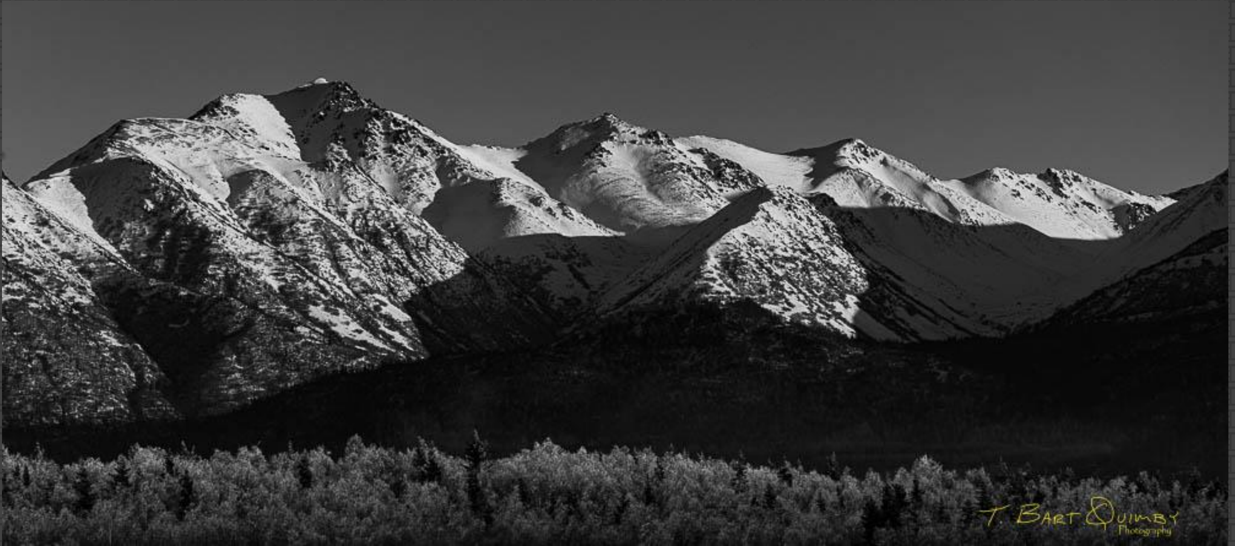
110a – Bart Quimby – Mountain Shadows