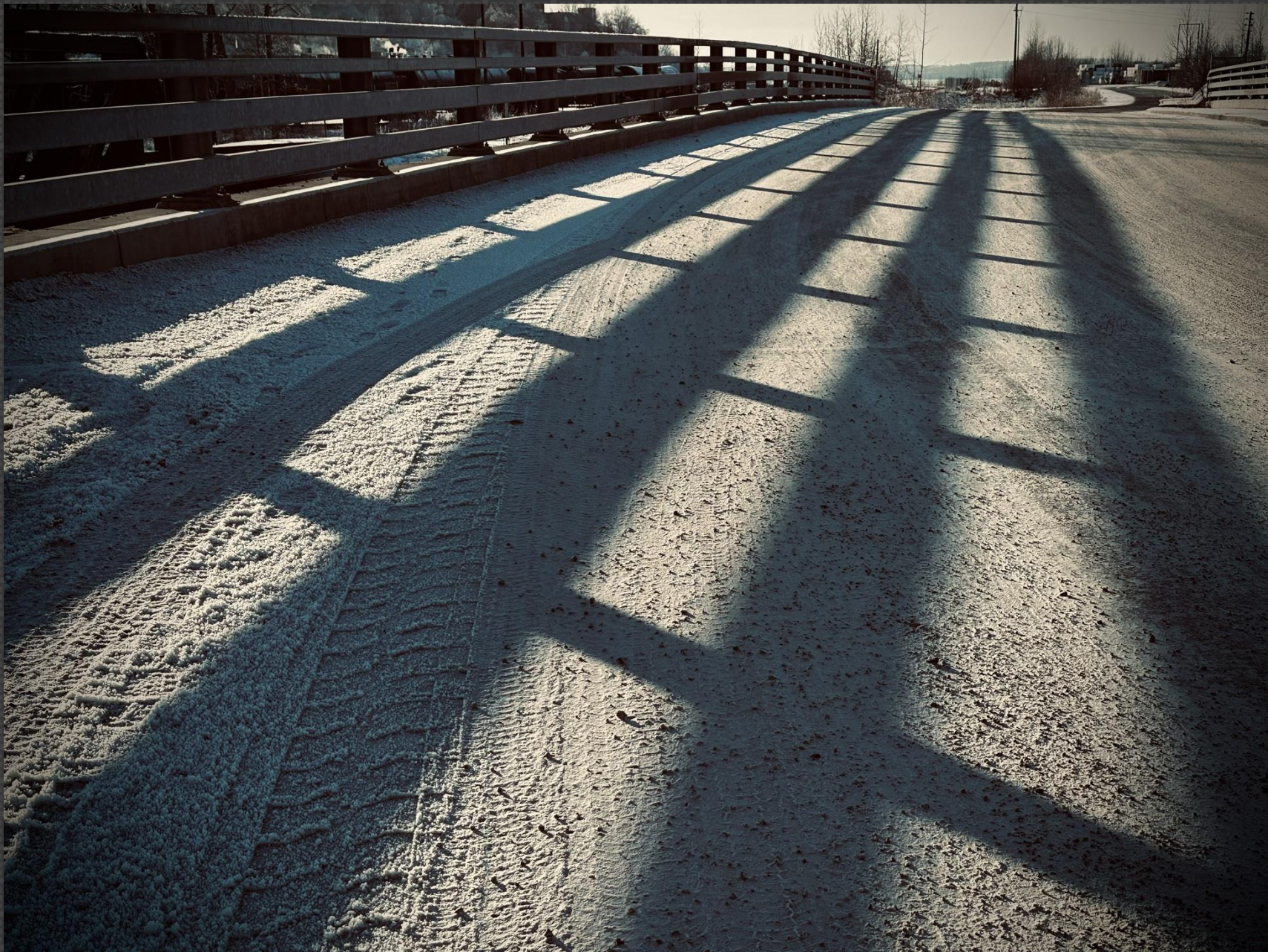
108a – Paula Saindon – Shadows About Town