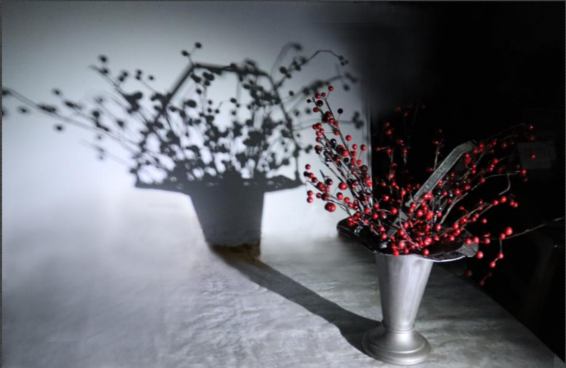
109a – Carol Renfro – Red berries shadows