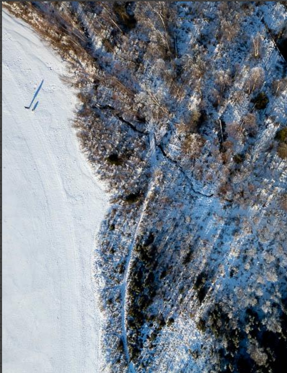
110b – Bart Quimby – Forest Shadows