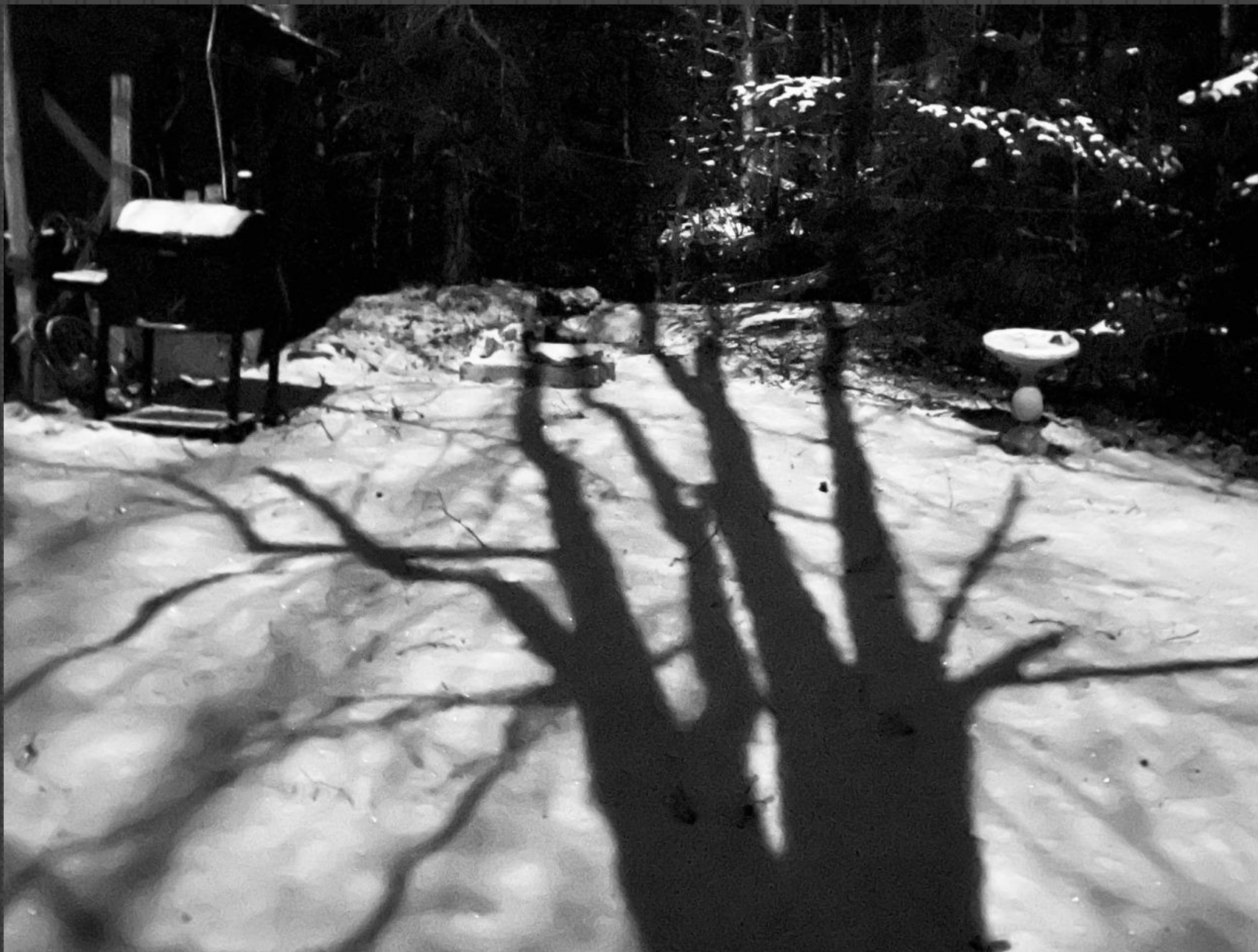
107b – Elly Scott – Moon Shadow