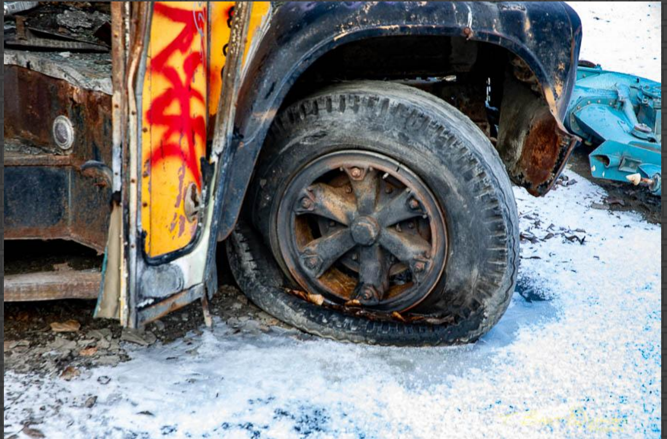
Details of Common Objects