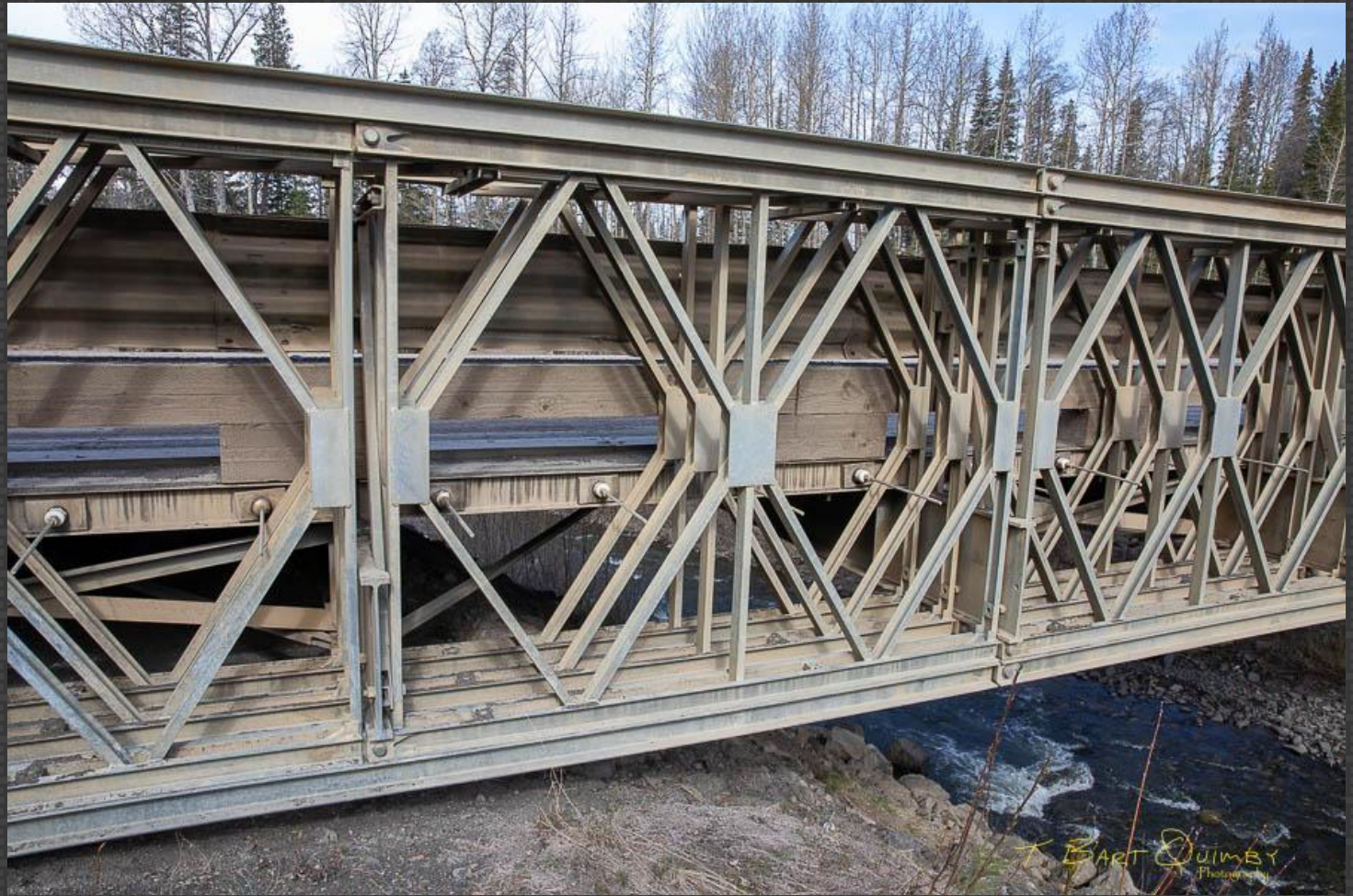
Patterns & Lines