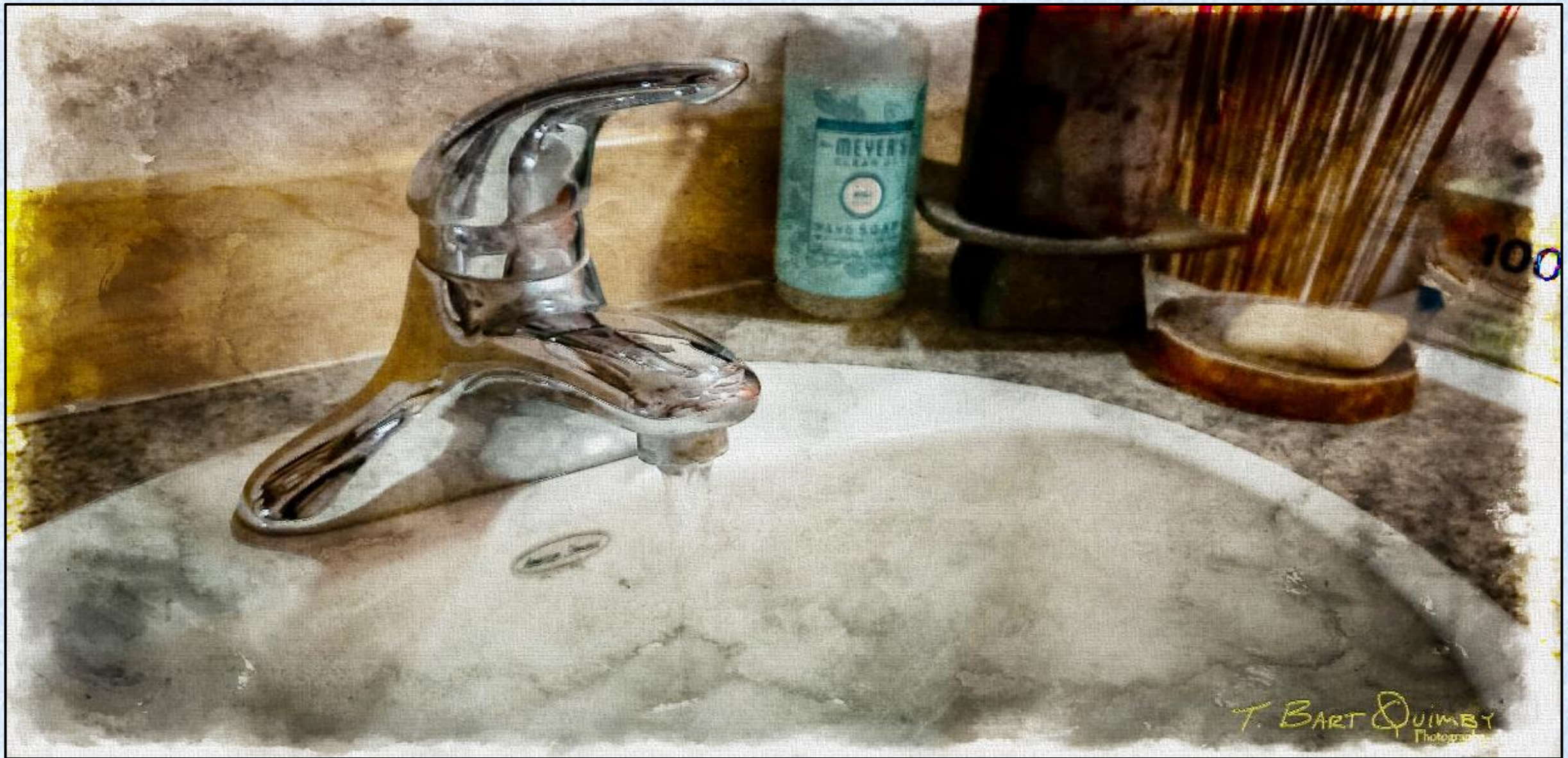
851 a-Bart Quimby – More Plumbing