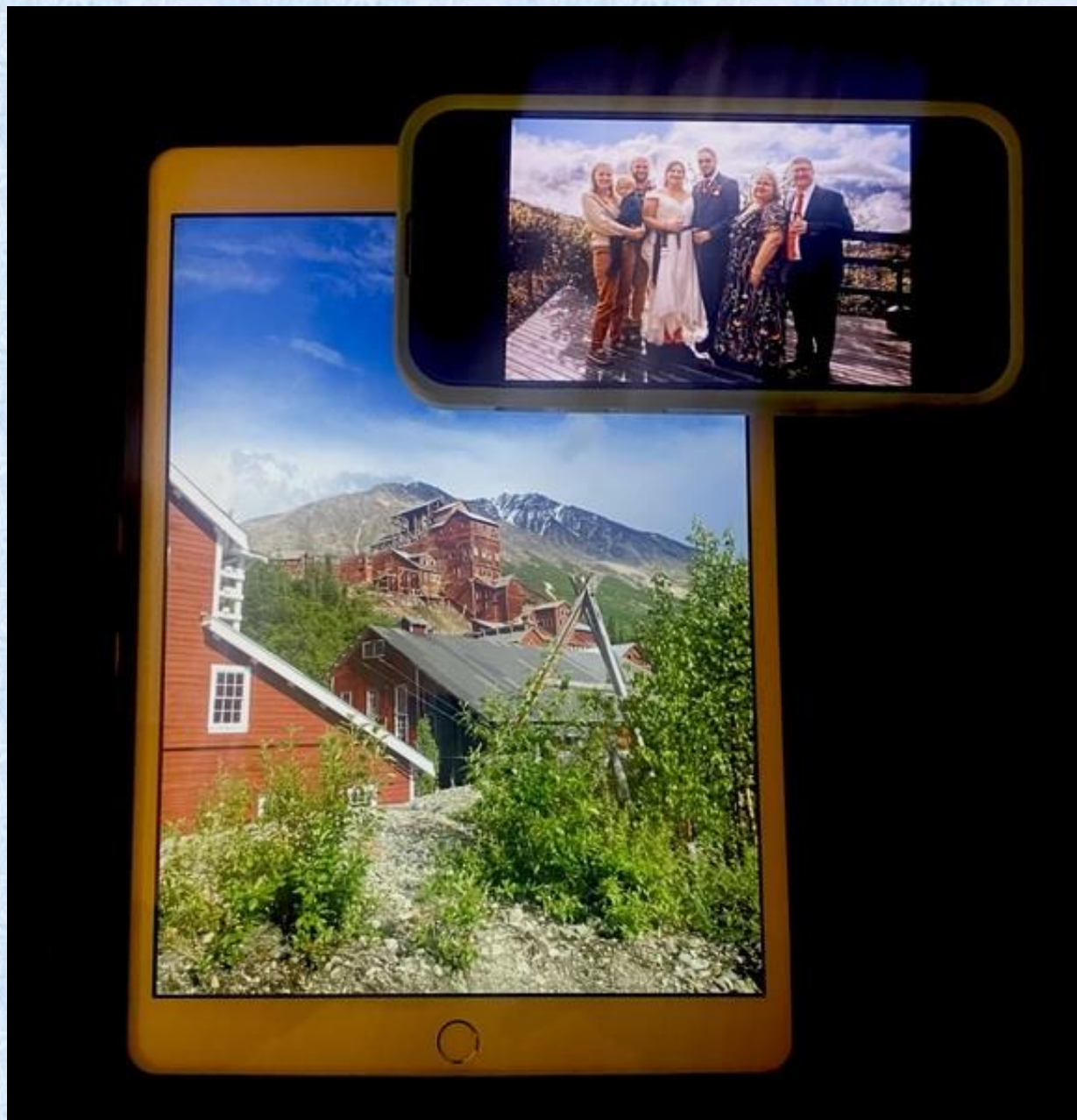
807a-Paula – Gratitude for Digital Memories