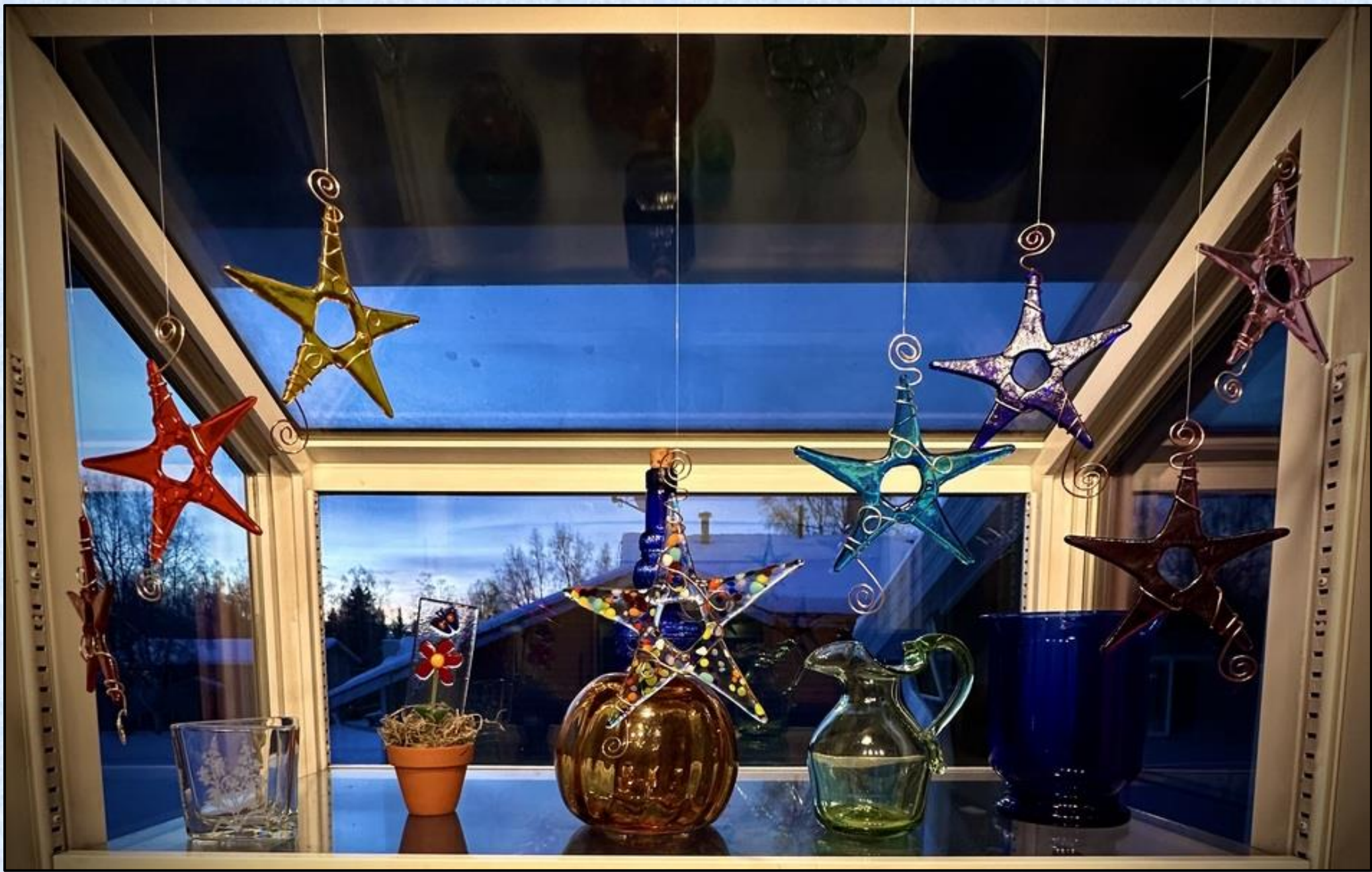
807b-Paula – Gratitude for the Makers