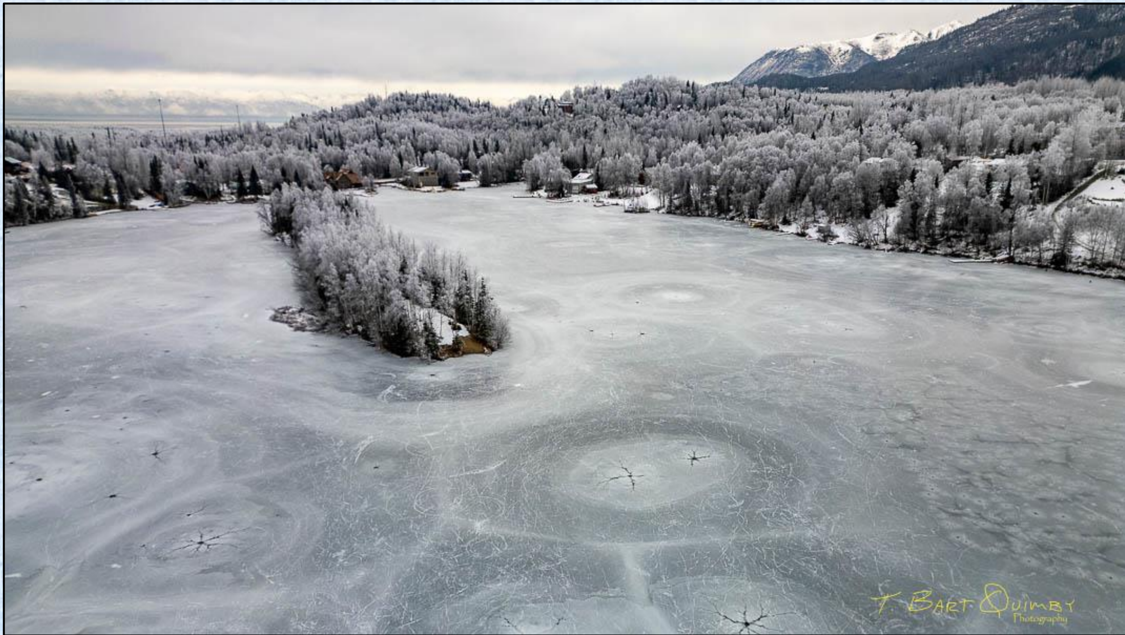
812b-Bart Quimby – Winter