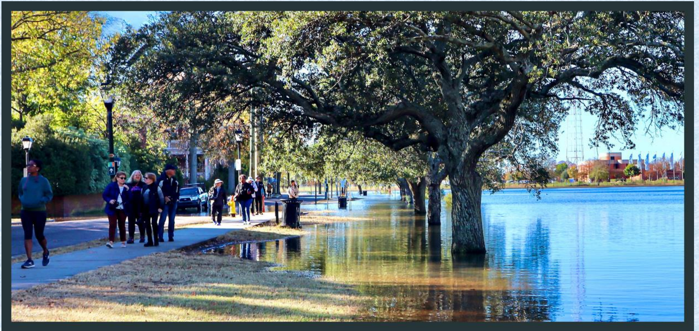
804b-Sandra Knight – Riverwalk; what's next