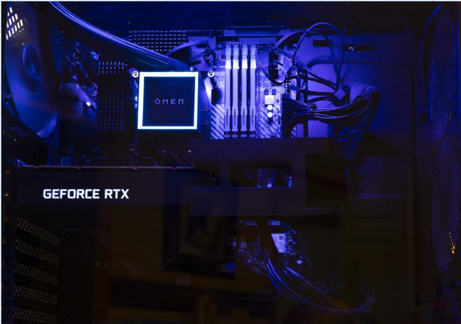
805b-Bill Cole – Omen