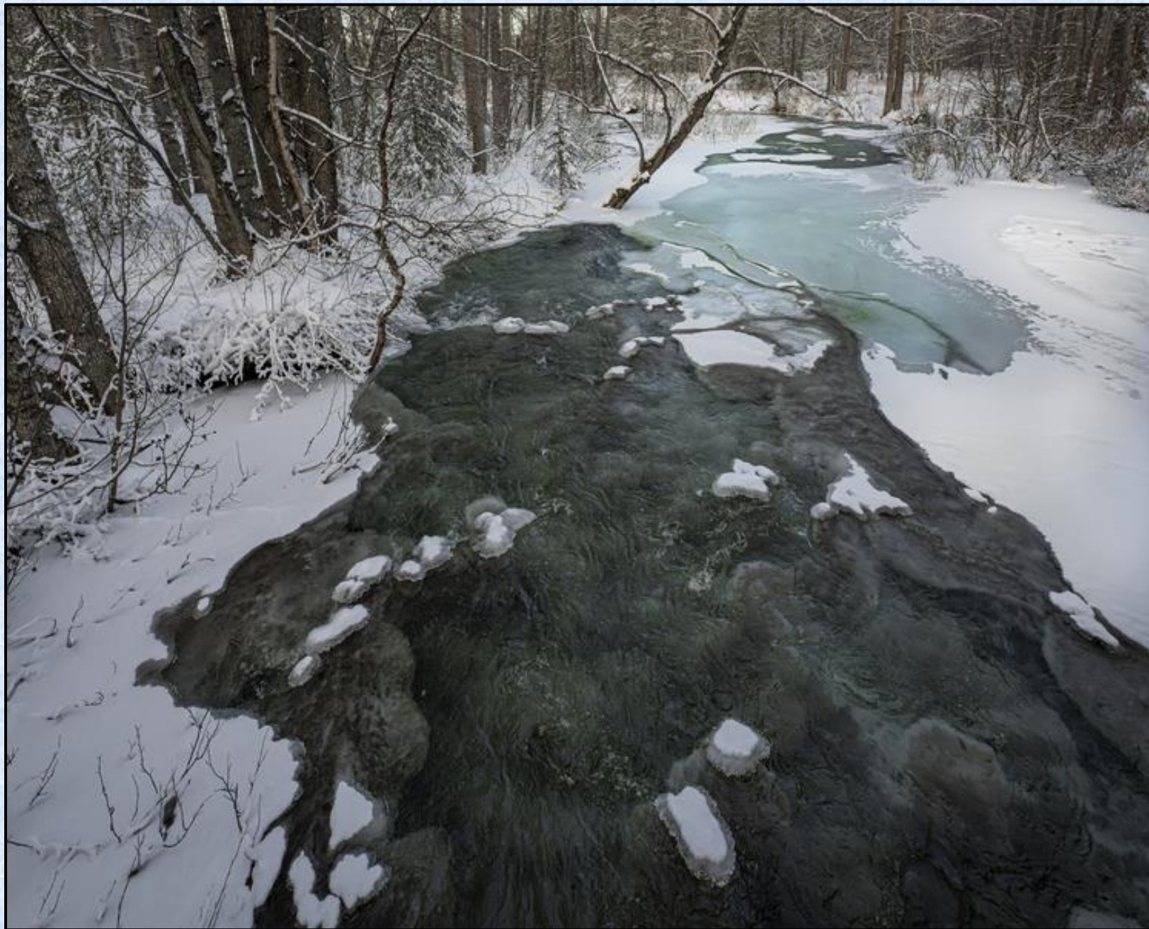
805a-Bill Cole – South Fork Campbell Creek