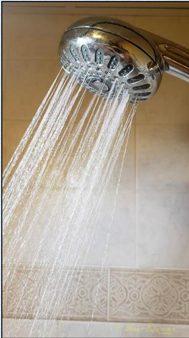
812a-Bart Quimby - Plumbing