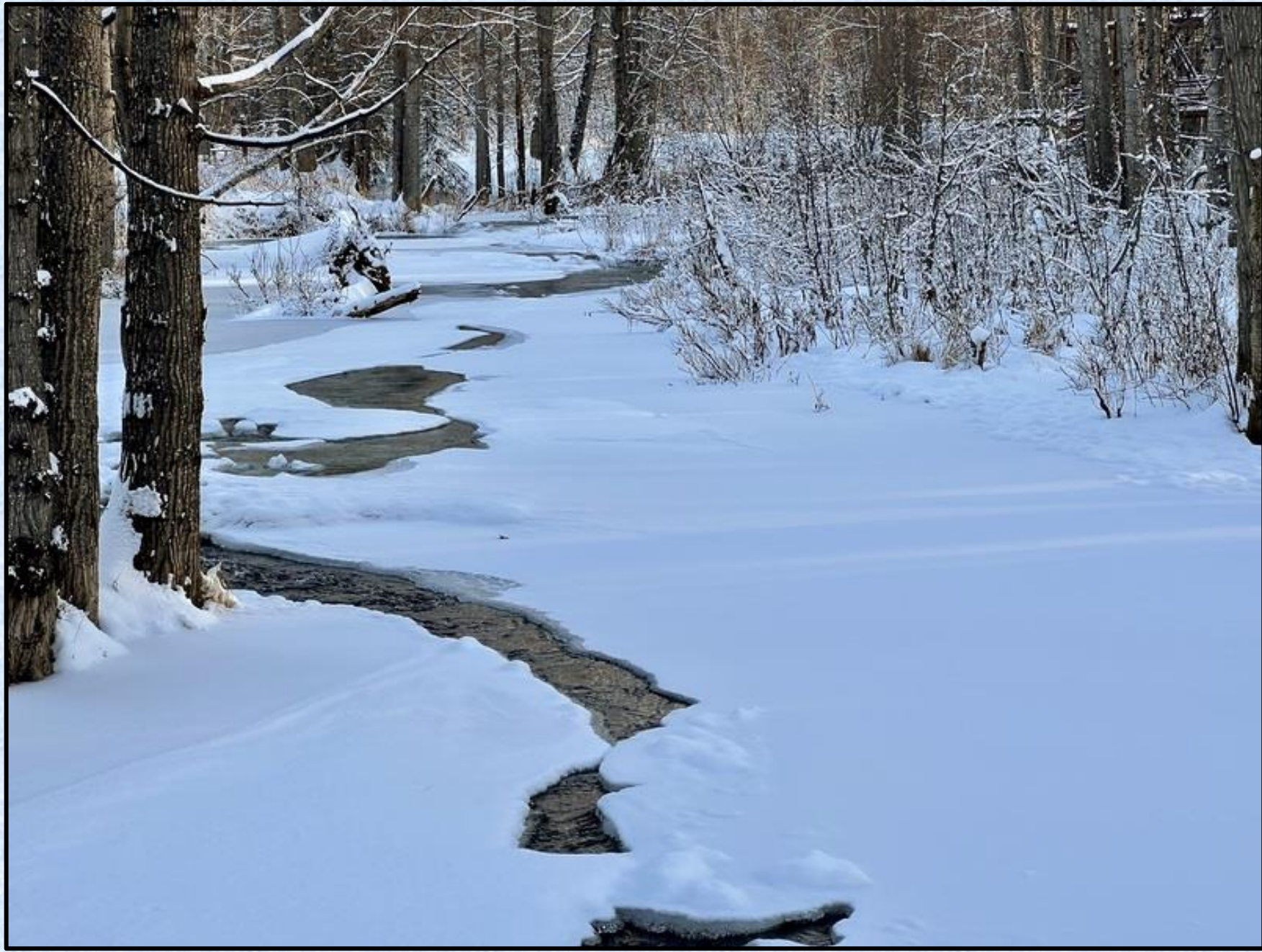
806a-Janine – Natural-Beauty