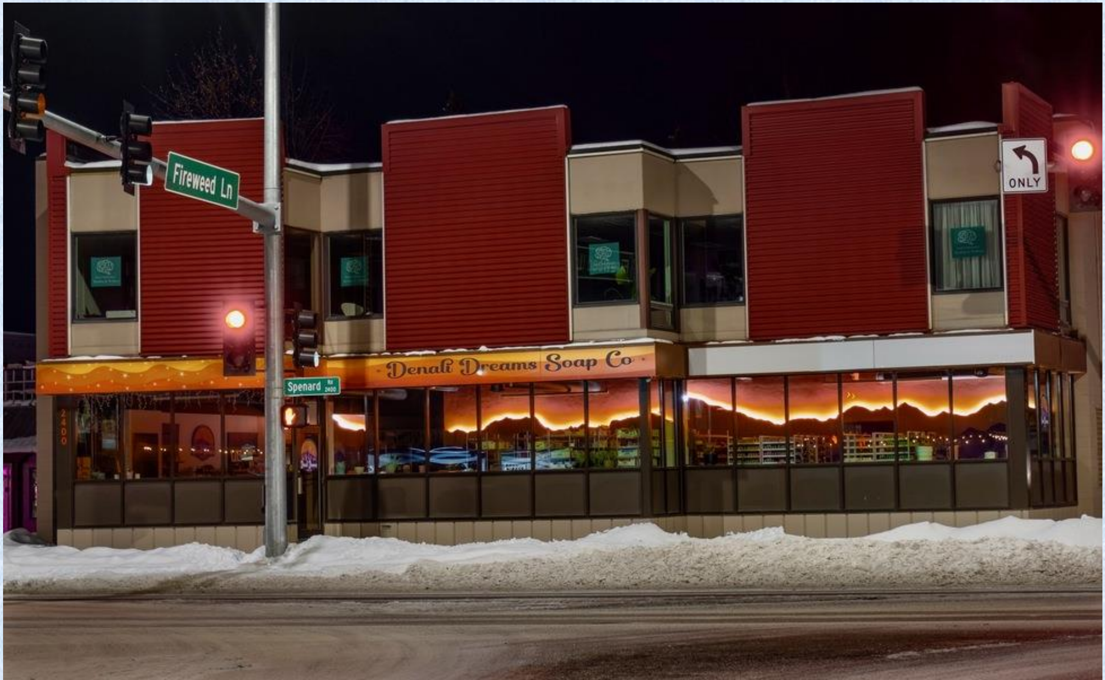
607b-Doug Poage – Fireweed and Spenard