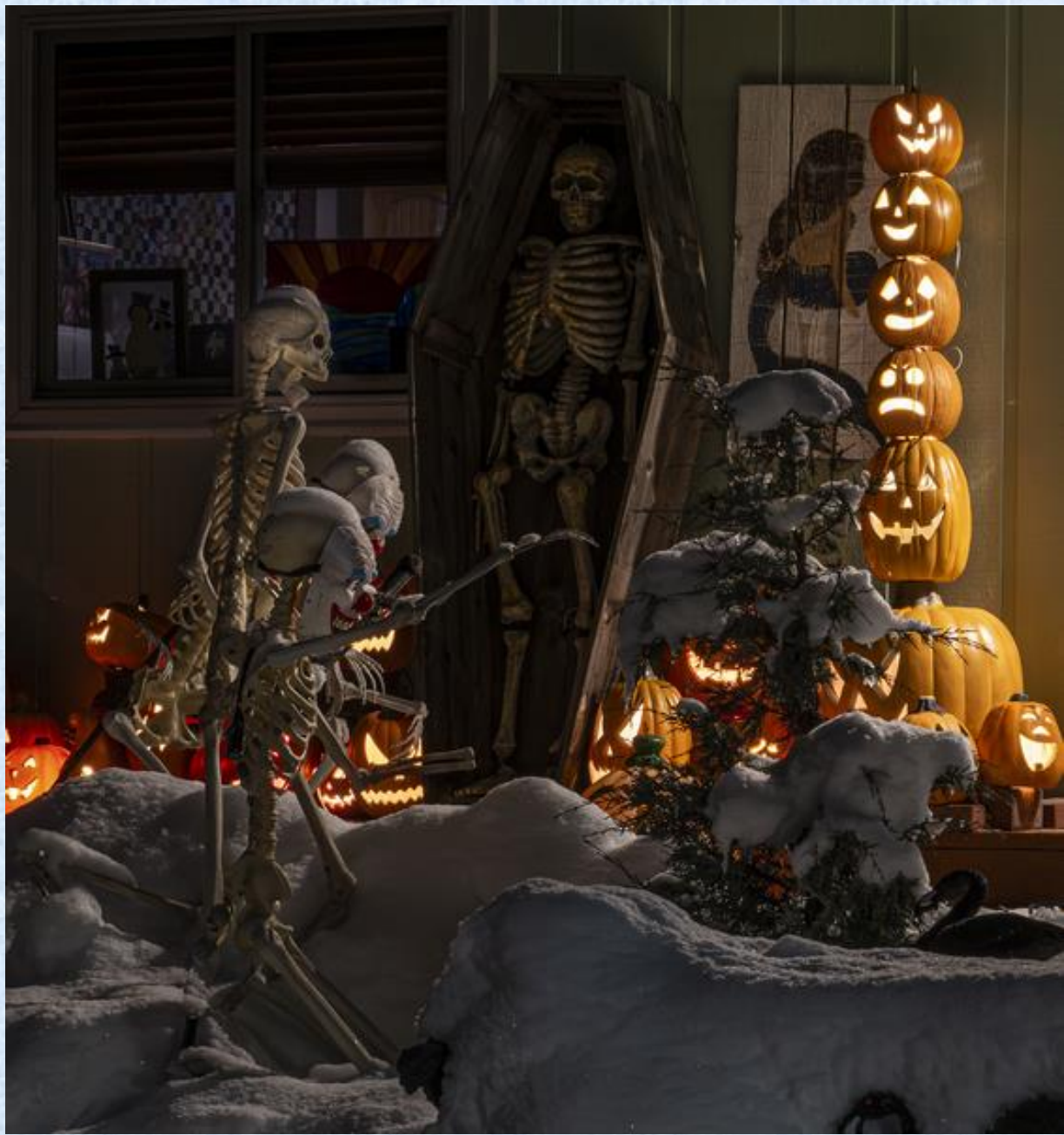
656a-Bill Cole – Enhanced NR