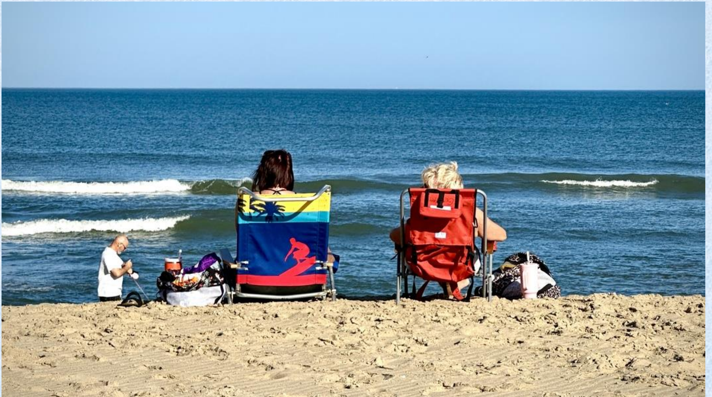
651 a-Sandra Knight