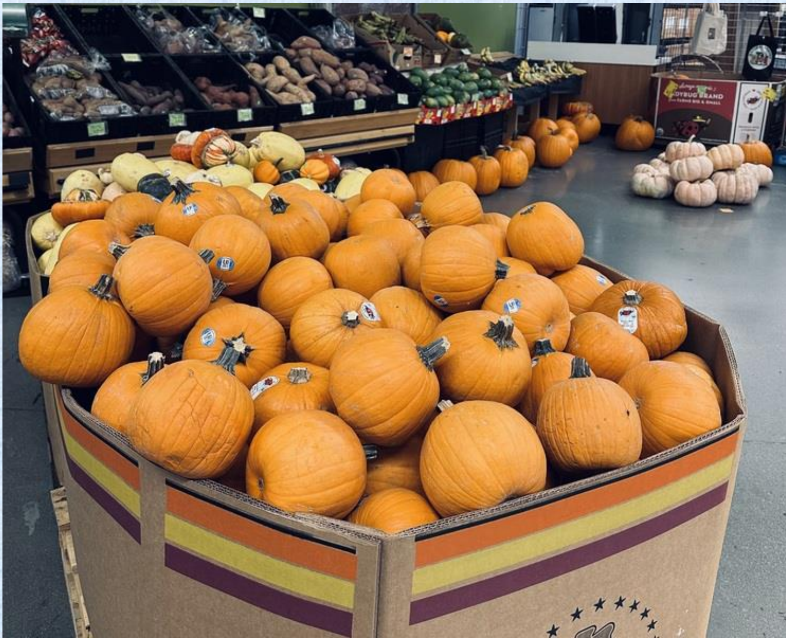
608b-Janice Berry – Mini pumpkins