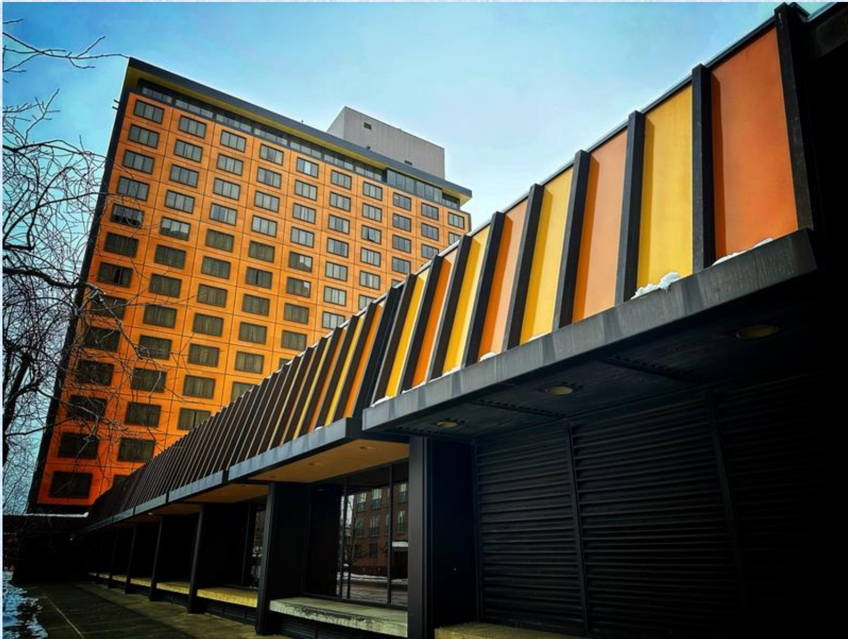
609b-Paula Saindon – Outrageously Orange