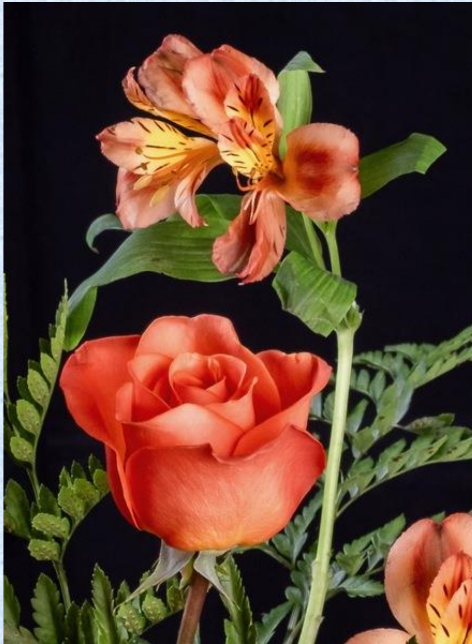
654a-Doug Poage – orange texture