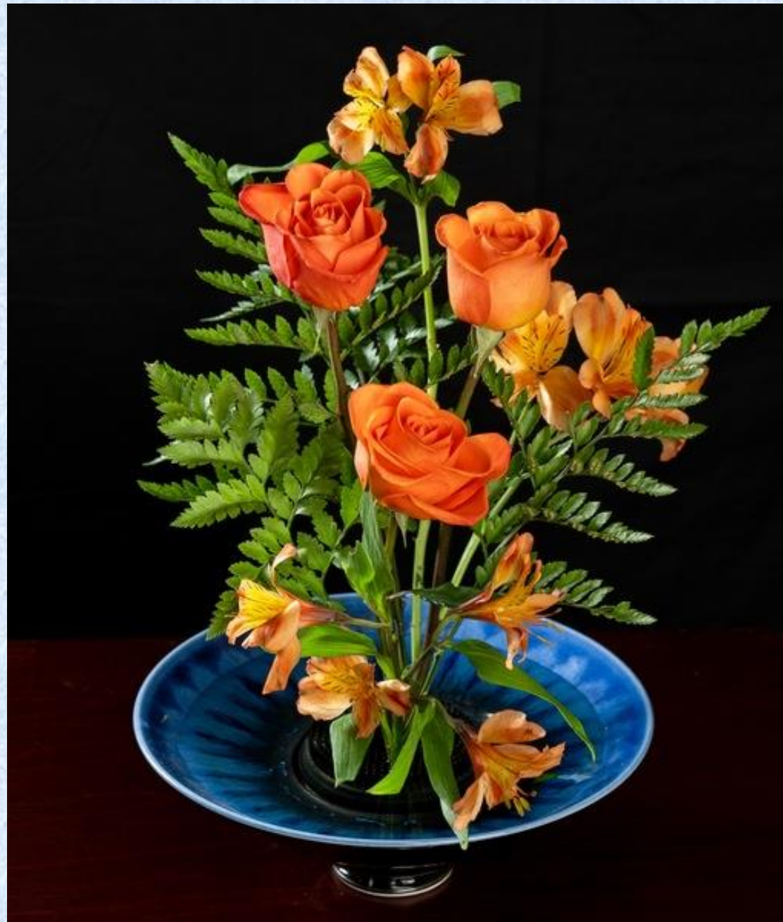
607a-Doug Poage – faux shoka shimputai