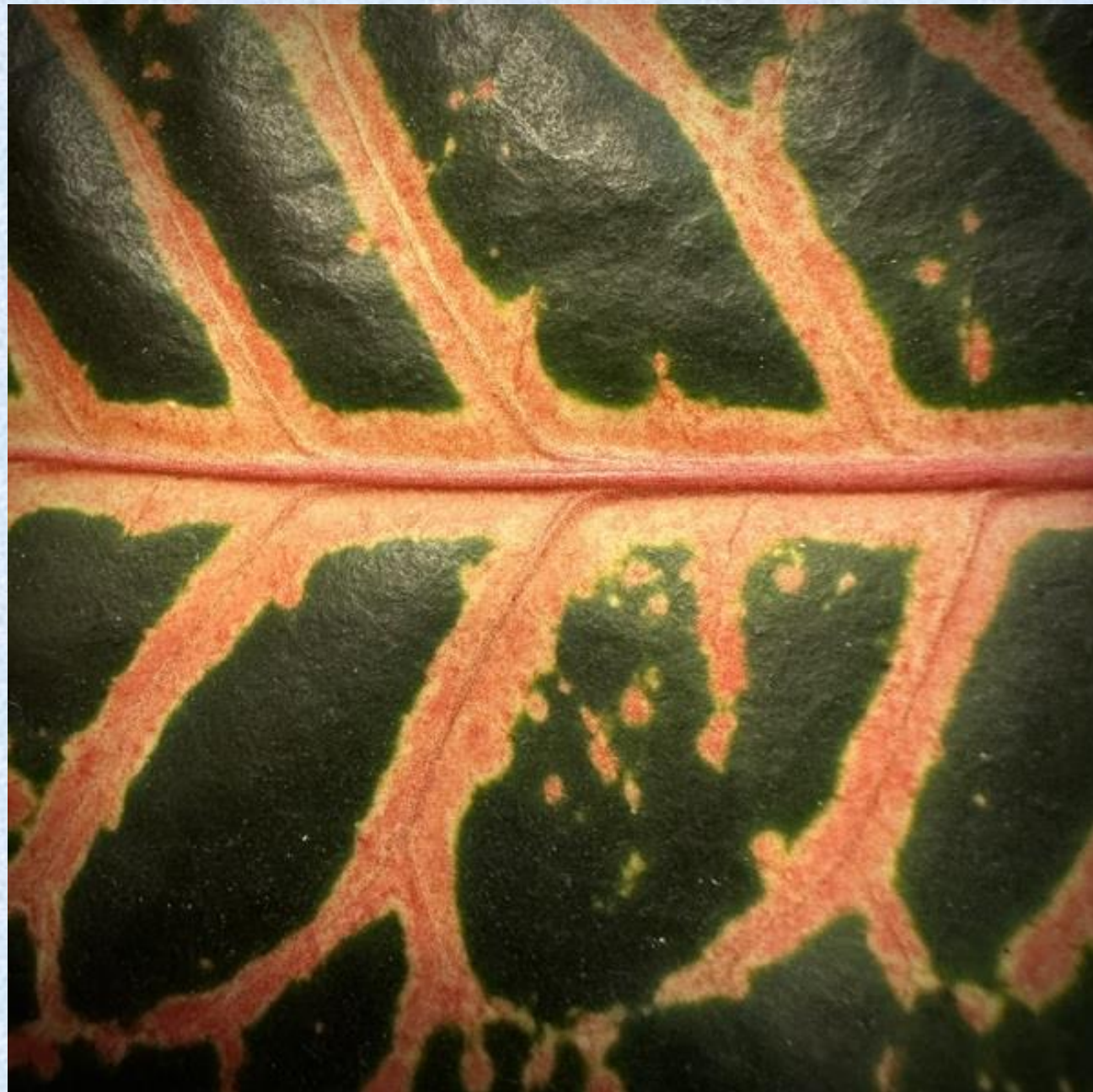
609a-Paula Saindon – Outrageously Orange