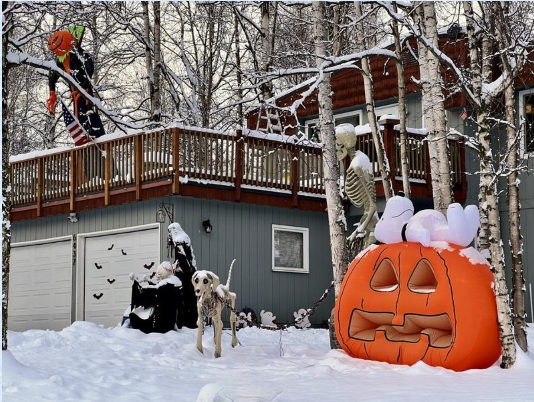
653a-Janine – Halloween