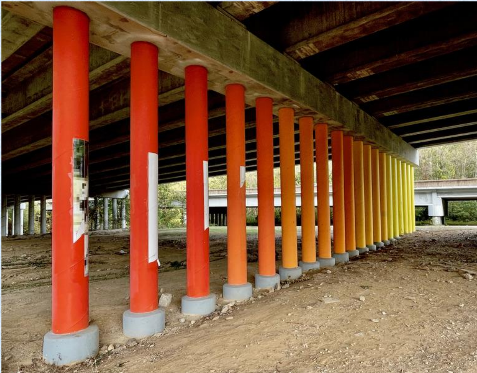
613b-Elly Scott – Orange street art