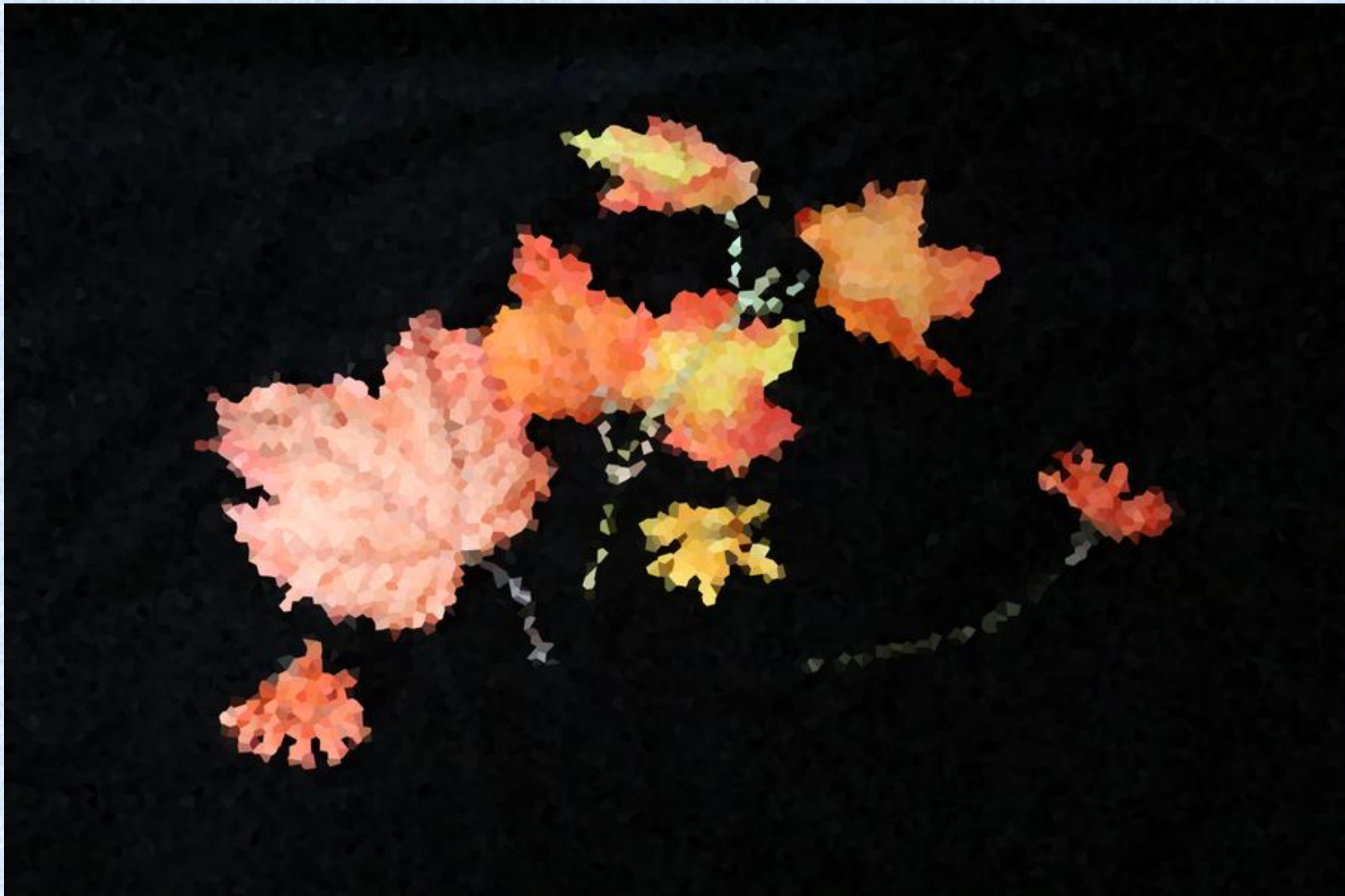
611 a-Carol Renfro – Autumn leaves, pixelate crystalize