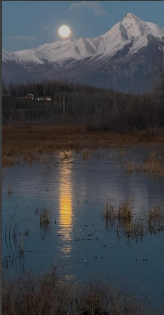
408b-Chuck Iliff – Flat moon path