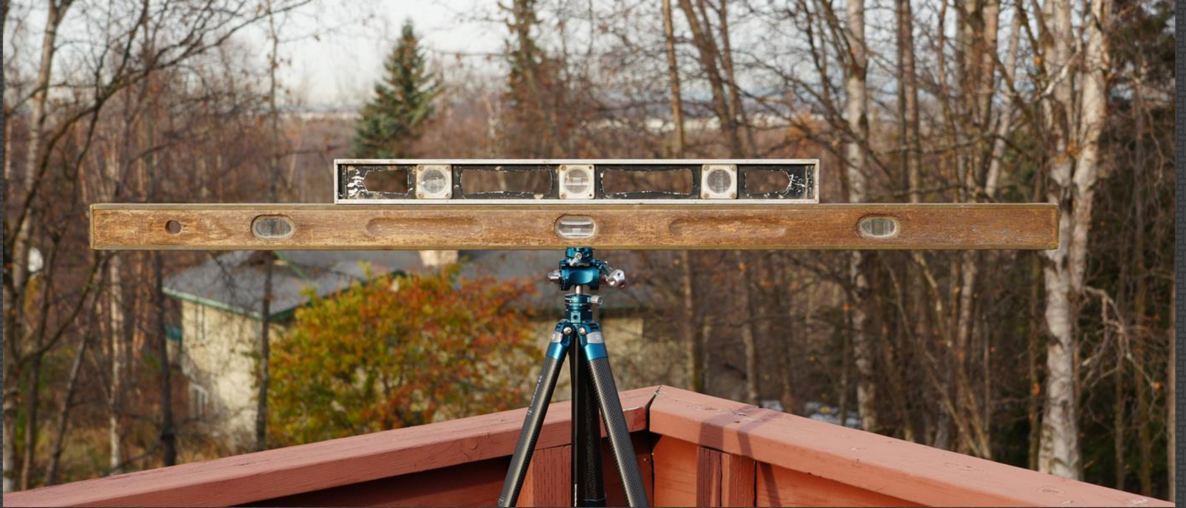
403a-Andrew White – Level on the Level