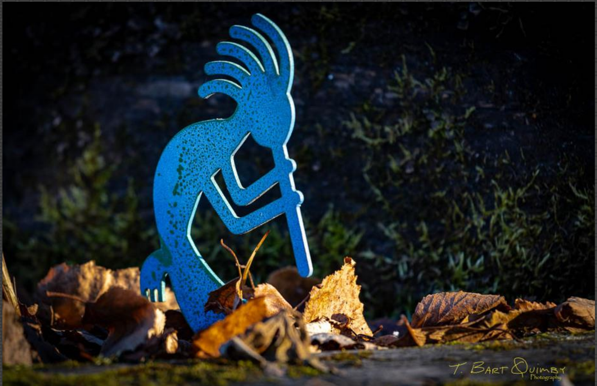
412a-Bart Quimby - Garden Ornament