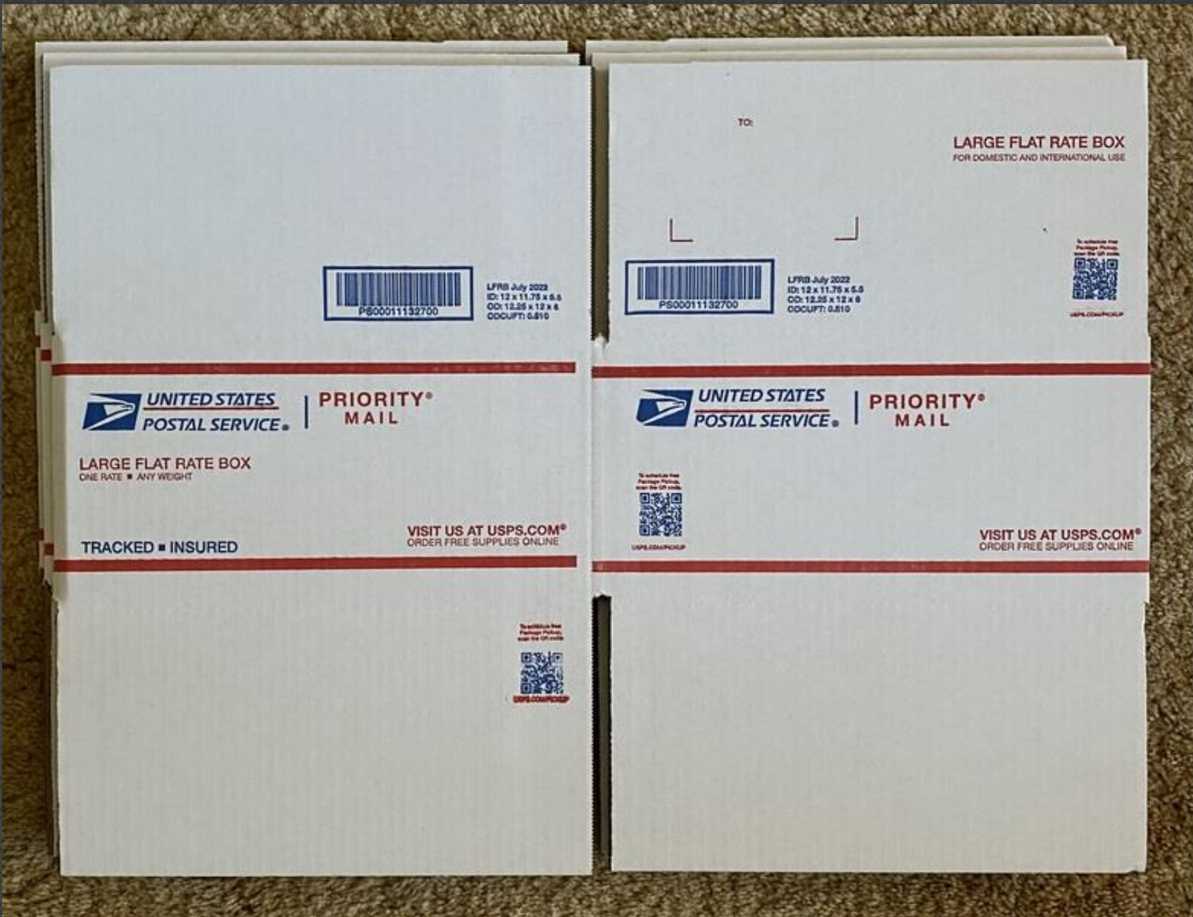
401b-Shirley – Flat Rate in a Flat Box