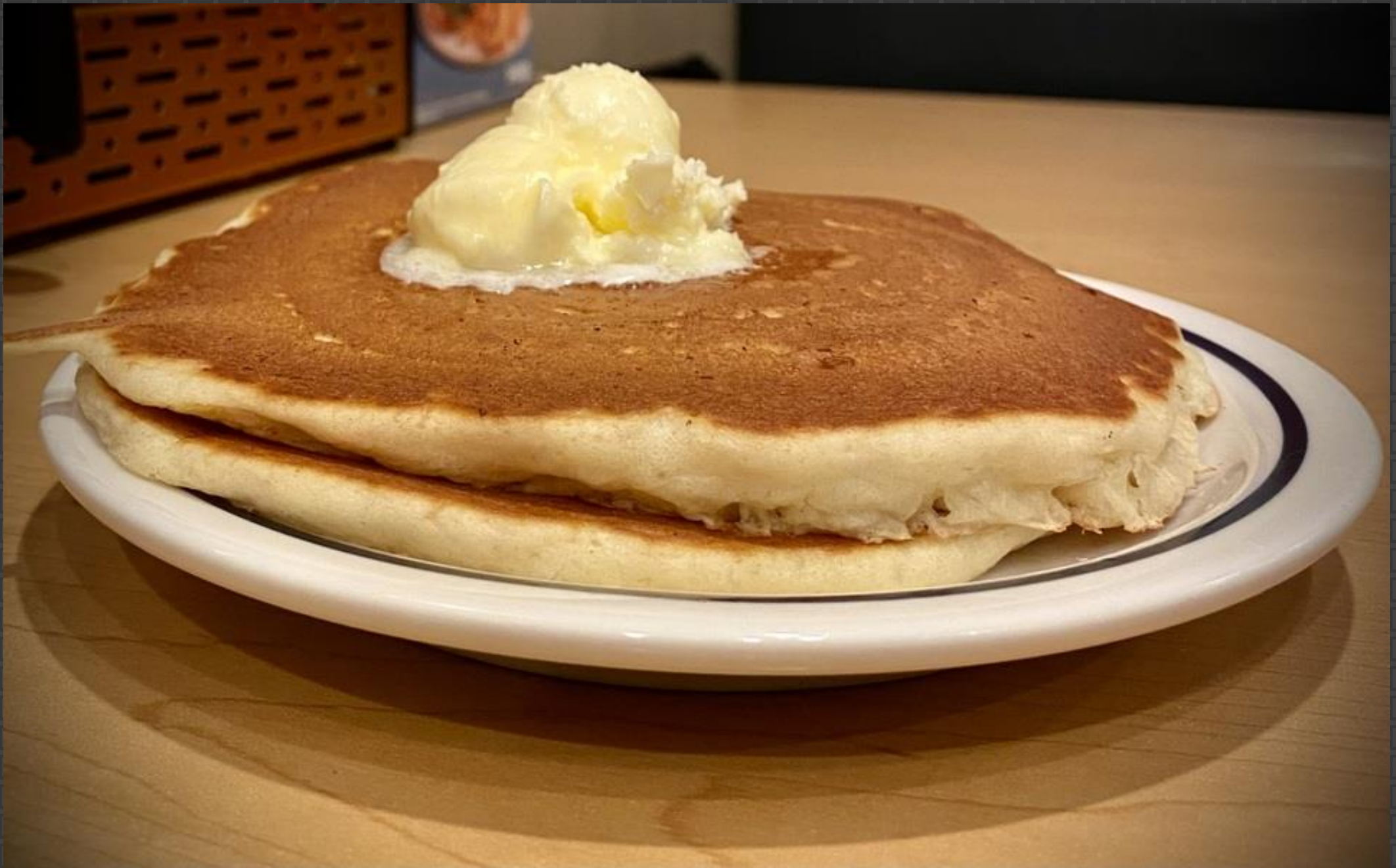
401a-Shirley – Flat as a Pancake