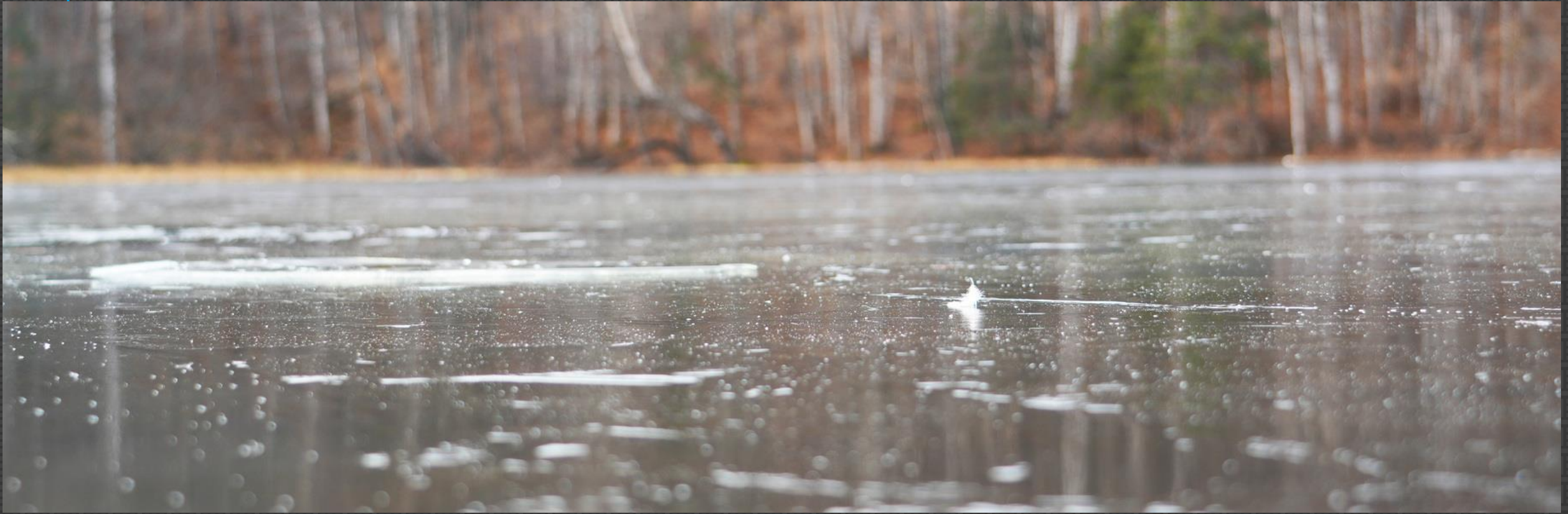
403b-Andrew White – Water Seeks the Level