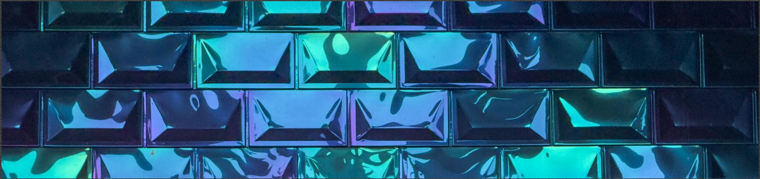
408a-Chuck Iliff – Bad Gramm3r flat wall