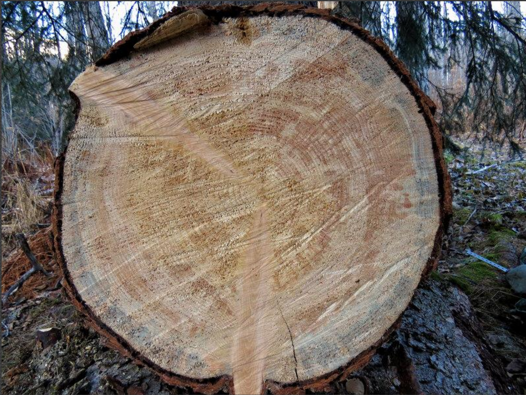
406b-Bob Estey – Flat log