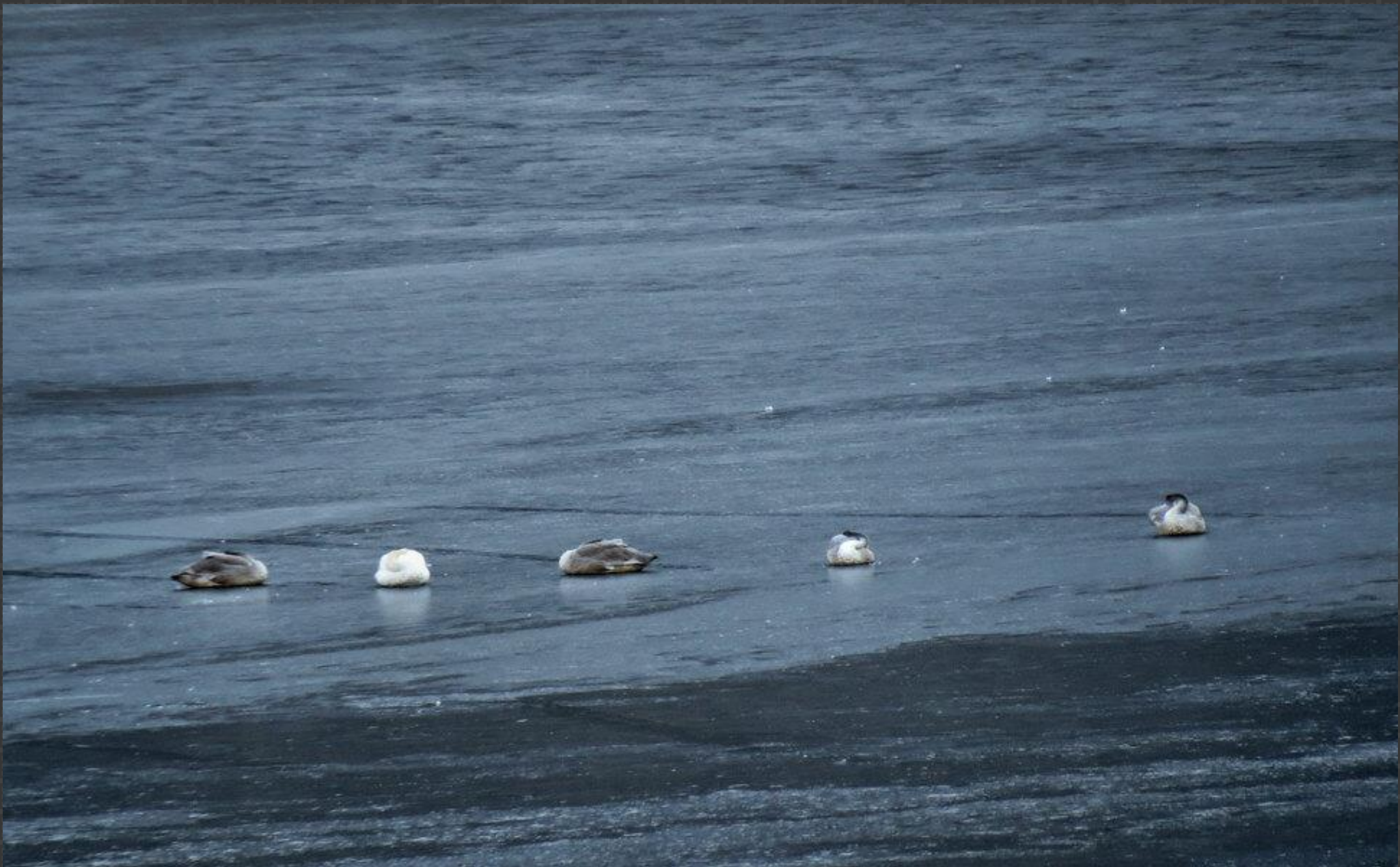
406a-Bob Estey – Flat ice