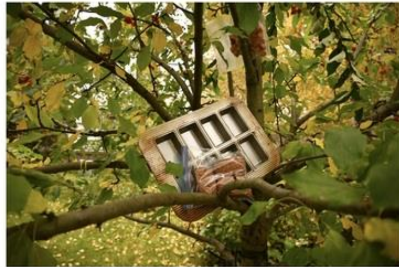
151-marty – makings of crabapples