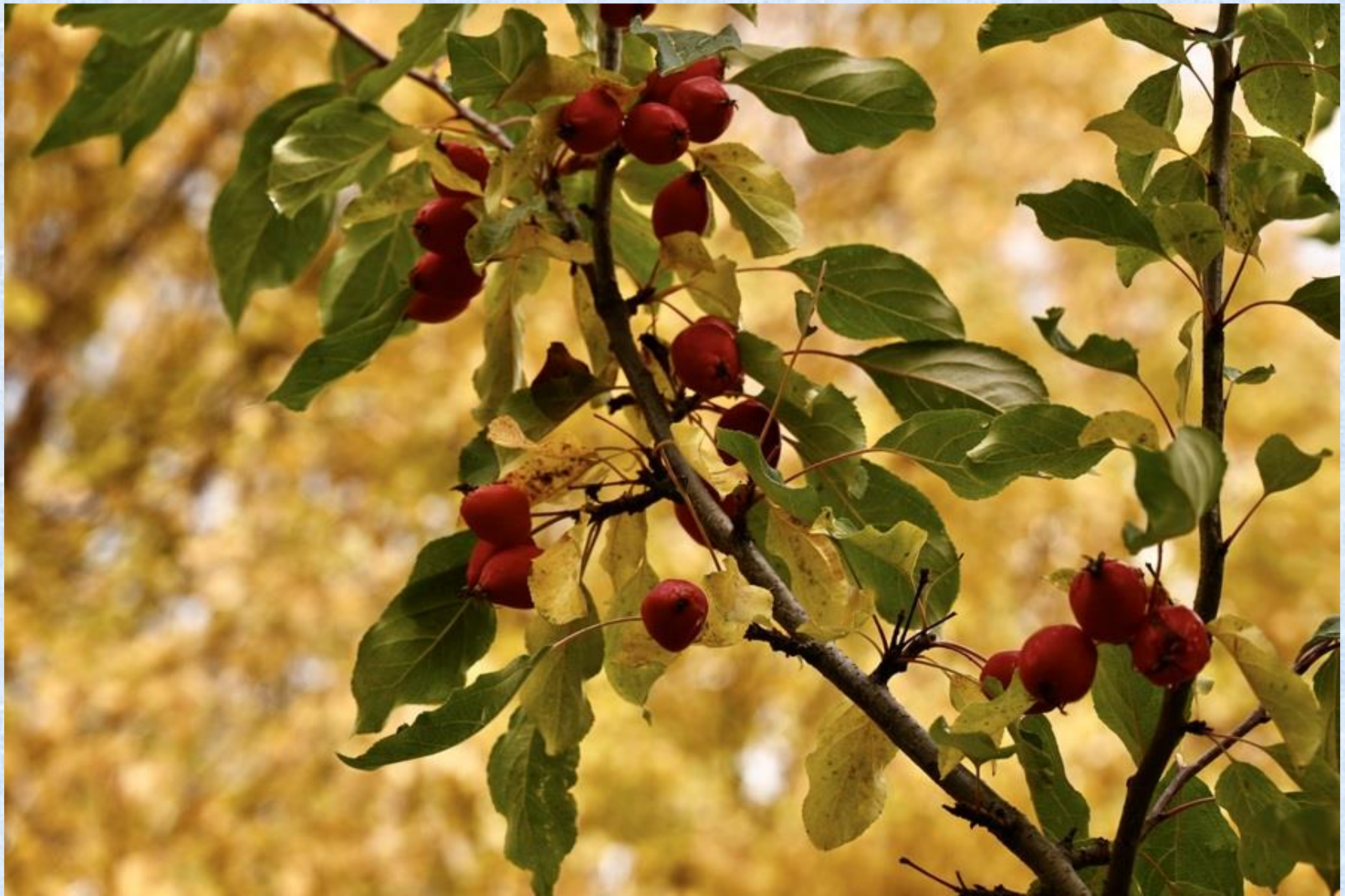
102a-marty – crabapples