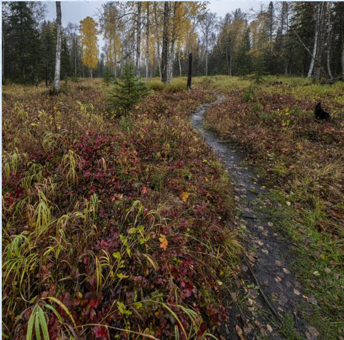
105a-Bill Cole – Fall Foliage