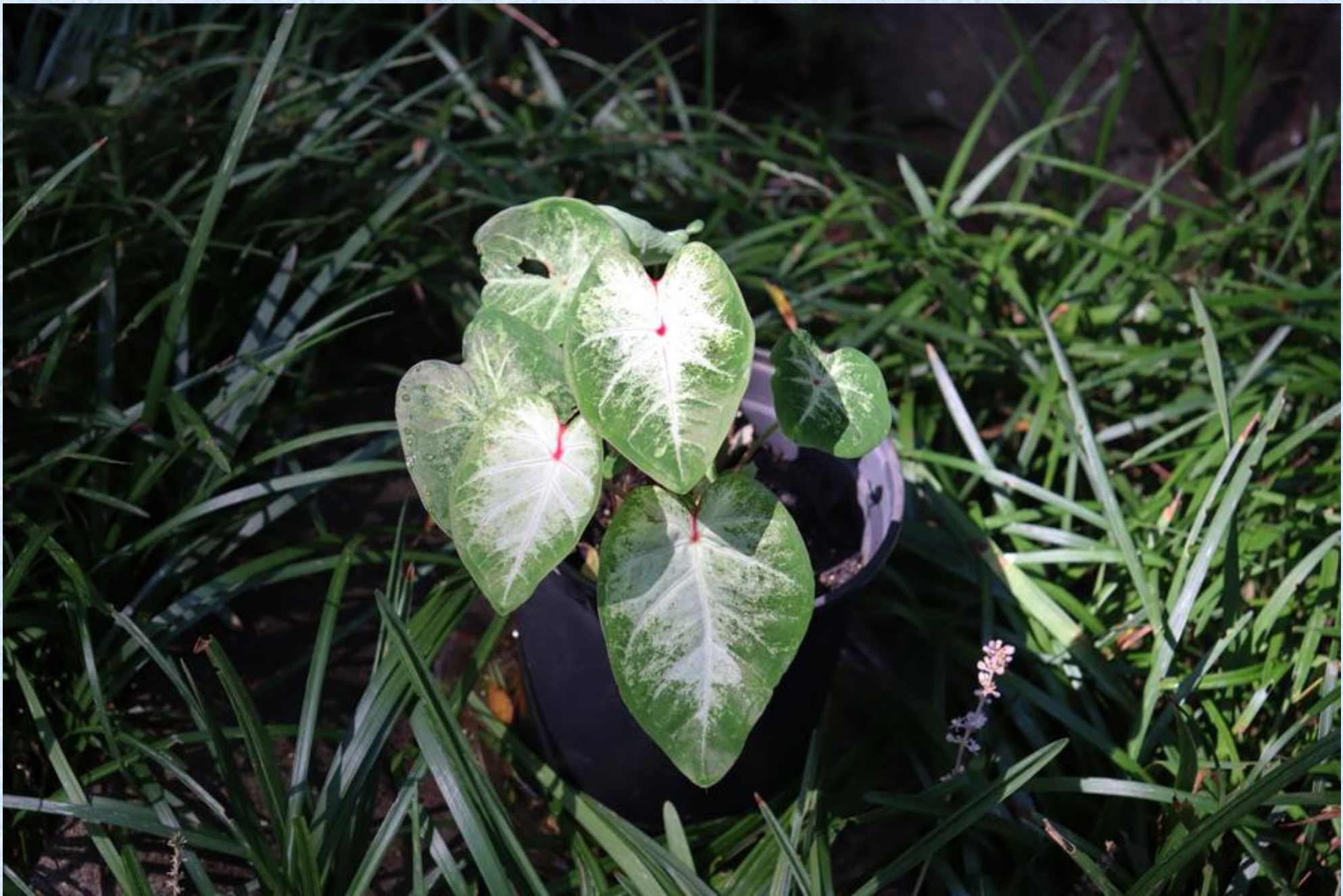
106b-Carol Renfro – Aaron caladium with red spots darker