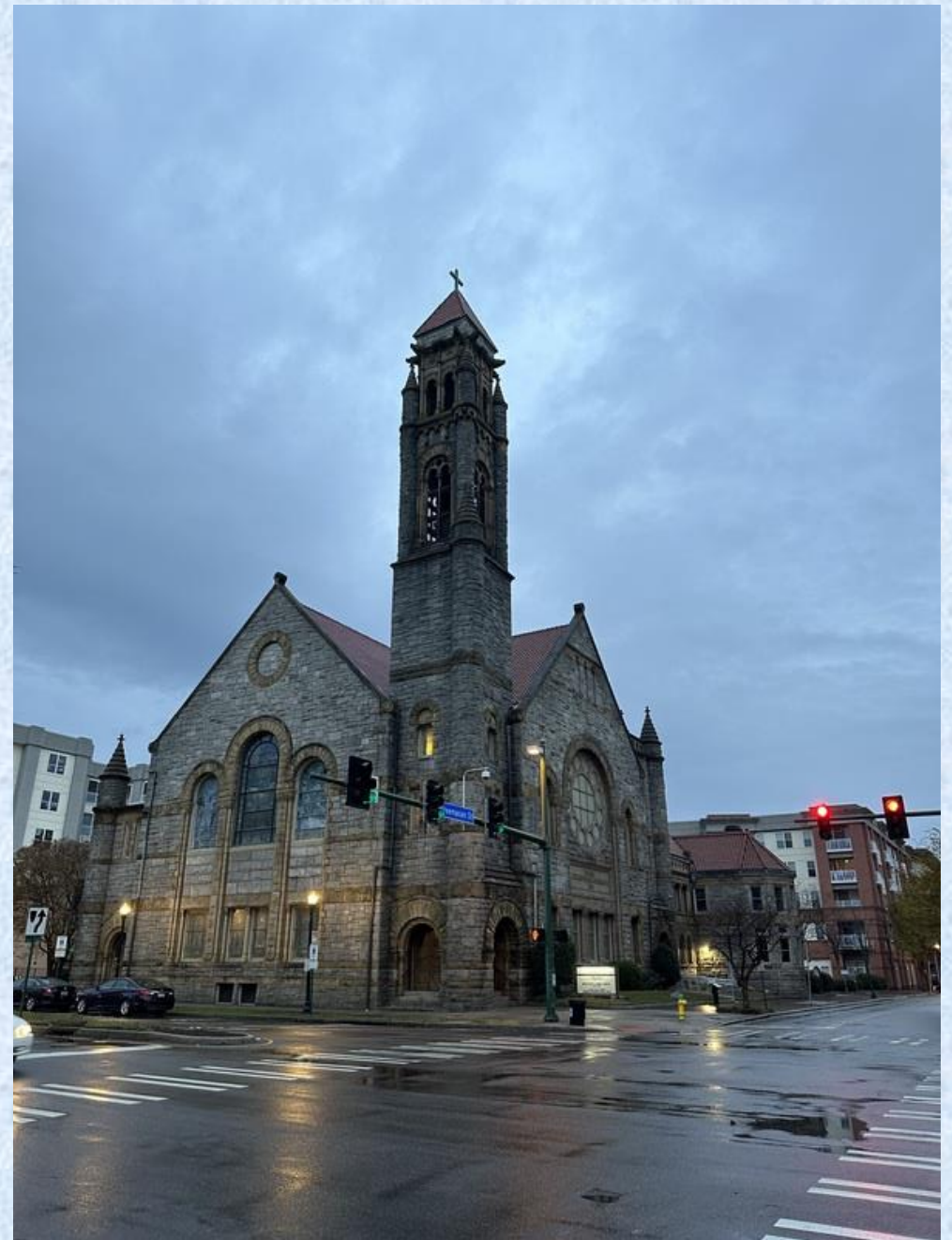
before Post Processing