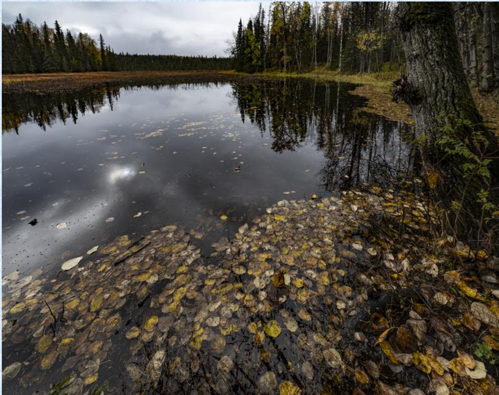
105b-Bill Cole – Fall Pond Reflections