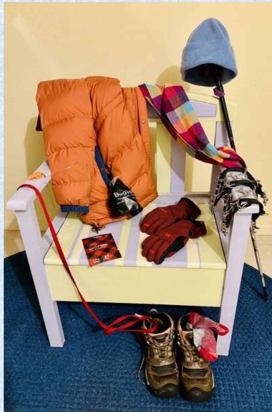
505-Claudia Wallingford – Walking the dog