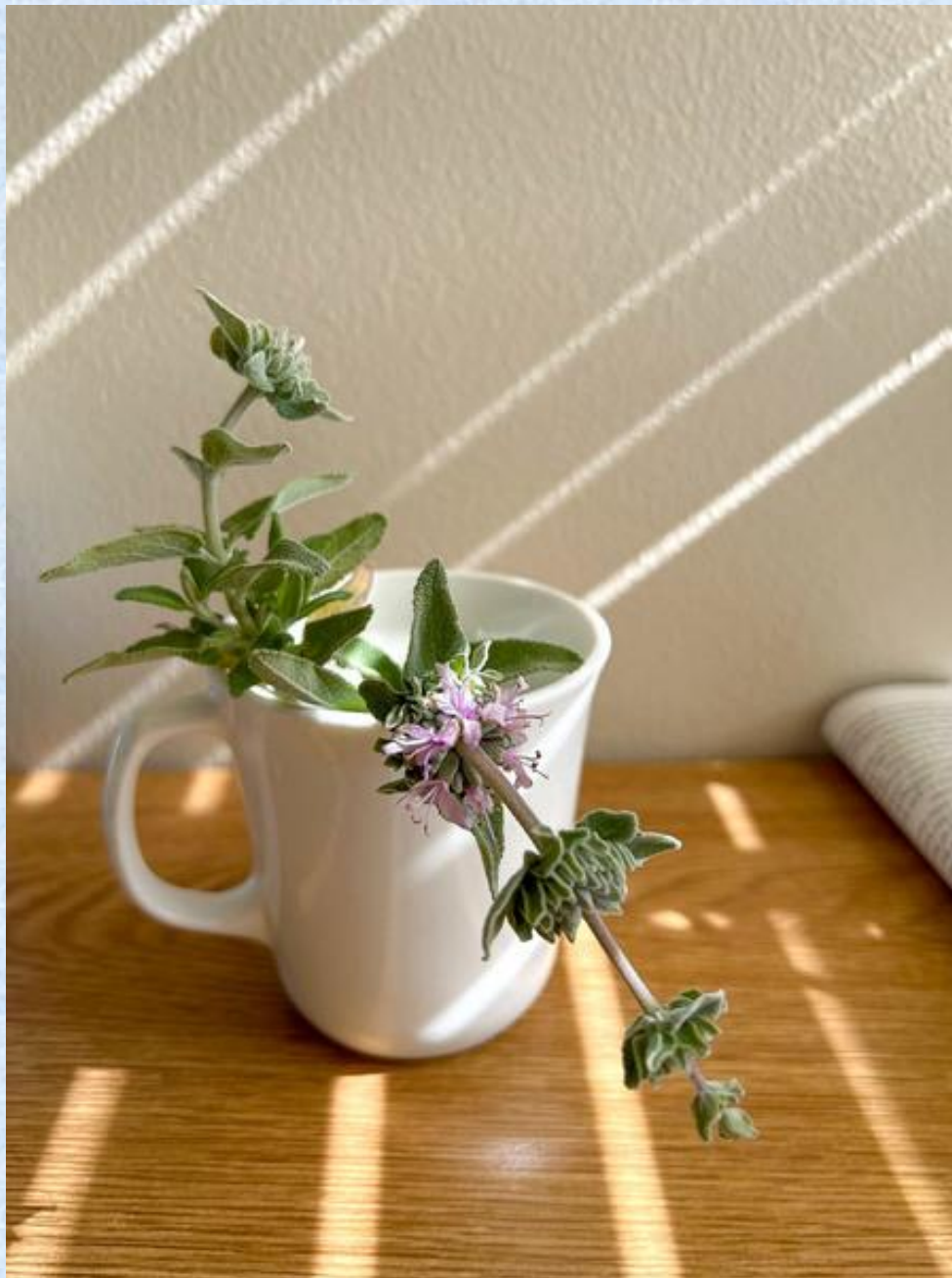
501-Doug Poage – Sage sprig