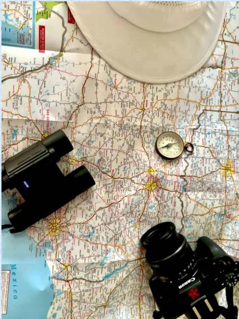
504-Sandra Knight –'Let's-Go!'