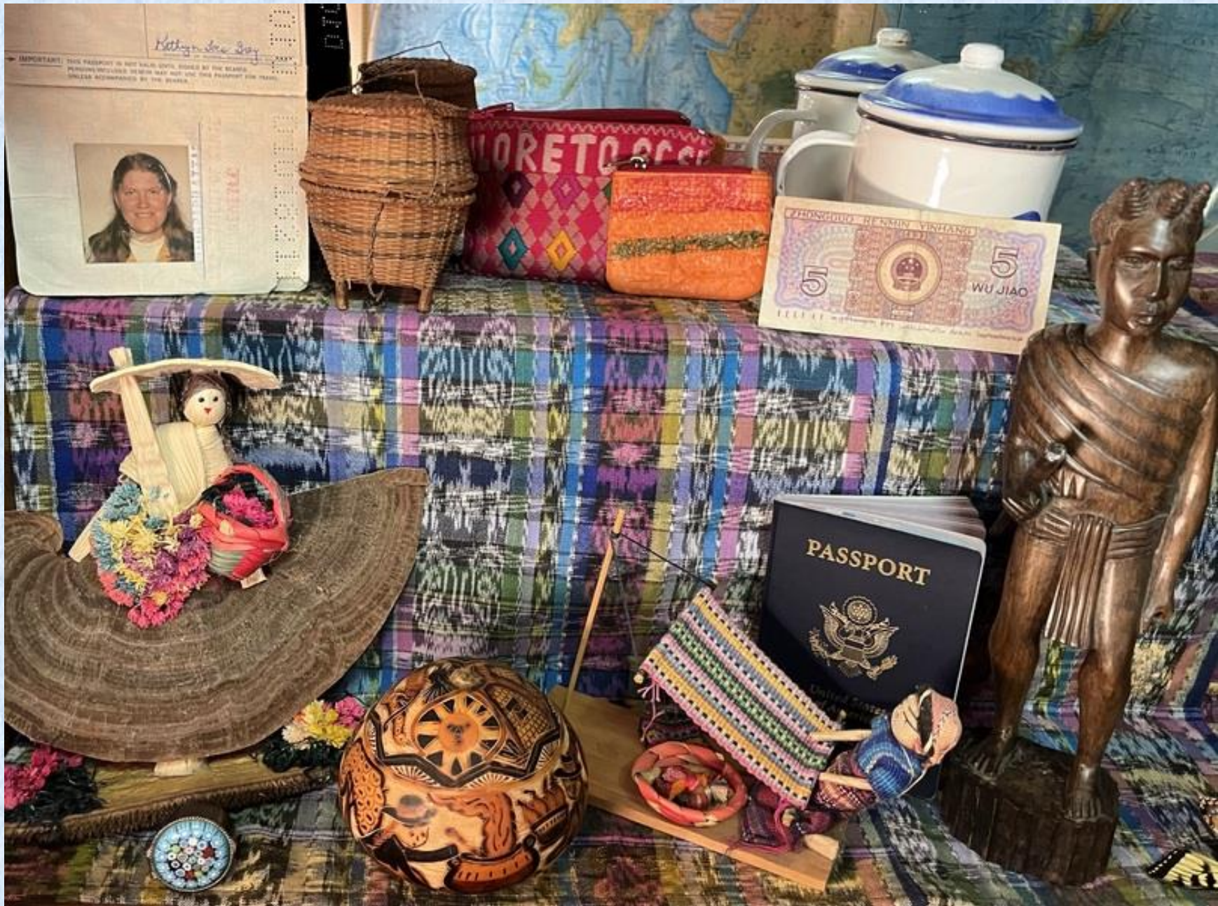
508-Kathy Dohner – A few travel mementos