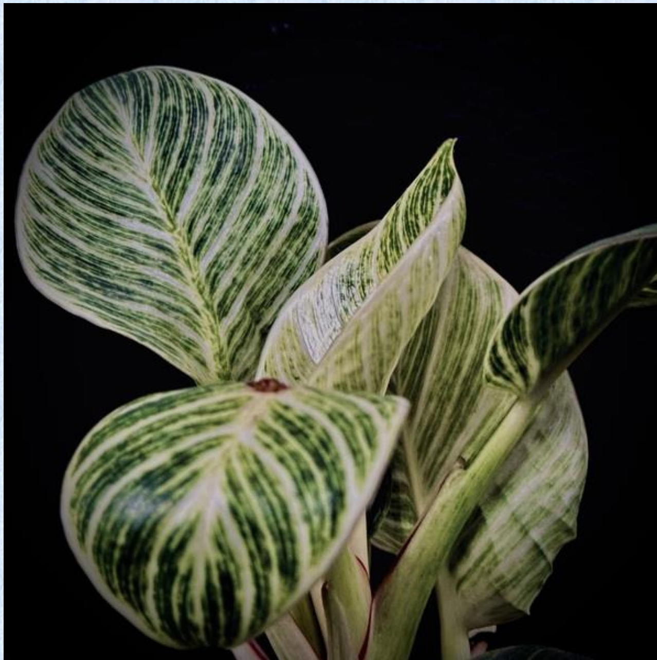
506-Paula – Beauty of Berkin