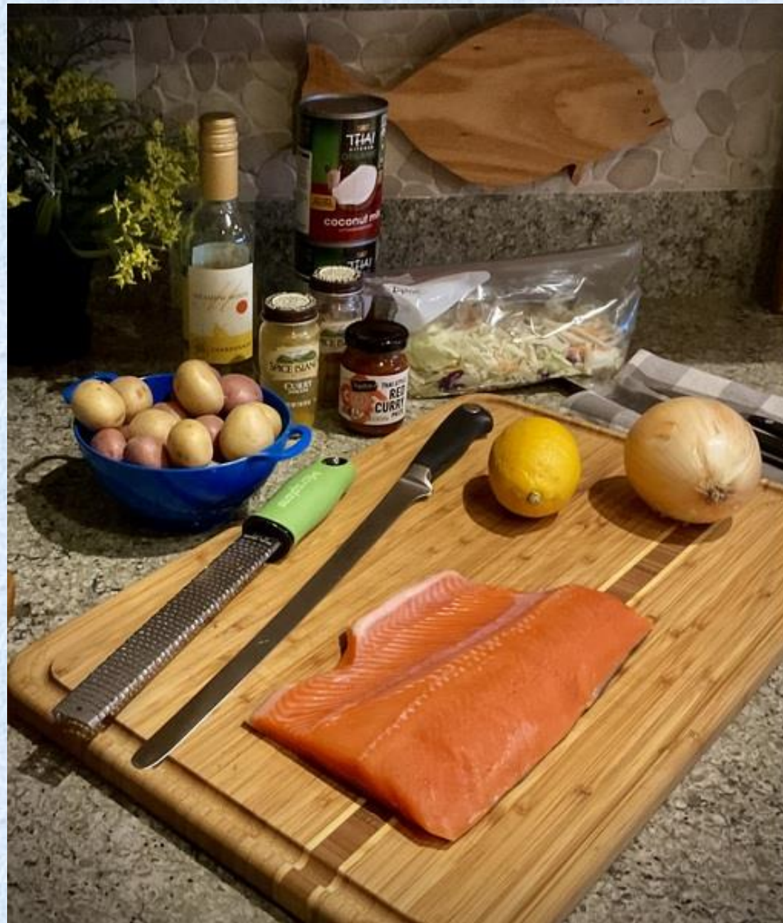
507-Susan Barrickman – Chef's Special Spicy Salmon Curry