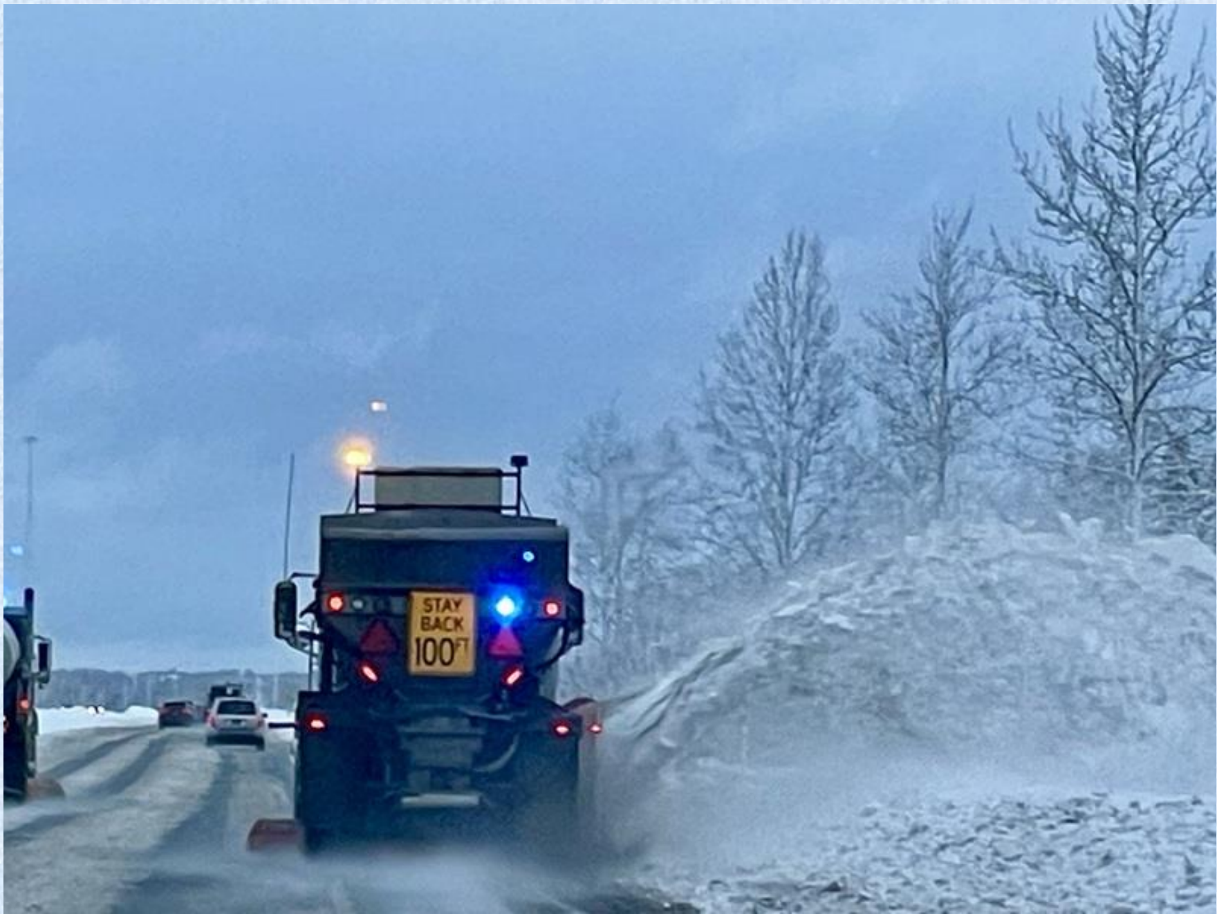
314-Elly Scott – A blue light we like!