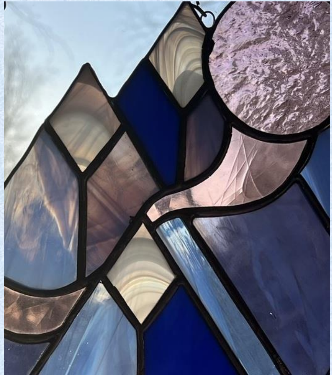
353-Kathy Dohner – Something blue