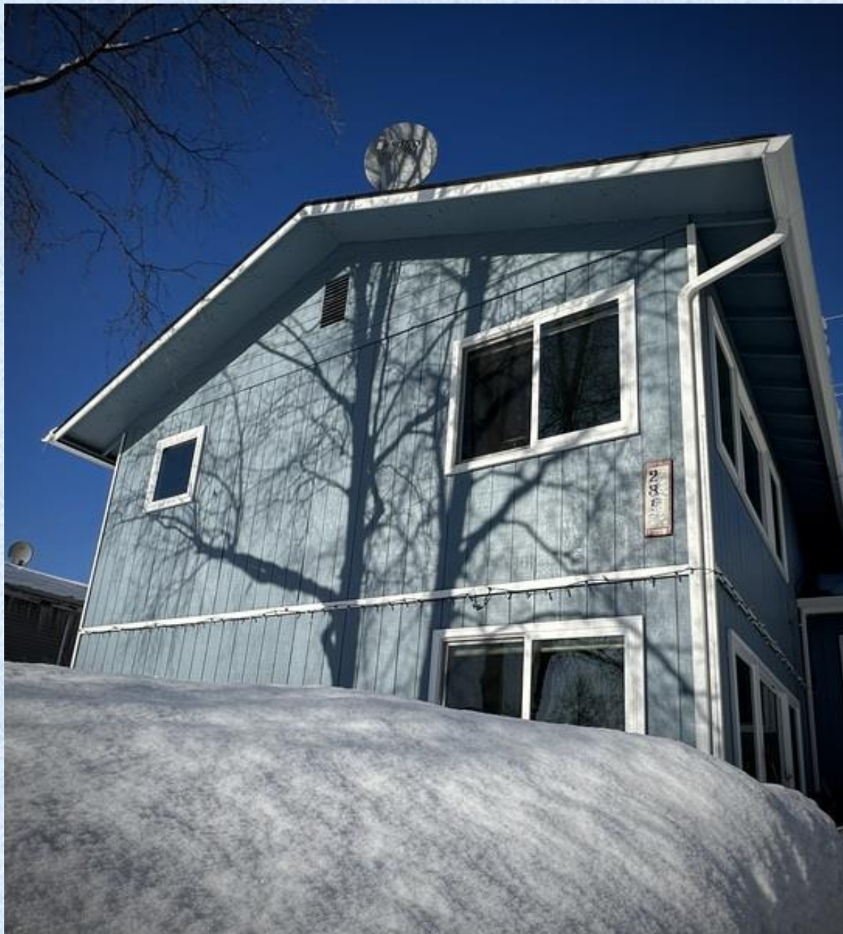
310-Paula – Tree Art on Blue Canvas