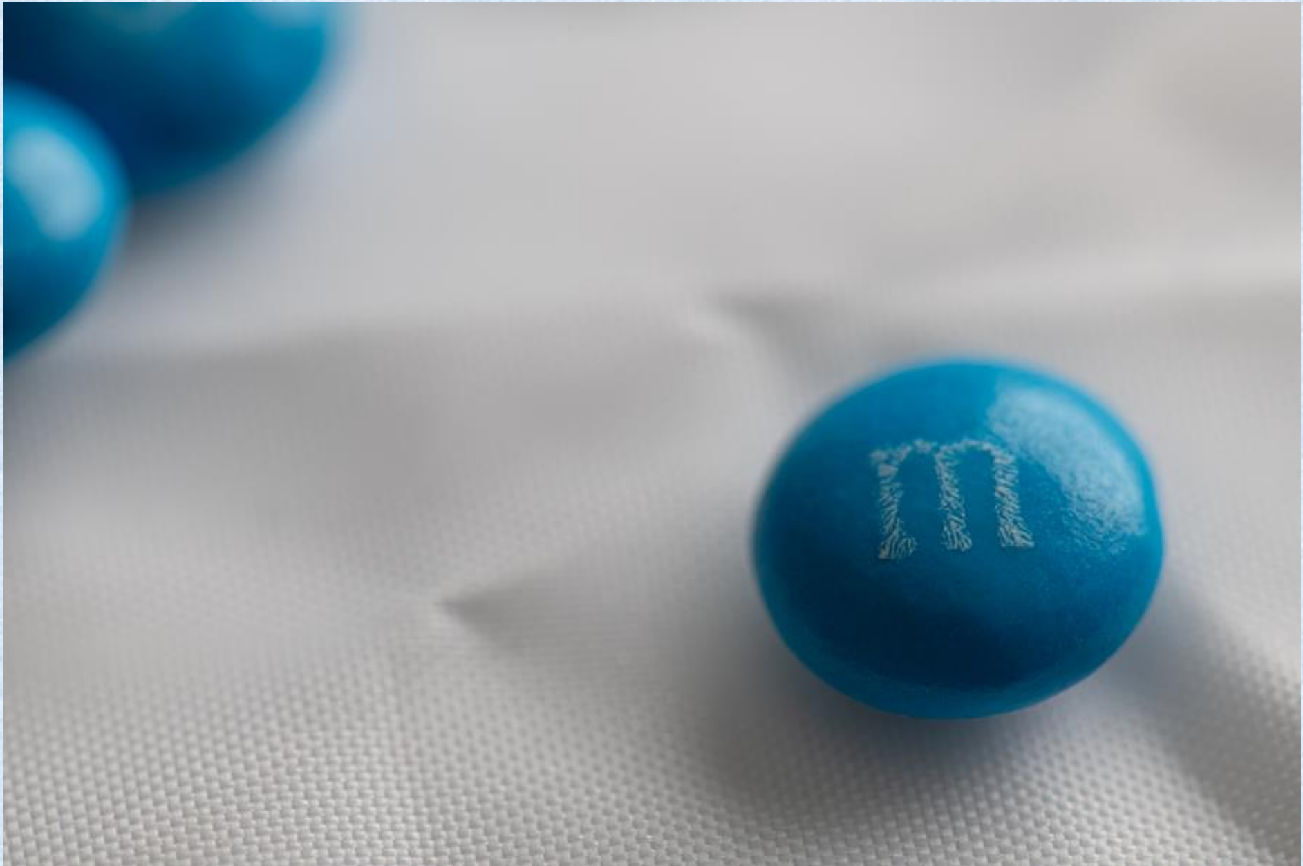
301-Ron Hoggard – Blue Yum