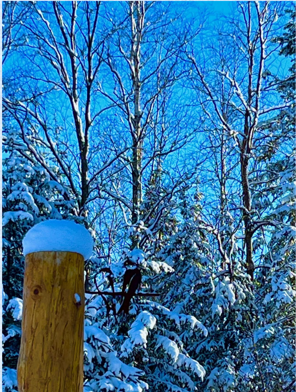
312-Barbara – Bare trees and two birds