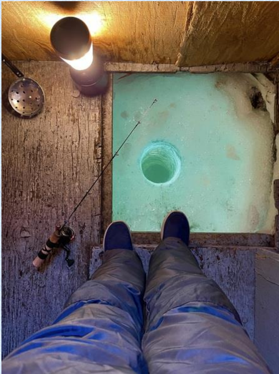
351-Lorna Young – Blue Ice & Boots