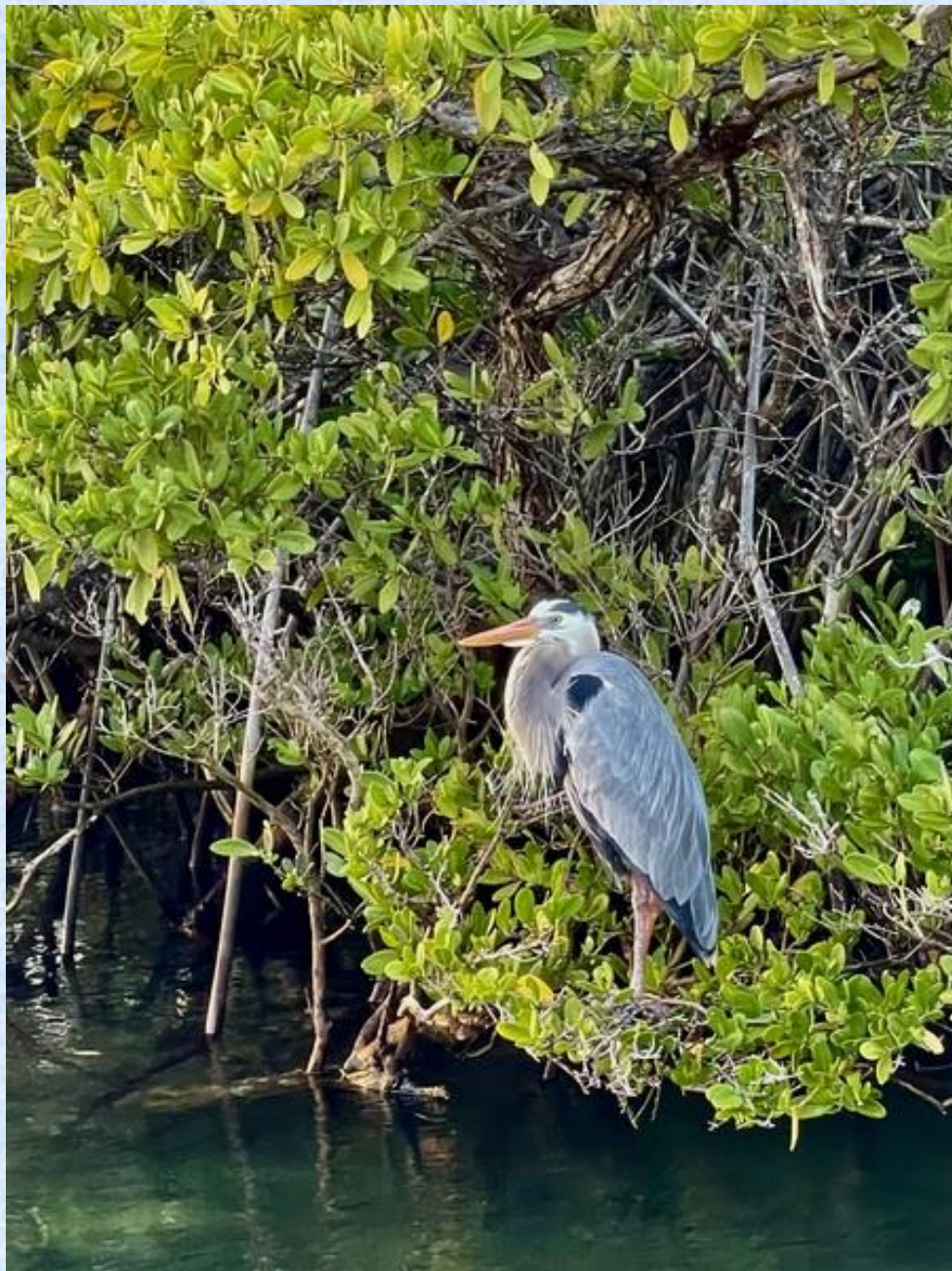
357-Susan Barrickman – Great Blue Heron (Galapagos)