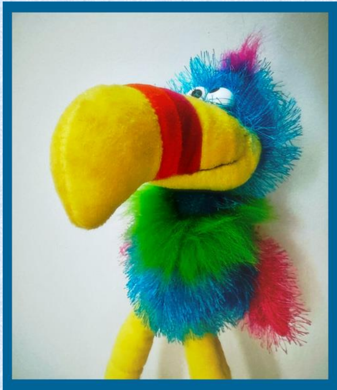
352-Sandra Knight – Blue too