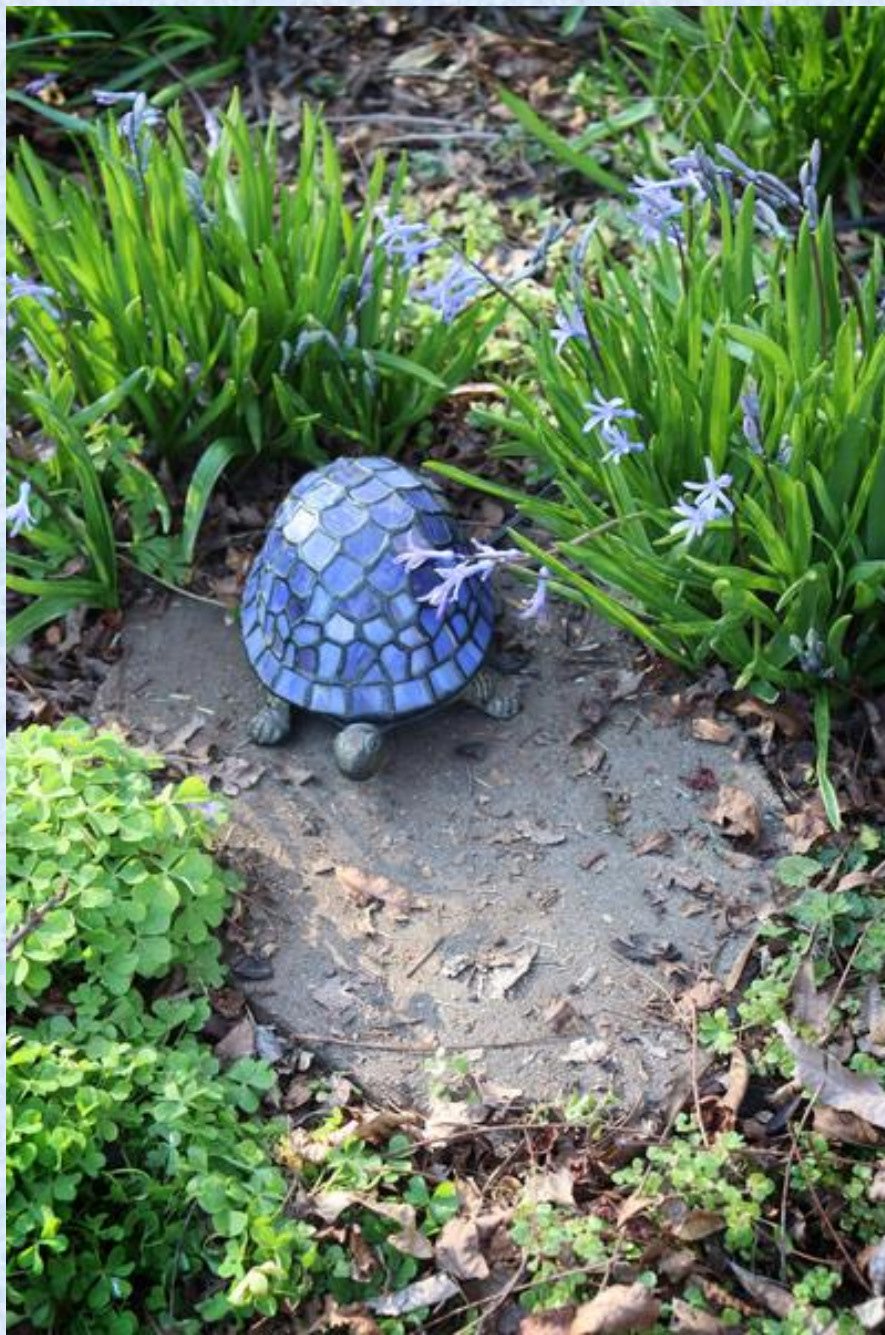
311-Carol Renfro – Blue turtle venturing down the path