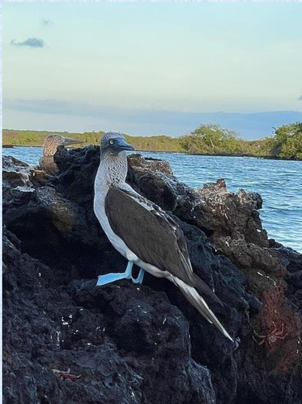
313-Susan Barrickman – Blue Footed Boobie (Galapagos)