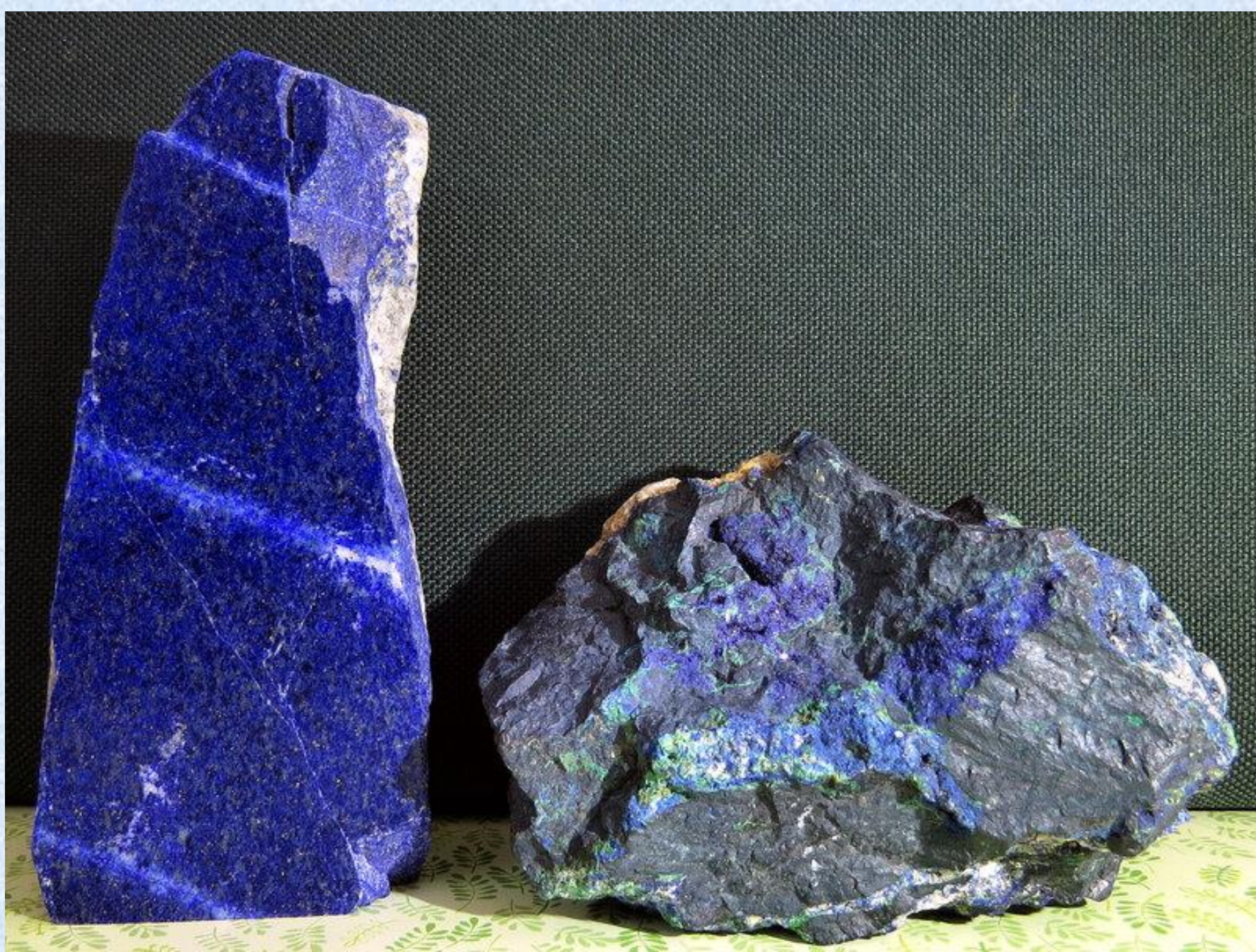
304-Bob Estey – Blue minerals