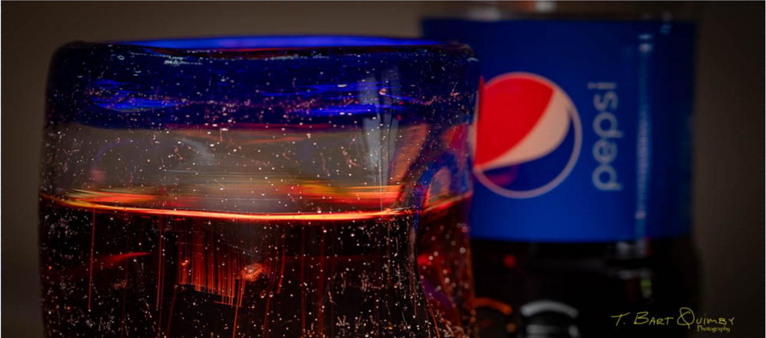
320-Bart Quimby – Good Stuff