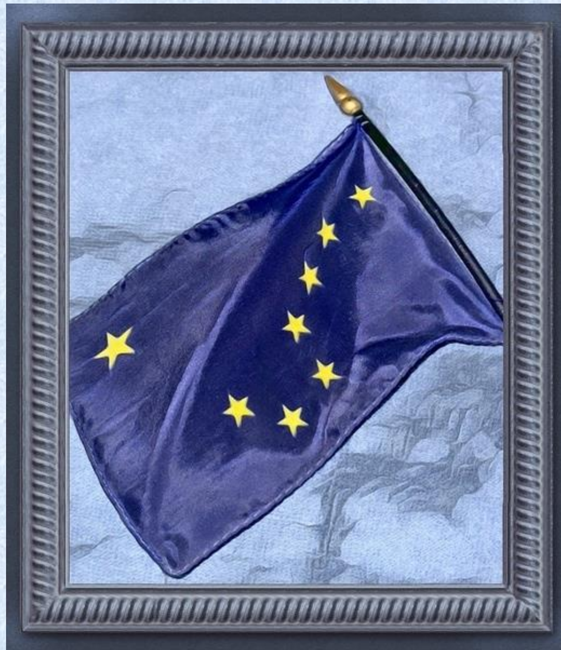
303-Sandra Knight – Blue