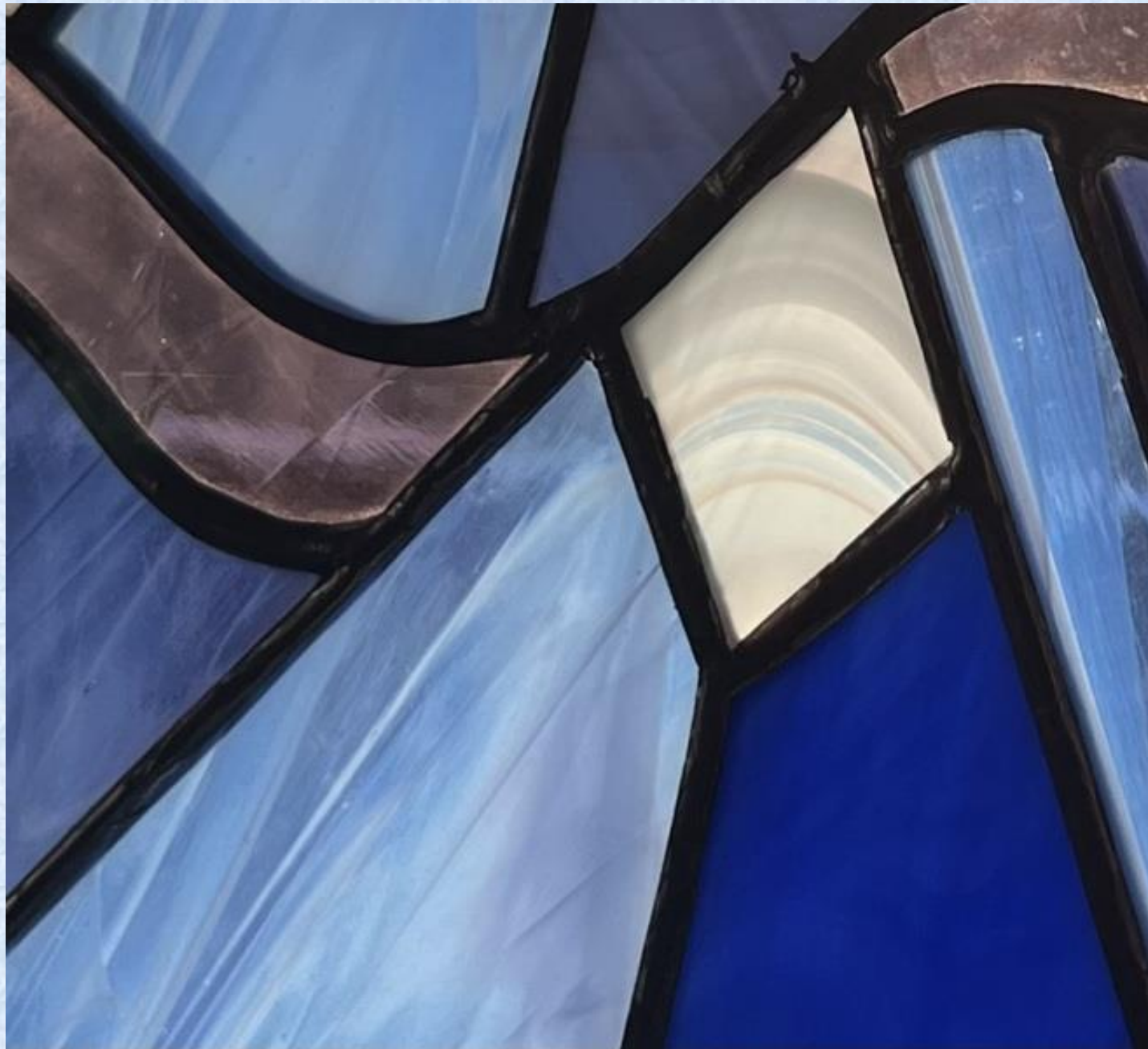
306-Kathy Dohner – Something blue