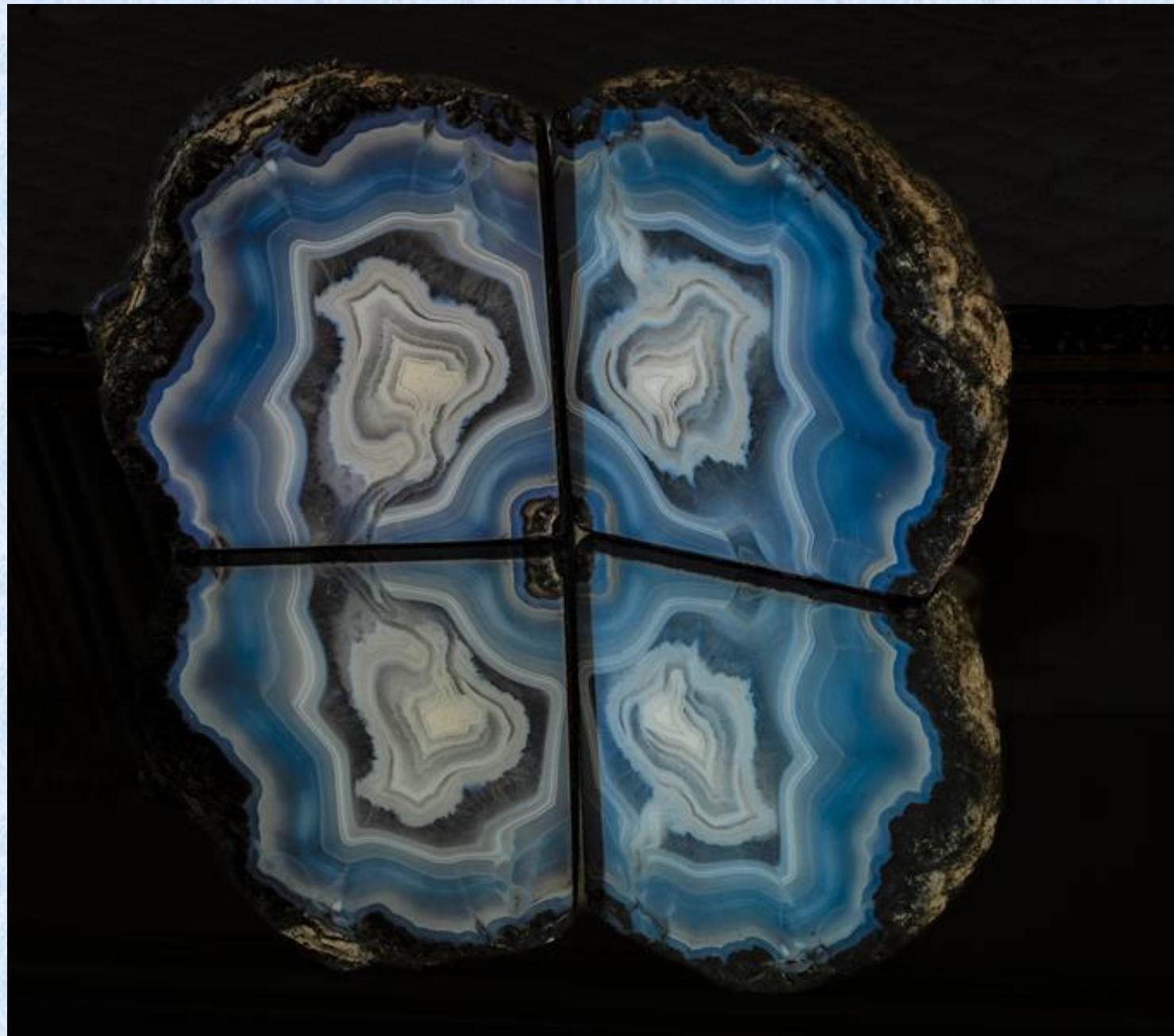
305-Karen Cole-Loy – Reflections of Geodes