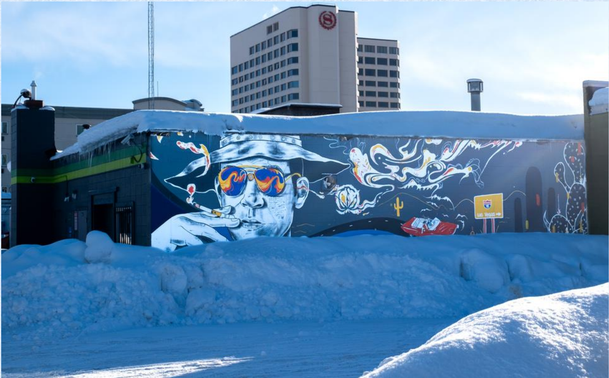
309-Doug Poage – Fear and Loathing in an alley off of 4th