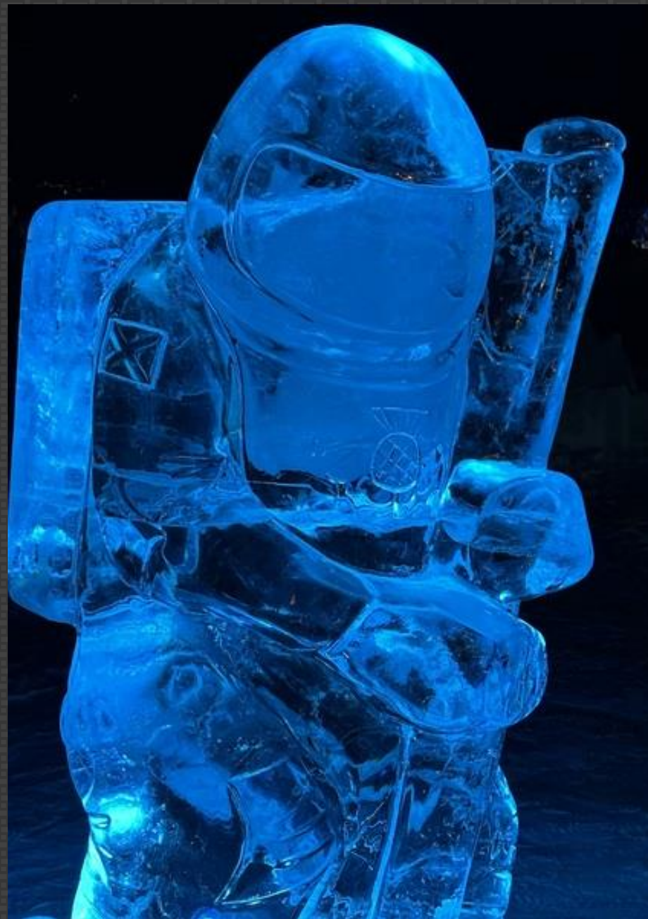
316-Dan Cryer - Man on the moon