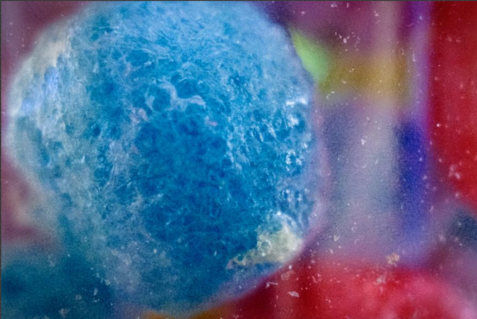
308-Mark E – Blue