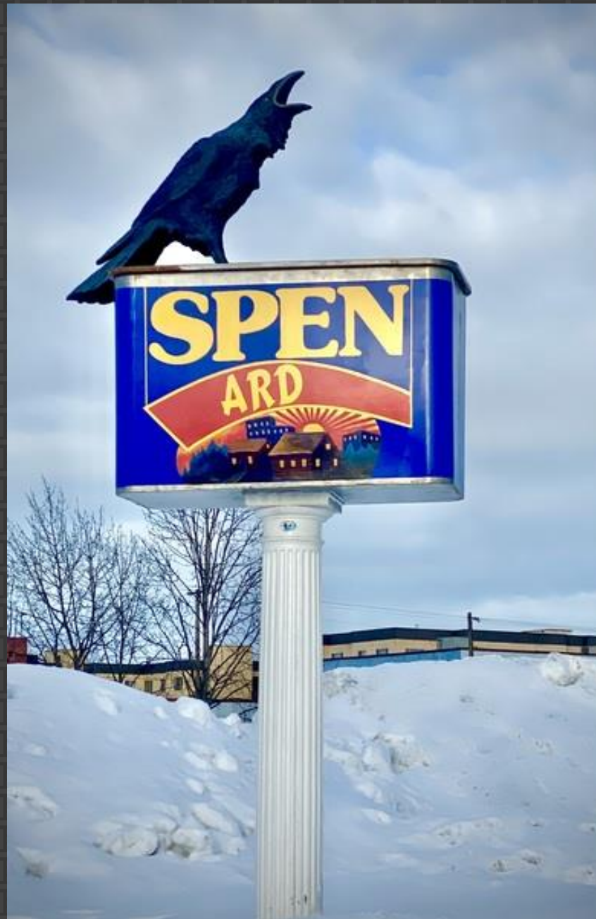
307-Shirley – Welcome to Spenard!