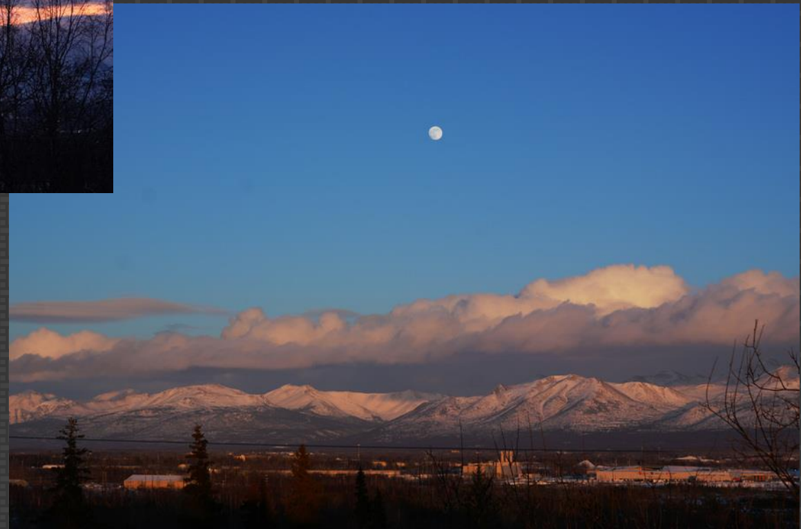
351-ADW – Blue