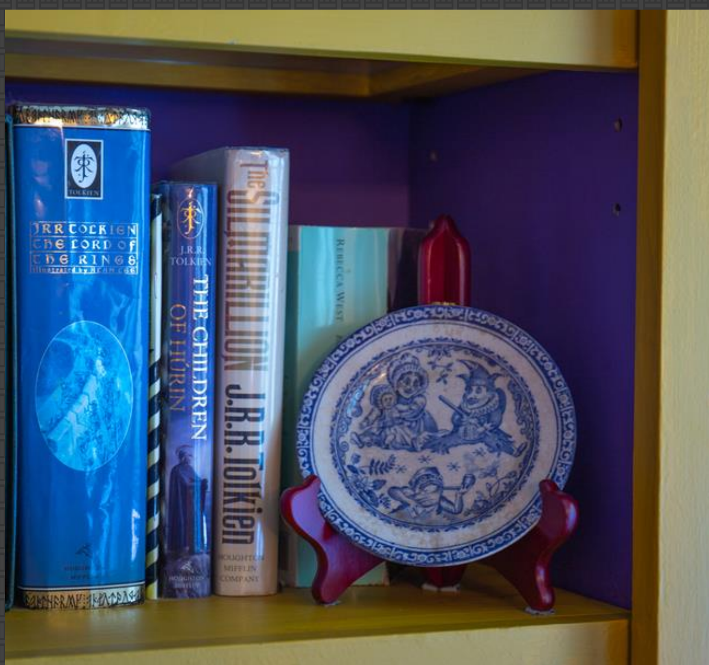
317-Chuck Iliff – Shades of Blue