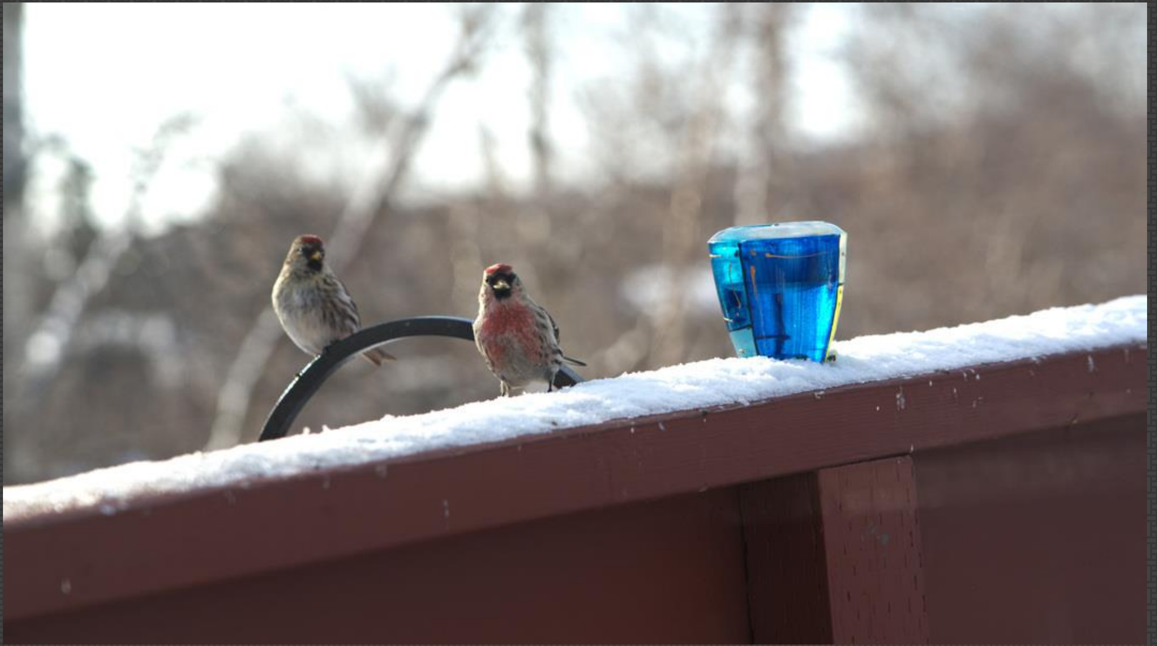
304-ADW – Redpole Blue Candle