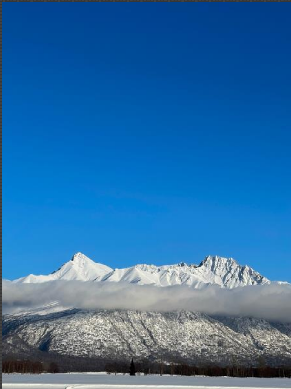
359-Chuck Iliff – Shades of Blue