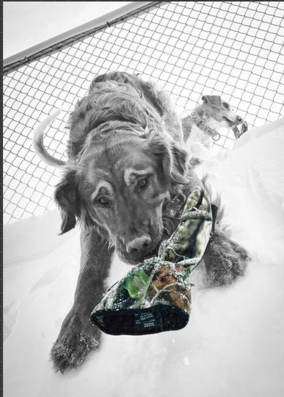
459-Jim Cantor – Domestic B