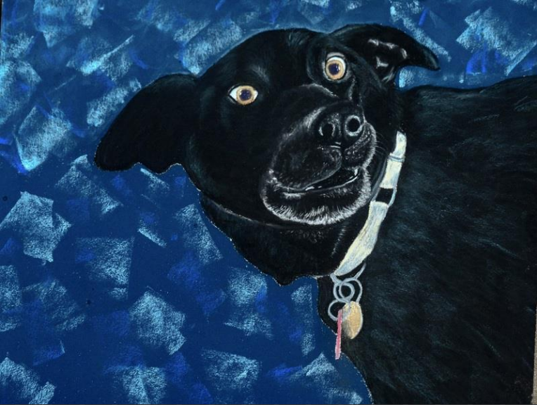
457-marty – timber