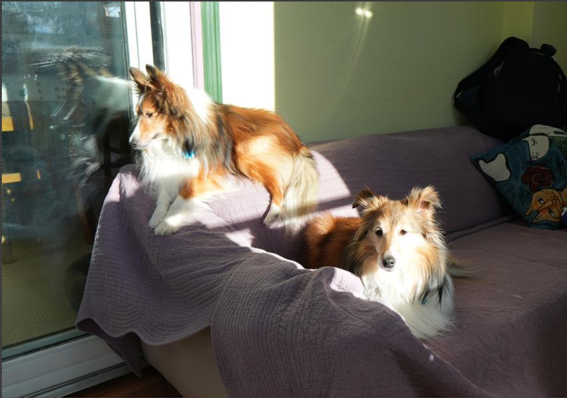
404-ADW Sunny Days