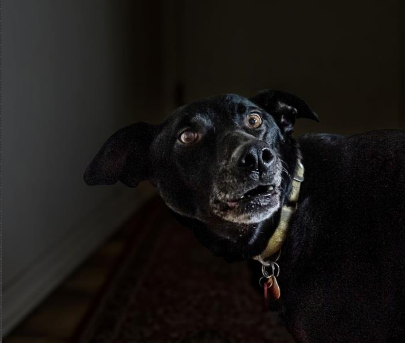
407-marty – turbo in gray