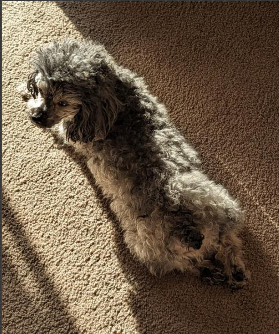
461 -M Pratt – Vera2