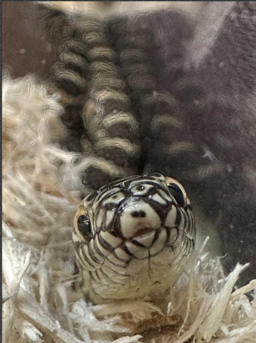
462-Dan Cryer – Please adopt me