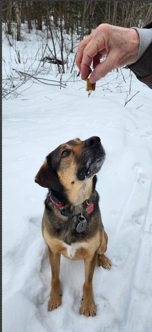
416-Sandy Quimby – Anticipation