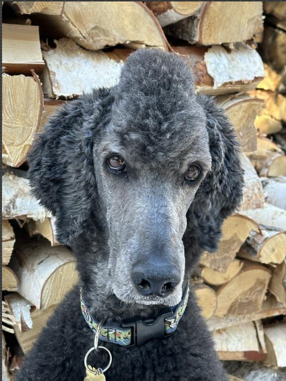
413-Dan Cryer – Our dog Carbone