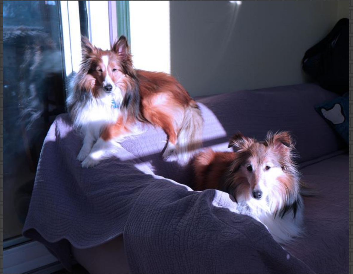
453-ADW – Resting In the light