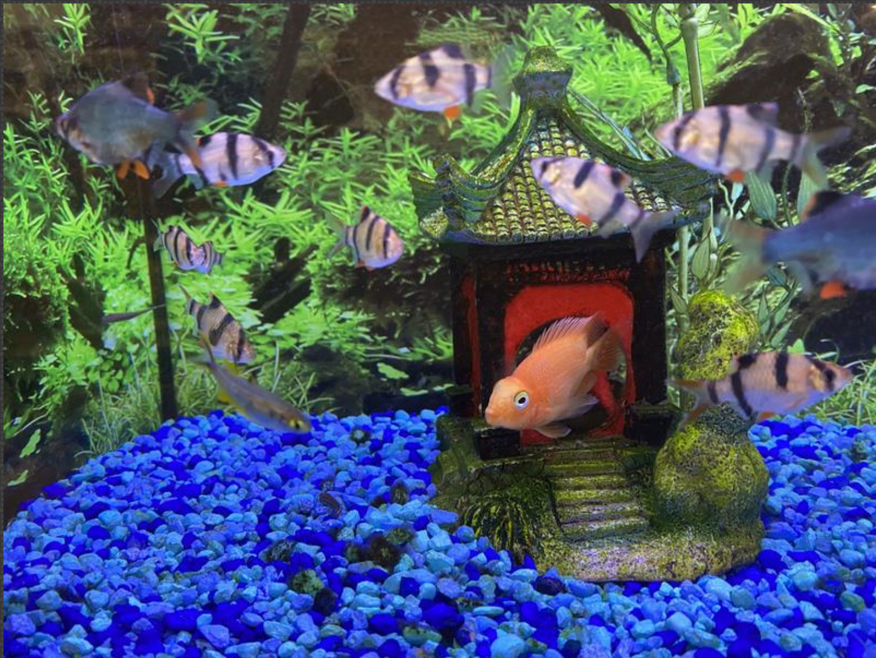
403-Jeanie Cole – king of the CASTLE