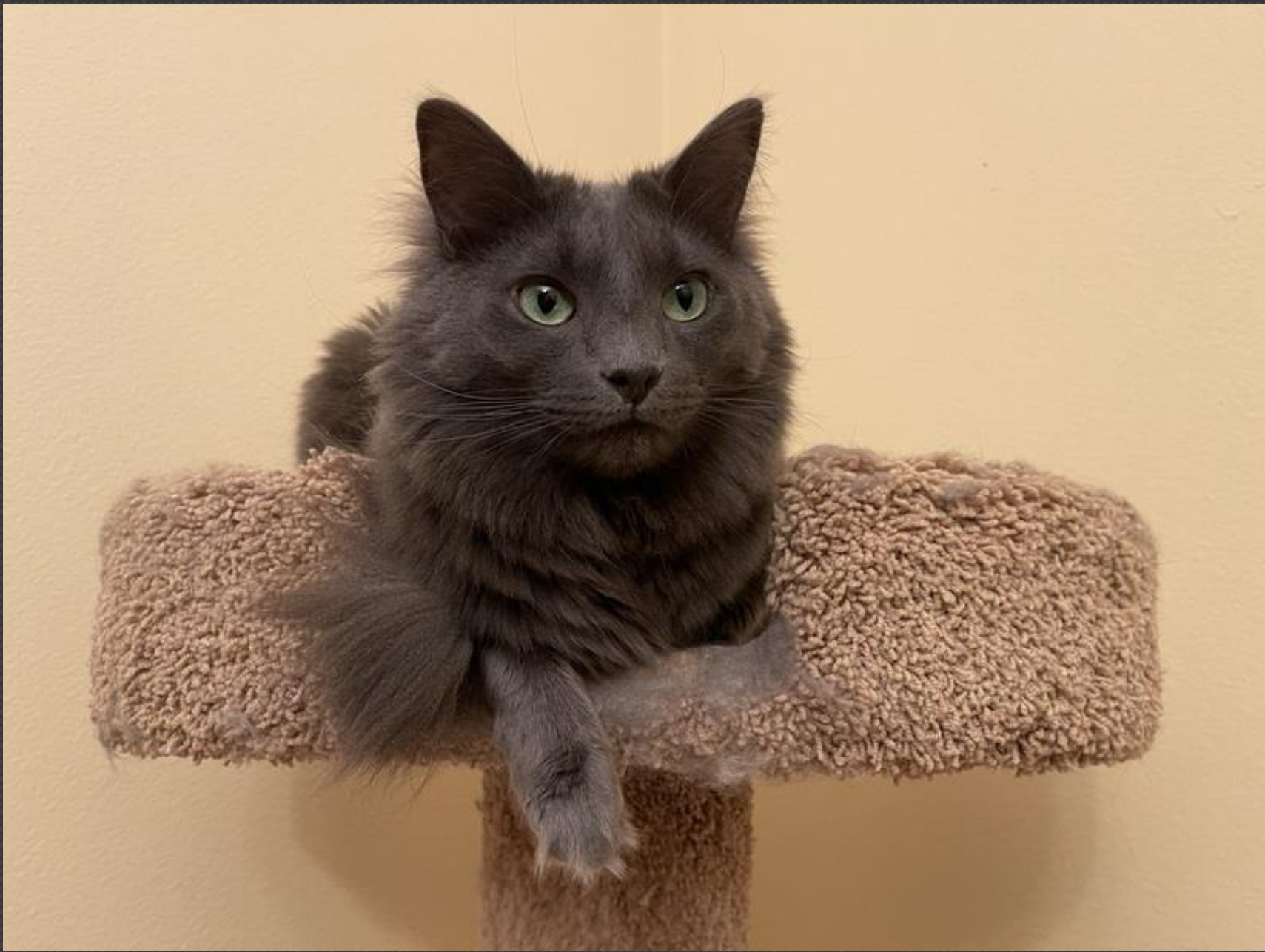
409-Chuck Iliff – Dwight