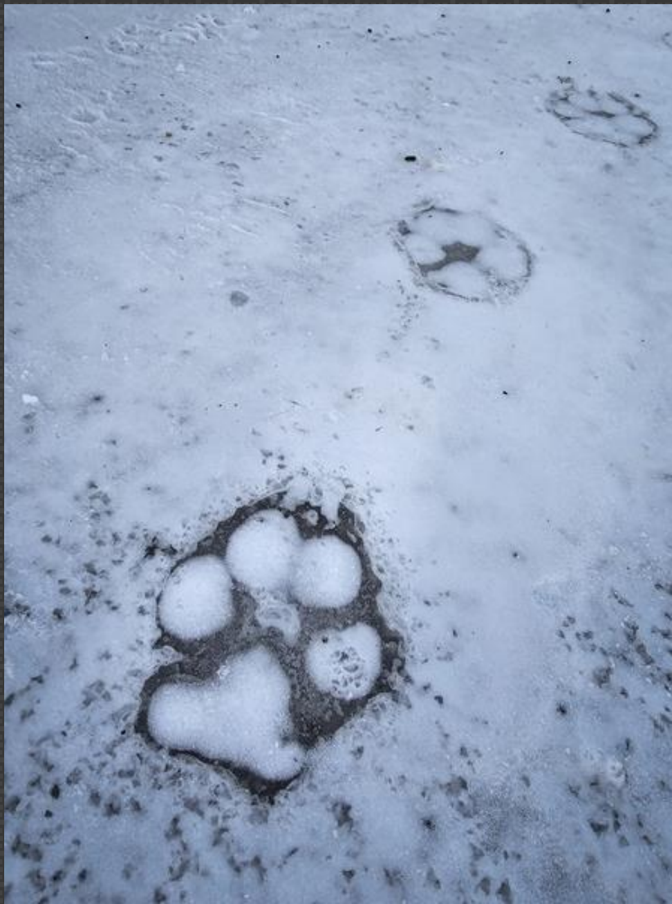
410-Jim Cantor – Domestic