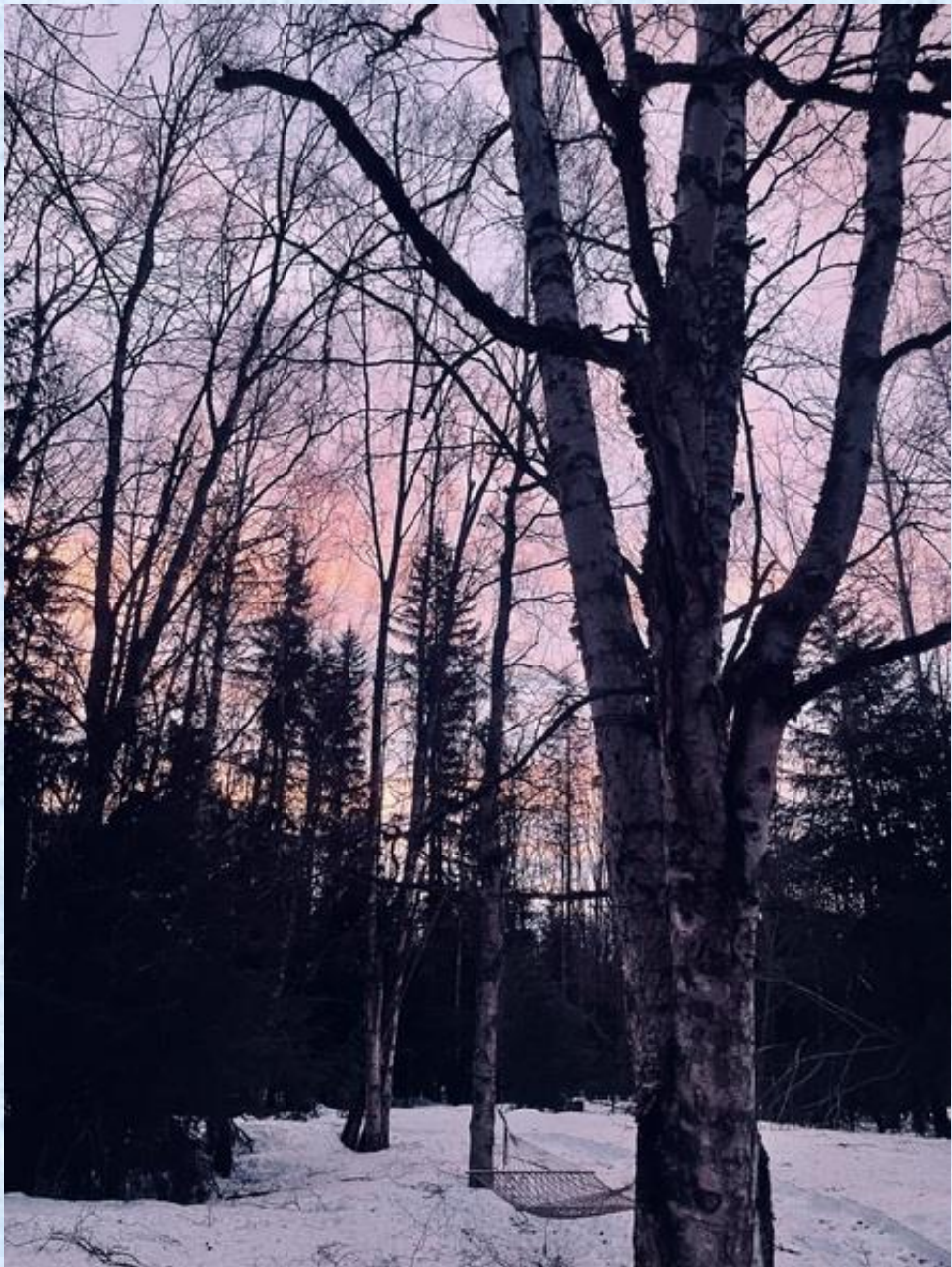
217-Elly Scott winter sun welcoming , winter Sunday departed