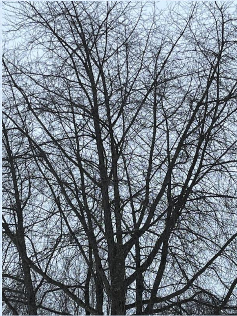
211-Barbara - (Bare Tree)