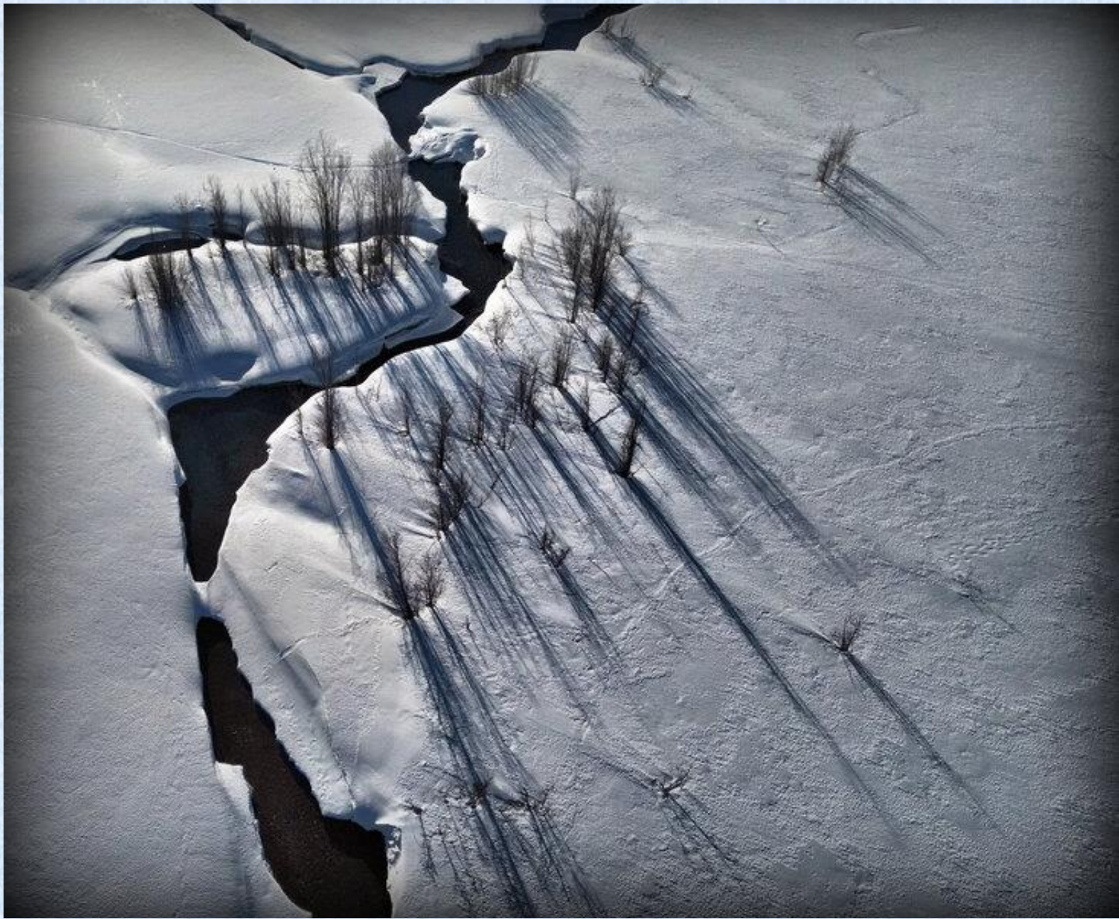
214-Bob Estey – shadows & tecture