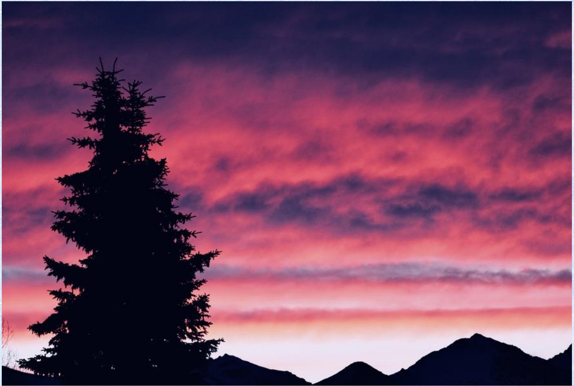
215-Ted Eischeid – Light Returns