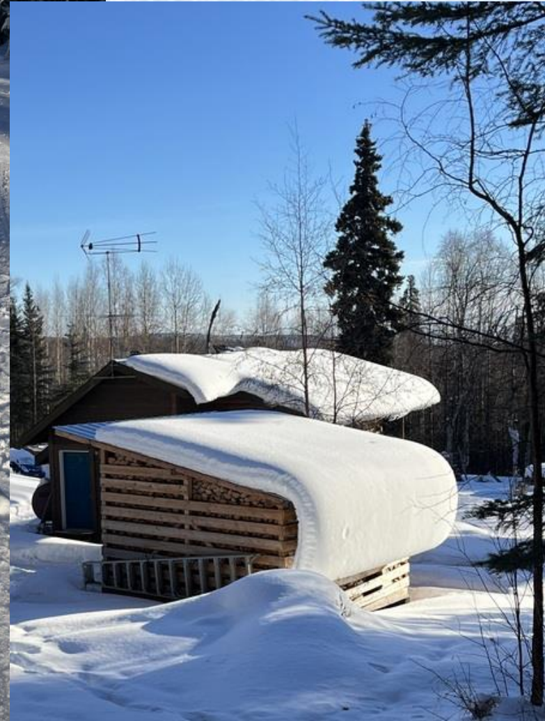
251-Kathy Dohner – winter scene