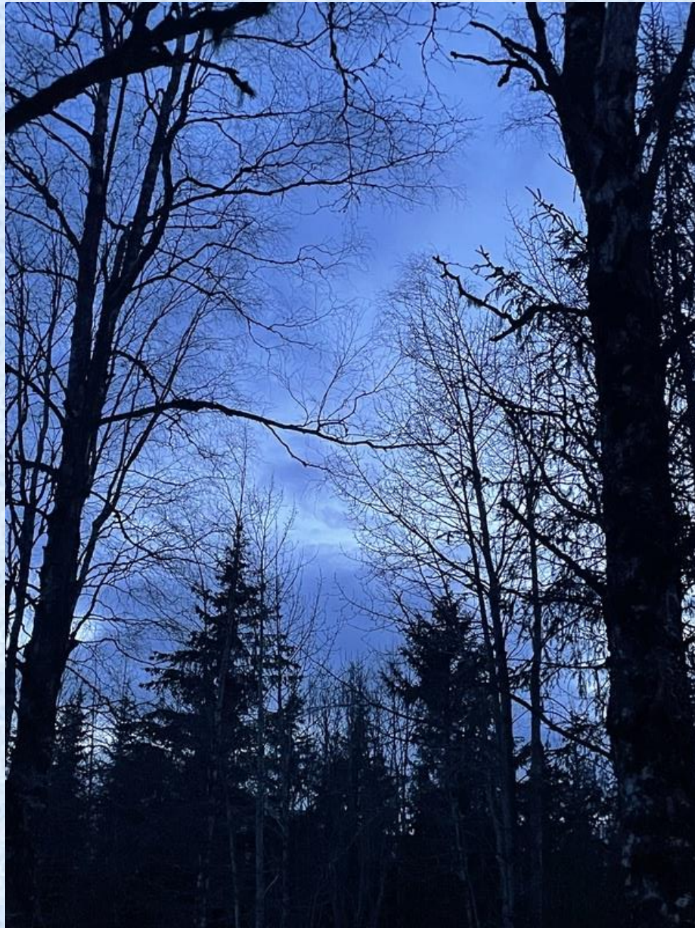
256-Elly Scott winter sun welcoming , winter Sunday departed