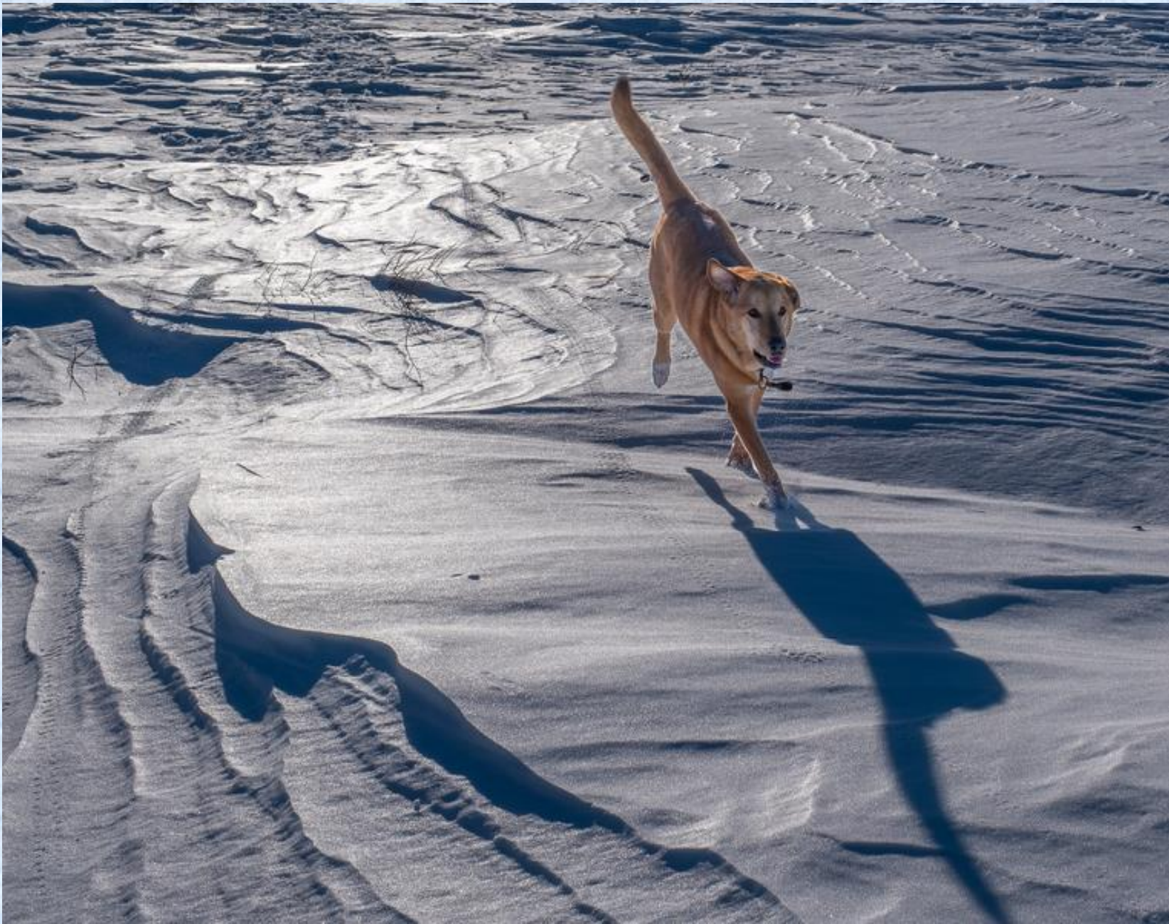
206-Doug Poage – patricks dog