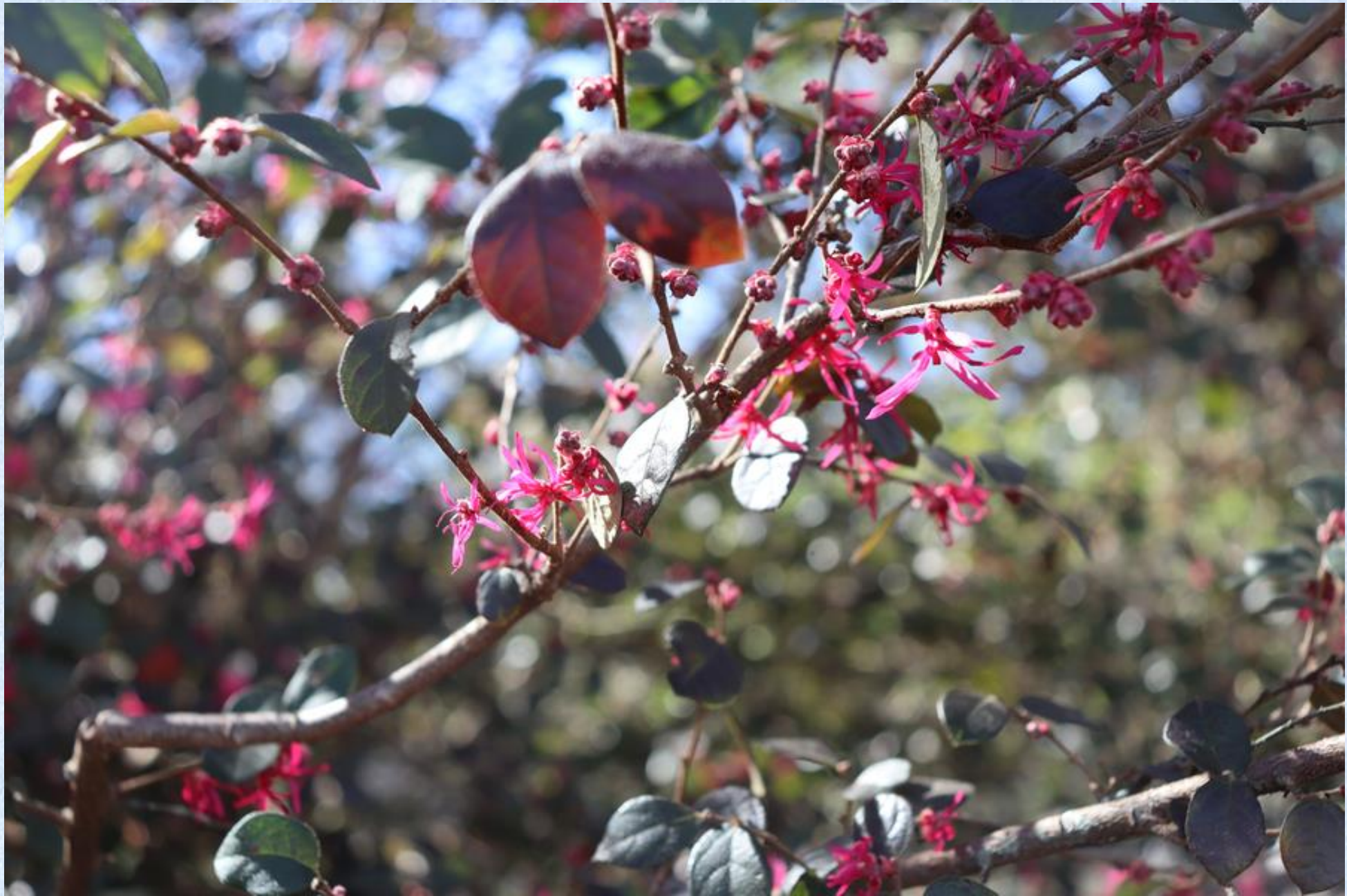
209-Carol Renfro – Magenta loropetalum blossoms