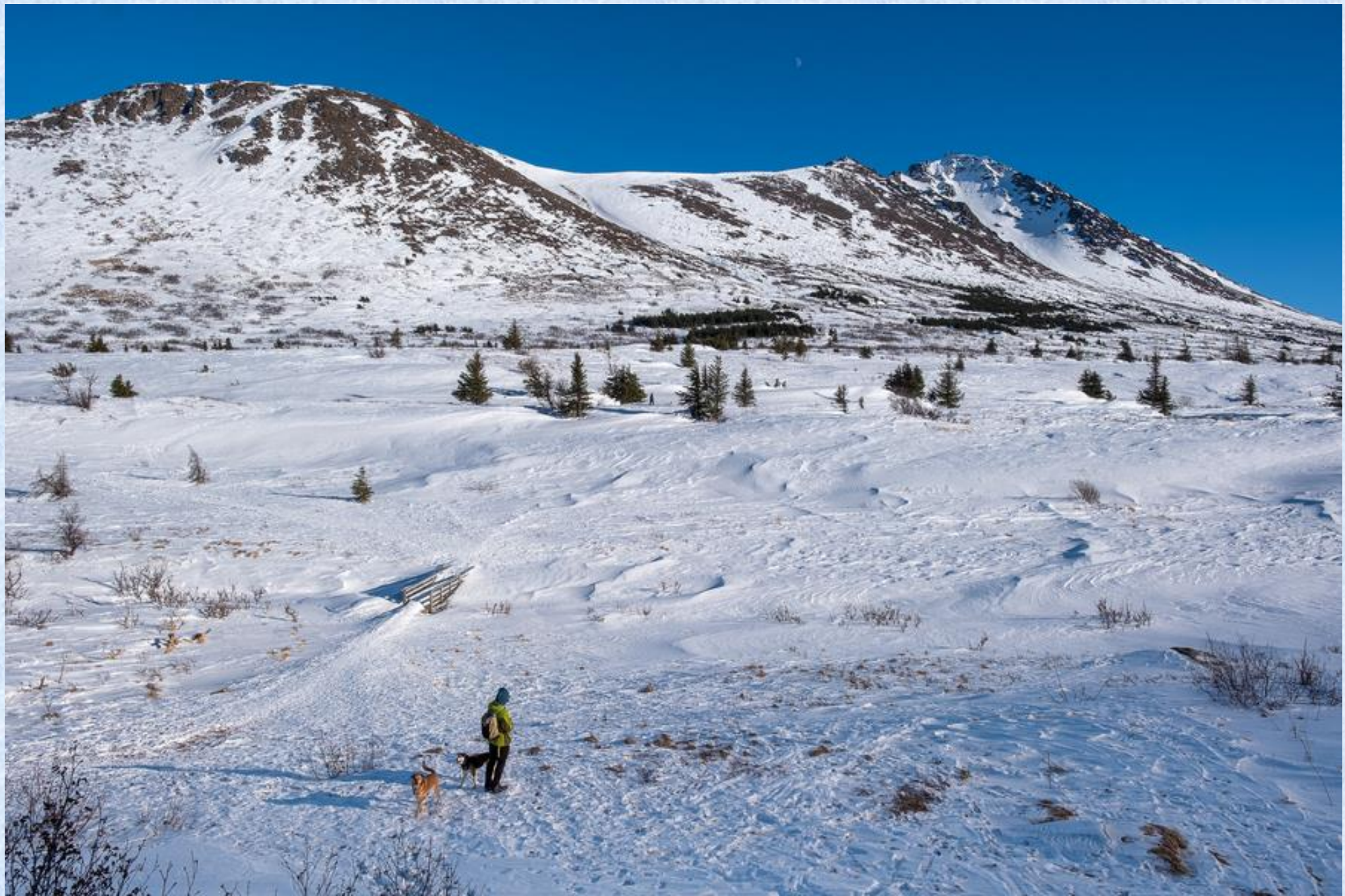
254-Doug Poage – omally access bridge