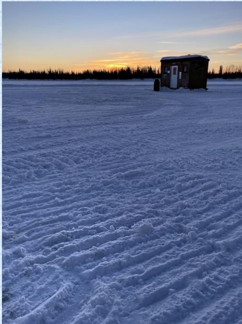
205-Lorna Young – Chena Lake Ice House