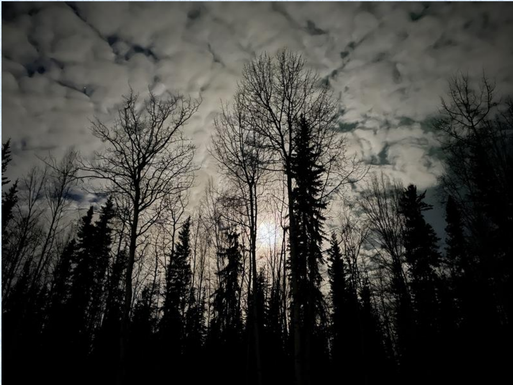
252-Lorna Young – Winter Moon