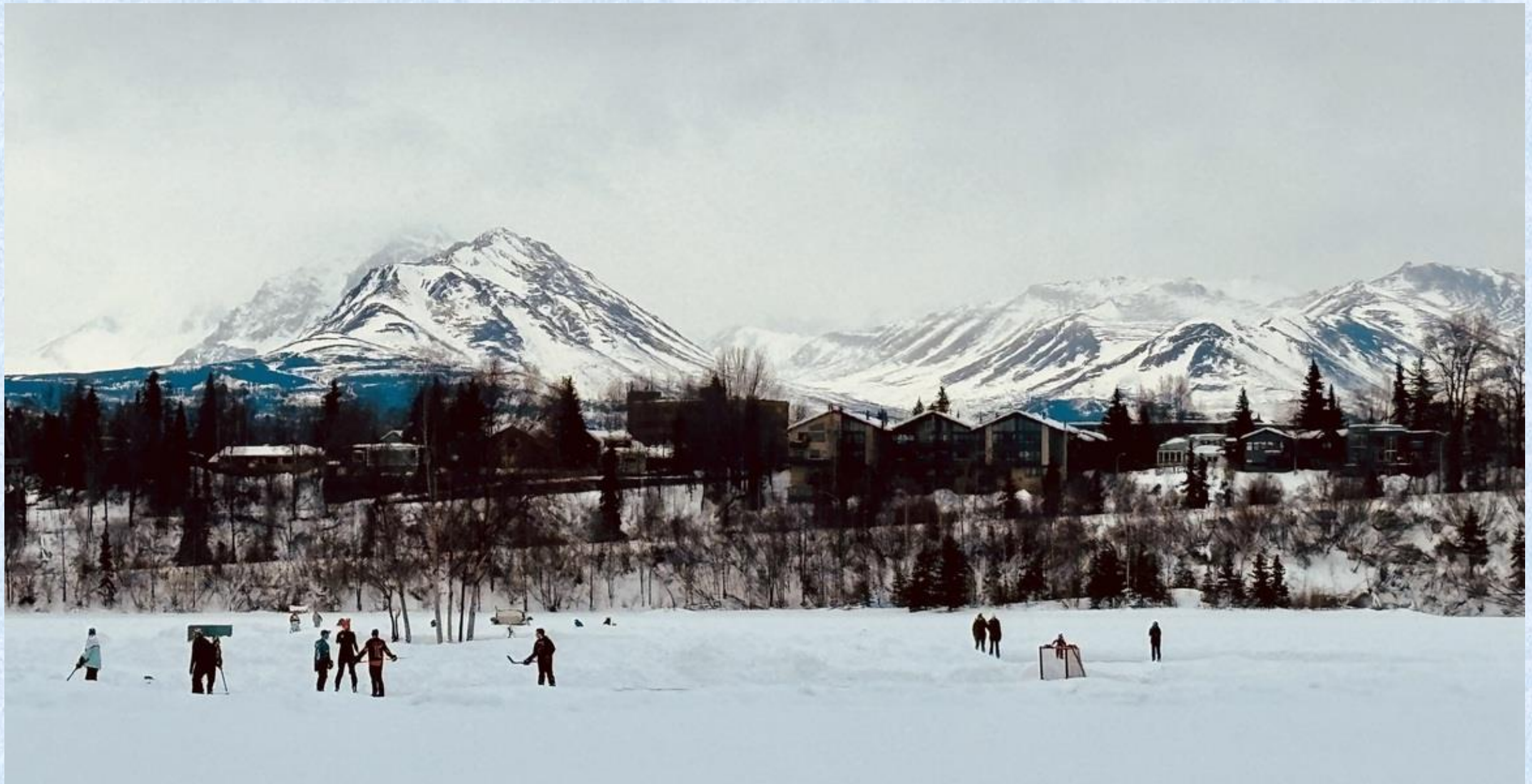
208-Claudia Wallingford – Westchester lagoon