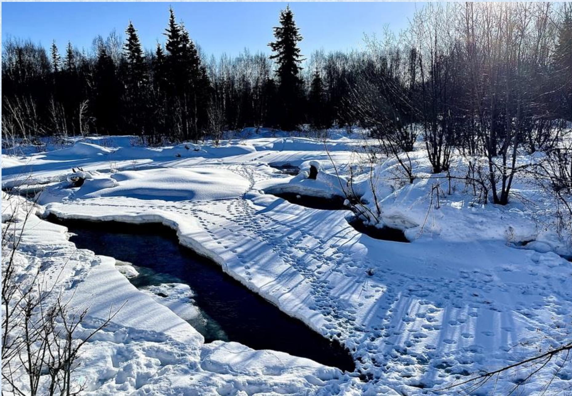
207-Susan Barrickman – The Fox Highway