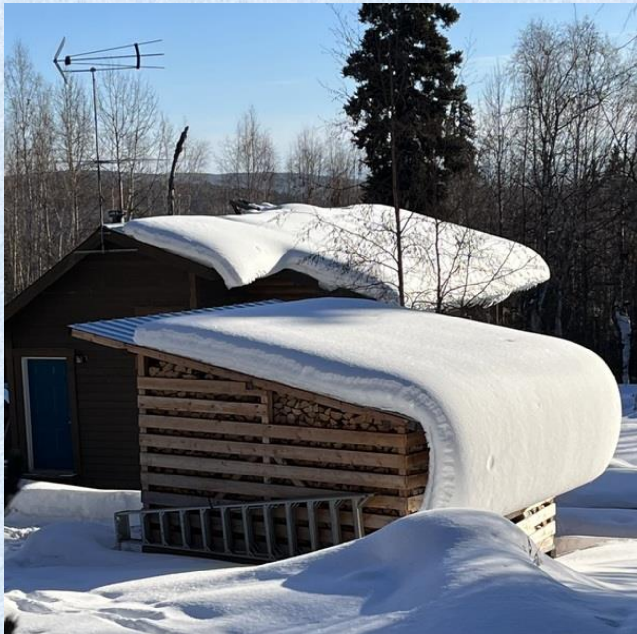
203-Kathy Dohner - Tensile strength of snow