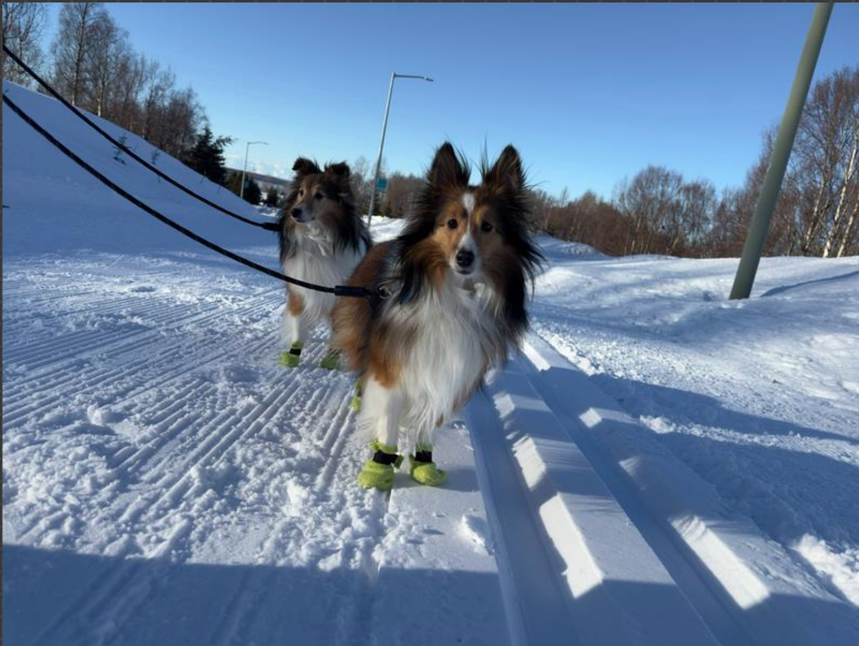
203-ADW - Winter Walk with Shellies-After light Image