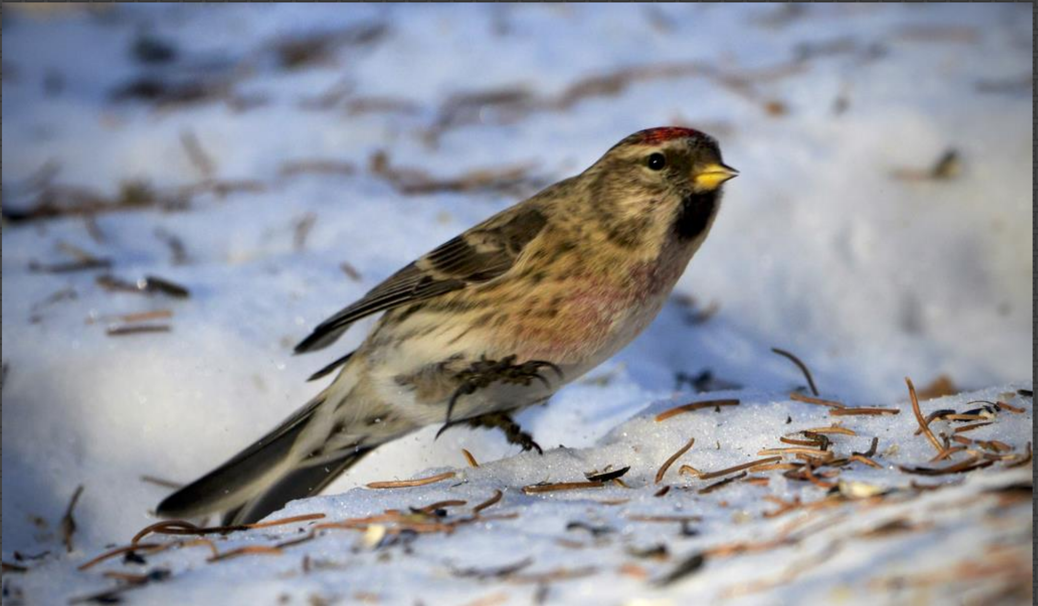
209-Jeanie Cole - Redpoll