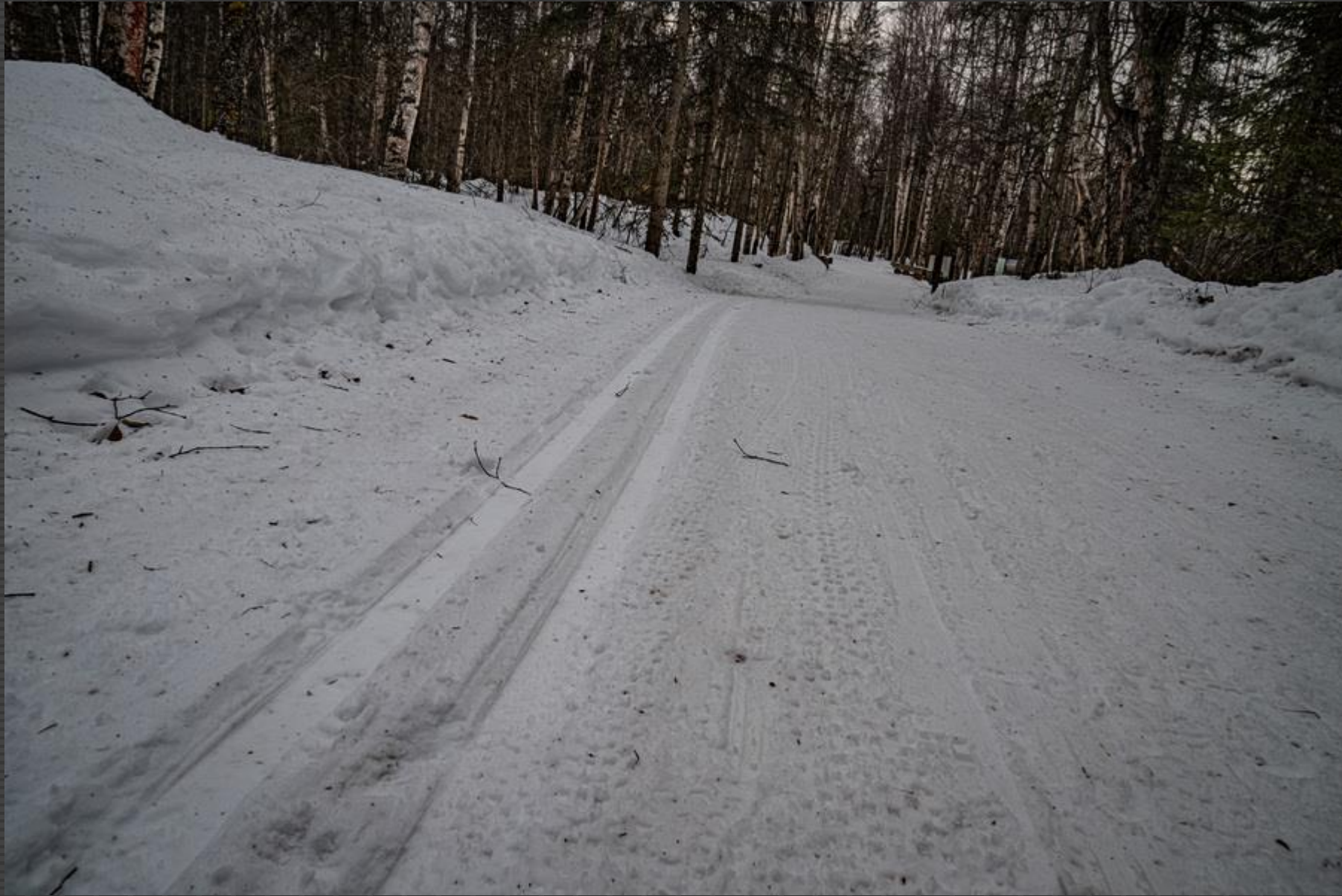
256-Bill Cole - Ski-Tracks!