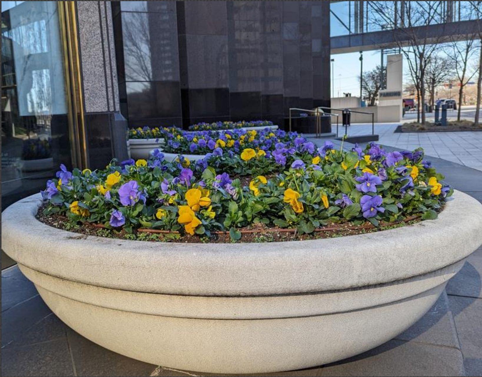
254-M Pratt – Dallas Flowers