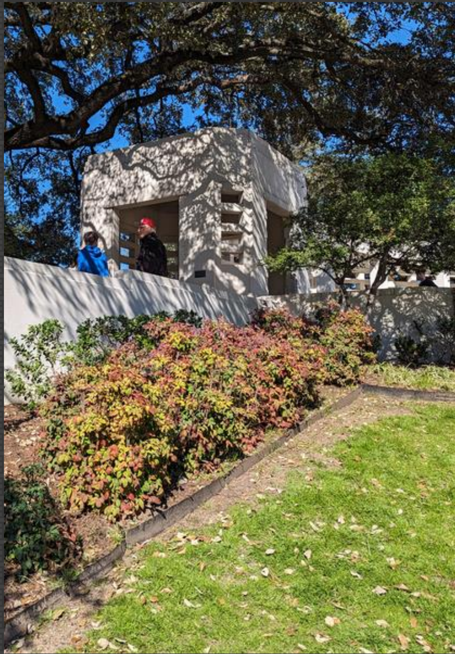
210-M Pratt – JFK Mem Green Grass