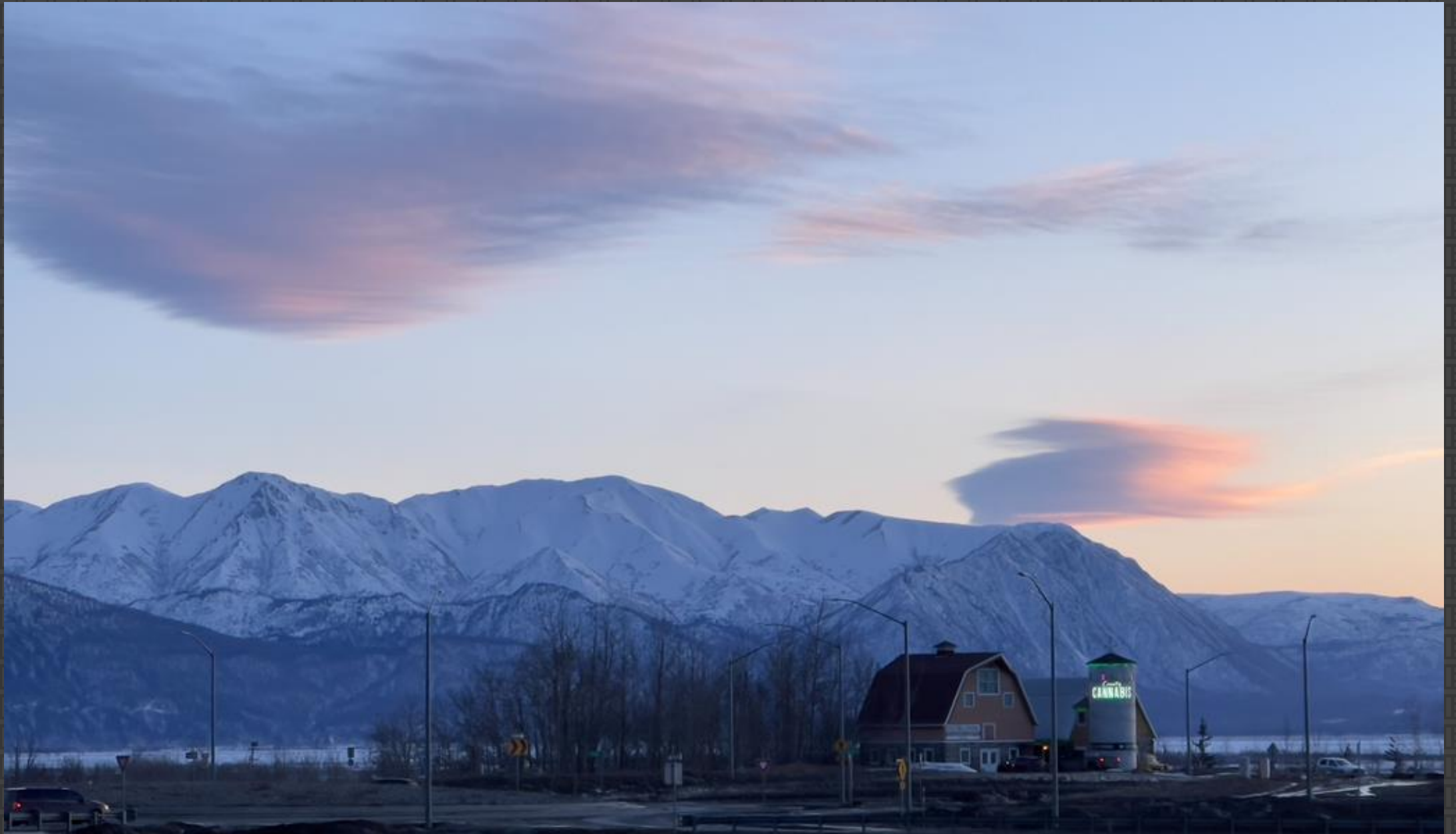
251-Chuck Iliff - Blue-Hour – Matanuska old & new