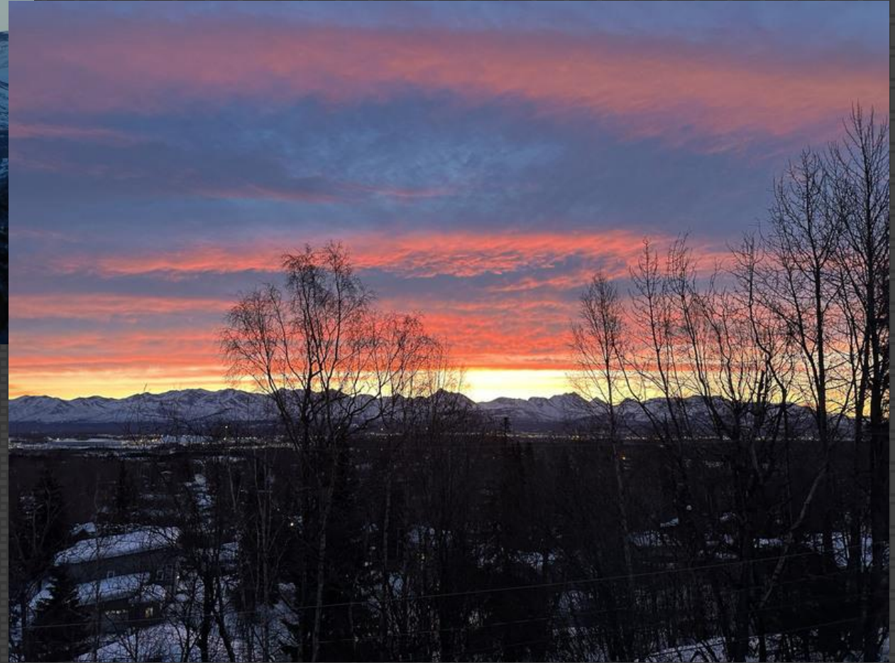
252-ADW - Walk - evening sunset, morning sunrise