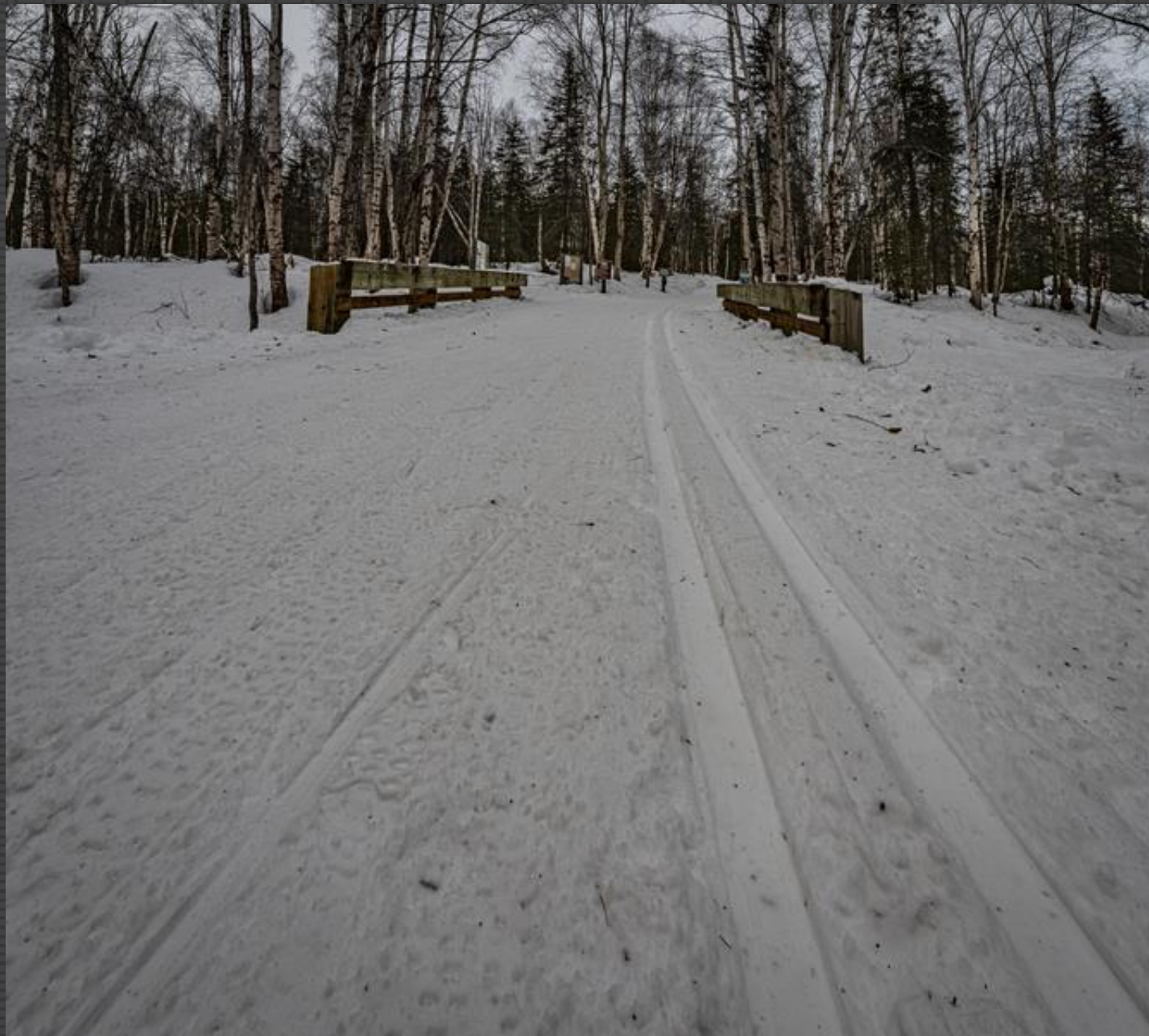
215-Bill Cole - Ski-Tracks!