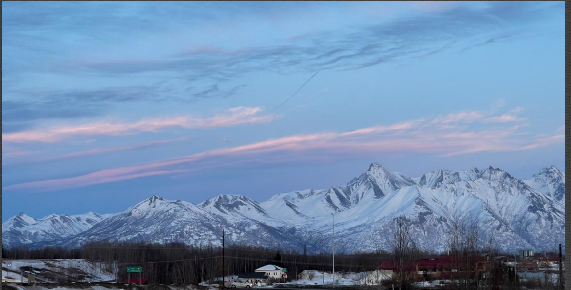
202-Chuck Iliff – Blue Hour