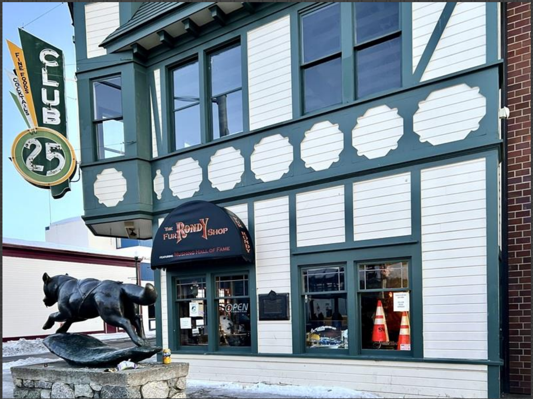
204-Janine Forrest – Fur Rondy