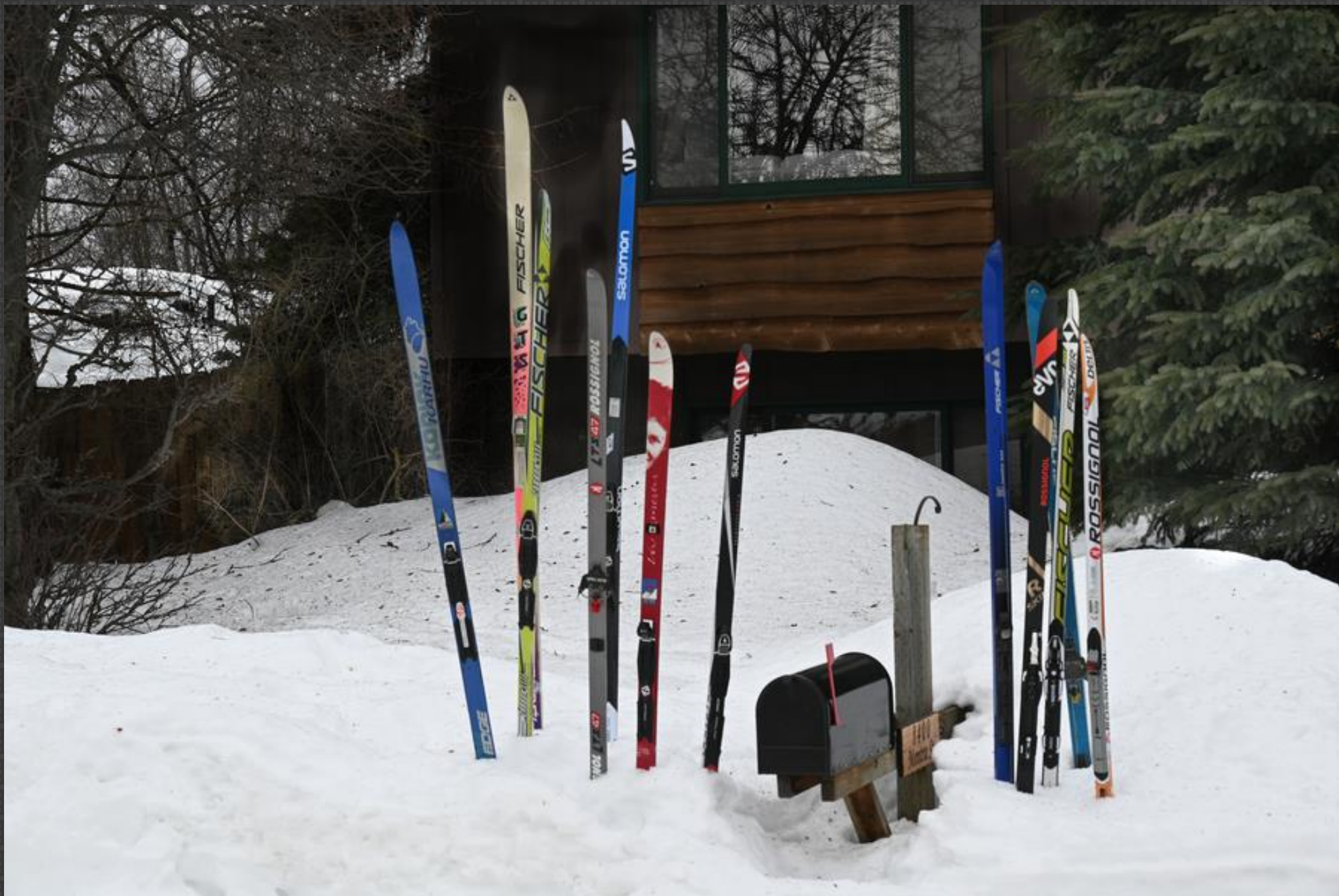
205-marty – skies and more skies