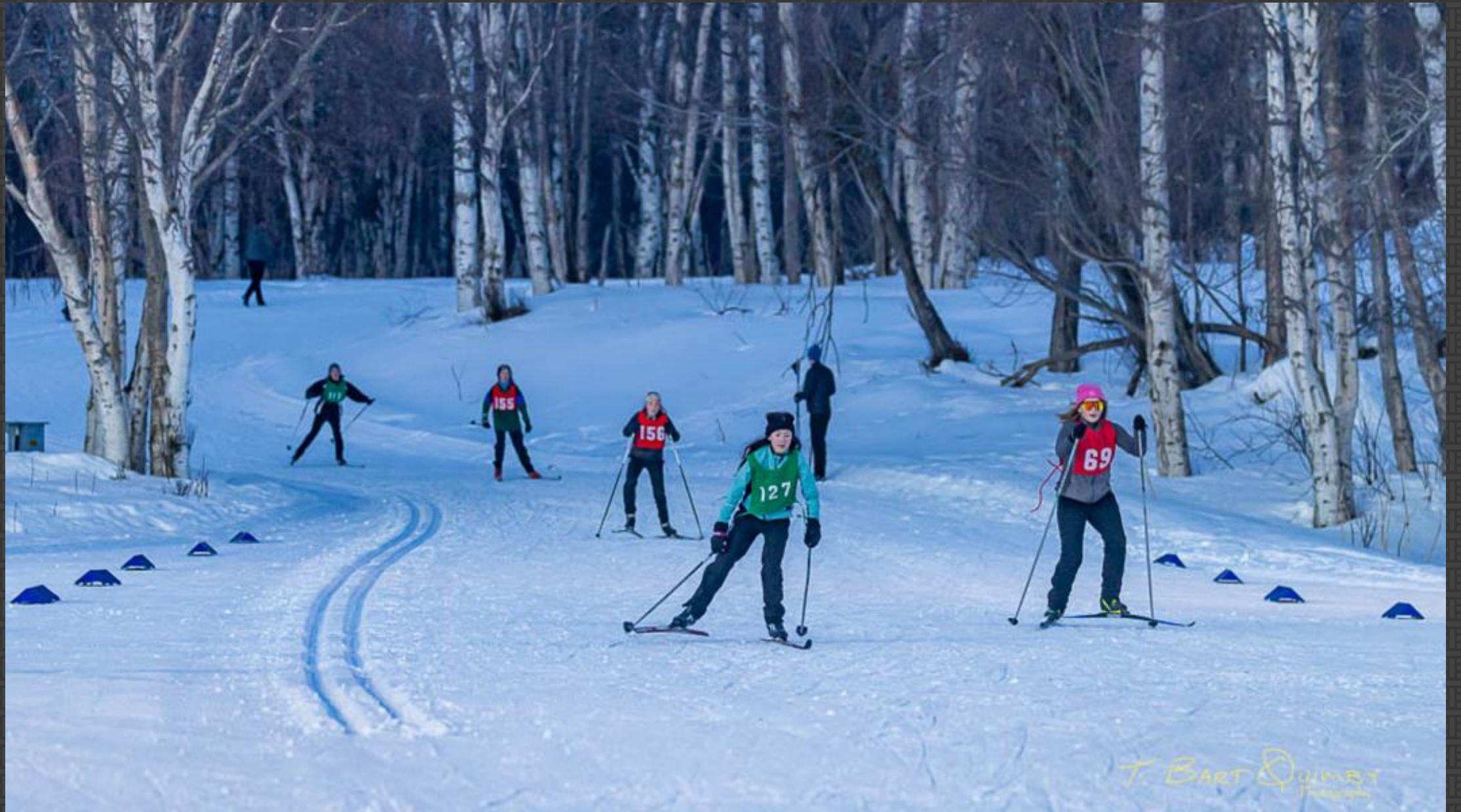
218-Bart Quimby - Ski Races