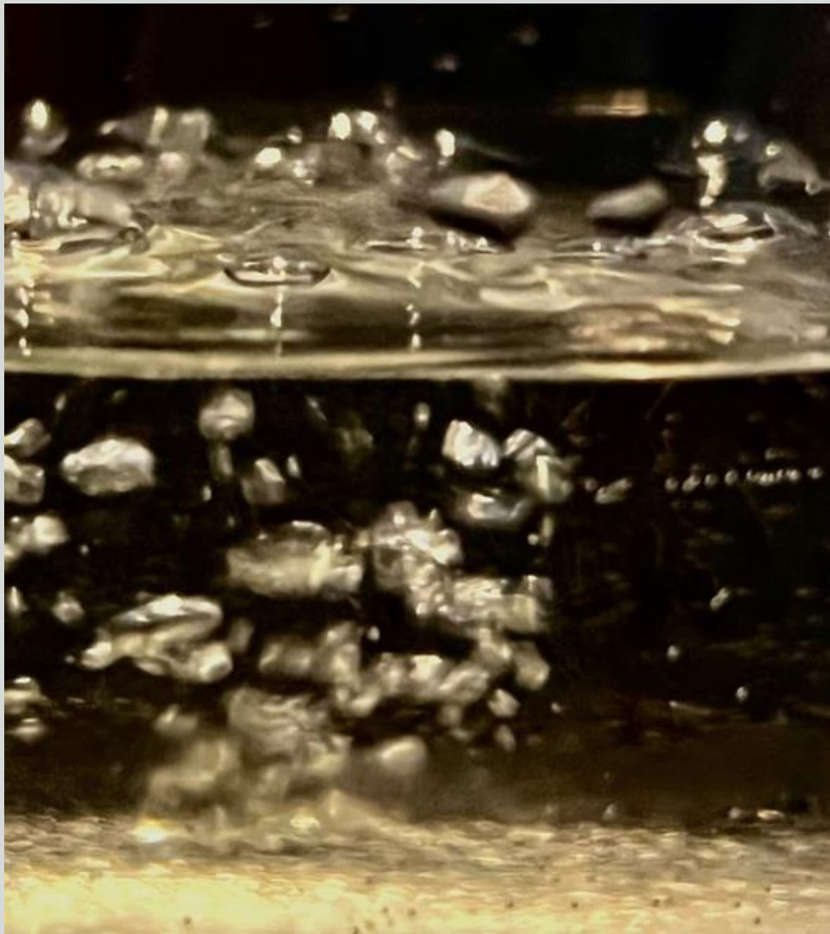
806-Janine Forrest – Drops