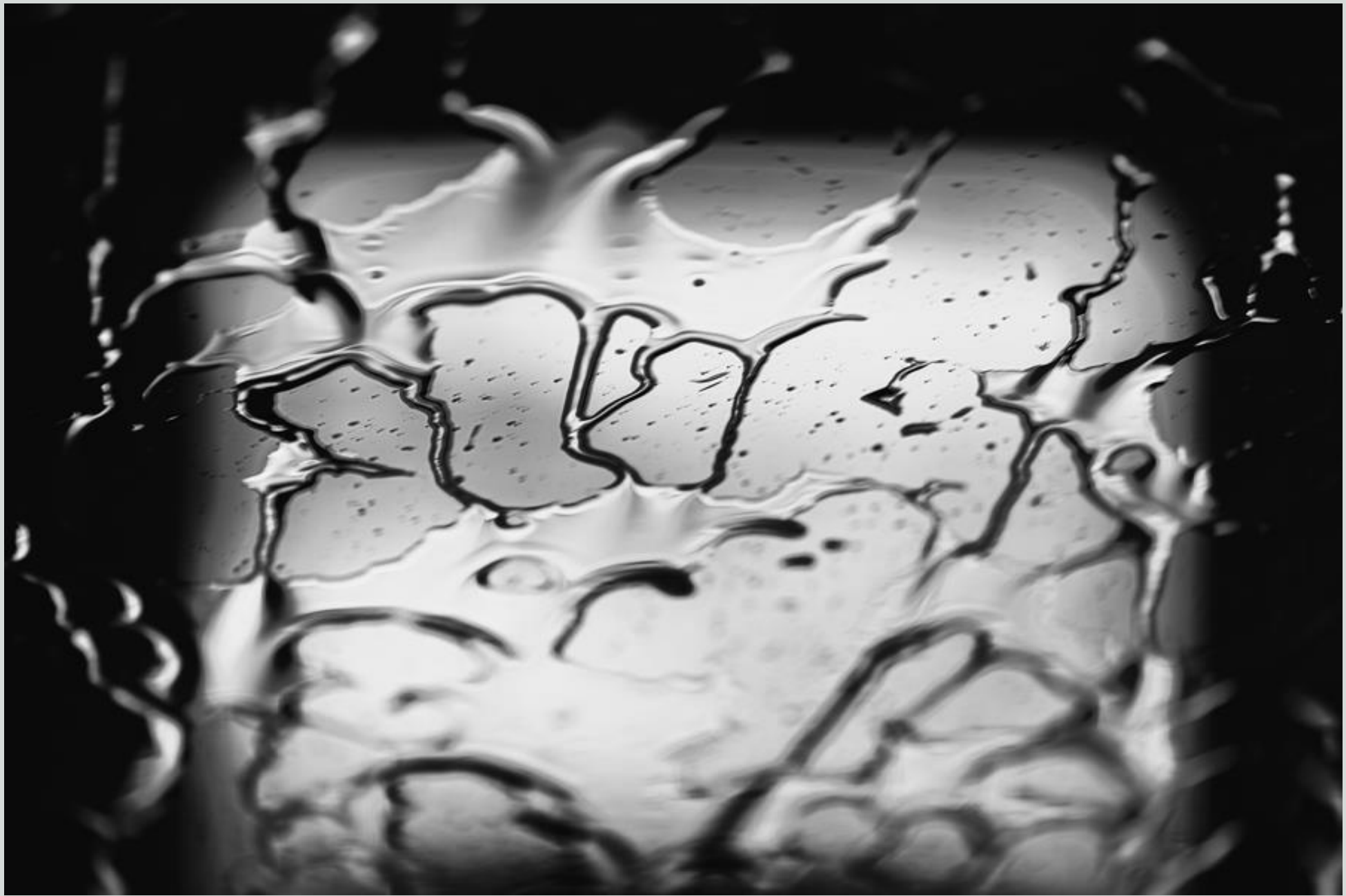
801-Ron Hoggard – At the Car Wash