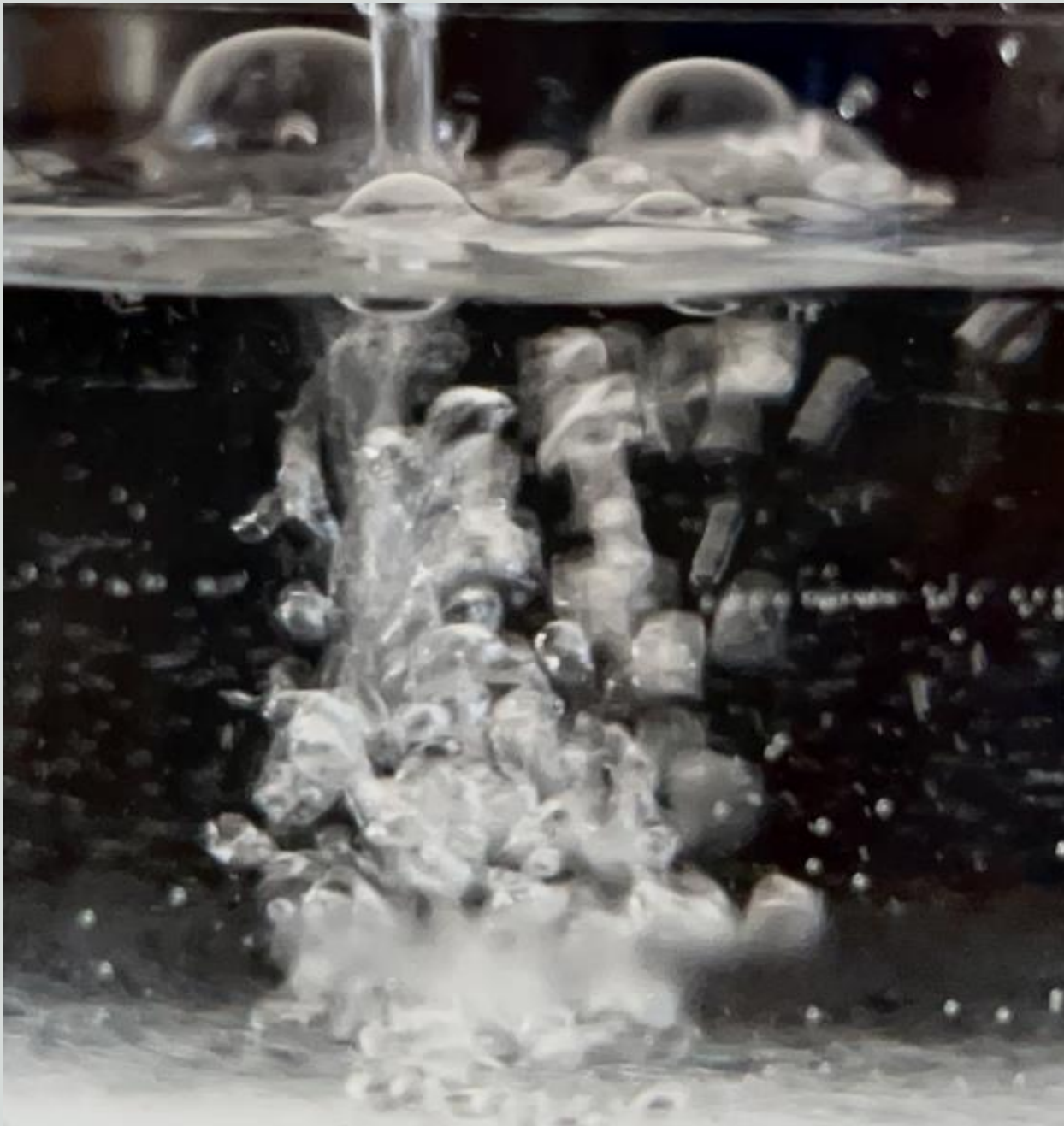
855-Janine Forrest – Running Water