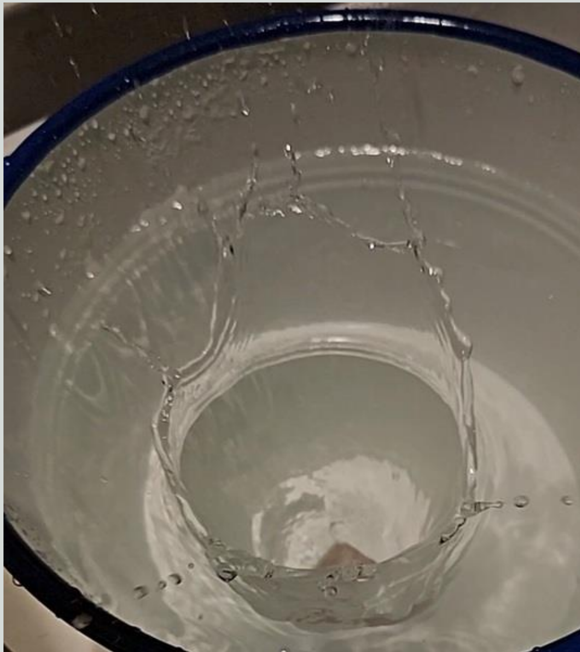
813-Nancy Hummel – PLOP!