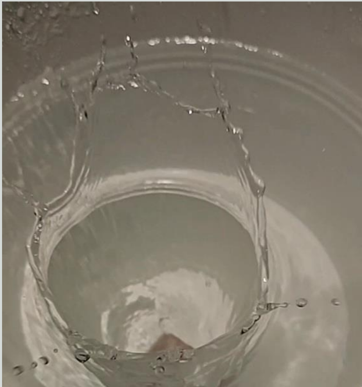
860-Nancy Hummel – Cropped PLOP