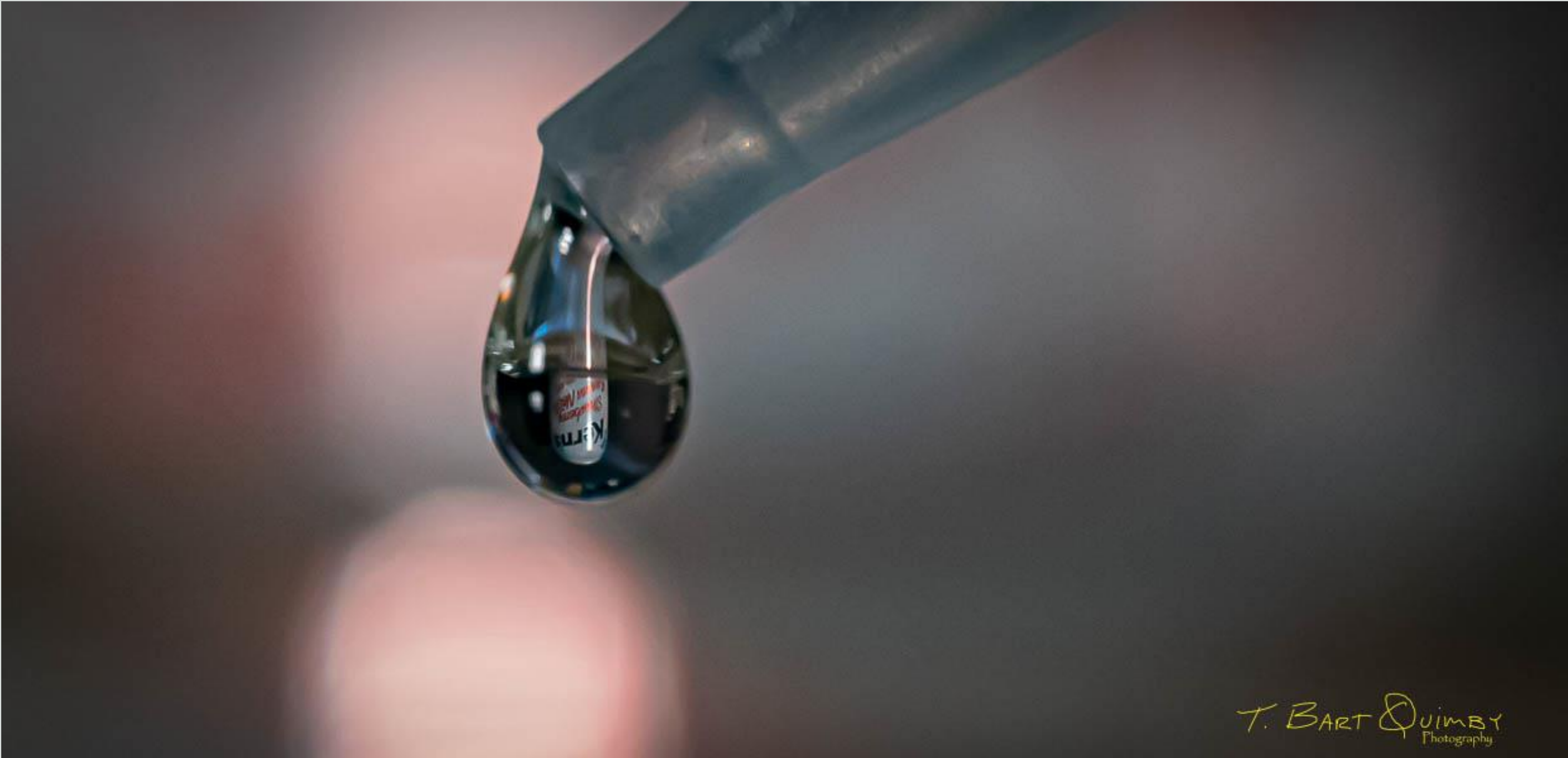
816-Bart Quimby – Drop as Lens