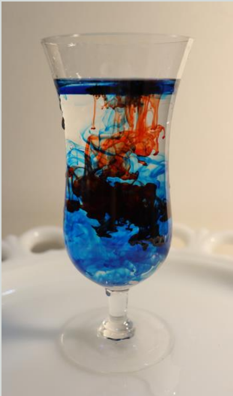
857-carol renfro – Blue and red dye in glass goblet