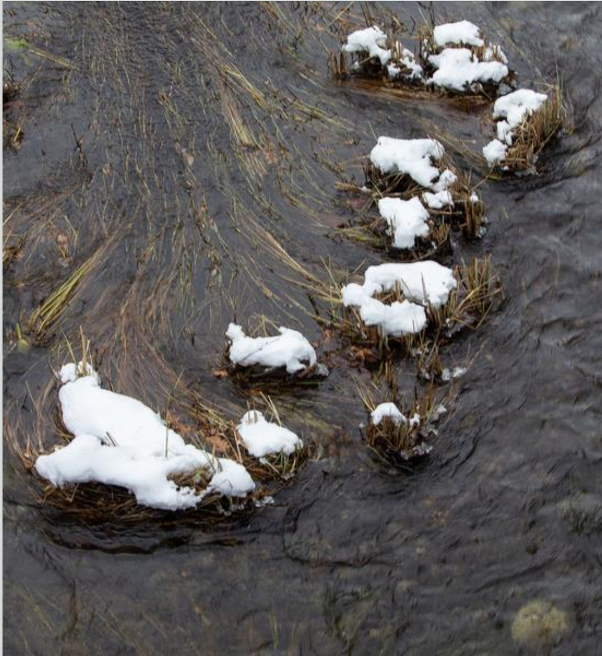
803-Chuck Iliff – Cottonwood Creek