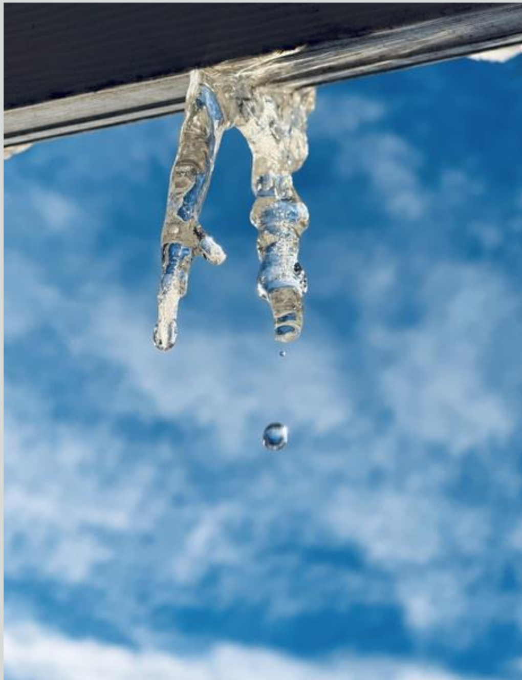
812-Paula - Freefall