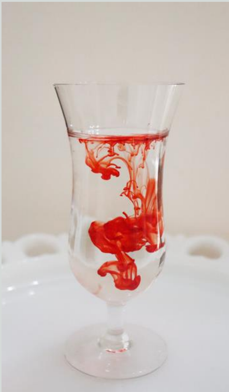
808-carol renfro – Red dye in clear glass goblet