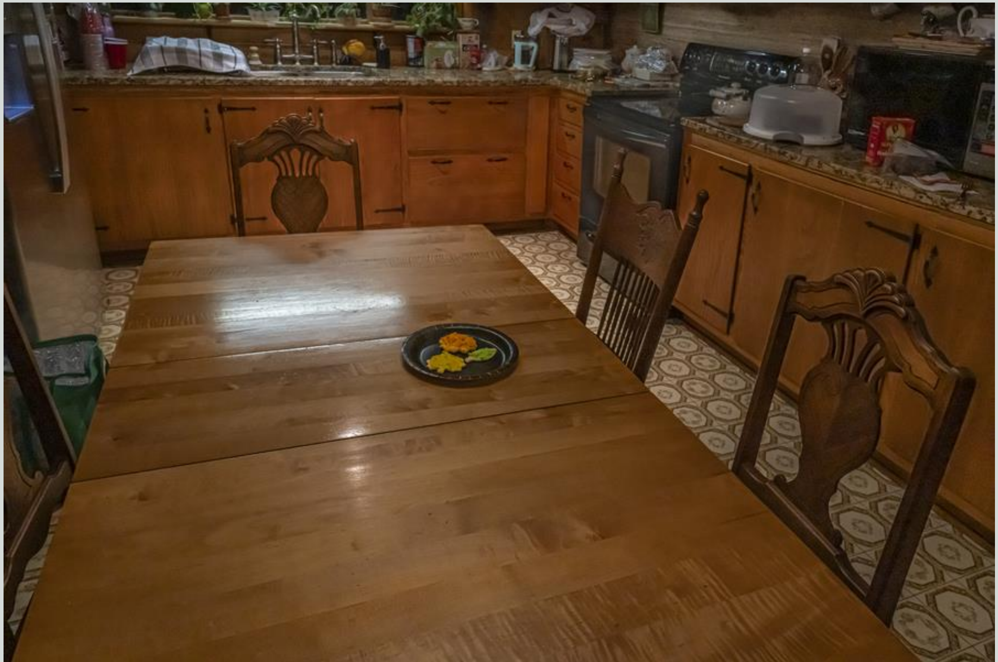
514-Bill Cole - Do You get It