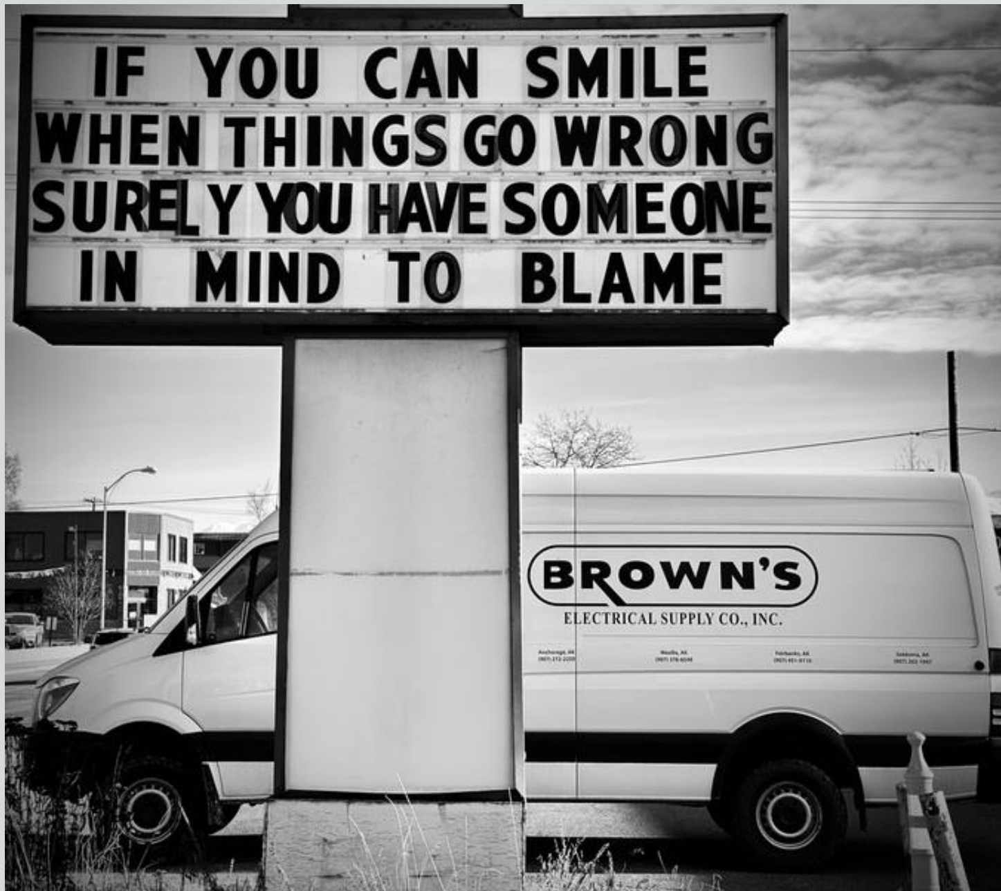
507-Paula - The Sage Ol' Sign