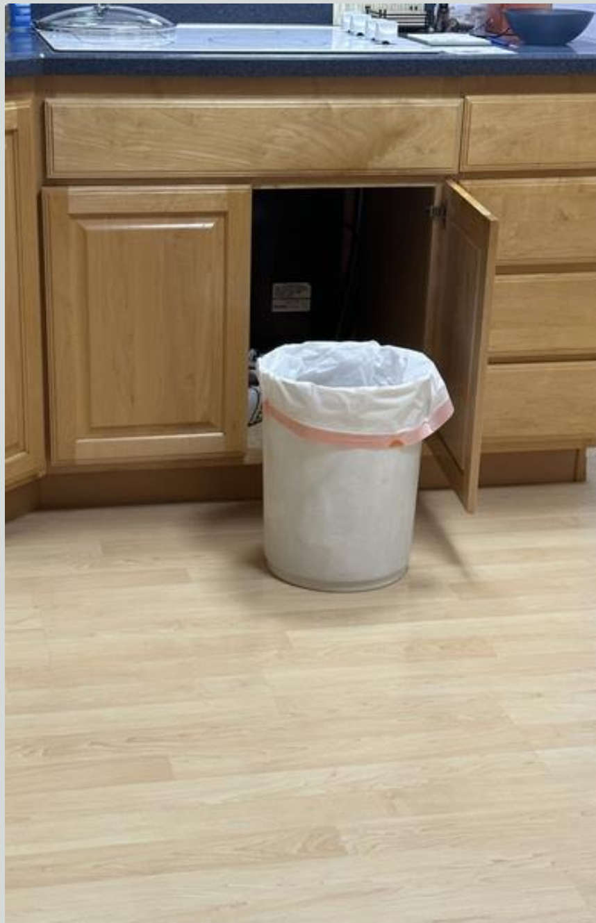
509-Diane - Silent Communication: Miscommunication