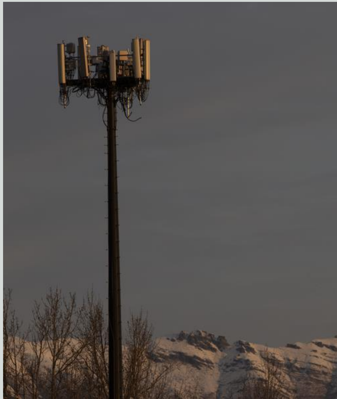
551-Chuck Iliff - Start the day with Communication