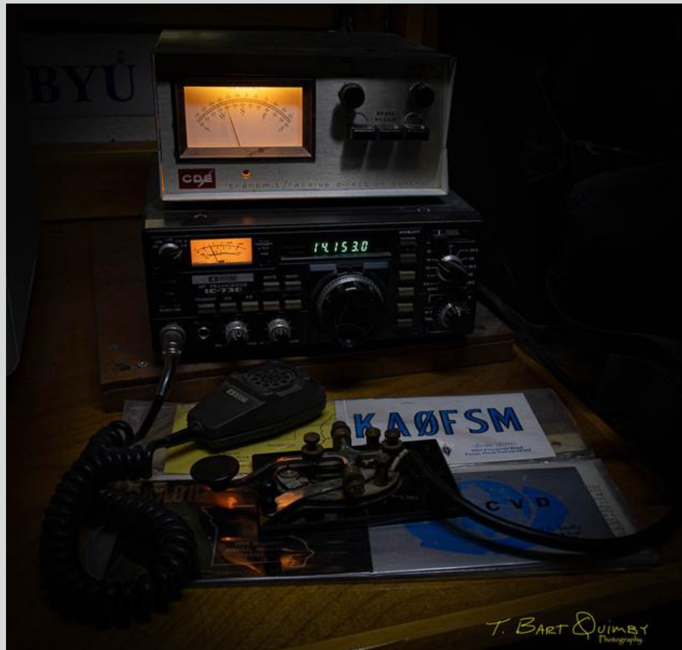
514-Bart Quimby - Old Hobby