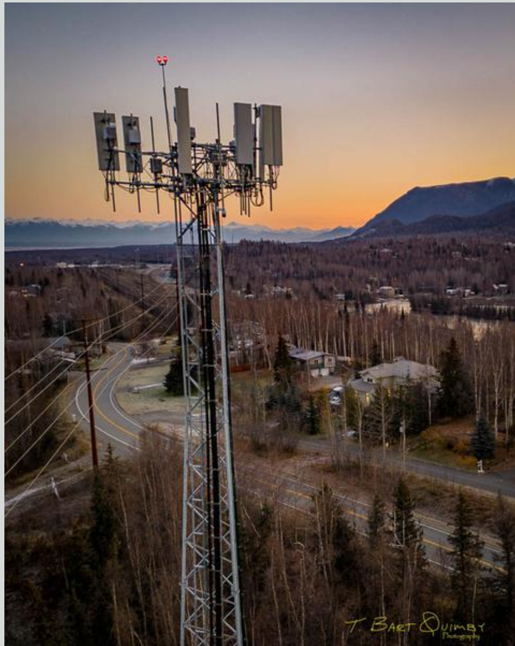
554 - Bart Quimby - No More Landlines