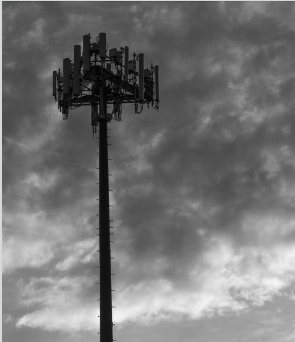
506-Chuck Iliff 1 - Communication with the cloud