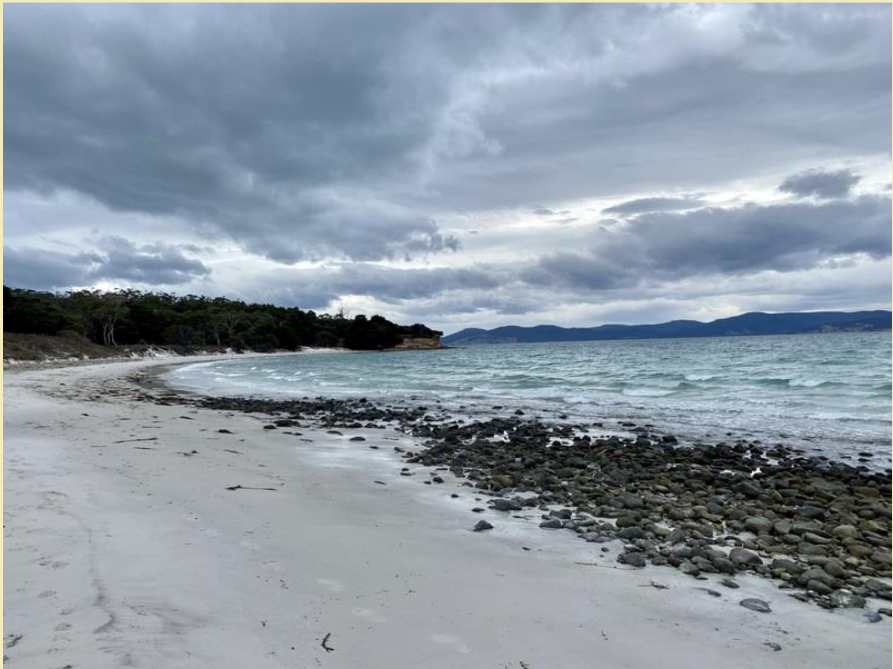
853-C Wallingford – Maria Island Tasmania