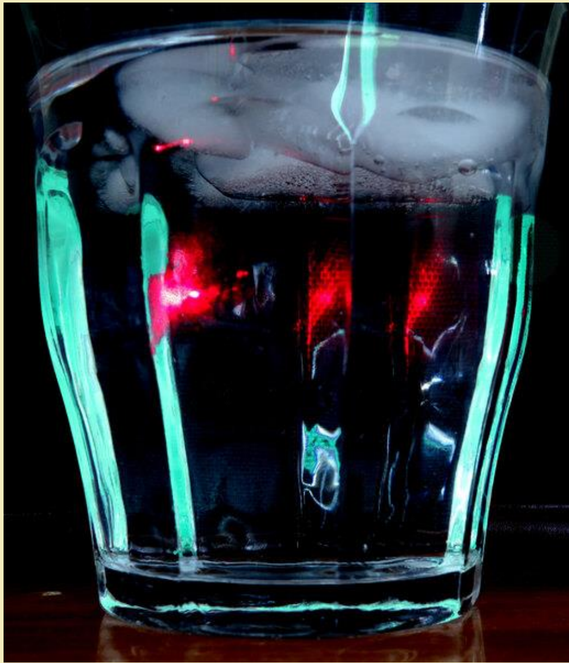
855-Bob Estey – water failure2