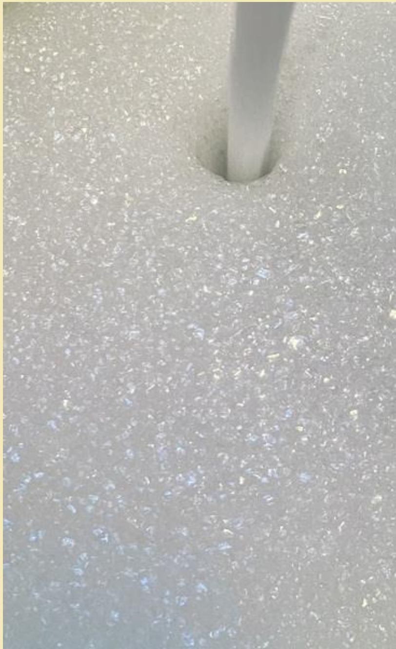
852-Shirley – Doing Dishes - Again!!!