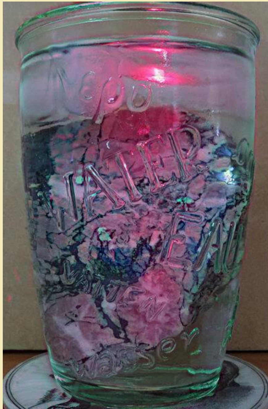
807-Bob Estey – water failure