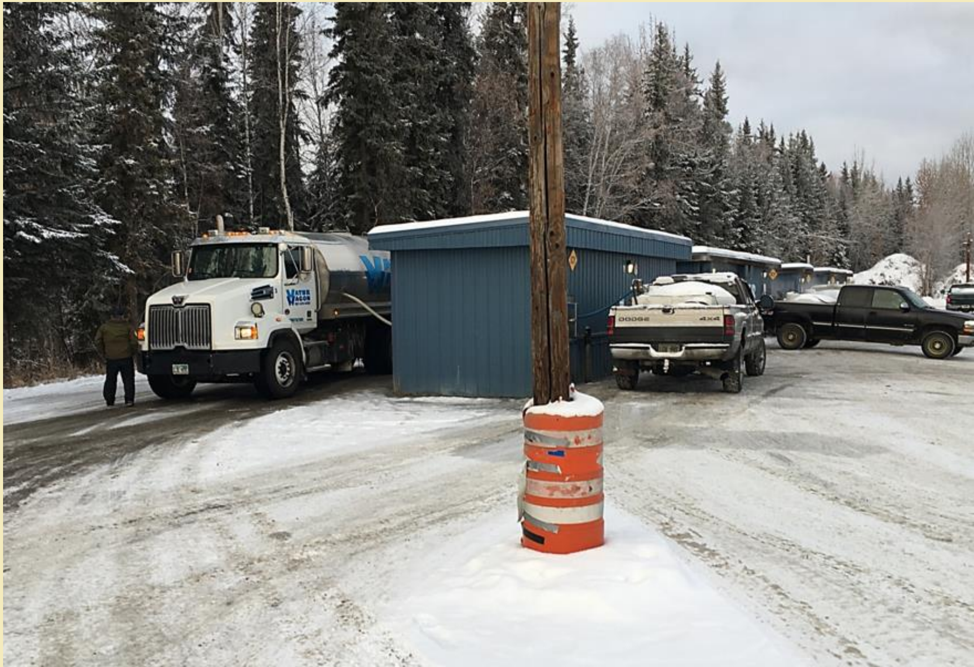
809 - Dave Norton – Liquid H 2 O for sale