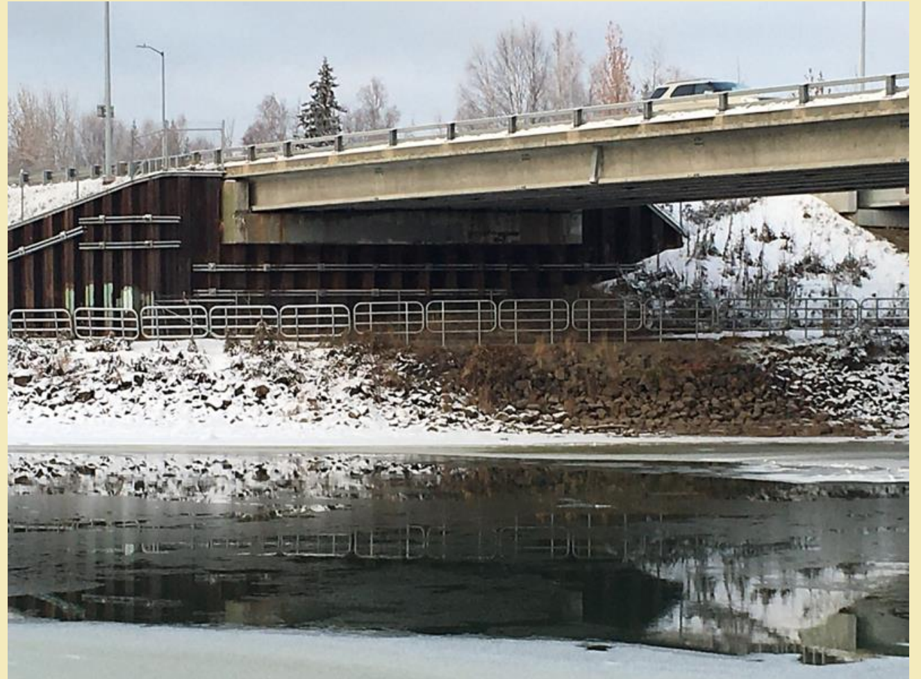
Liquid to solid phase: H_2O losing reflectivity