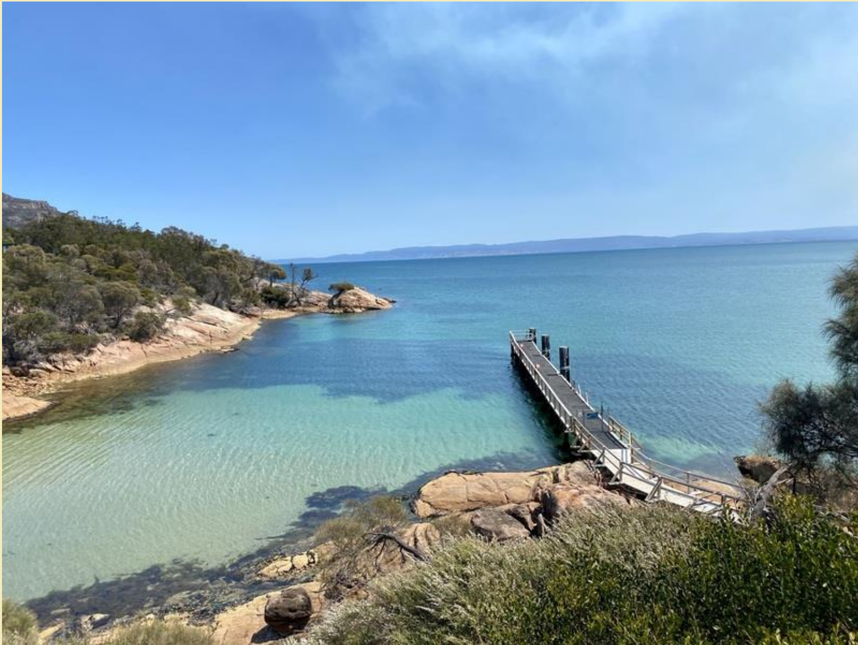
805-Claudia wallingford – Freycinet National Park