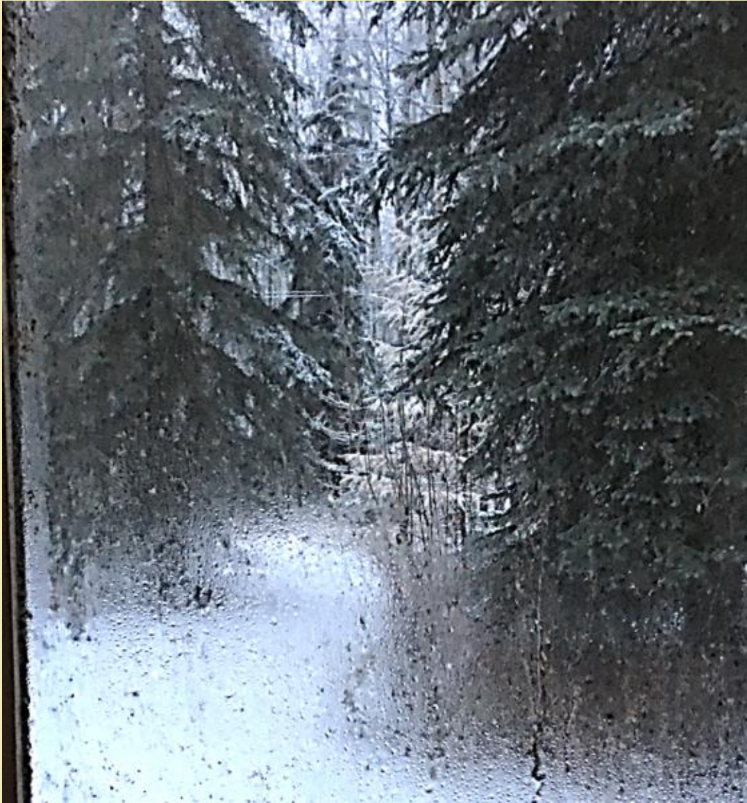
Liquid Phase: H_2O Garage window condensation