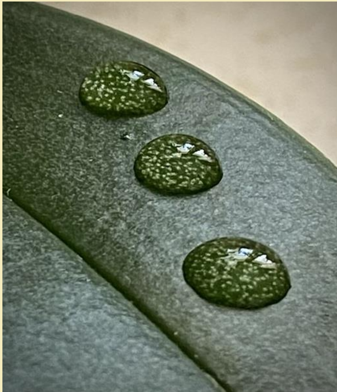
803-Shirley – Three Sisters