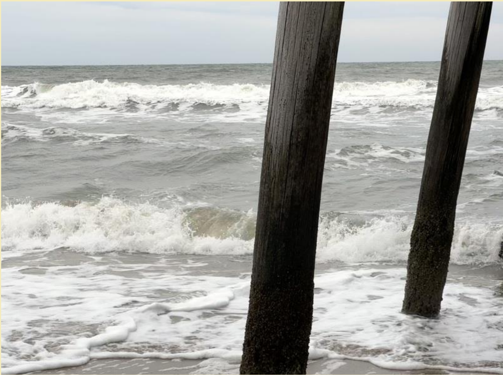
801-Sandra Knight – Liquid Water tropical winter