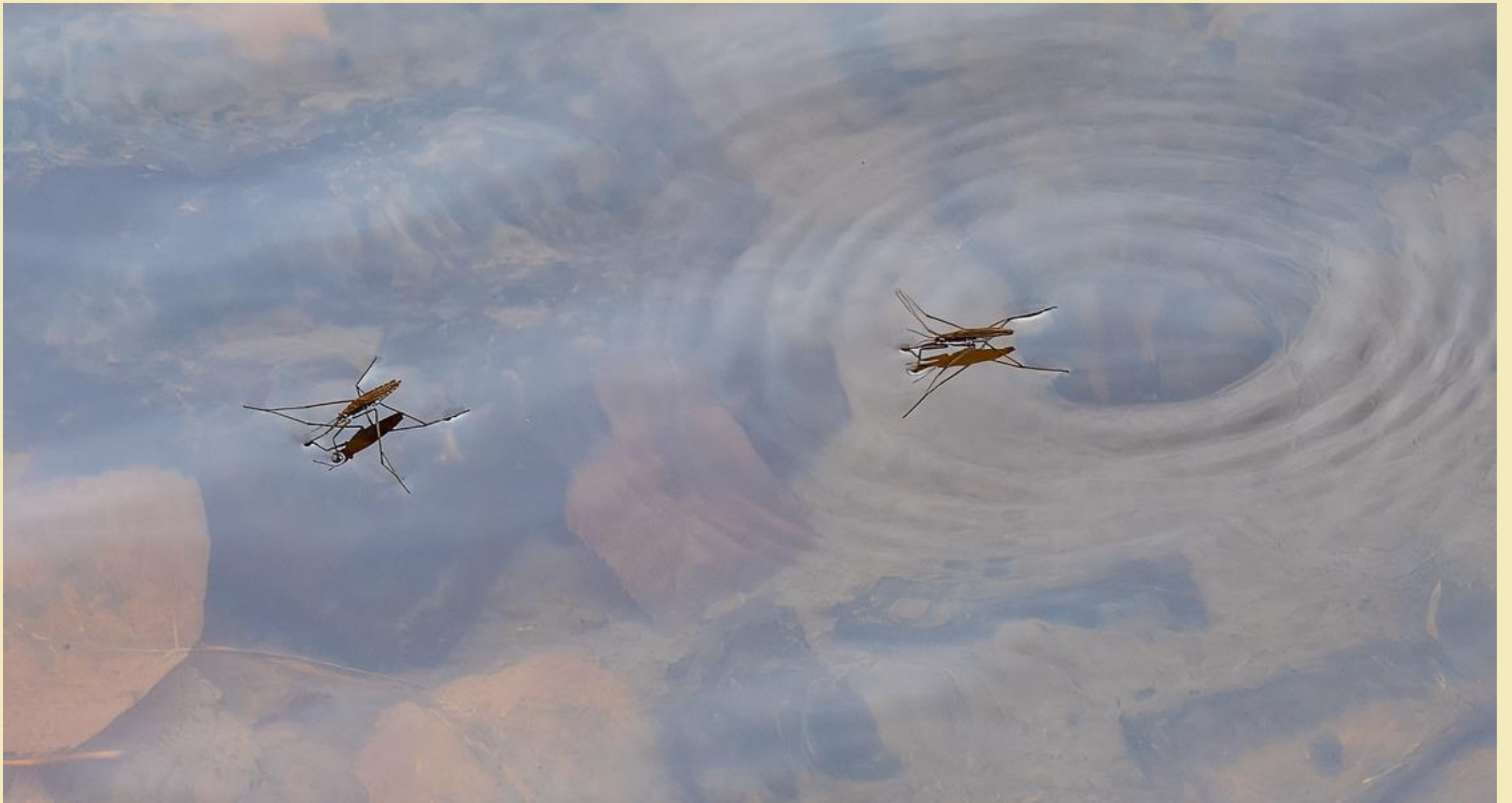
806-Glenn Cantor – The Power of Hydrogen Bonds