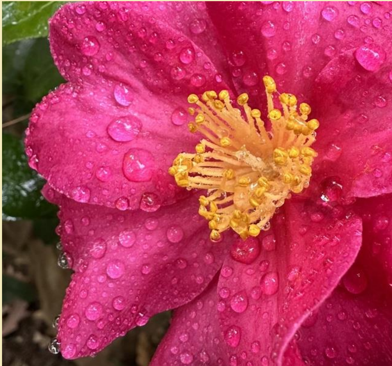
851-Sandra Knight – After the shower