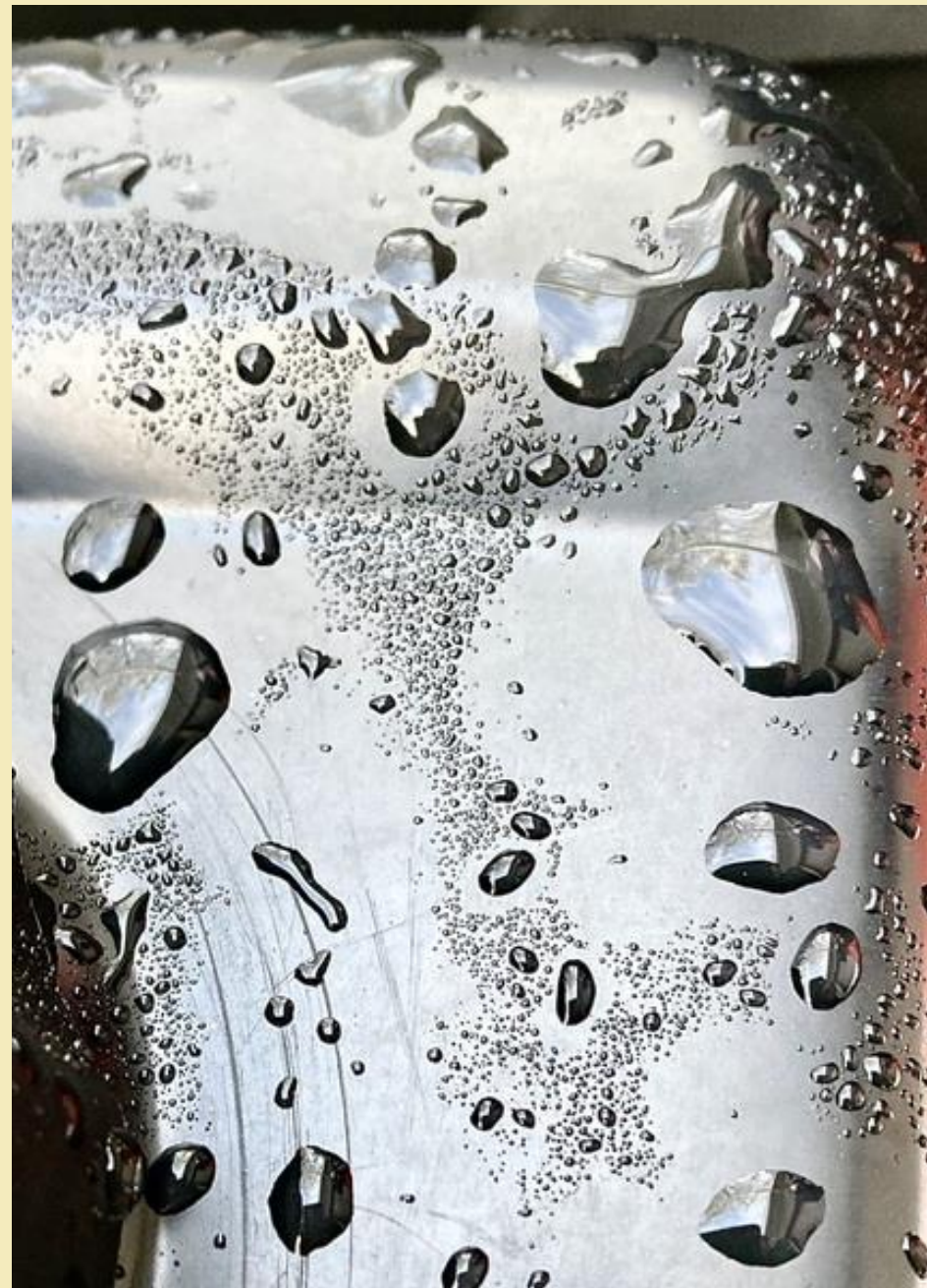
856-Susan Barrickman - Reflections of the Sky