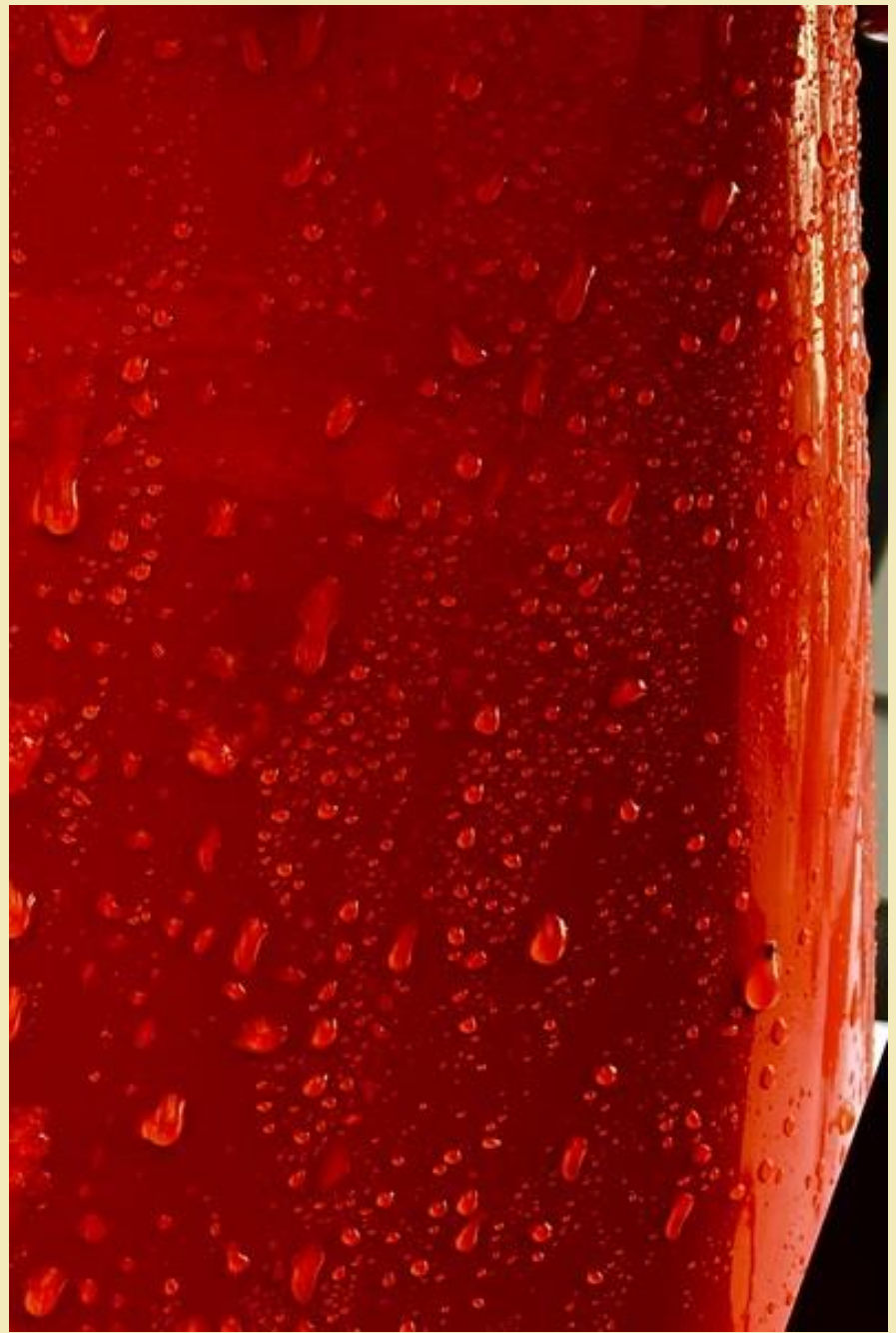
808-Susan Barrickman - Snowblower Chute