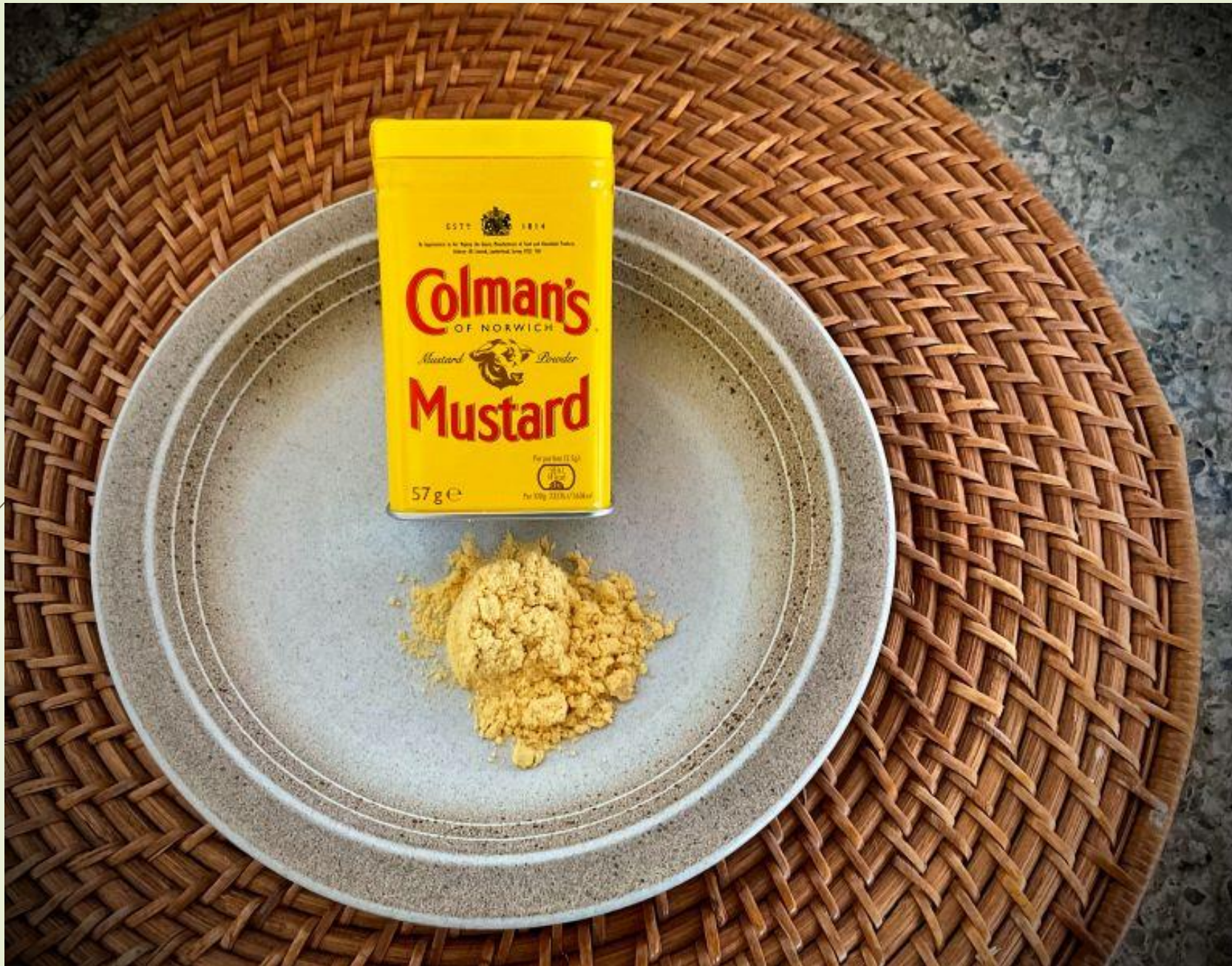
452-Susan Barrickman - Yellow Mustard