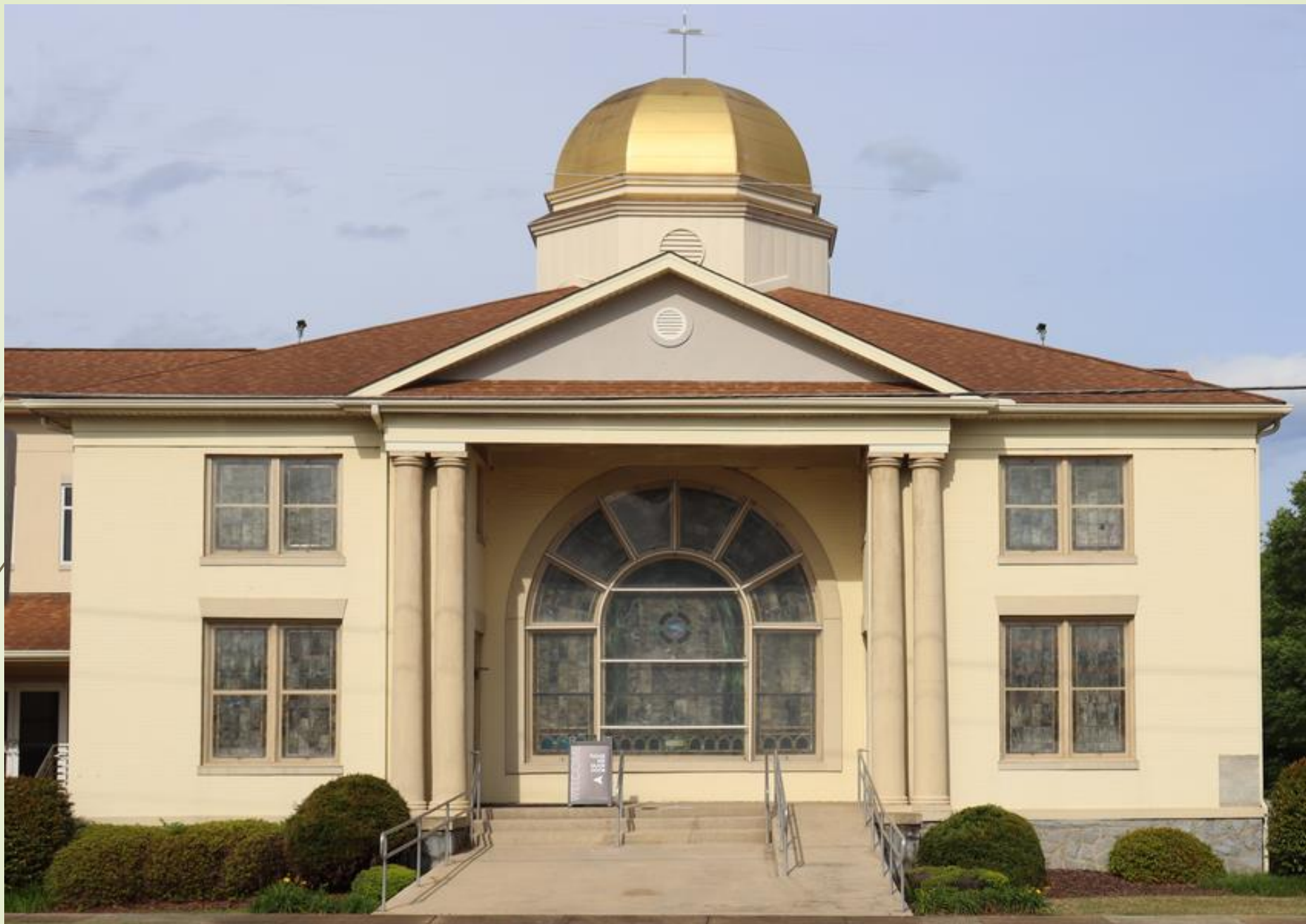
421-Carol Cole Renfro - First Baptist Church