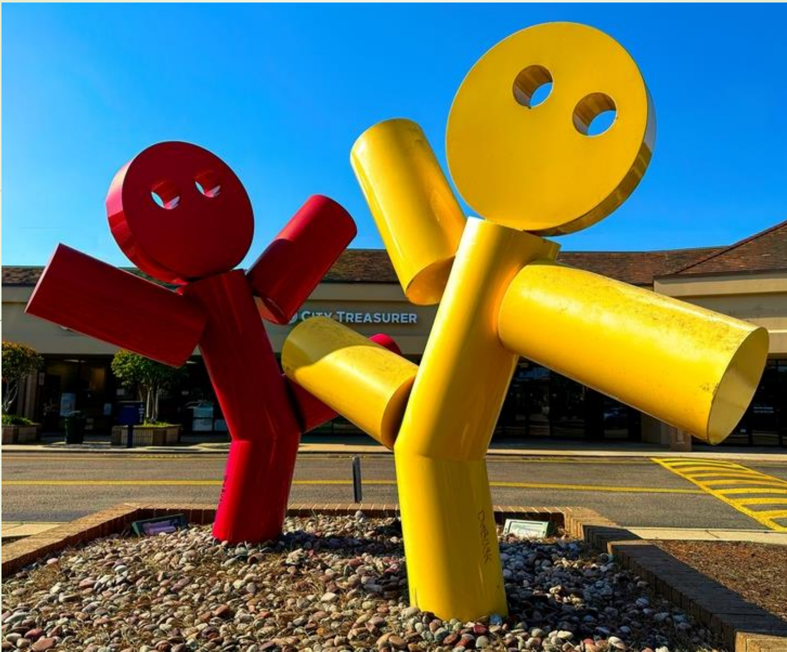
403-Sandra Knight - Yellow fellow