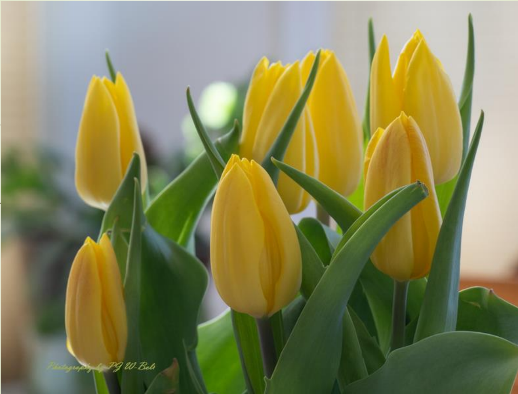
415-PJ - HOOT