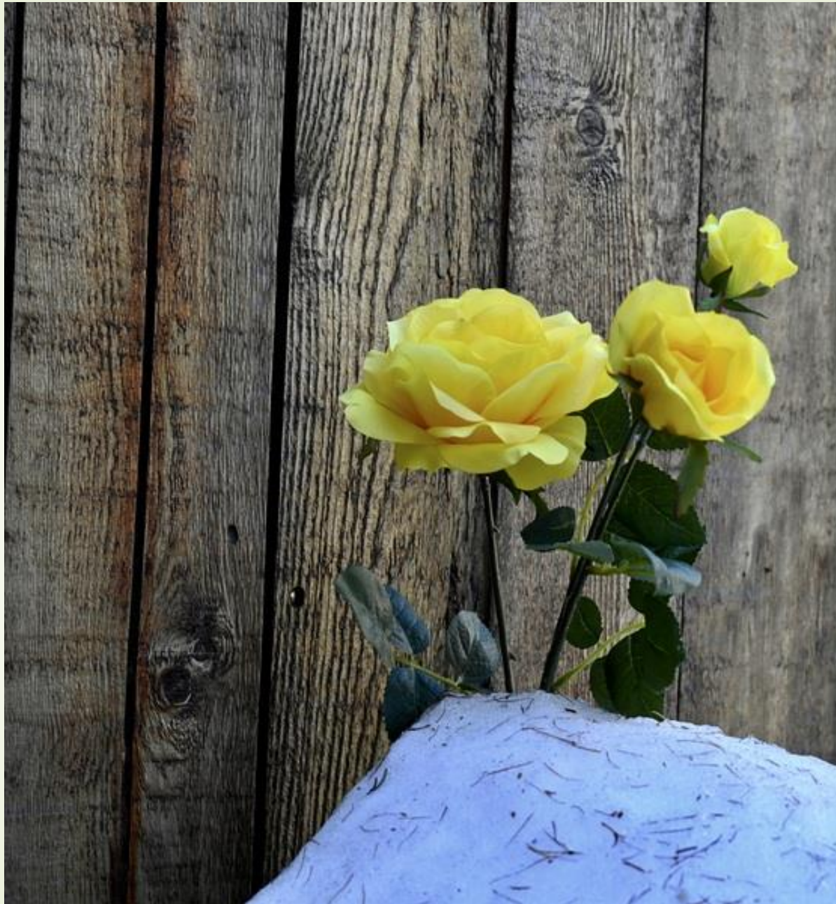
407-marty - from choas springs beauty