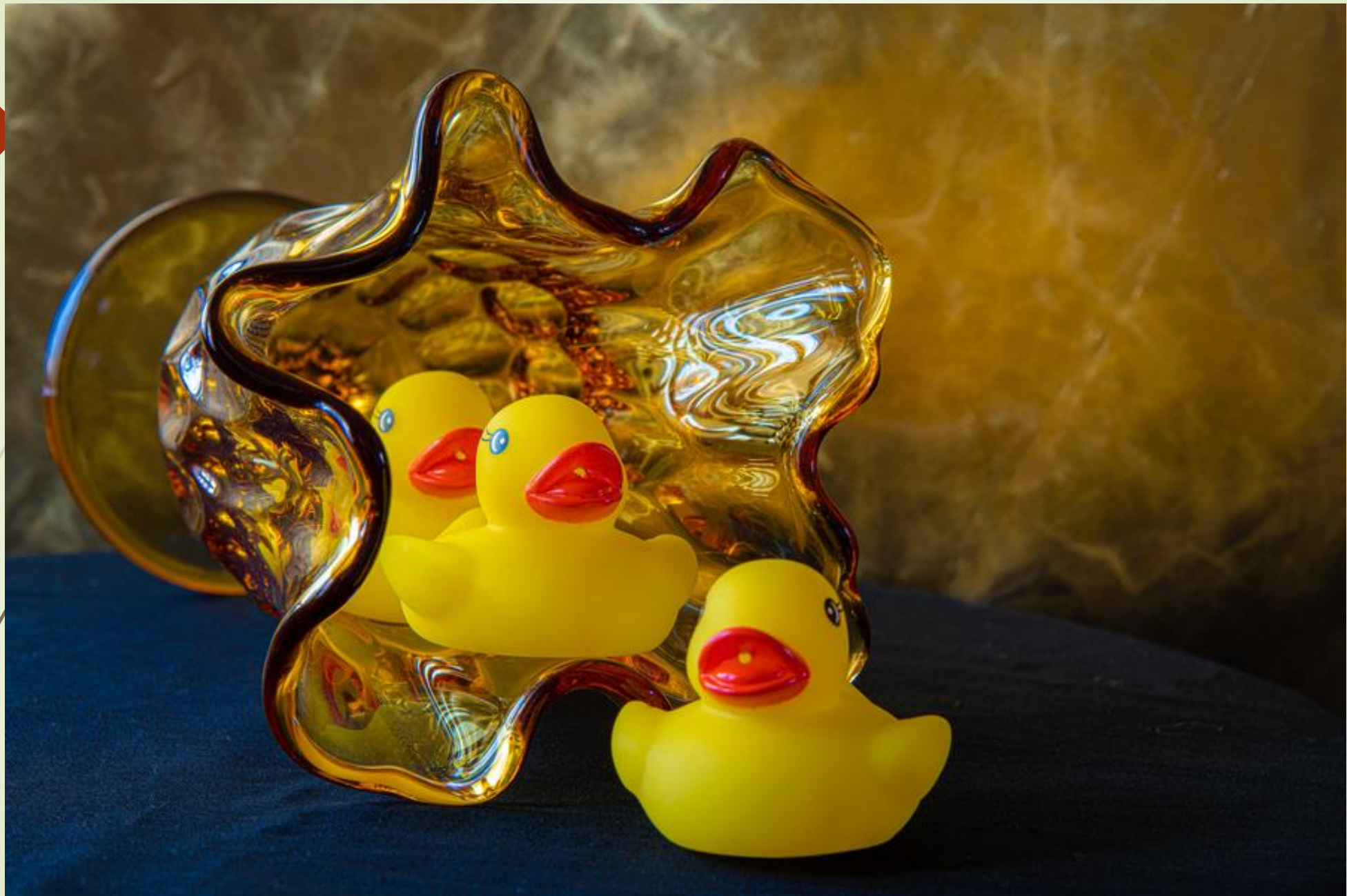
402-Ron Hoggard - Ducks Not in a Row