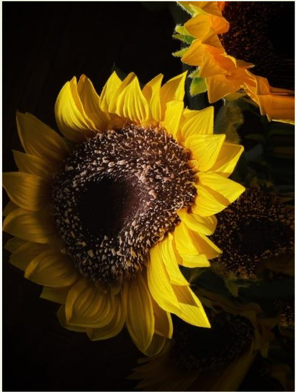
413-Nancy Stone - Sunflower