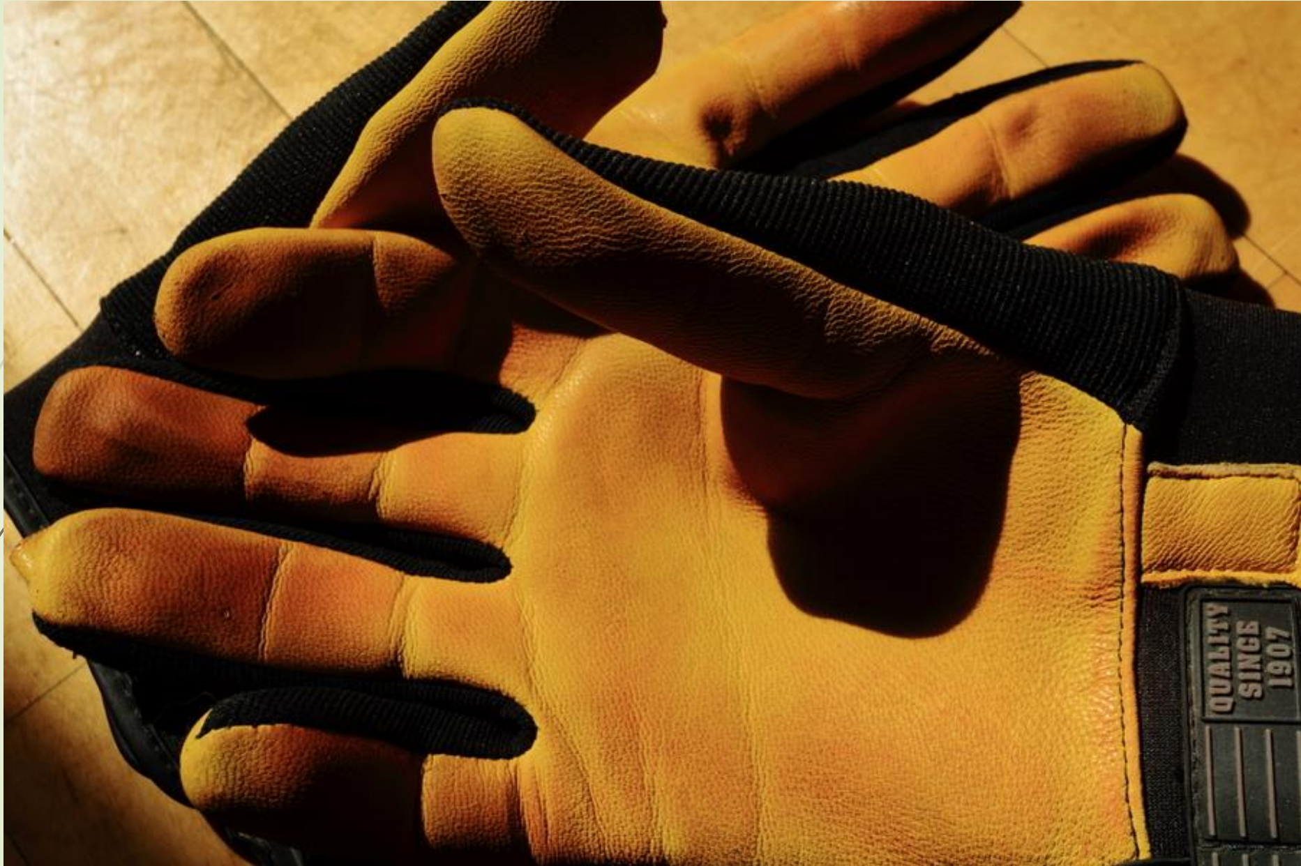
420-Christopher - My hands still hurt