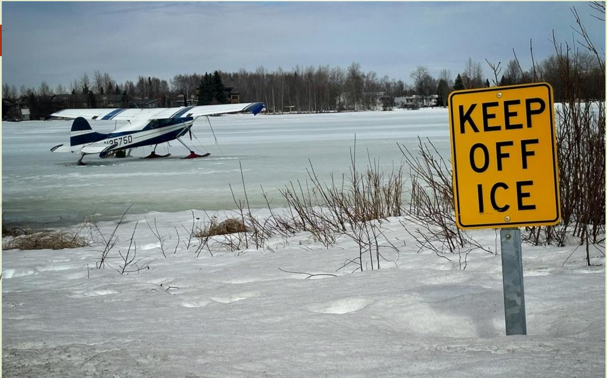
408-Paula - Double Standard