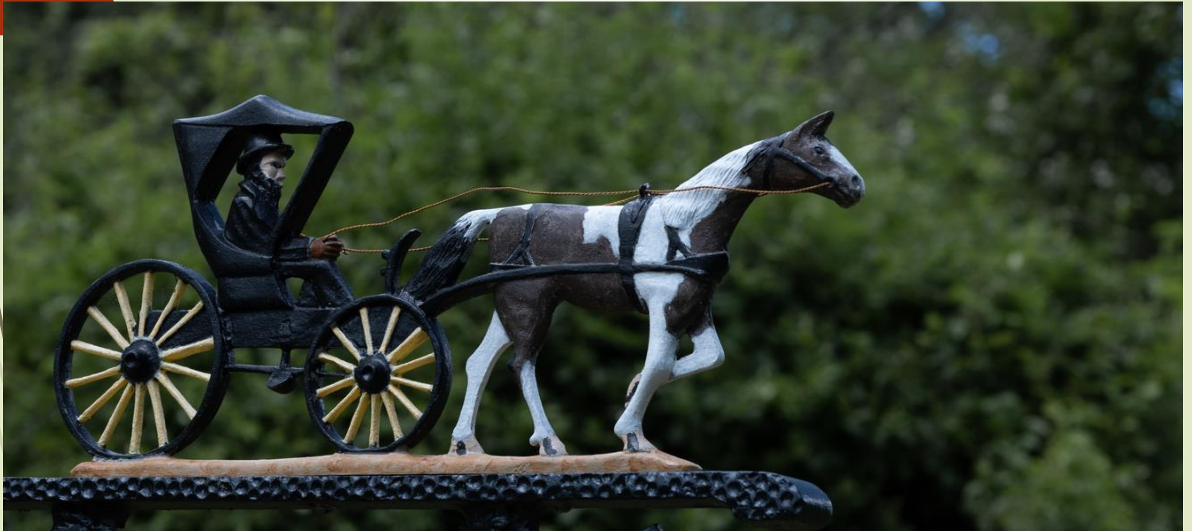
411-Karen Cole-Loy - Top of road sign horse and buggy