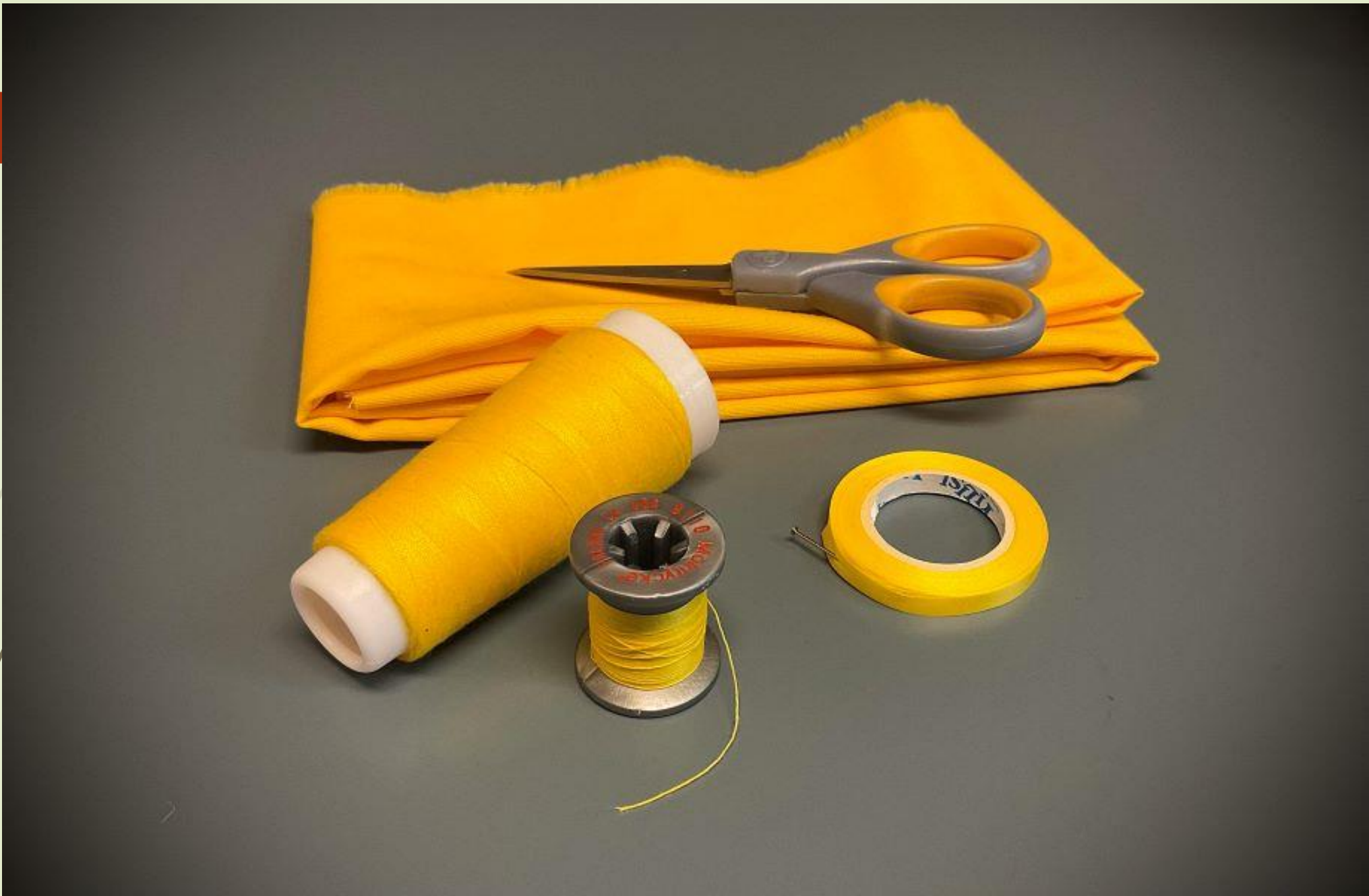
409-Susan Barrickman - Yellow Notions