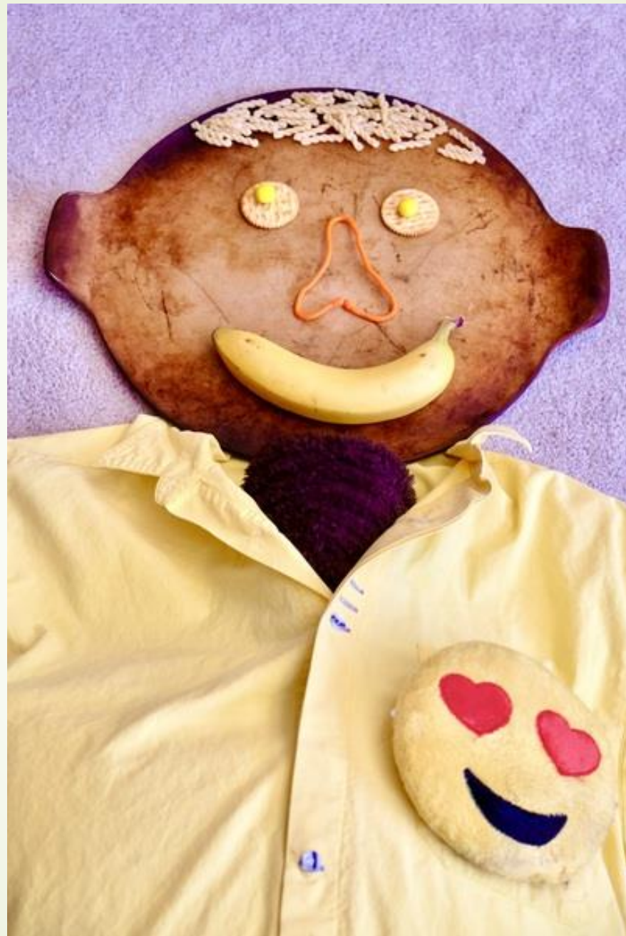
410-John Wedelich - Ralph