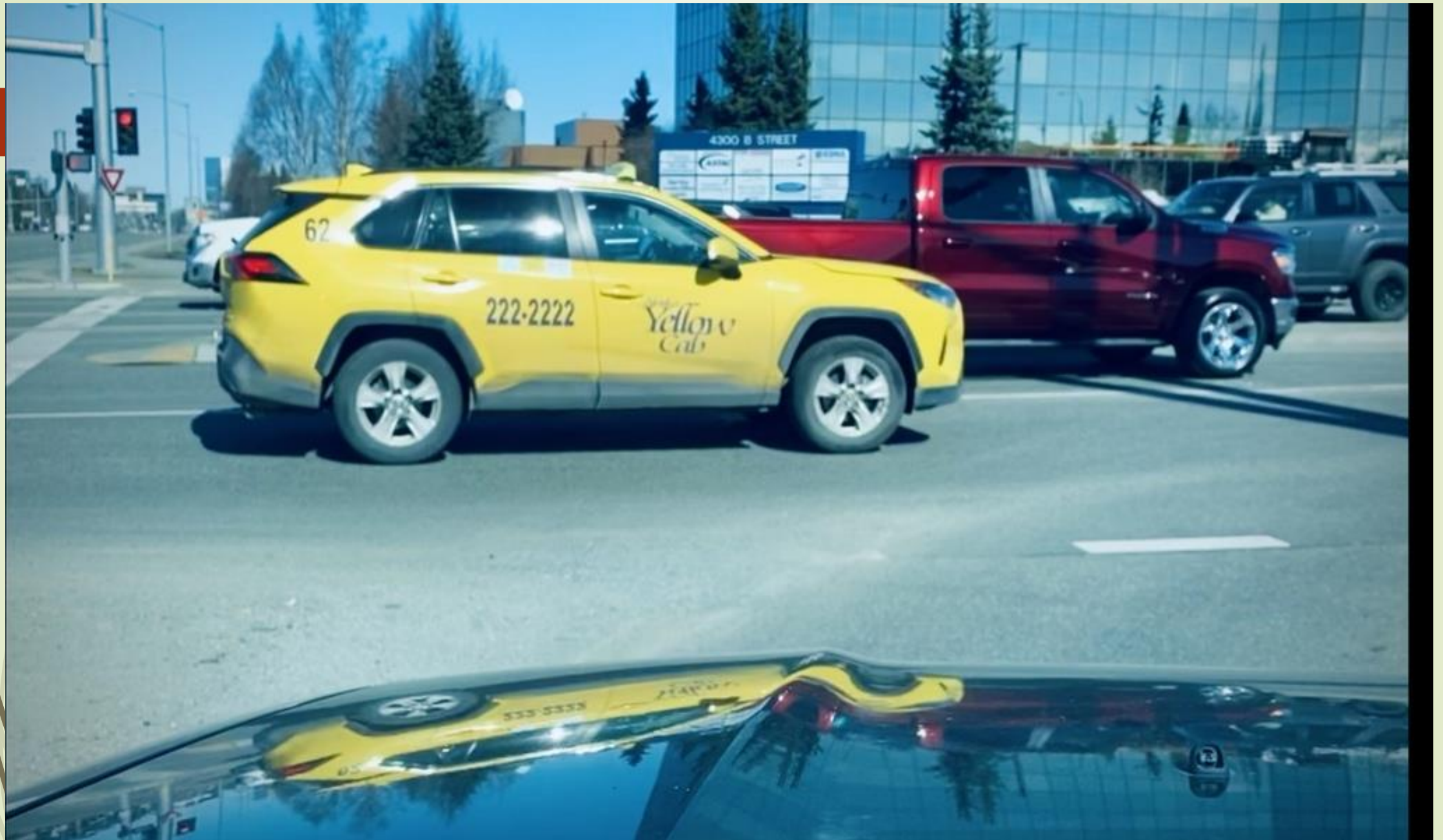
405-Shirley - A Yellow Cab