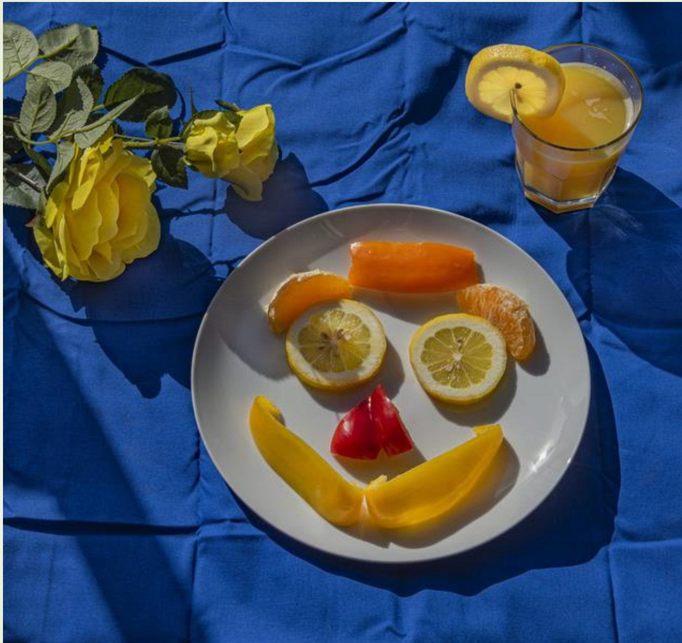
418-Bill Cole - Cheery Yellow Fellow 2 SF