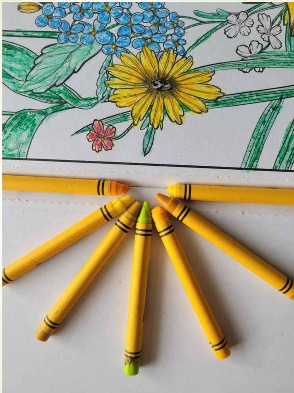
404-Rhonda - Sticks of sunshine