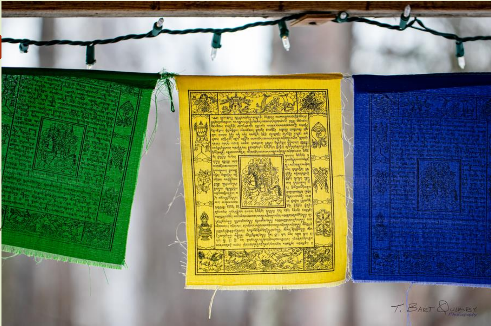
422-Bart Quimby - Prayer Flags