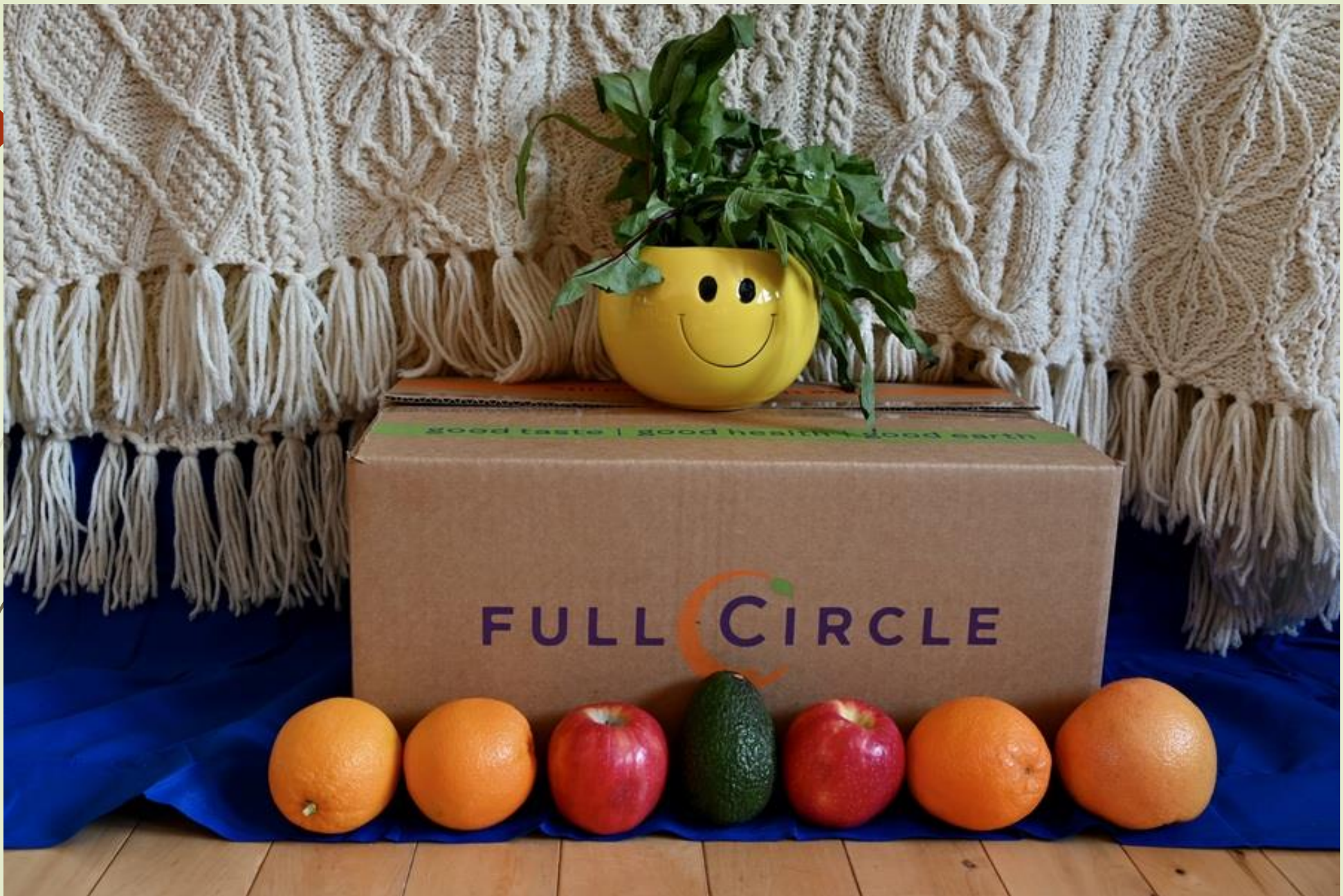
301-marty - full circle