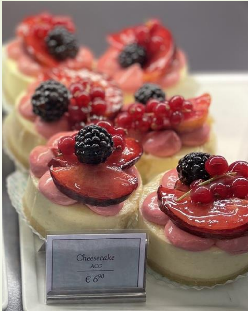
312-Janet Wilkinson-called fruity cheesecake