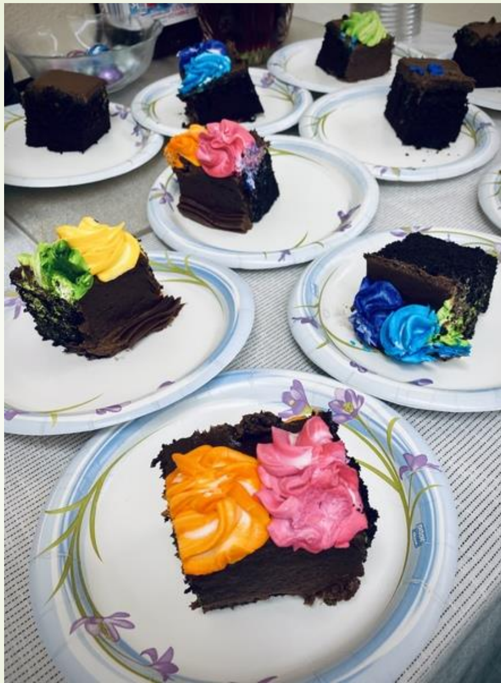
305-Shirley - Yummy frosting!!