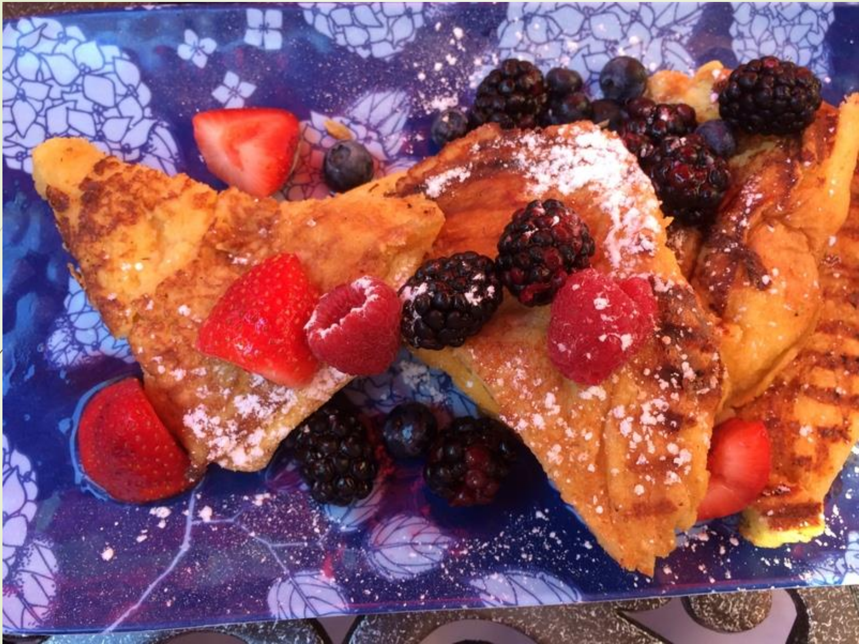
317-Nancy Stone - Good Eats!