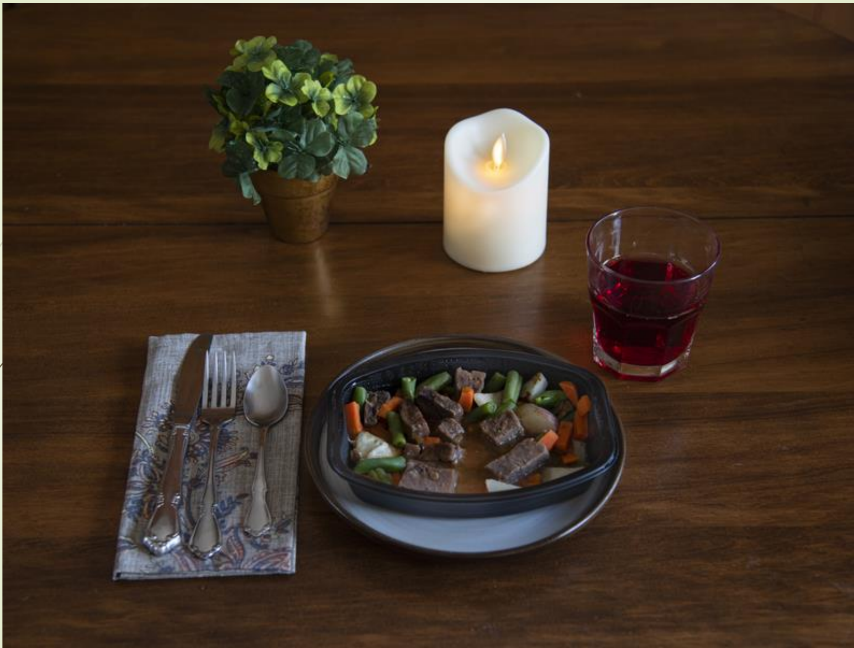
315-Bill Cole - Fine Dining Mr Whitekeys Style