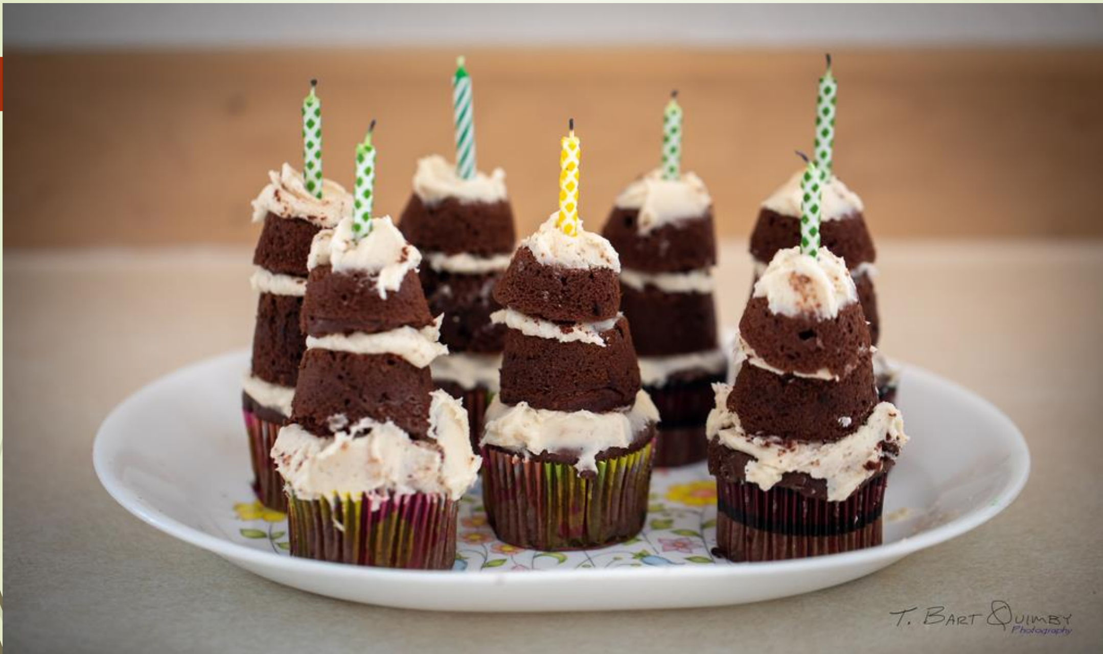
319-Bart Quimby - Birthday Cake