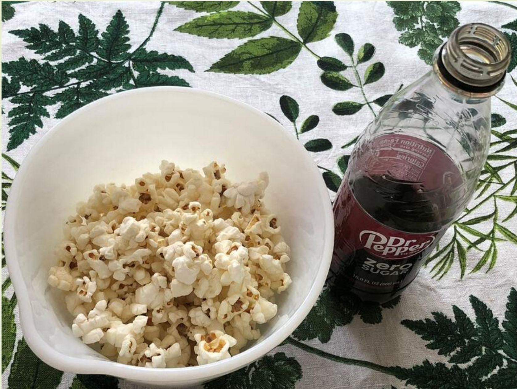
310-Bob Estey - afternoon snack