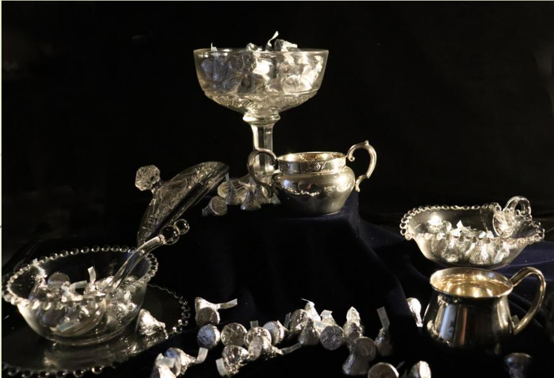
316-carol Renfro - Hershey Kisses on display