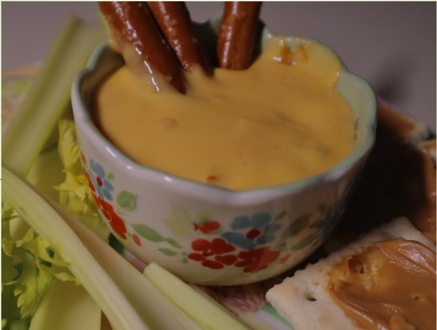
309-Sandra Knight - snax - where to begin-