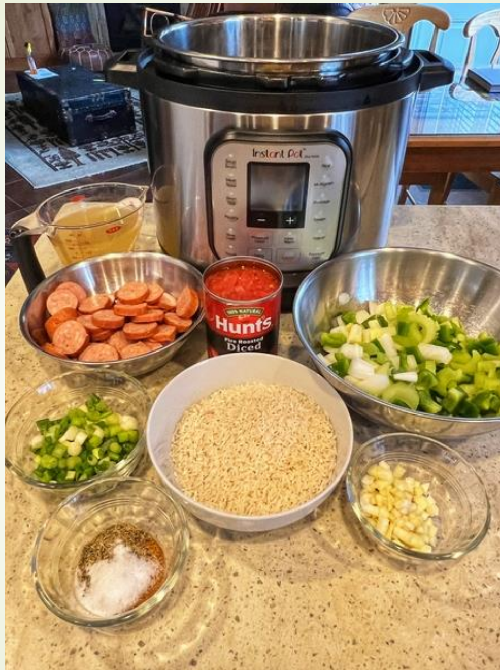
303-Mark Morones - Jambalaya