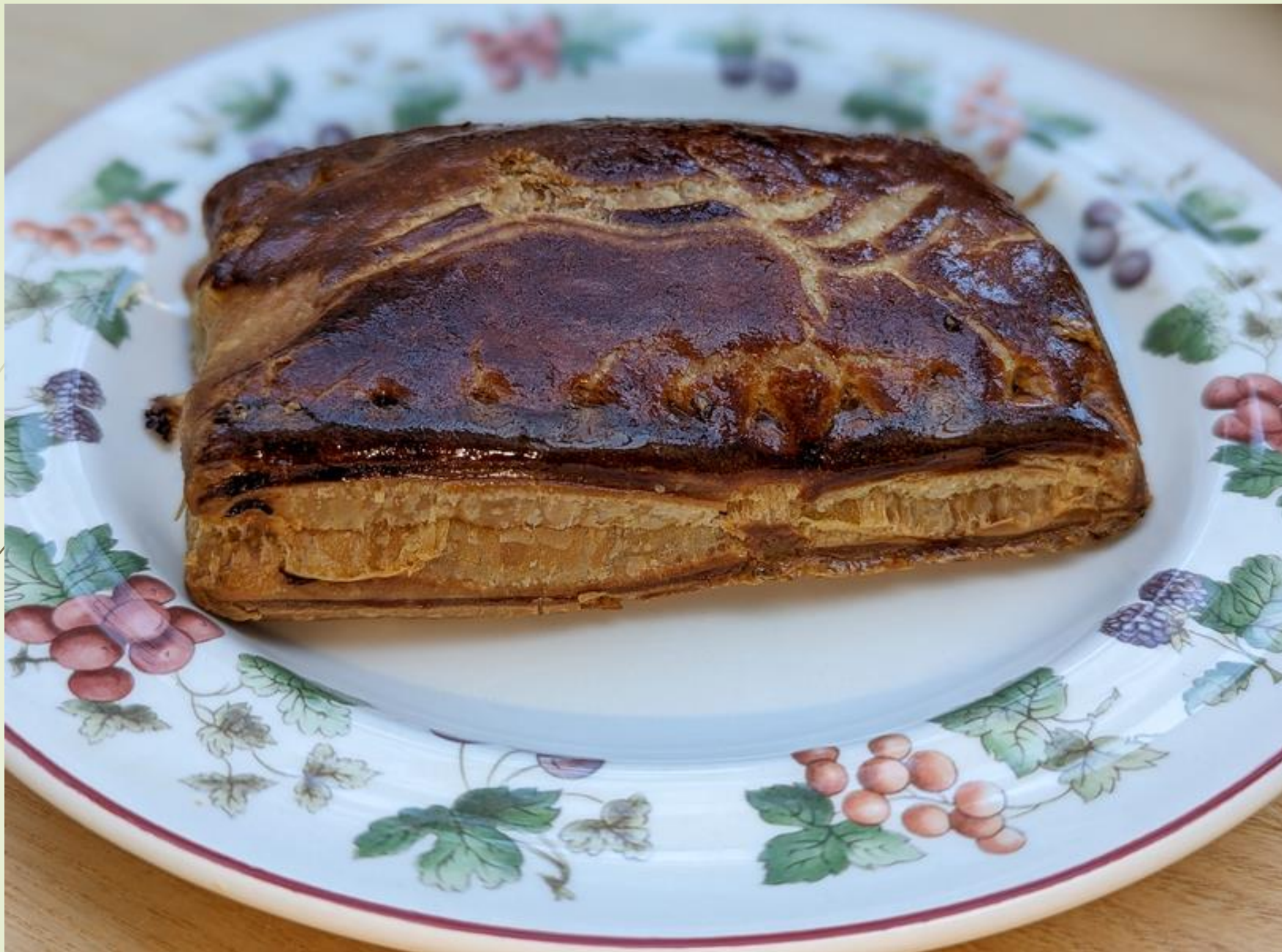
352-Glenn Cantor - Sausage Bread - Dutch comfort food