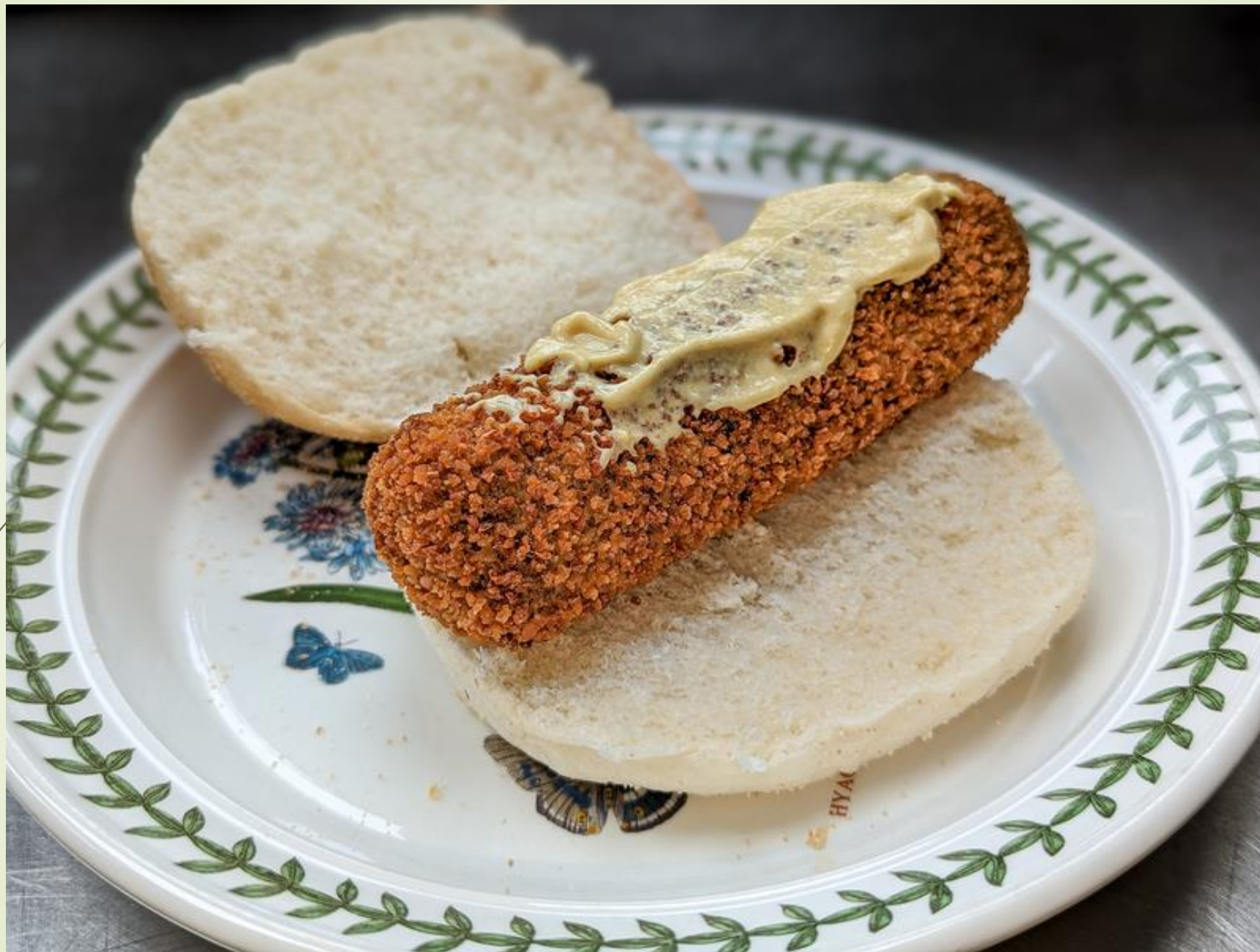
311-Glenn Cantor - Croquette with mustard - Dutch comfort food