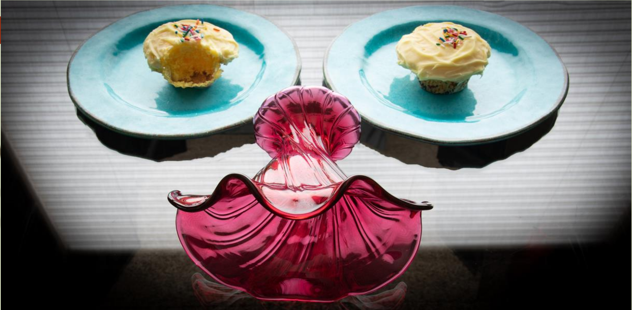
307-Ron Hoggard - Snacks are People Too