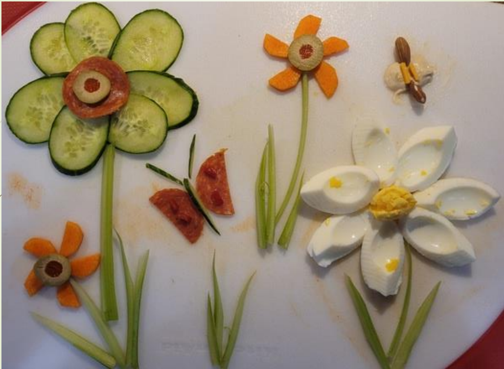
302-Rhonda - Summer days