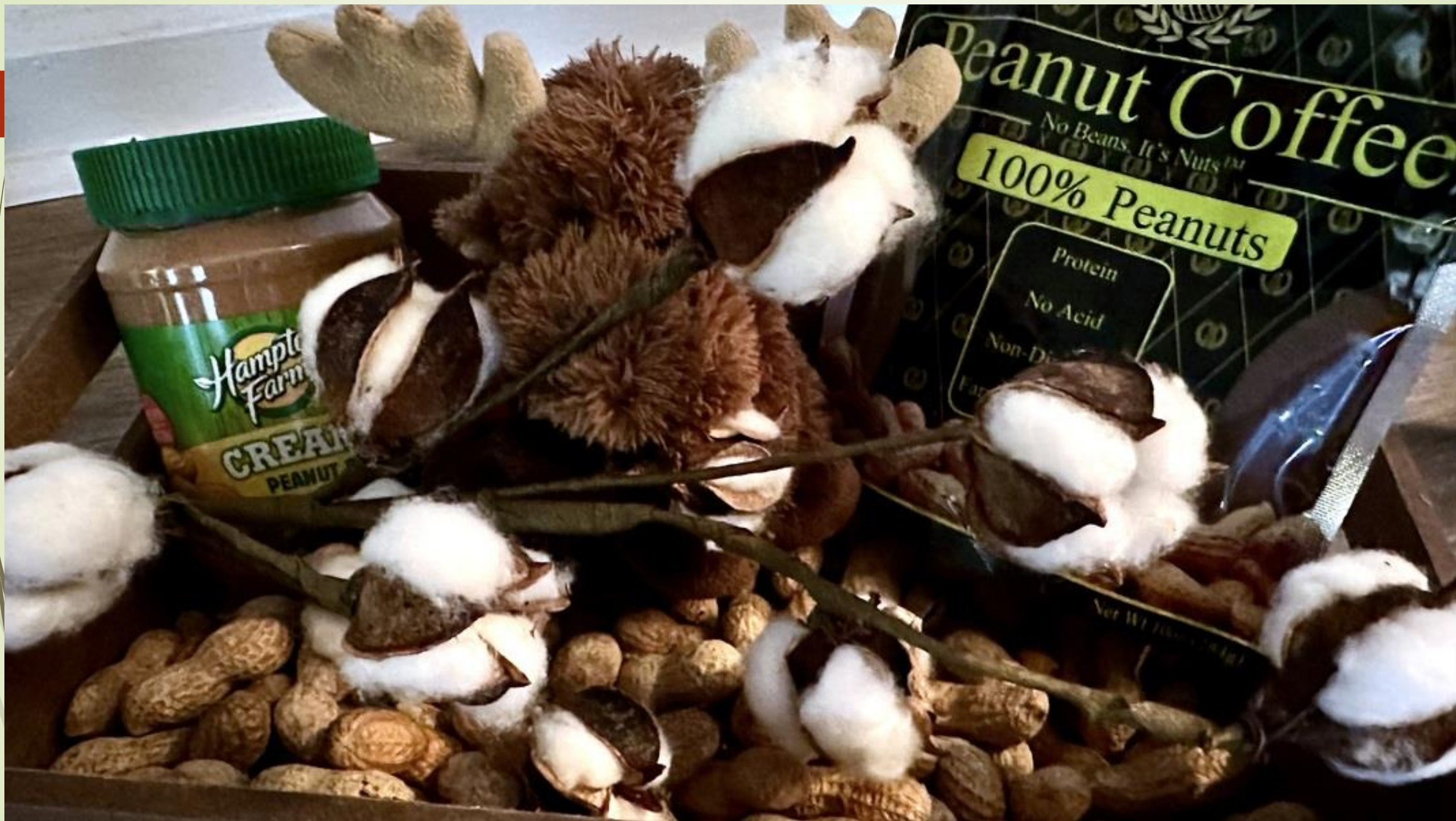
205-Sandra Knight - Greetings, y'all!