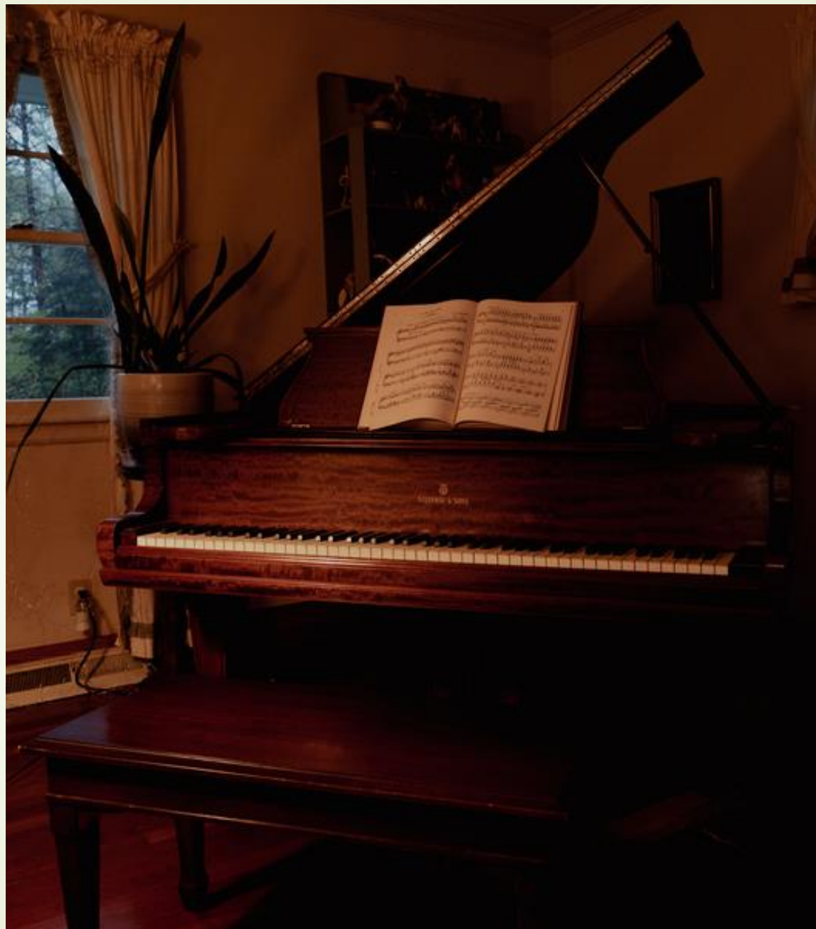
211- Karen Cole-Loy - Grand piano