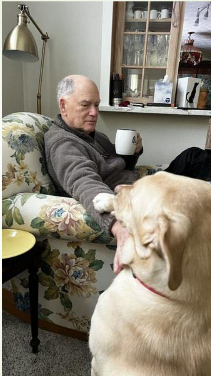
210-PJ - I'm Home!