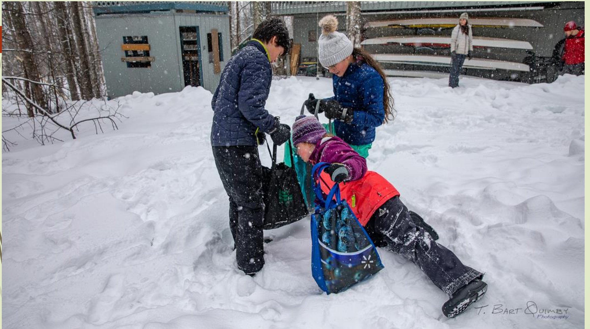
223-Bart Quimby - What's In Your Bag?