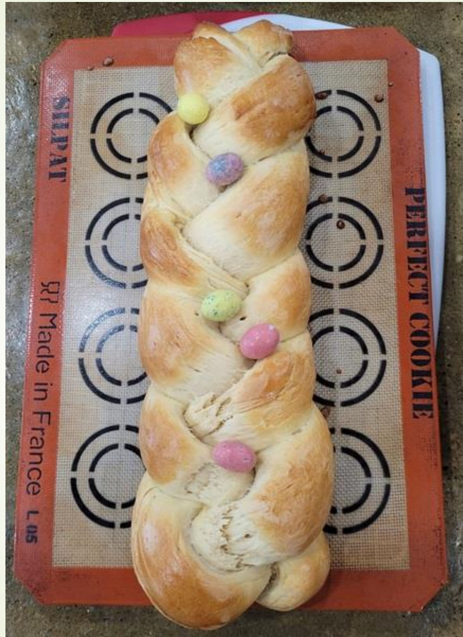
207-Rhonda - Baking success