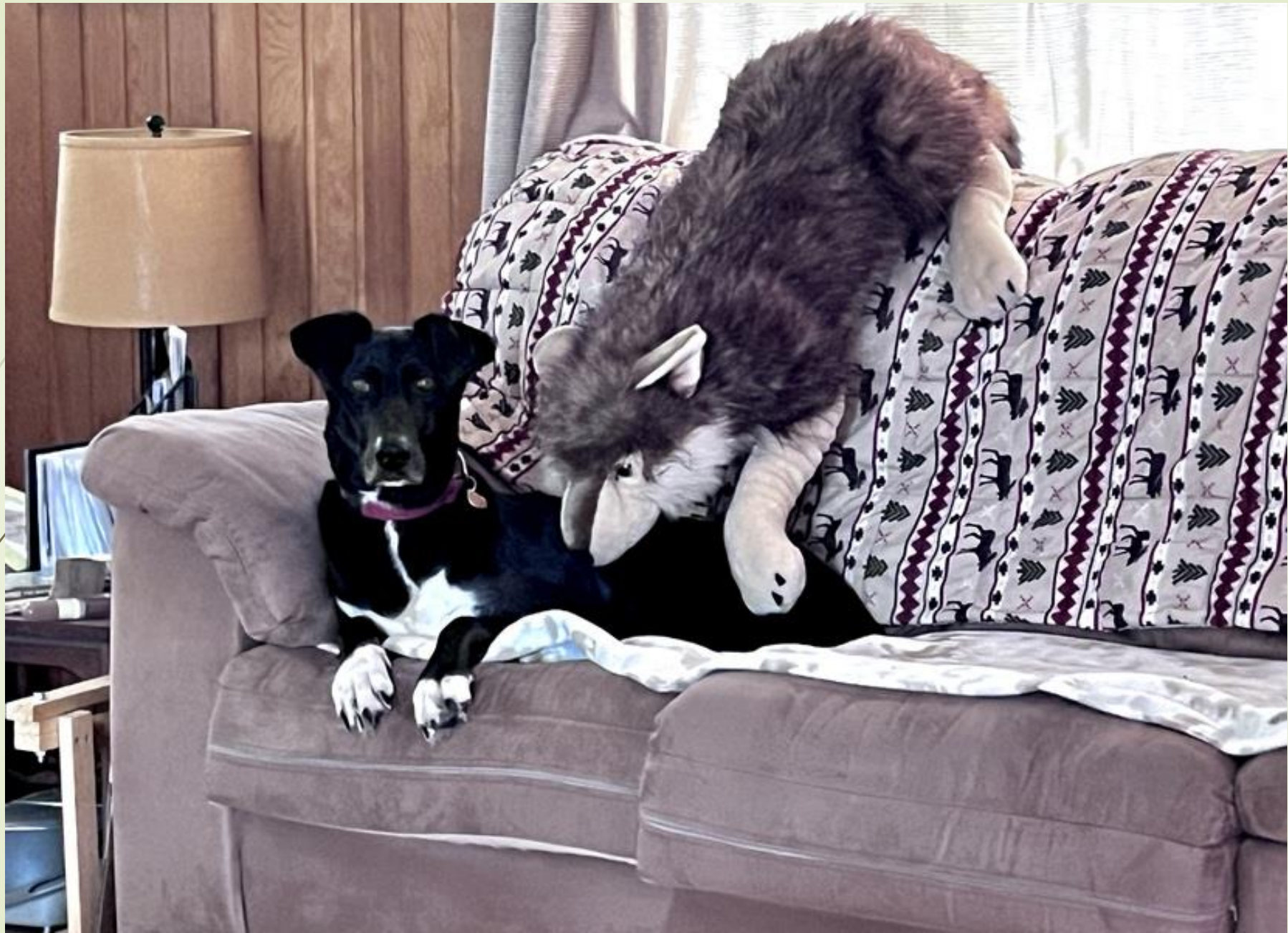
202-marty - What are you doing?