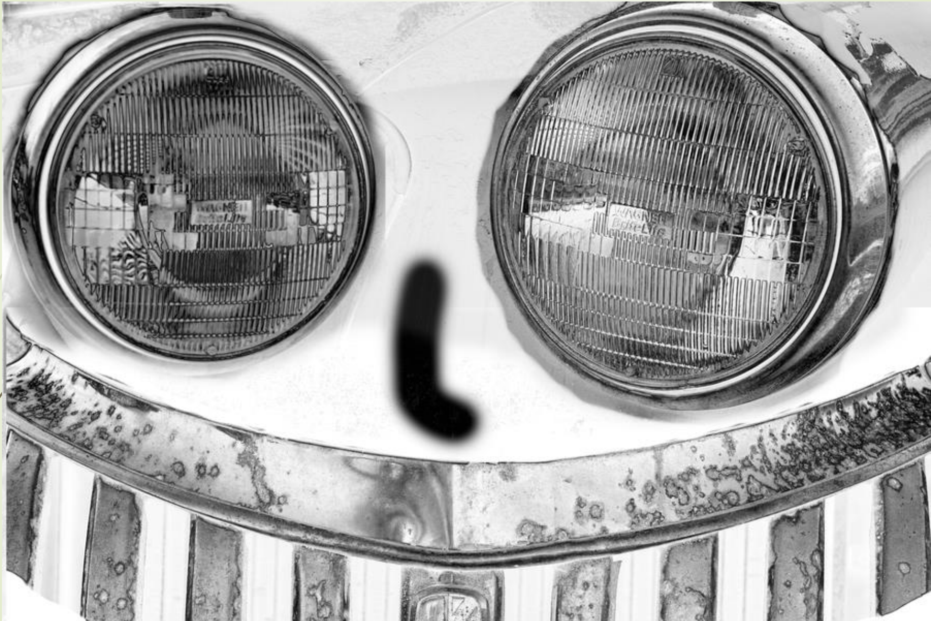
203-Ron Hoggard - Smiling Parts