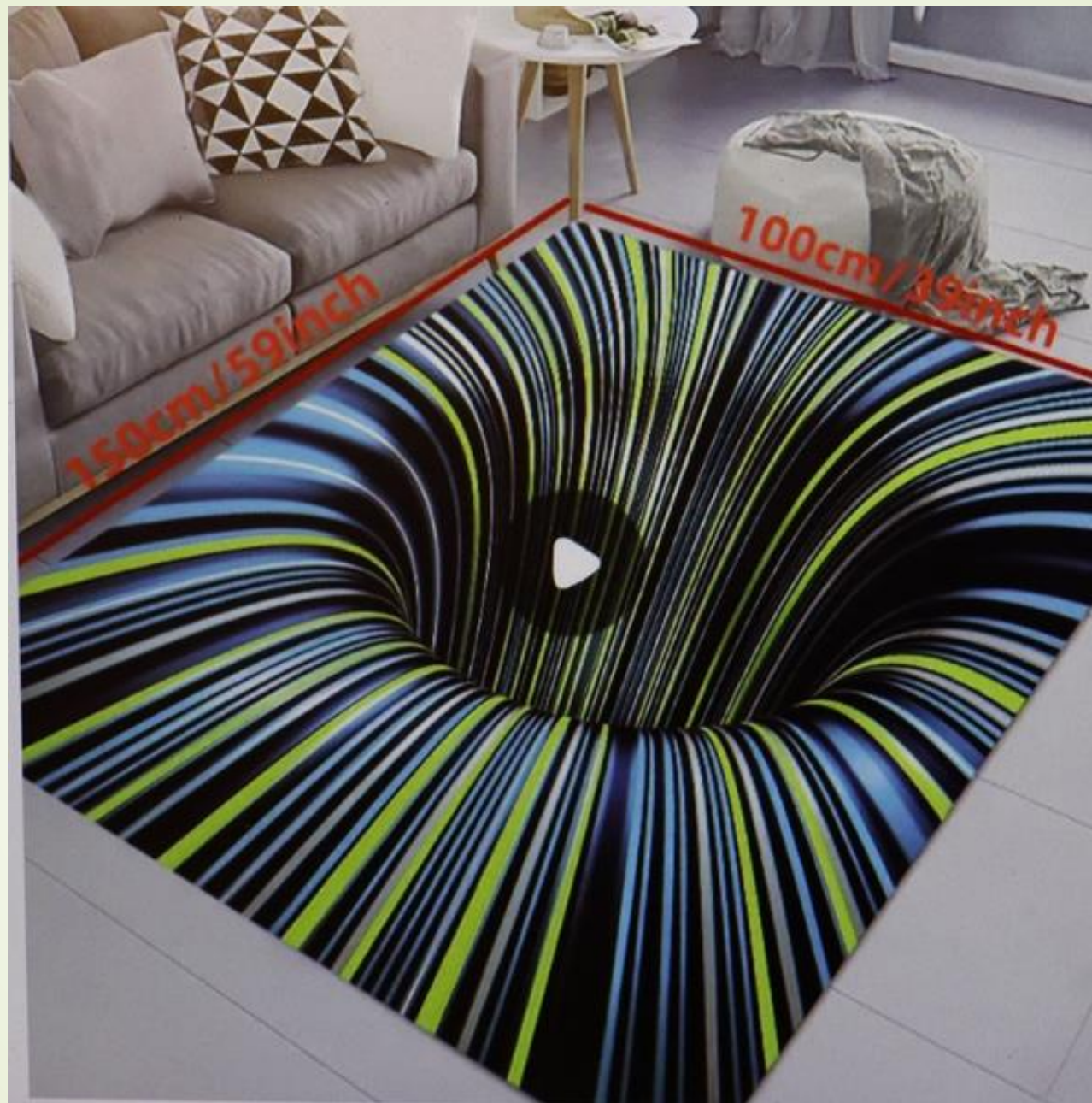
216-Carol Cole Renfro - Living room rug ad