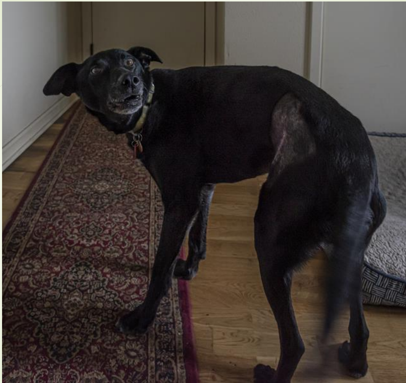
212-Bill Cole - Time for Barkfast Bill!