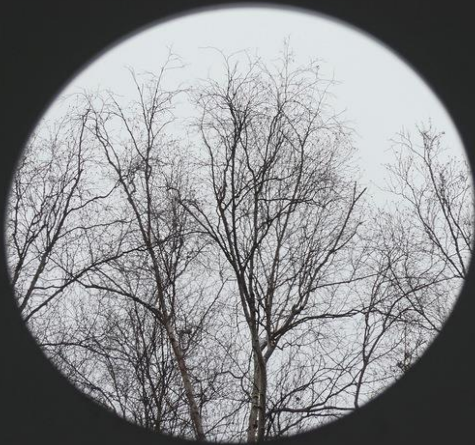
708-Betsey Howard - Spotlight