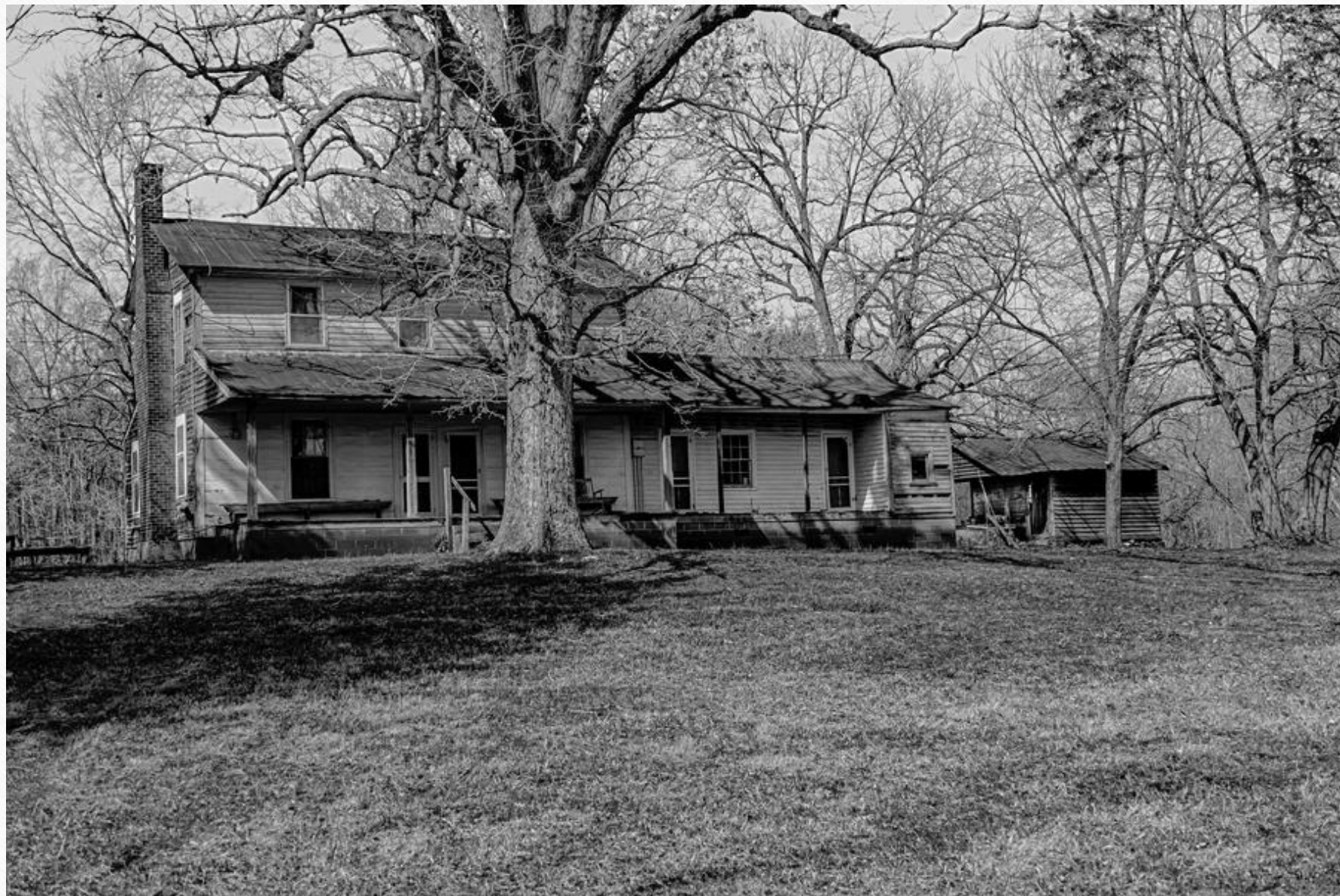
710-Karen Cole-Loy - Loy Homeplace