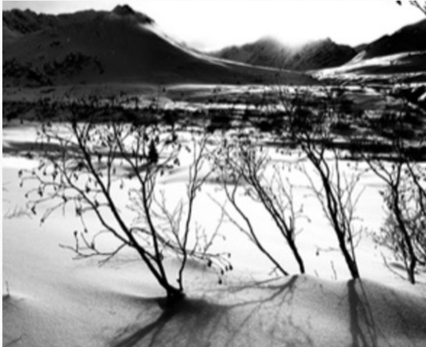
711-Meg Parsons - Alders along Gold Mint Trail