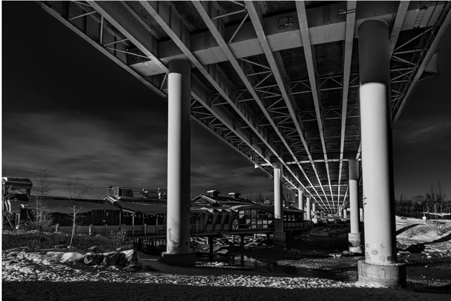
709-Bill Cole - C Street Overpass S