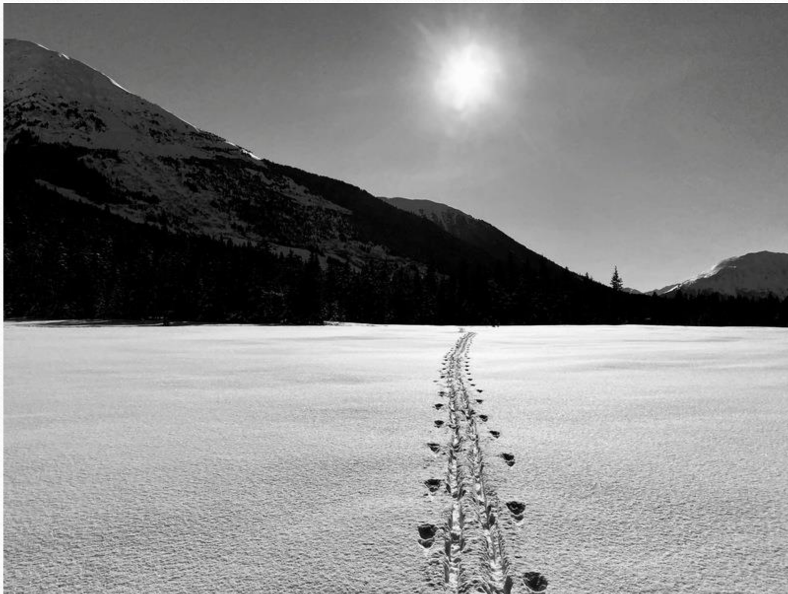
714-Ann Gray - #2 B&W Girdwood Tracks