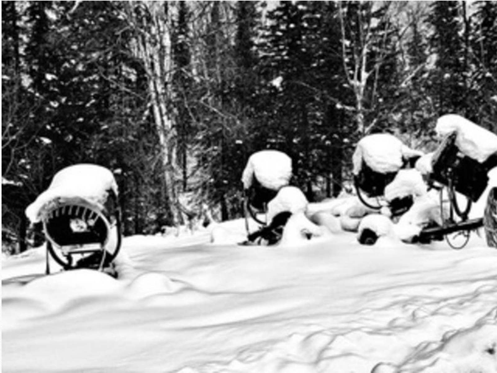
756-Meg Parsons - Snow Makers Not Needed