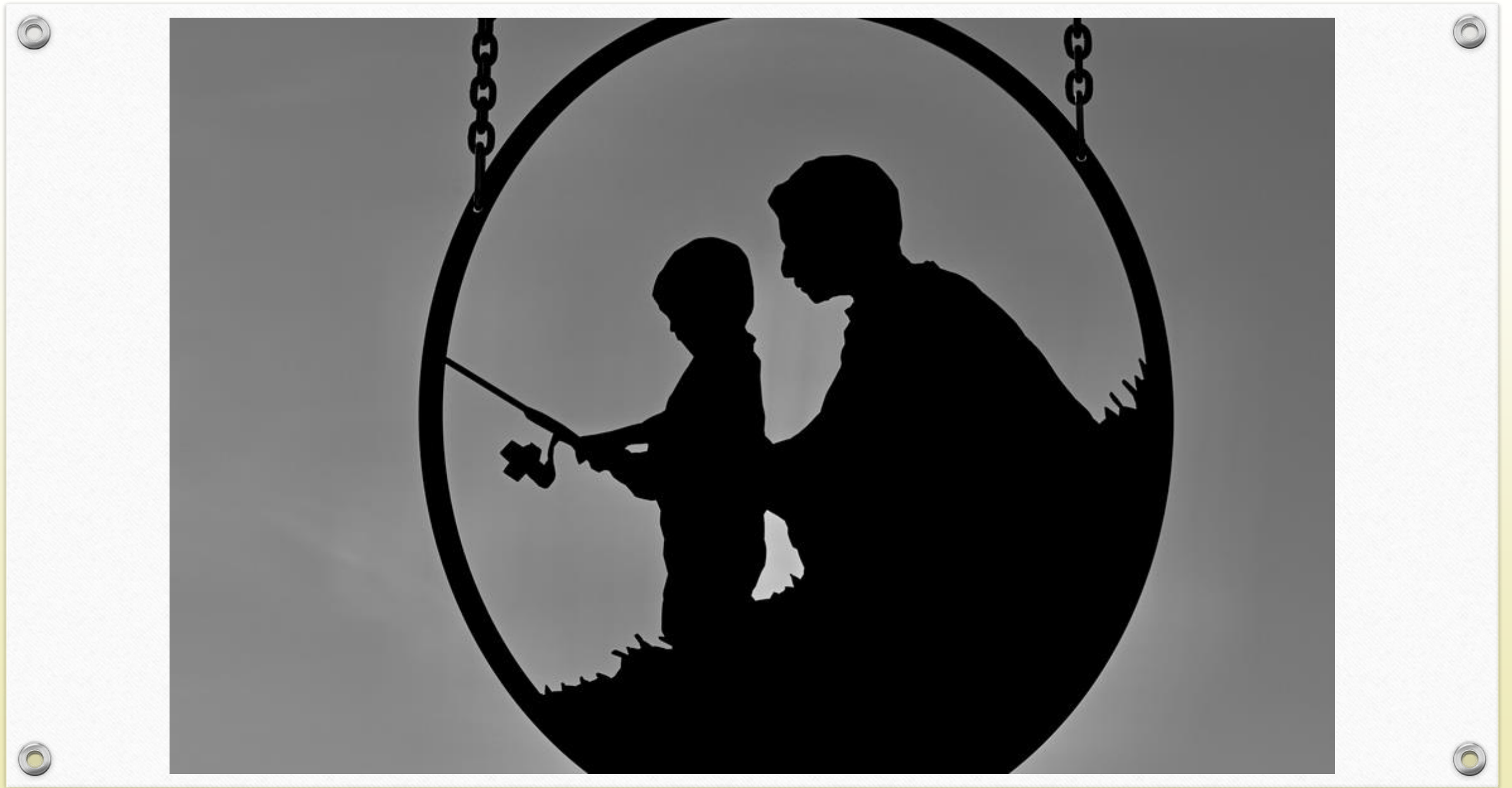
705-marty lyman - fisherman and child