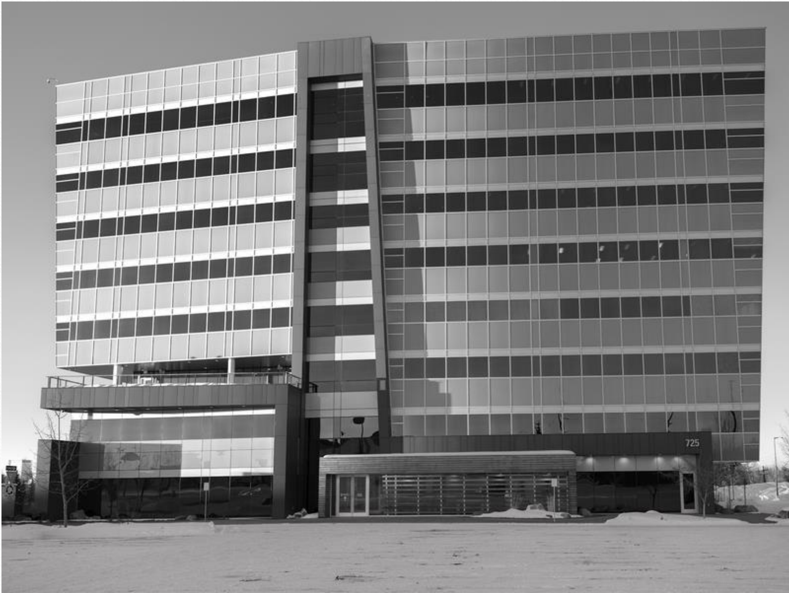
715-Mark Morones – Fireweed building _ 2nd choice