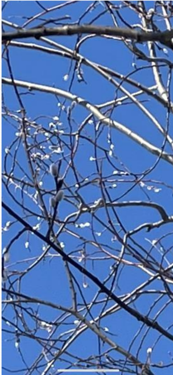
760-Pamela Mae-enough black & white Willow says