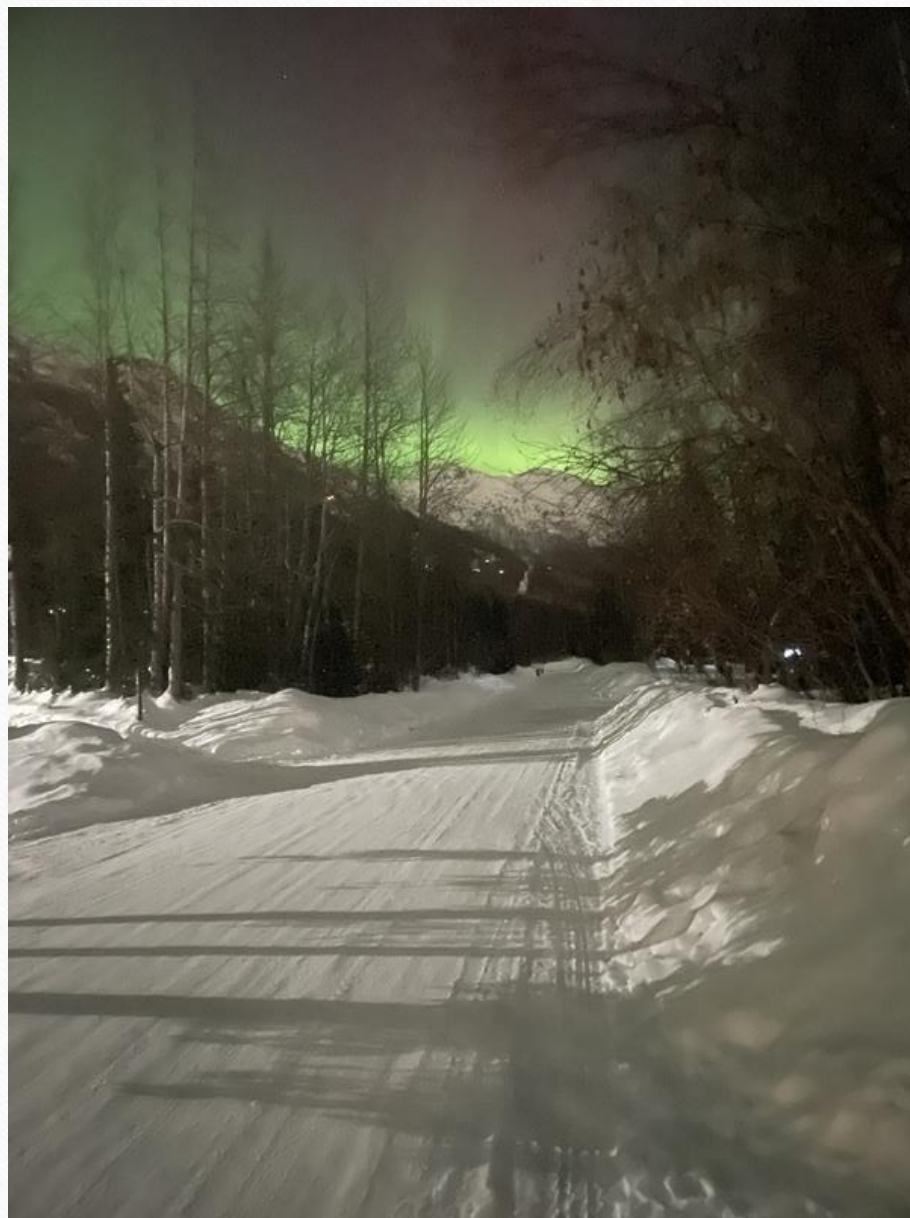
707-Pamela Mae-Alaska Black & White