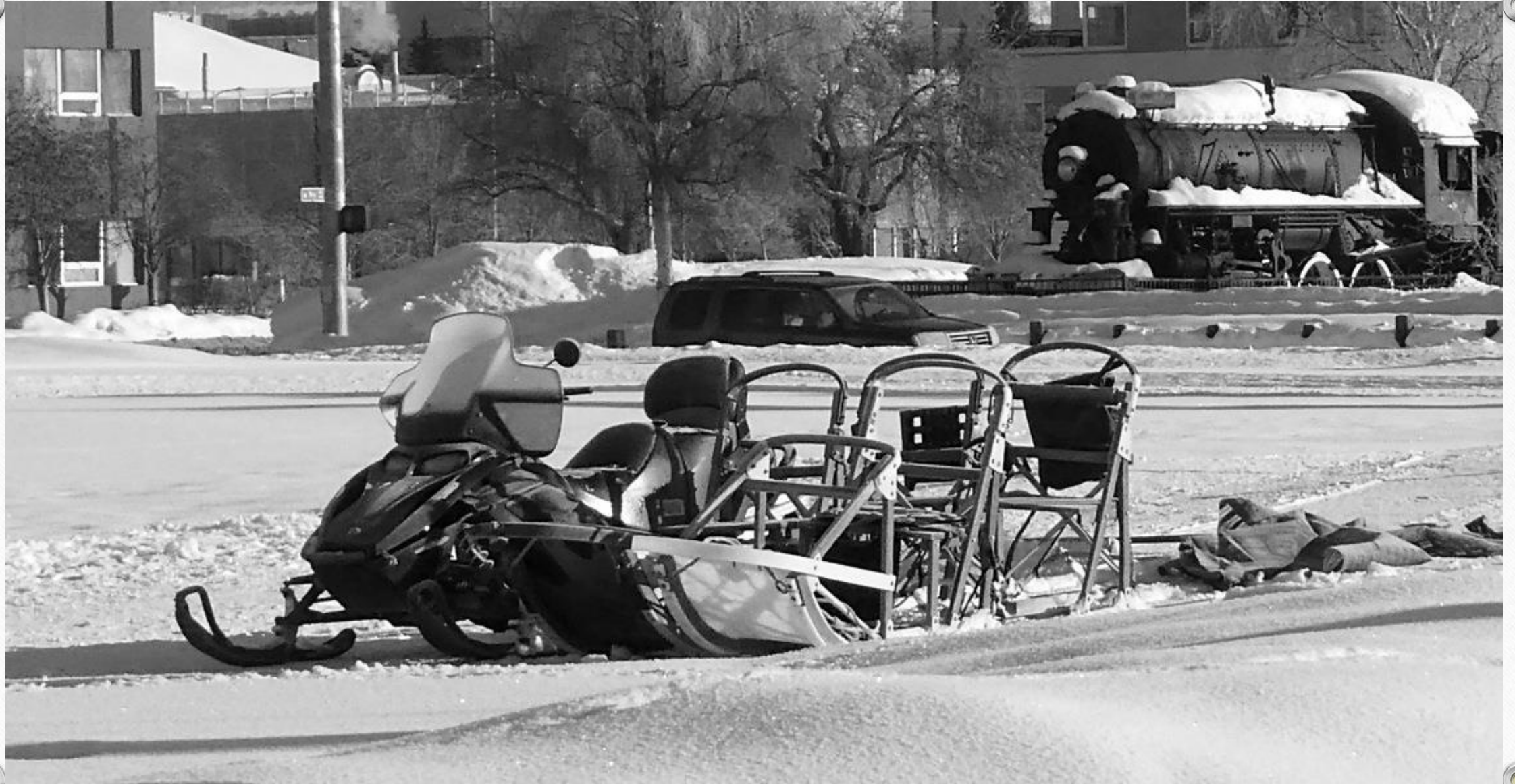
754-Betsey Howard - Need a ride