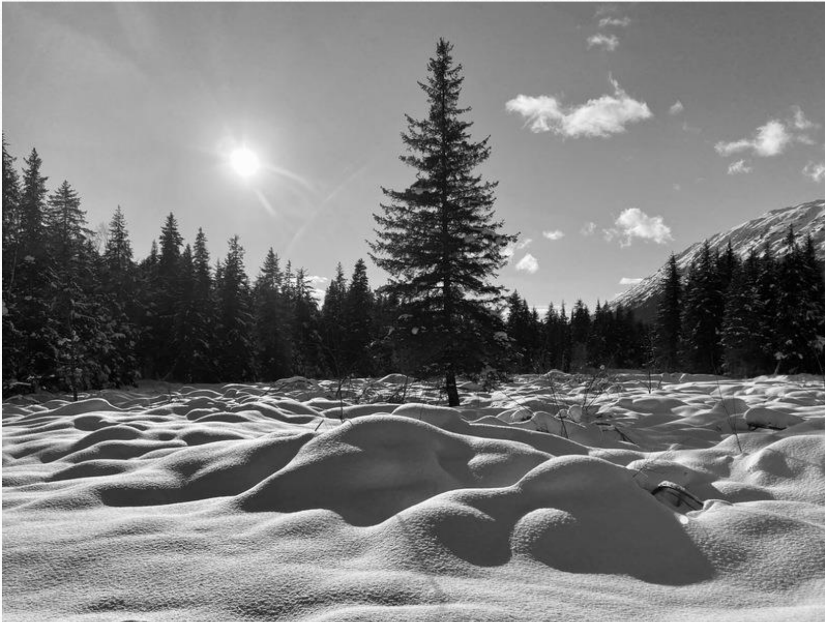
758-Ann Gray - Ann #1. B&W in Girdwood Meadows