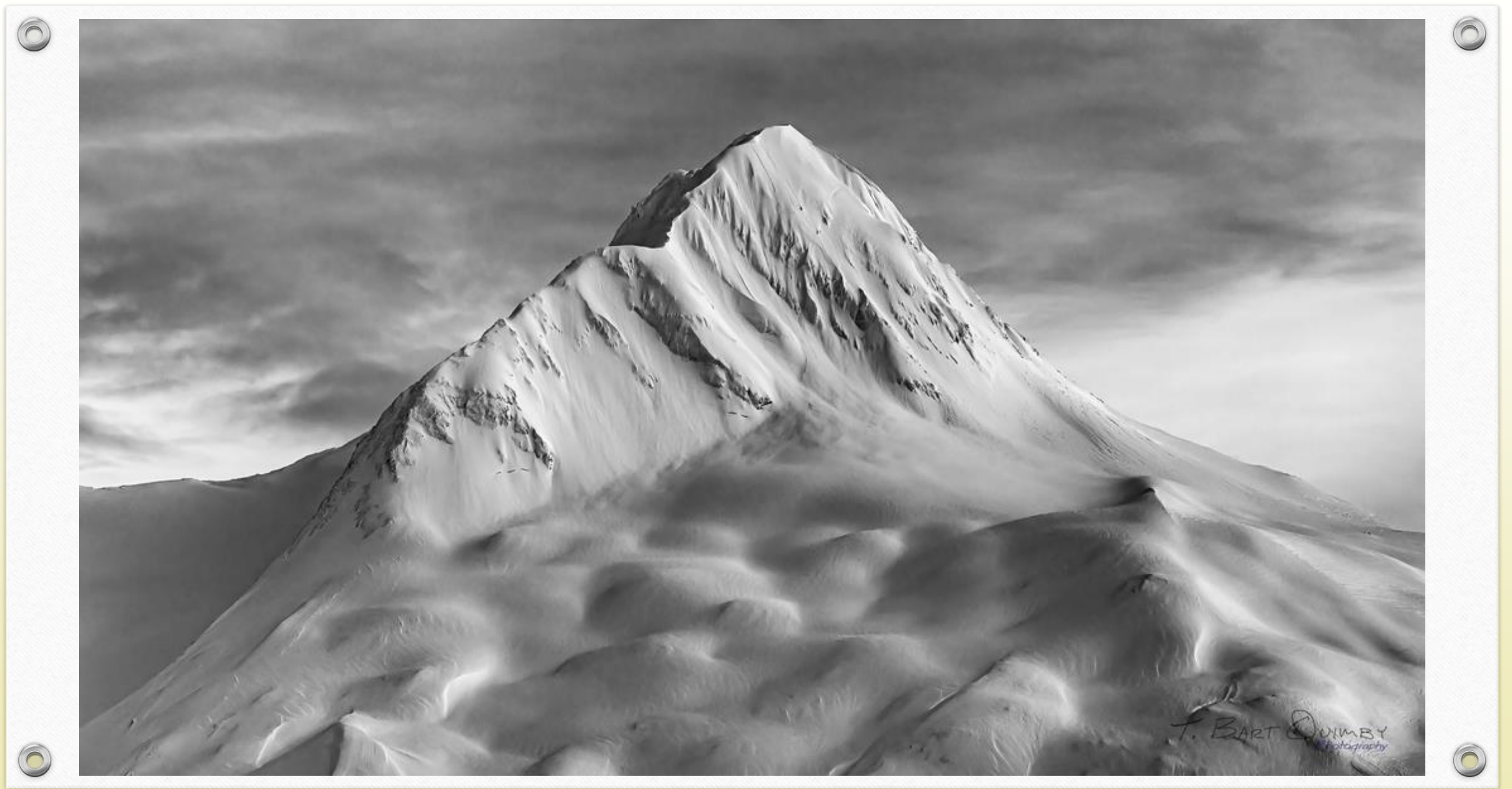
723-Bart Quimby – Mountain Shadows