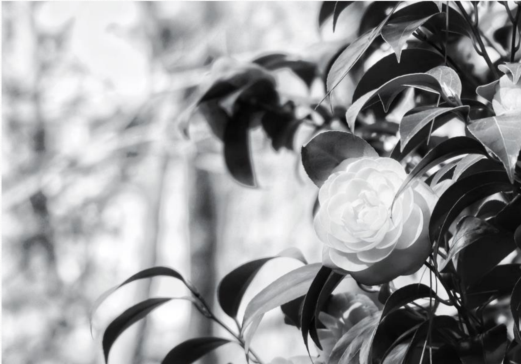
753-Sandra Knight - flower of winter