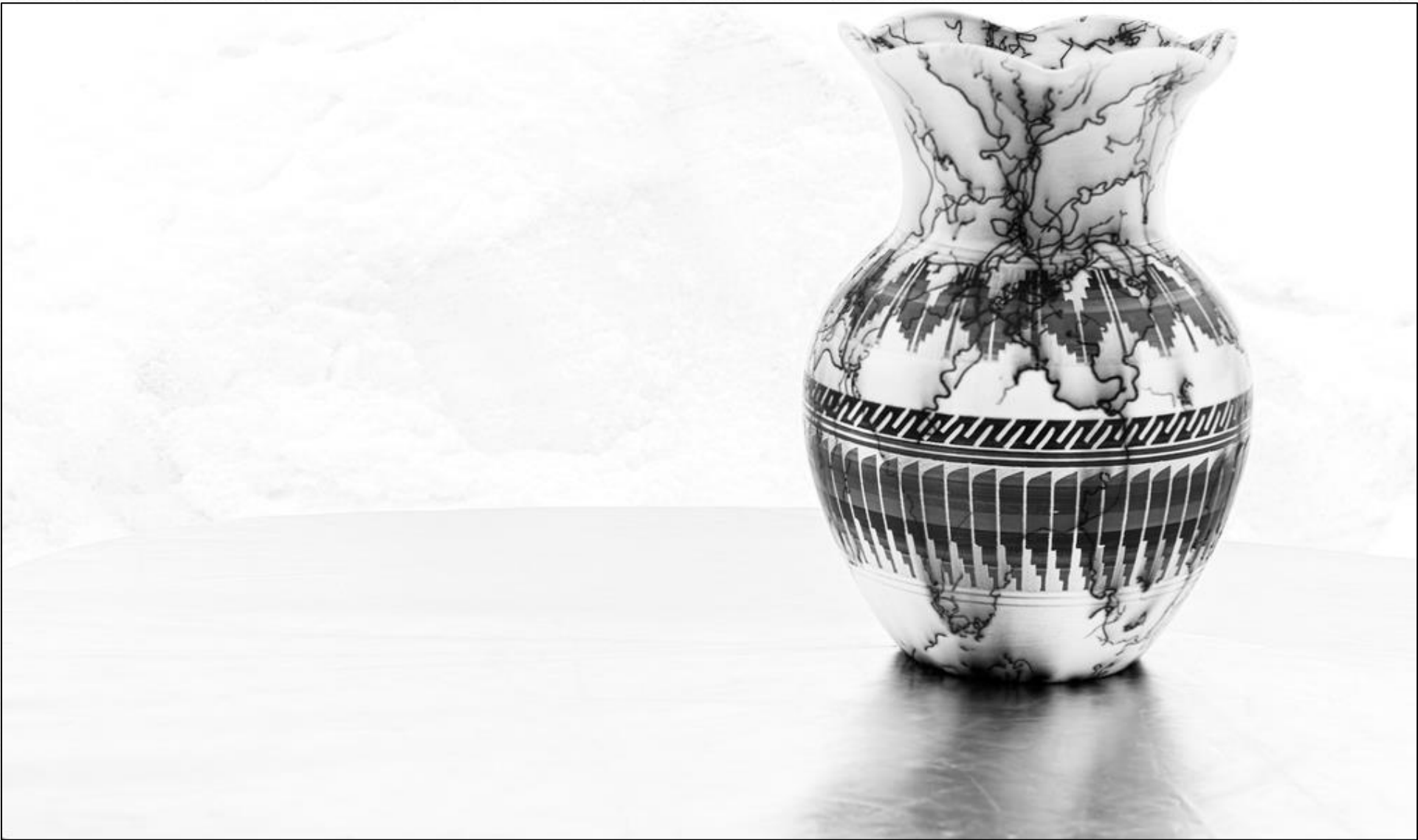
704-Ron Hoggard - Heritage