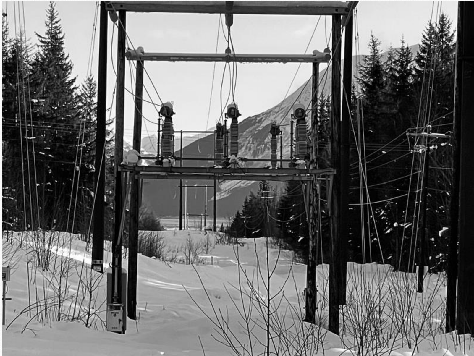
762-elly scott - POWER -LINES