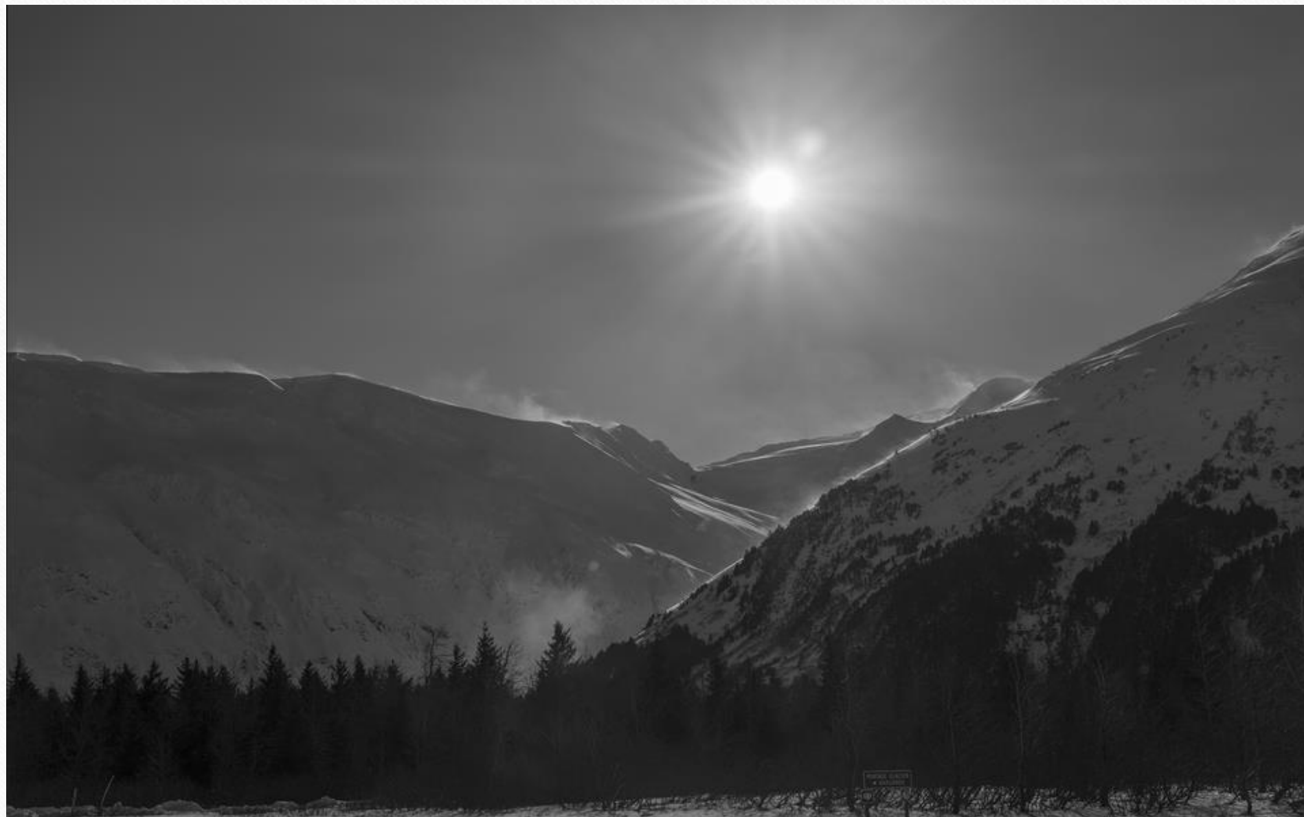
759-Mark Morones - towards Byron Glacier_1st choice