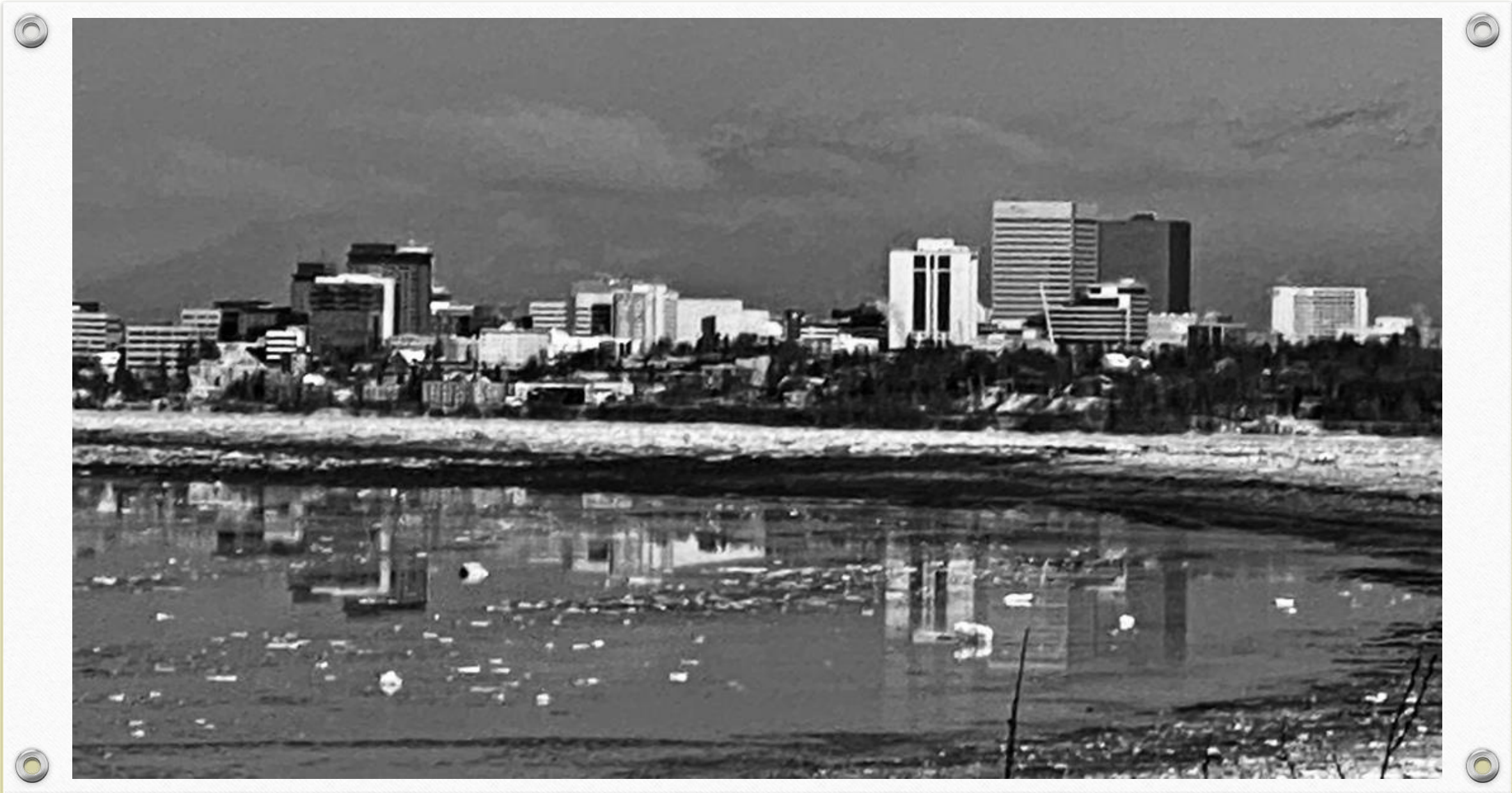
702-Shirley - Skyline