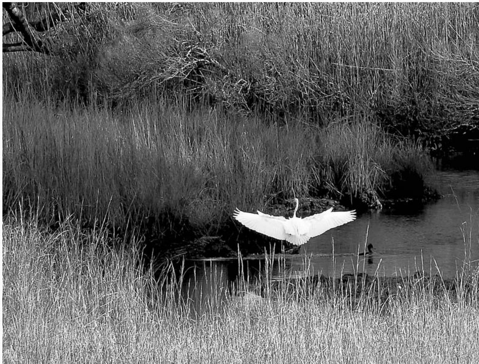
706-Sandra Knight – alert, alert