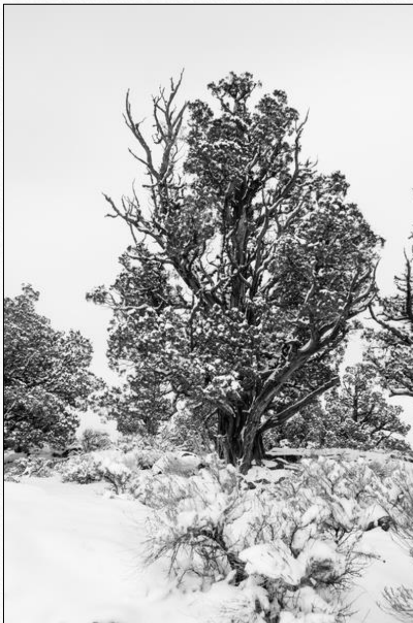
752-Glenn Cantor - Oregon Badlands Wilderness-2nd choice