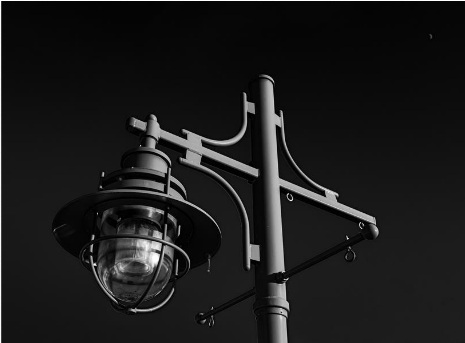
755-Bill Cole - Bill Cole Ship Creek Trail Lamp