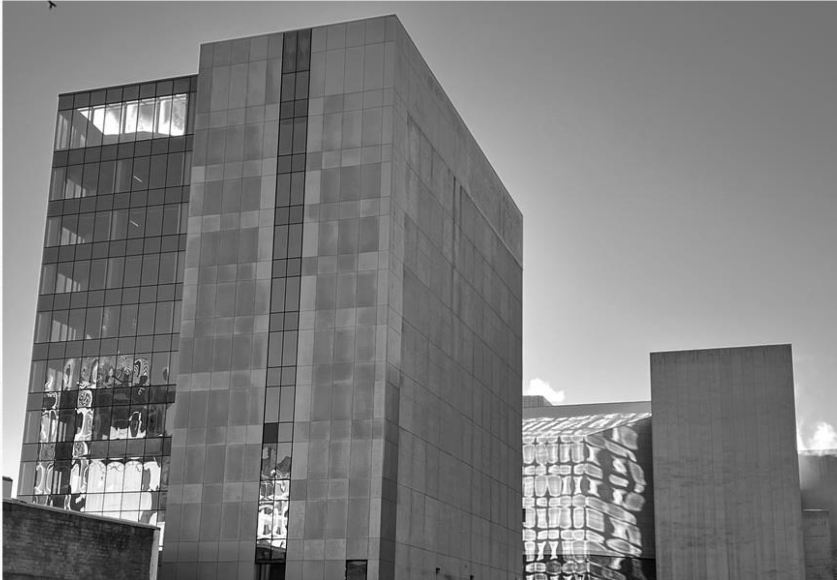
713-Janine Forrest - Downtown Drama