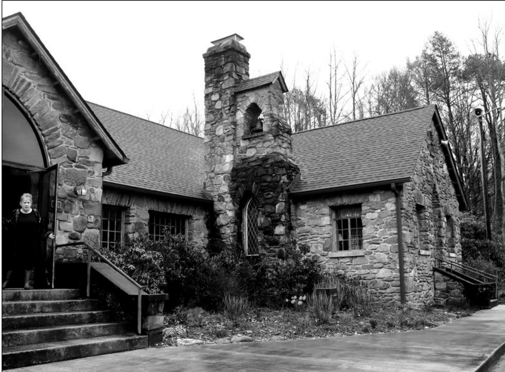
718-Carol Cole Renfro - Reems Creek-Beech Presbyterian gray