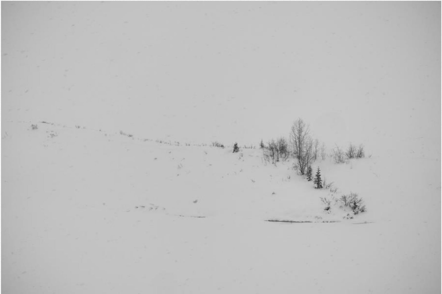
717-Jim Cantor - Denali storm