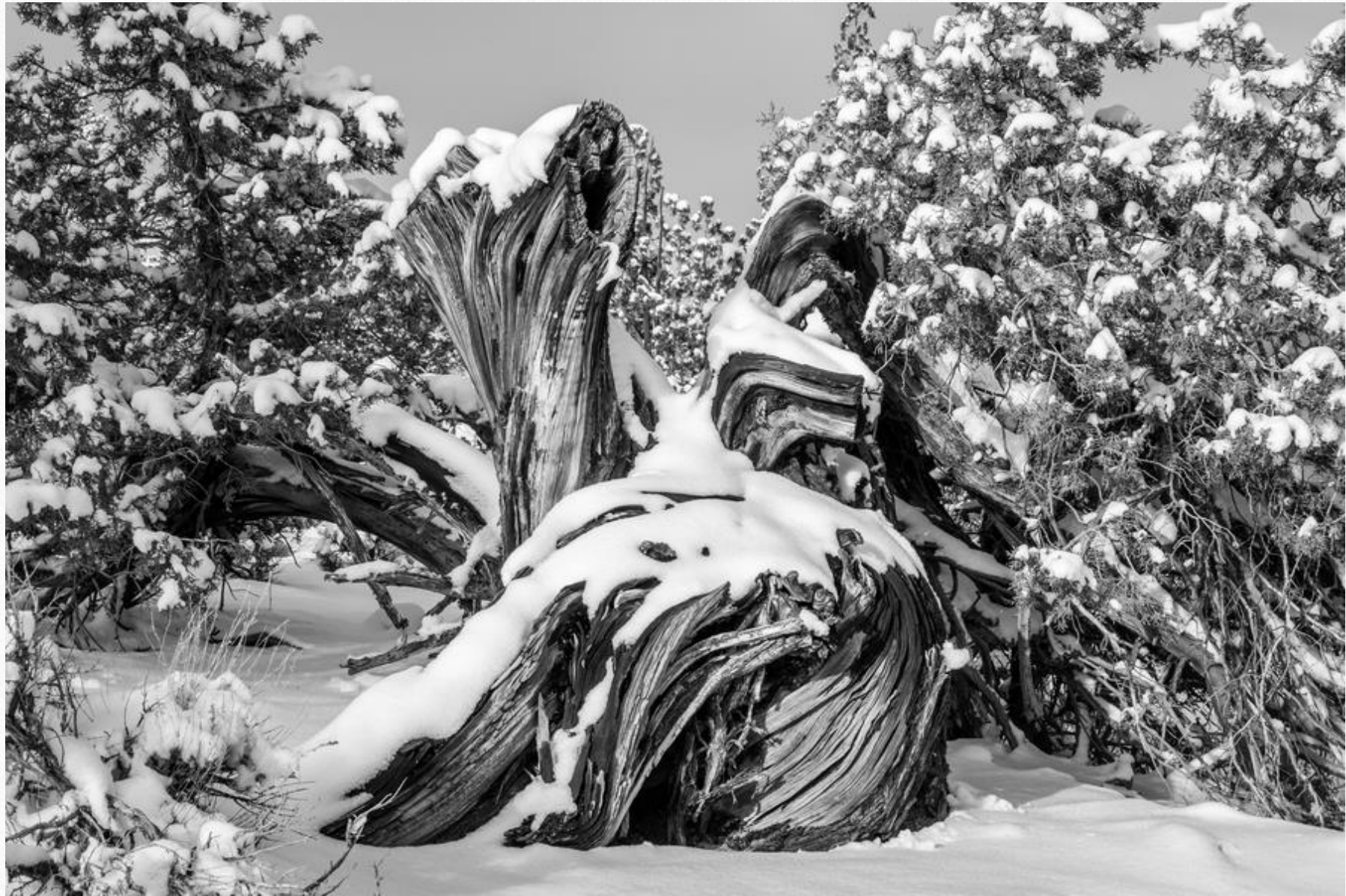
703-Glenn Cantor - Ancient Juniper-Oregon Badlands Wilderness