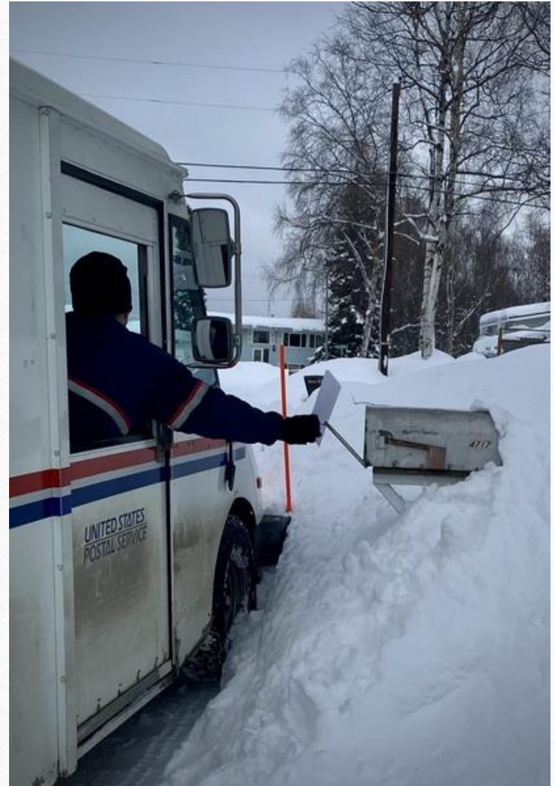
Mail delivered to home