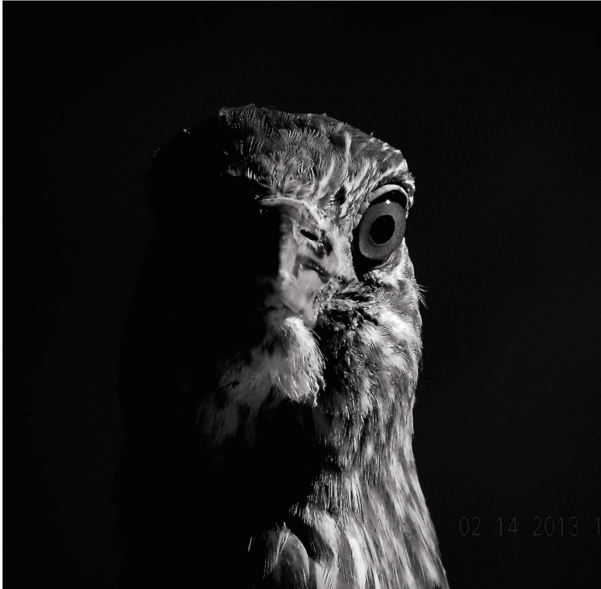
Sandra Knight 2021 Ole Photo SIG Show