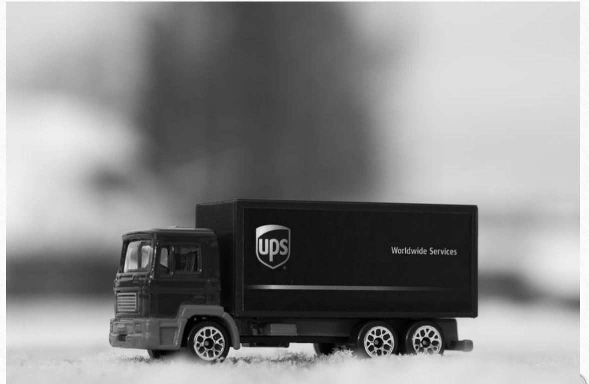
UsPS ground snail