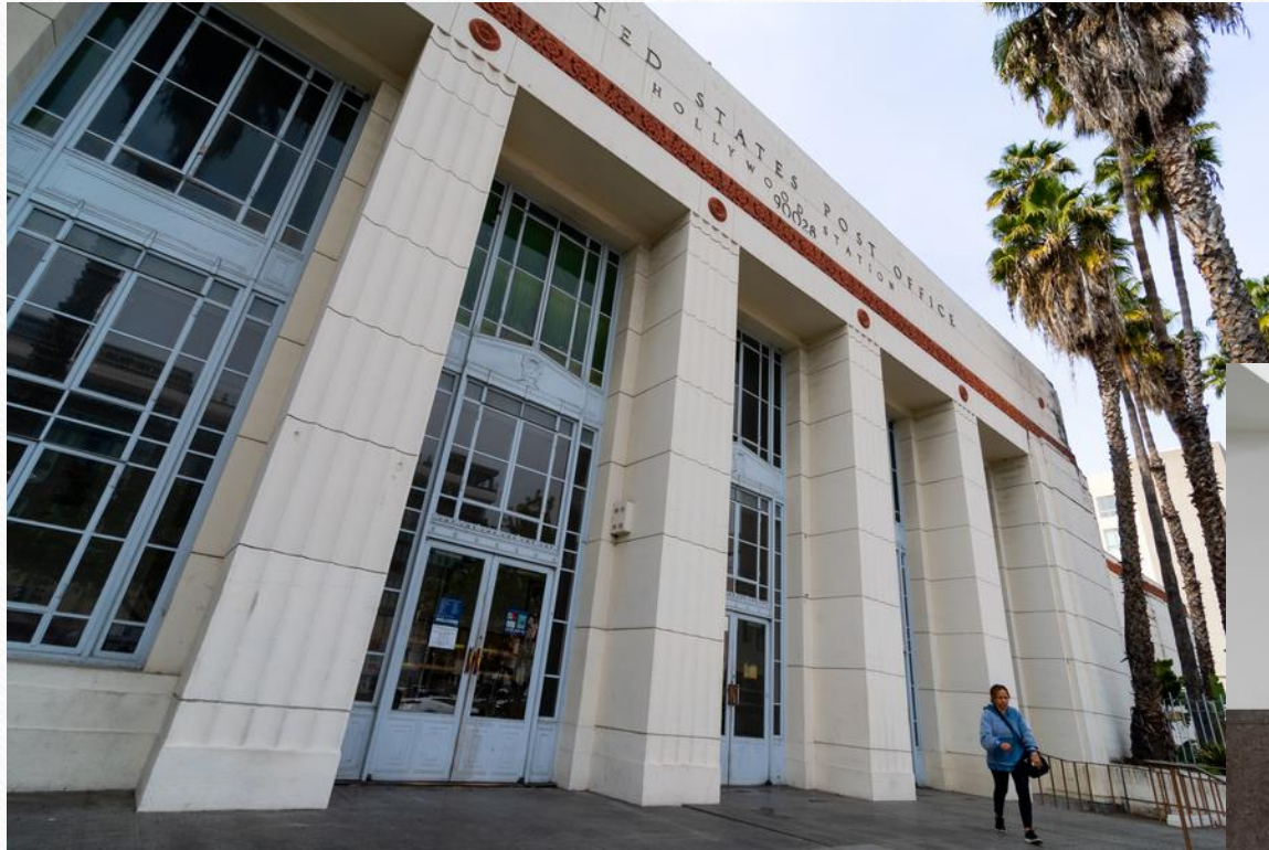
Post Office in Hollywood California- Classic 1920's architecture