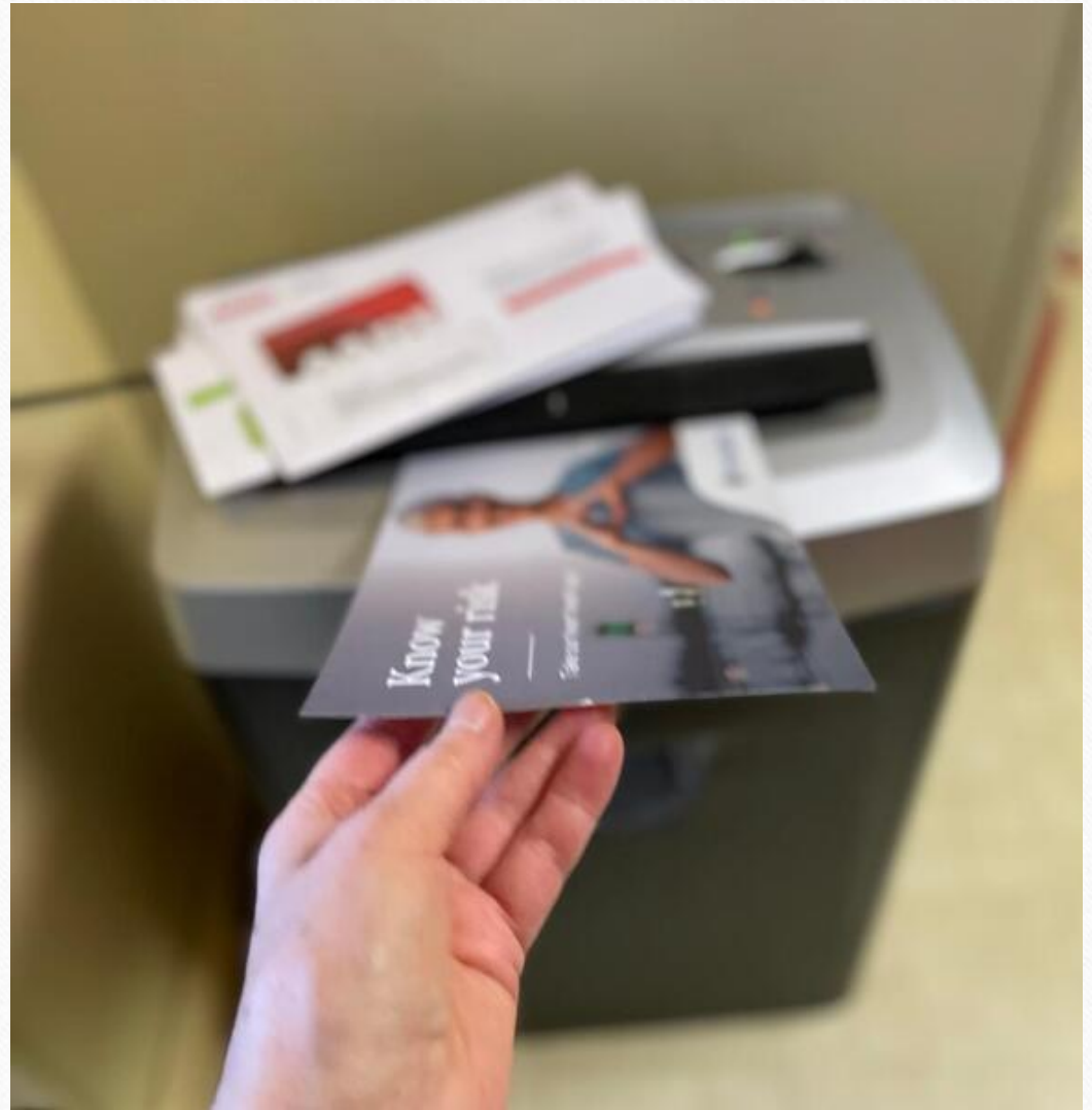
Postal Chapter 2