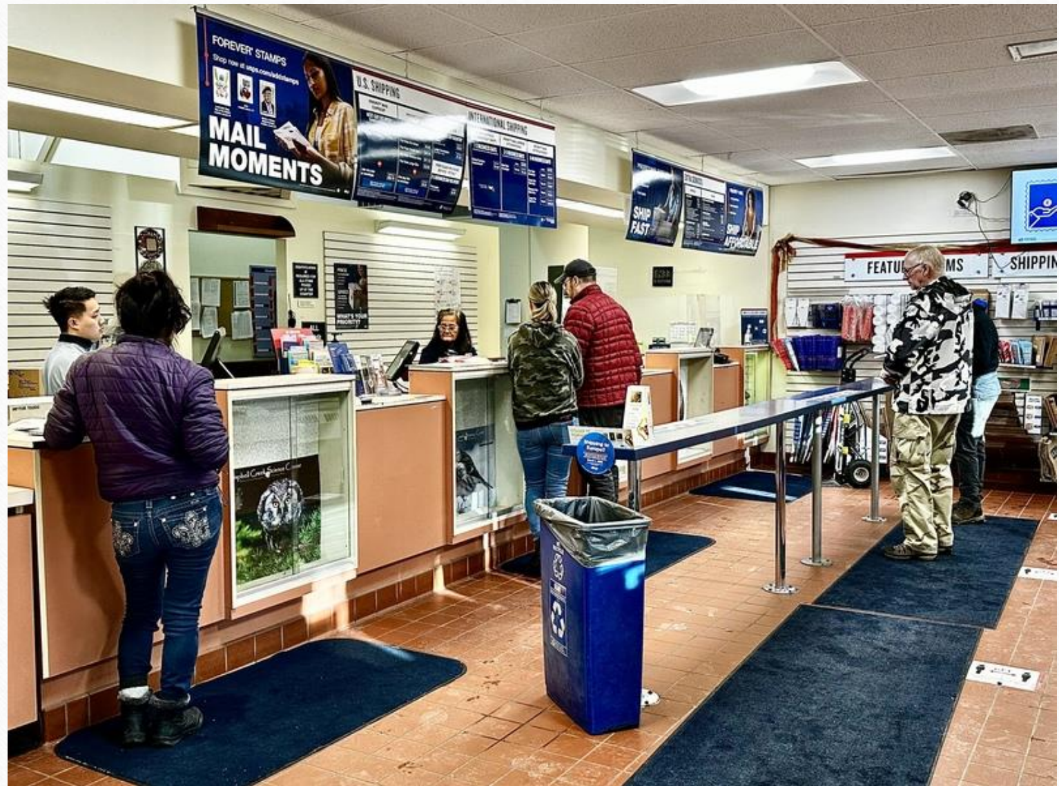
Snail Mail Lobby Line