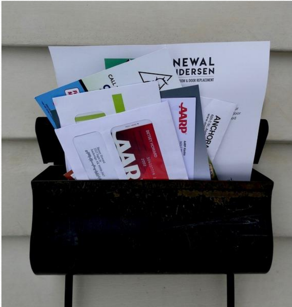
Postal Chapter 1