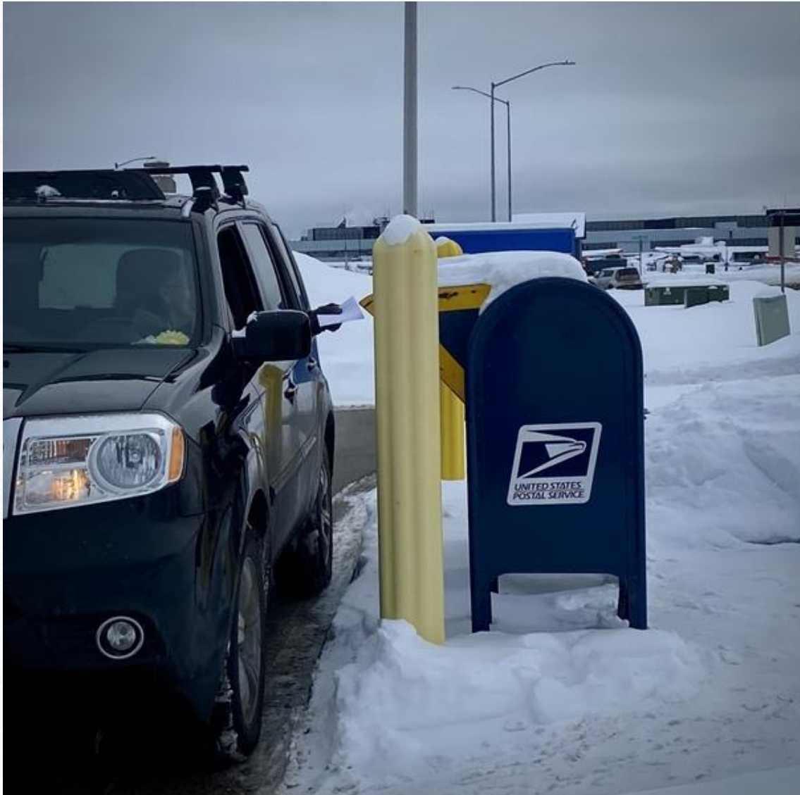
Sending mail out