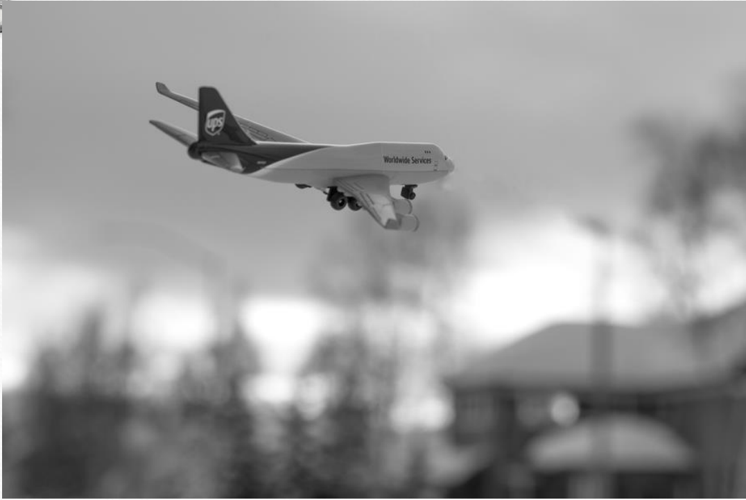
UsPS air snail