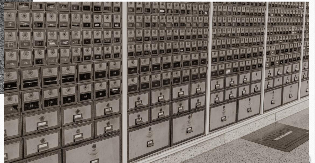
612-Karen Cole-Loy Postal connections (city and rural) through the centuries