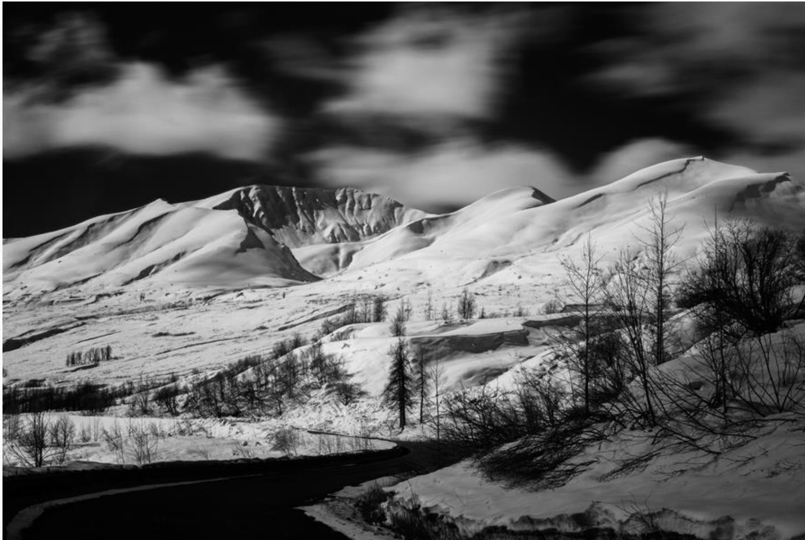
Chuck Iliff 2022 Ole Photo SIG Show