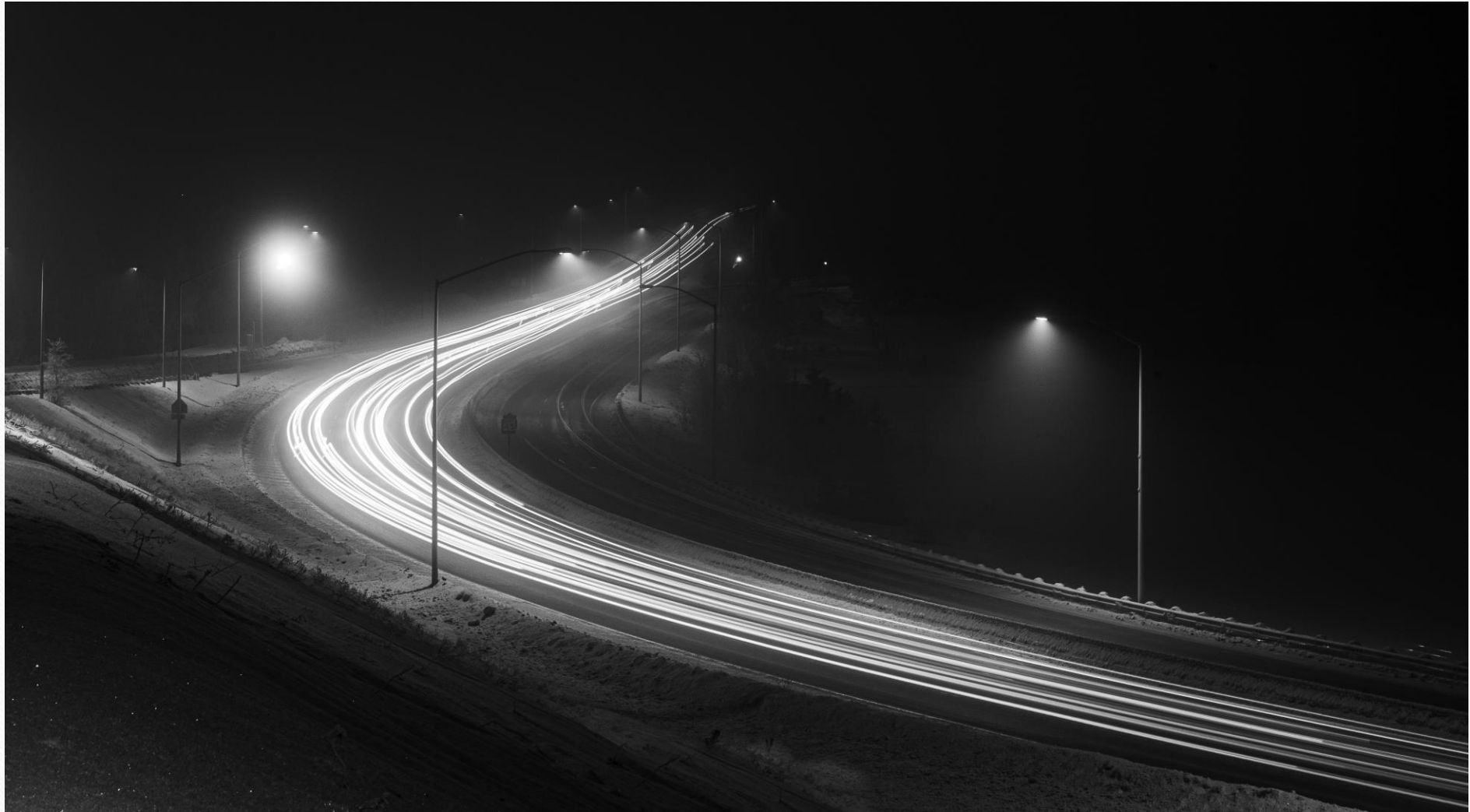
Bill Cole 2021 Ole Photo SIG Show