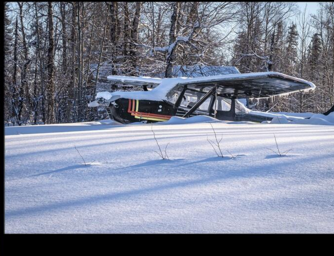
616-Jim Cantor - Rural Alaska postal system