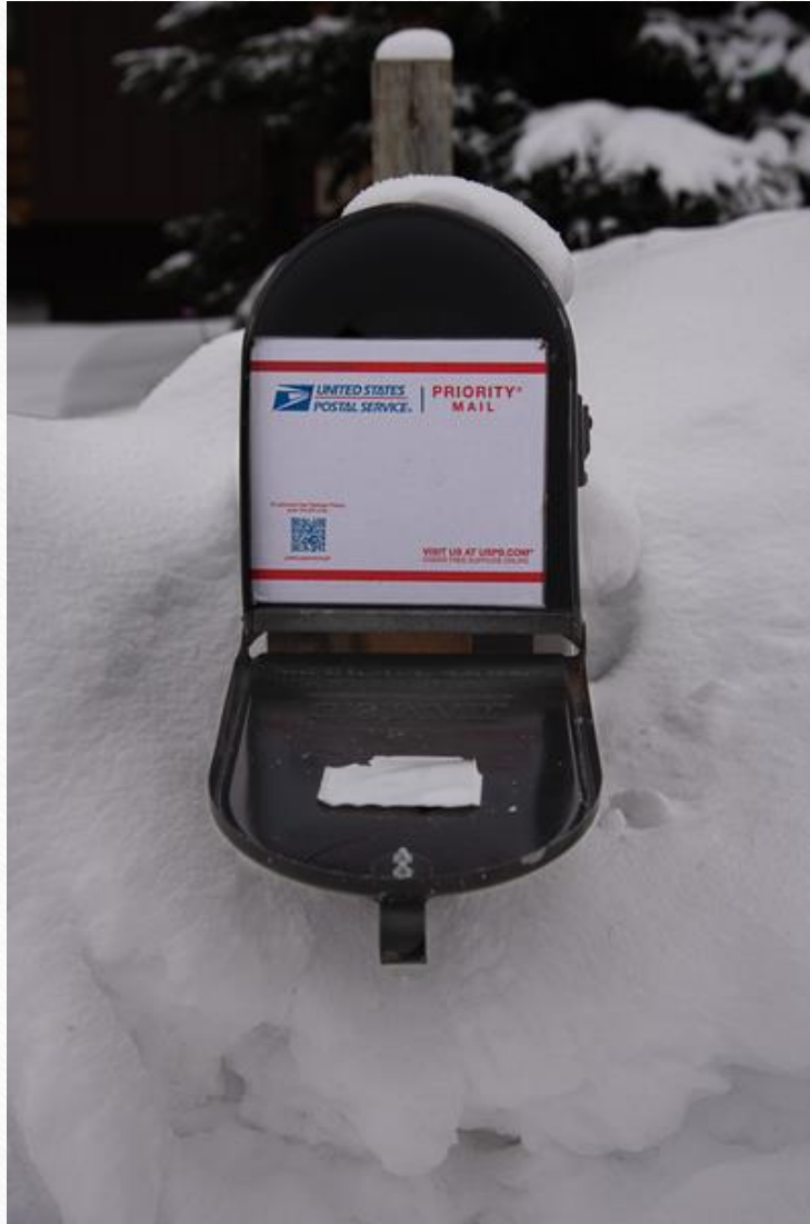
Entering the Postal System