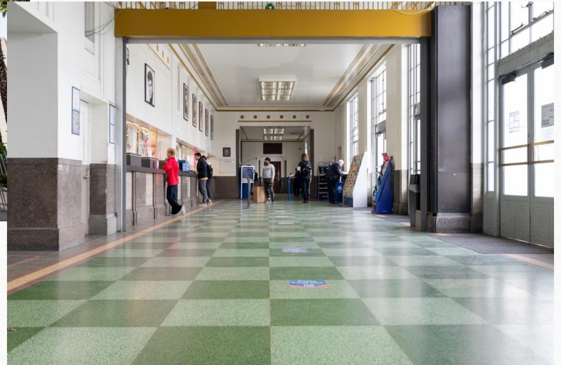
Post Office in Hollywood California- Interior