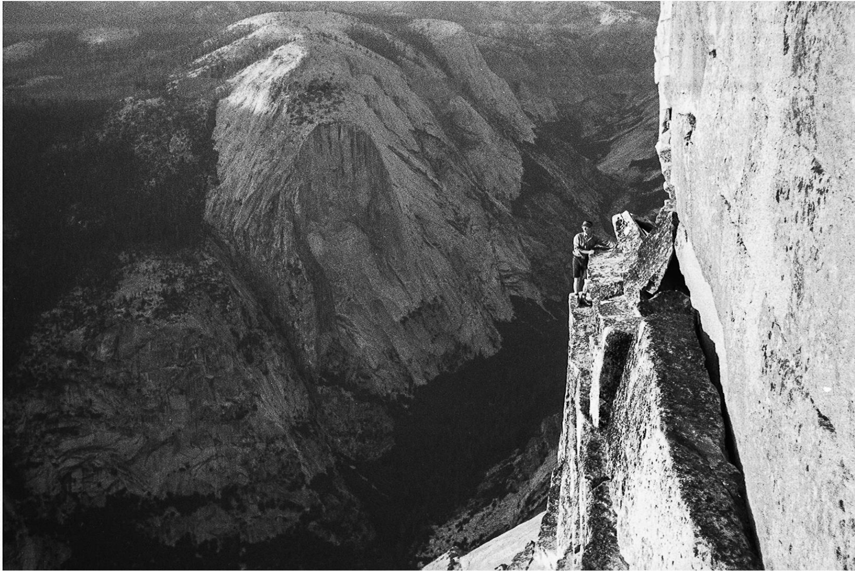
Bart Quimby – Half Dome, 1974