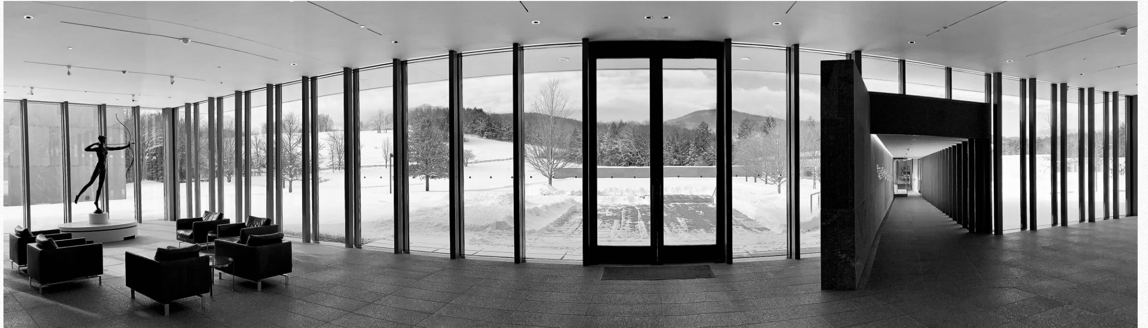
Amy MacKenzie 2021 Ole Photo SIG Show