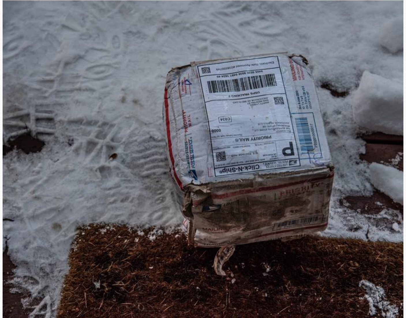
Exiting the Postal System