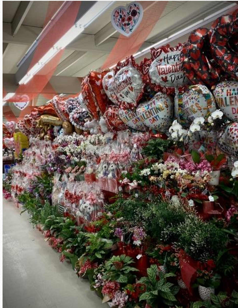
502-Shirley - What is the next Holiday