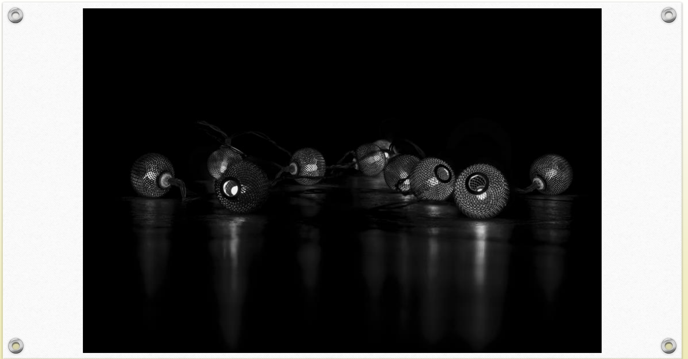
557-Mark Morones - caged light (image stack) (s)