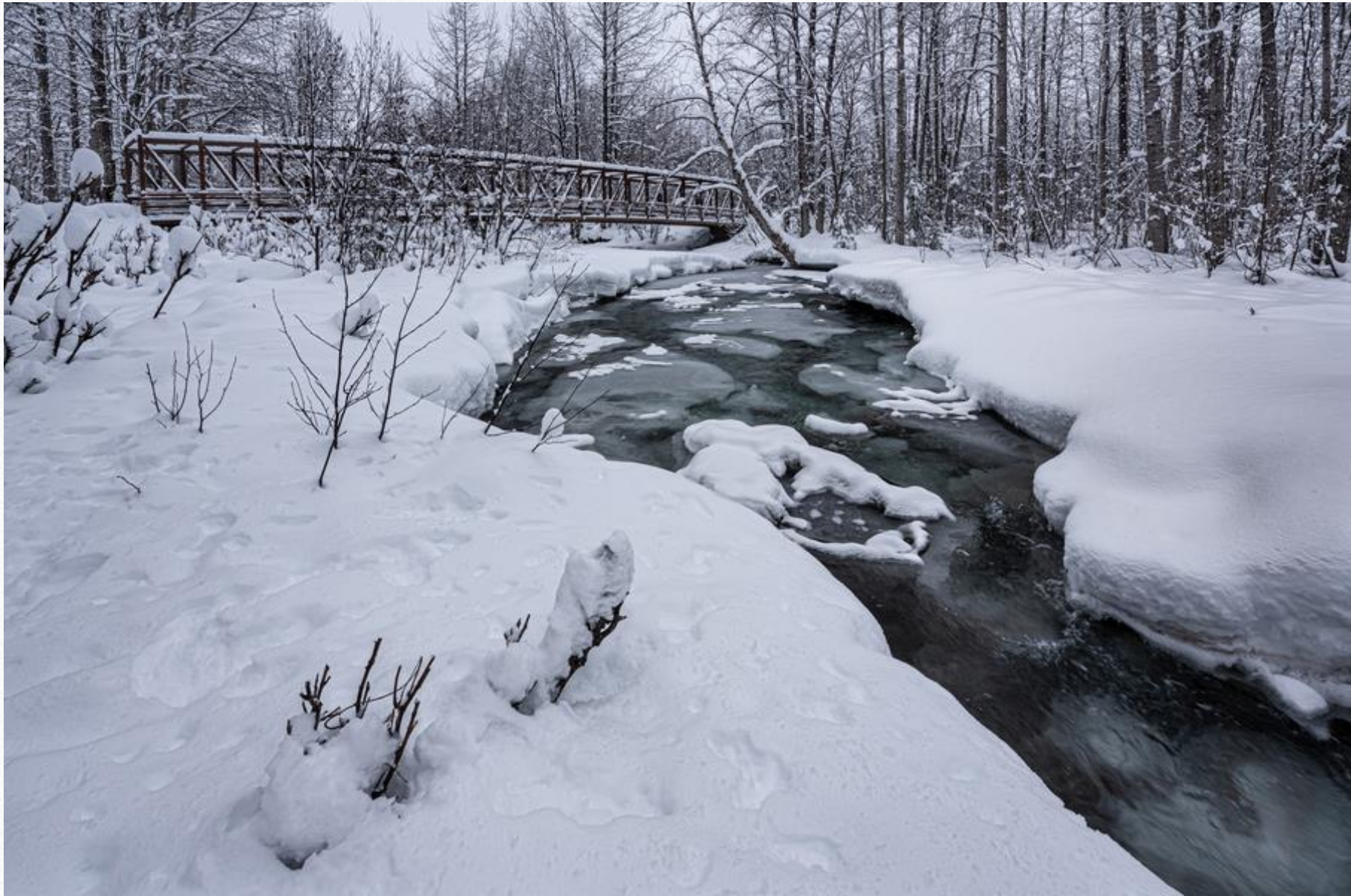
510-Bill Cole - Campbell Creek and bridge 2