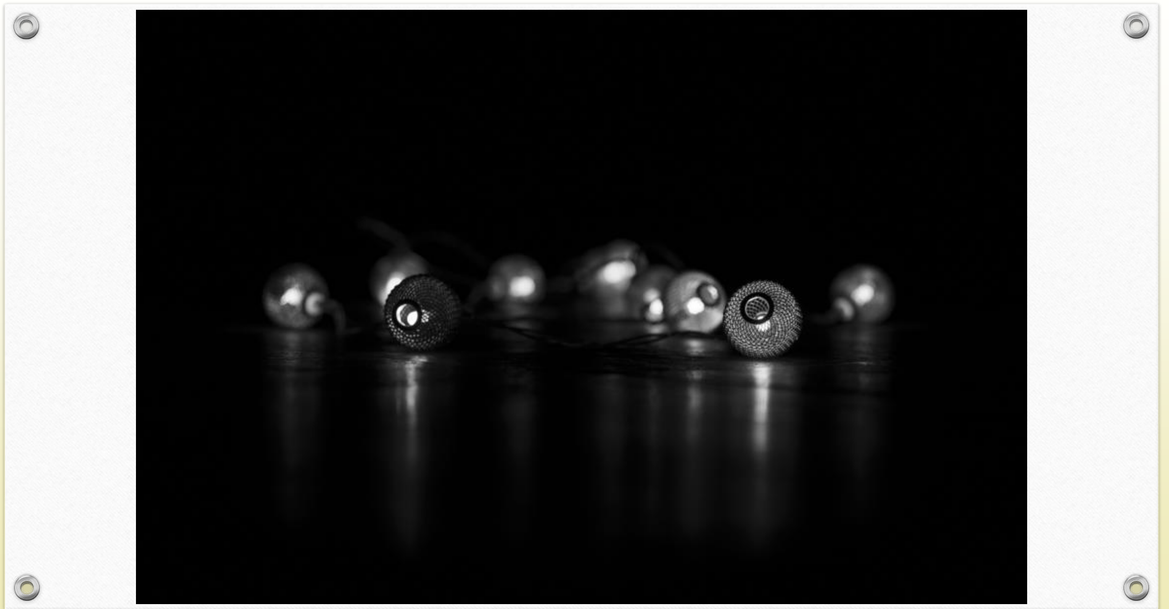
512-Mark Morones - Caged Light (shallow DOF)(s)