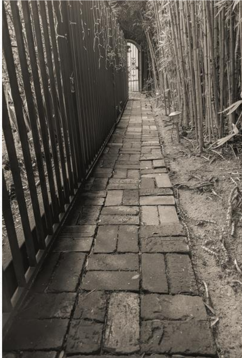
505-Glenn Cantor - What's Out There - 2nd Choice