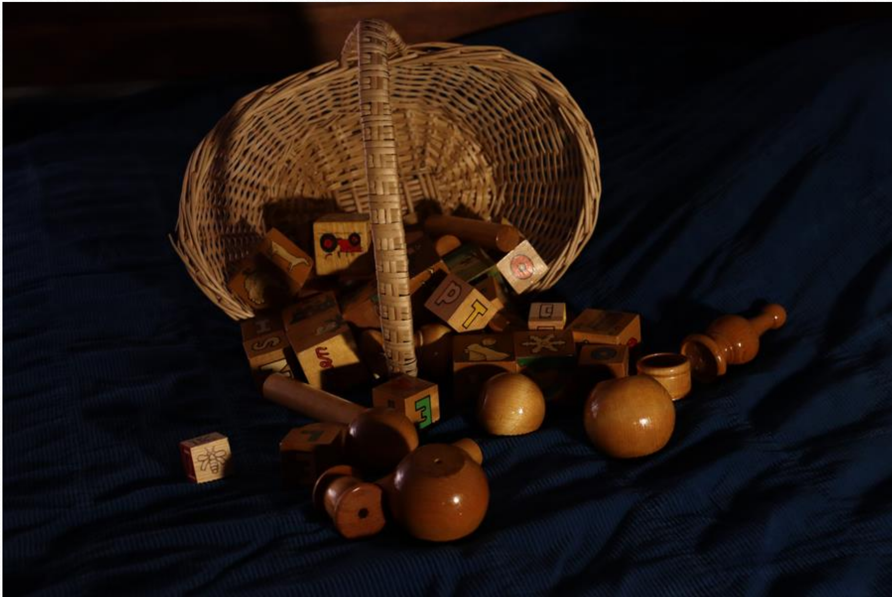
558-Carol Cole Renfro - Blocks out of the basket