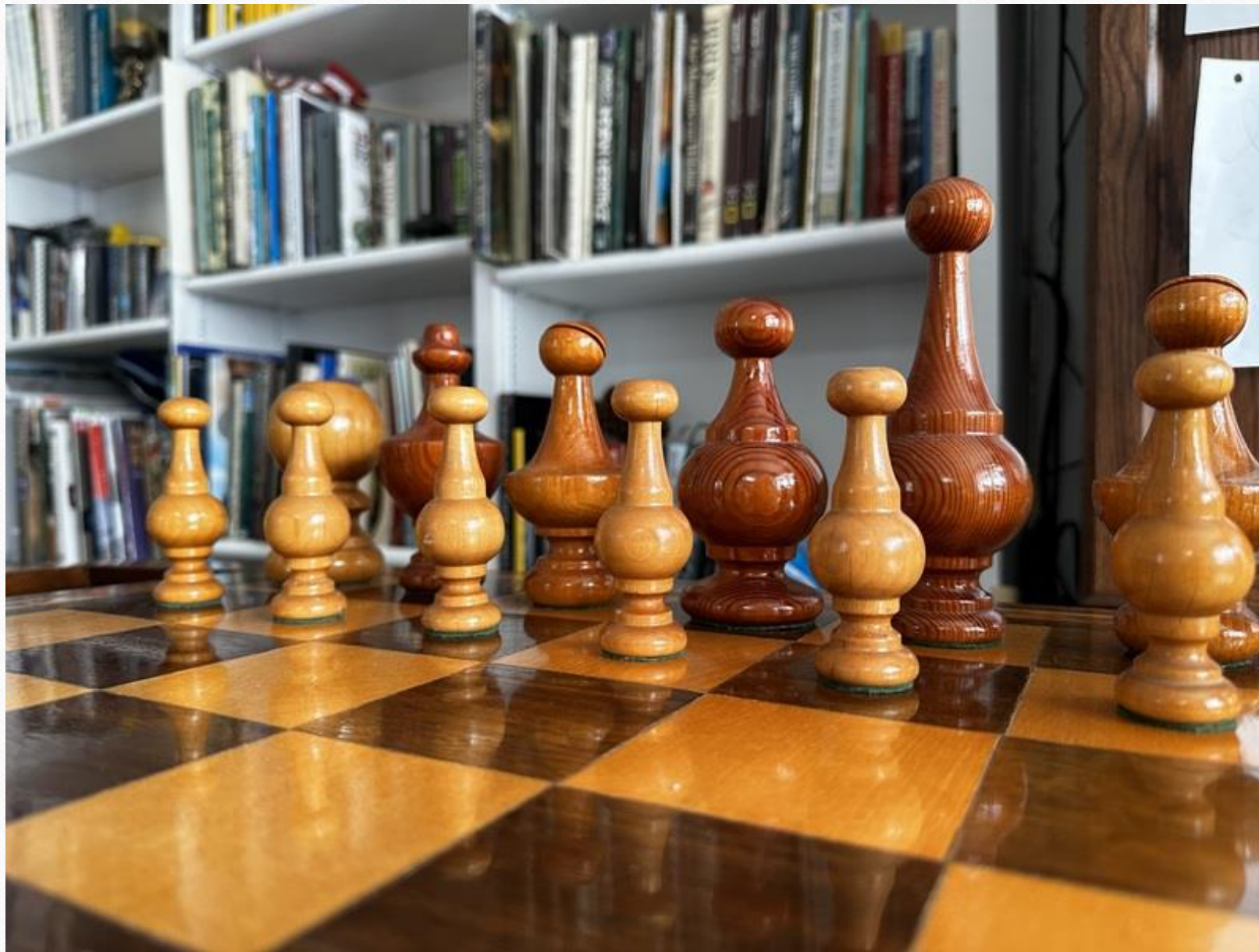
504-Sandra Knight - Your Move