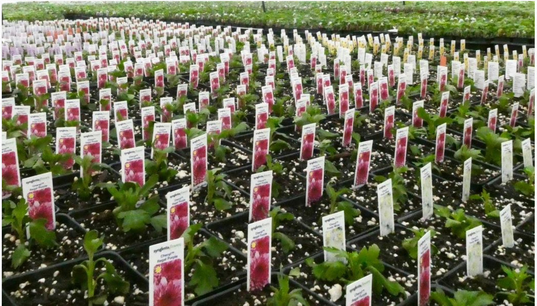
507-Betsey Howard - Pretty maids all in a row