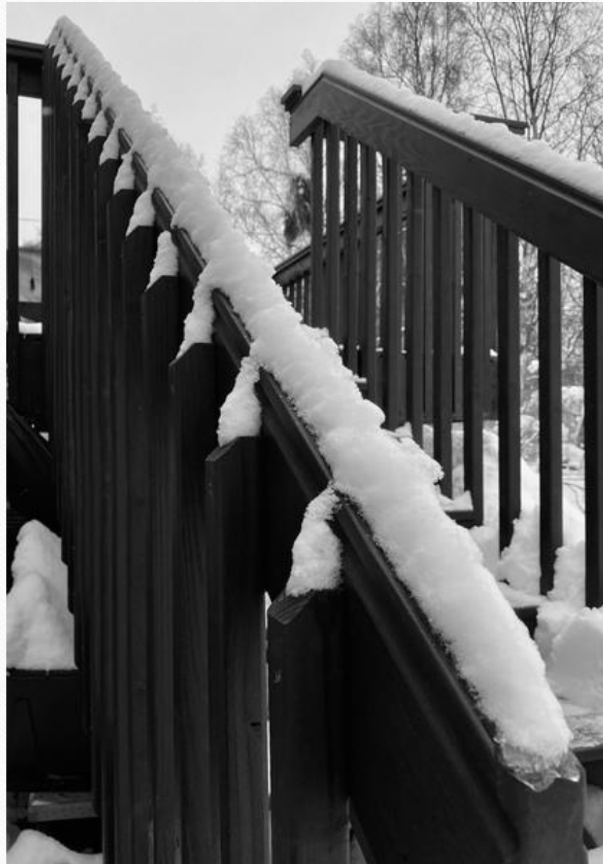
551-Shirley - Looking up!