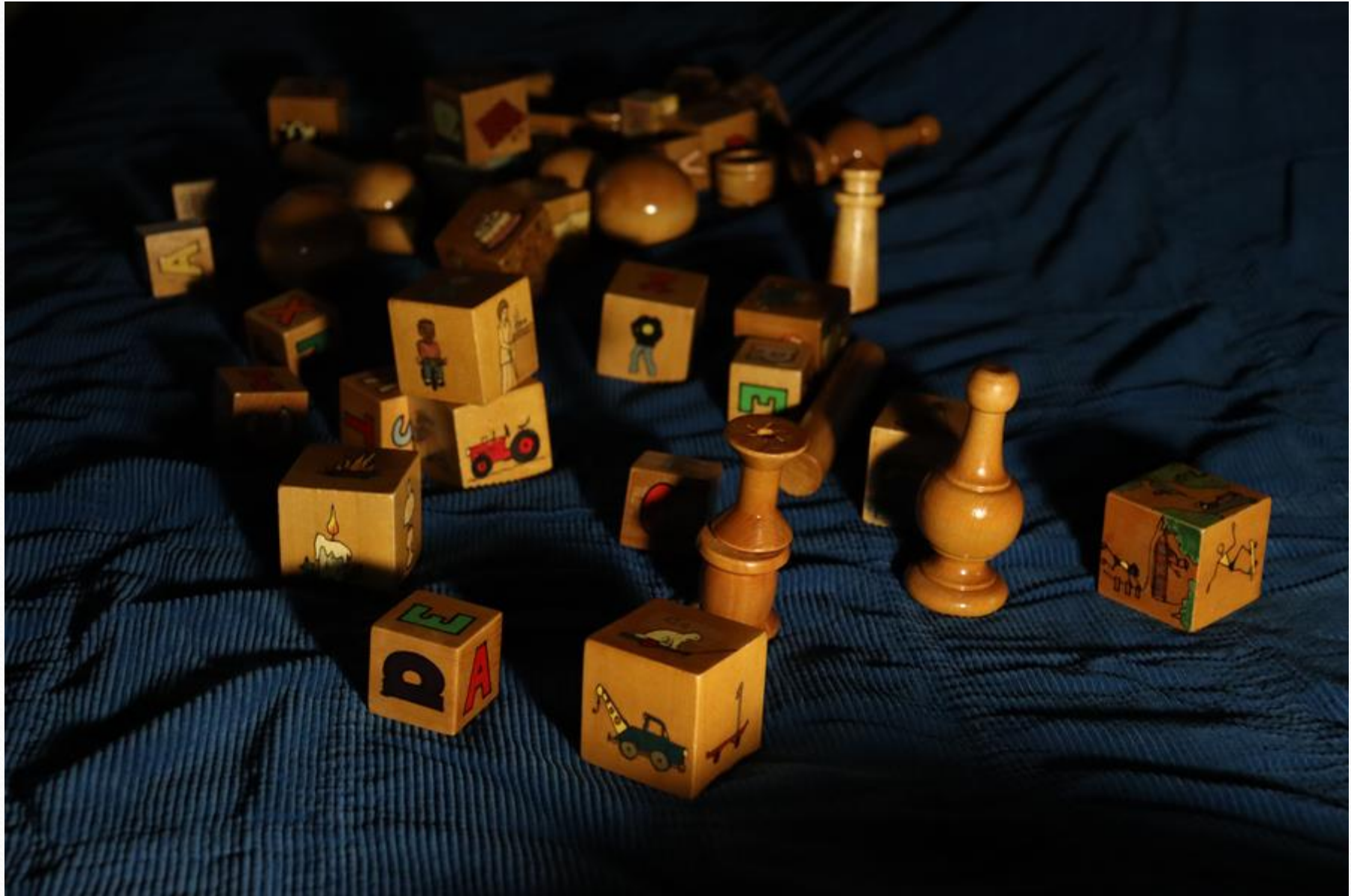
516-Carol Cole Renfro - Blocks akimbo