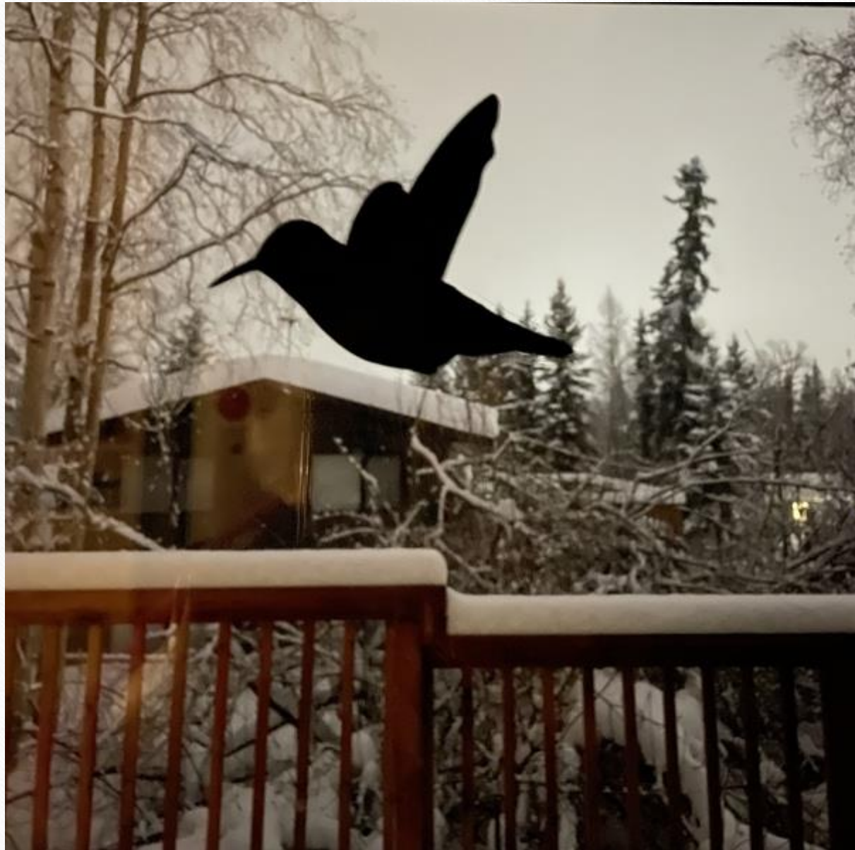
503-Pamela weaver - strange vision