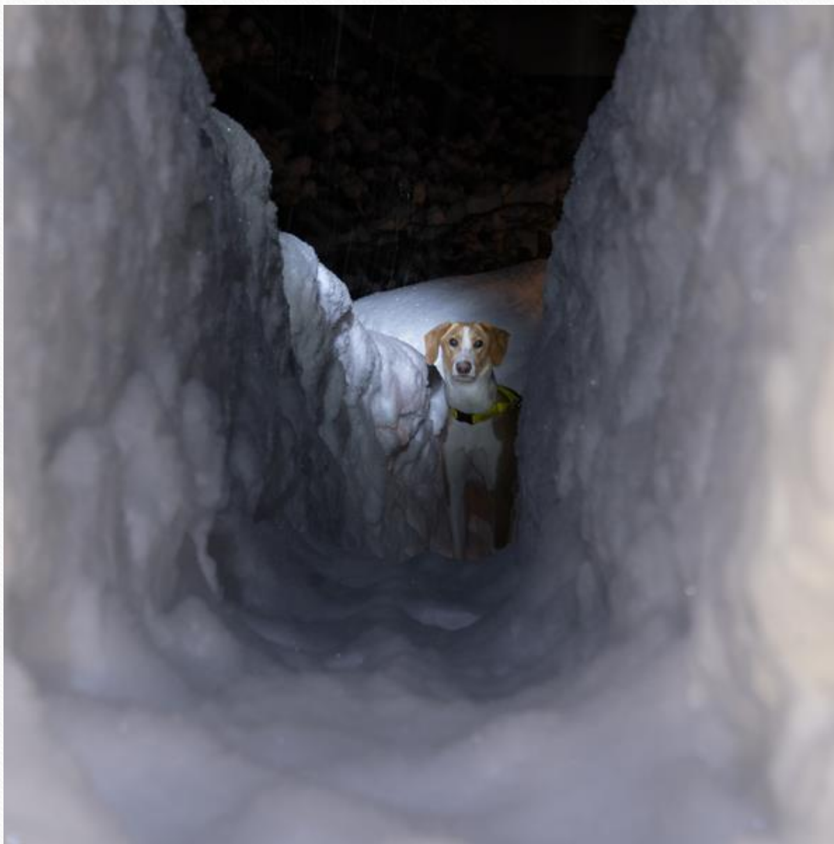
518-Jim Cantor - Why is that man lying in the snow?