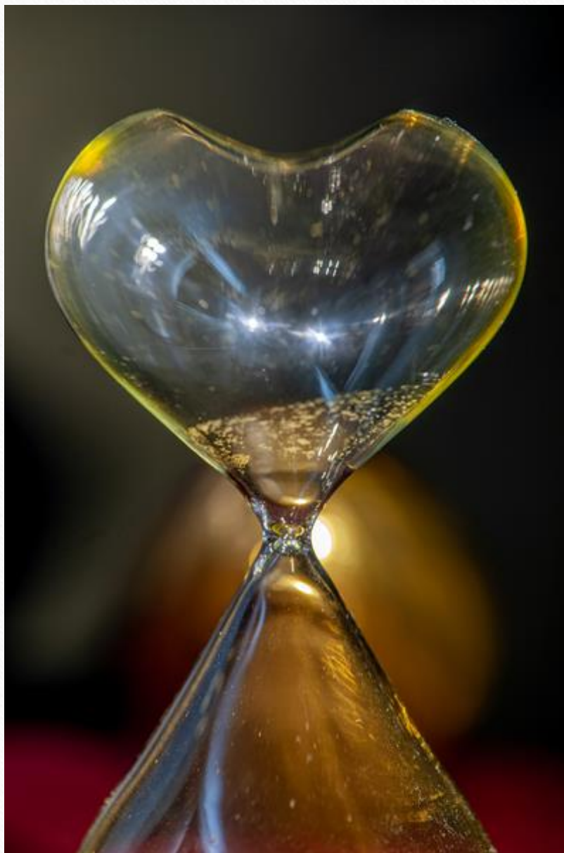
501-Ron Hoggard - Altered Hourglass