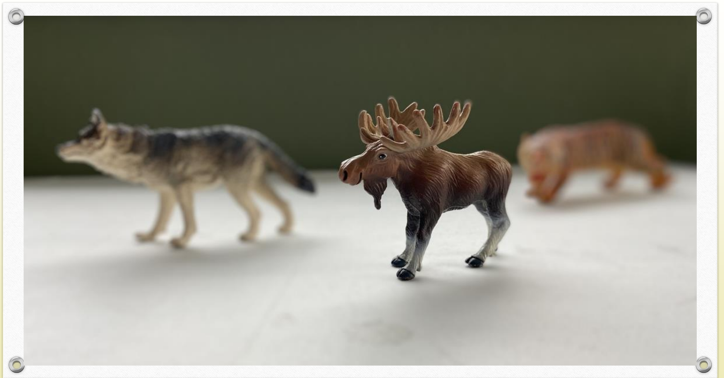
514-Paula Saindon - Depth of Field Study