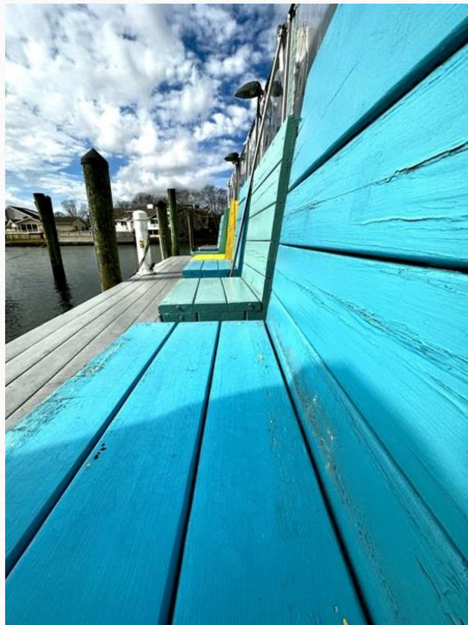
553-Sandra Knight - Dockside