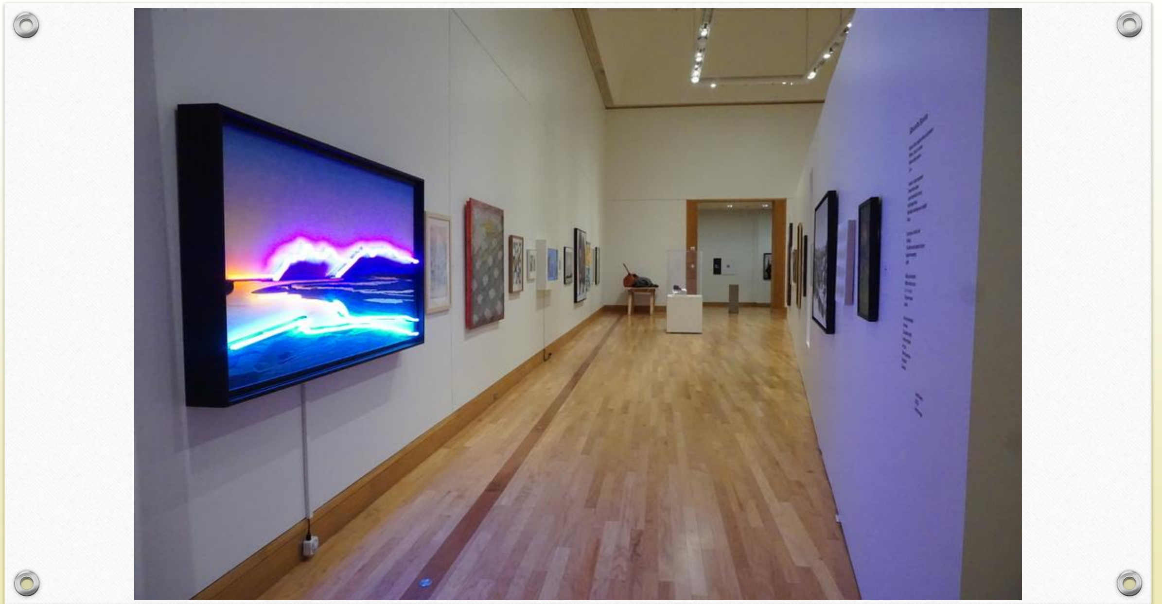
511-Ann Gray - Ann-Depth 2