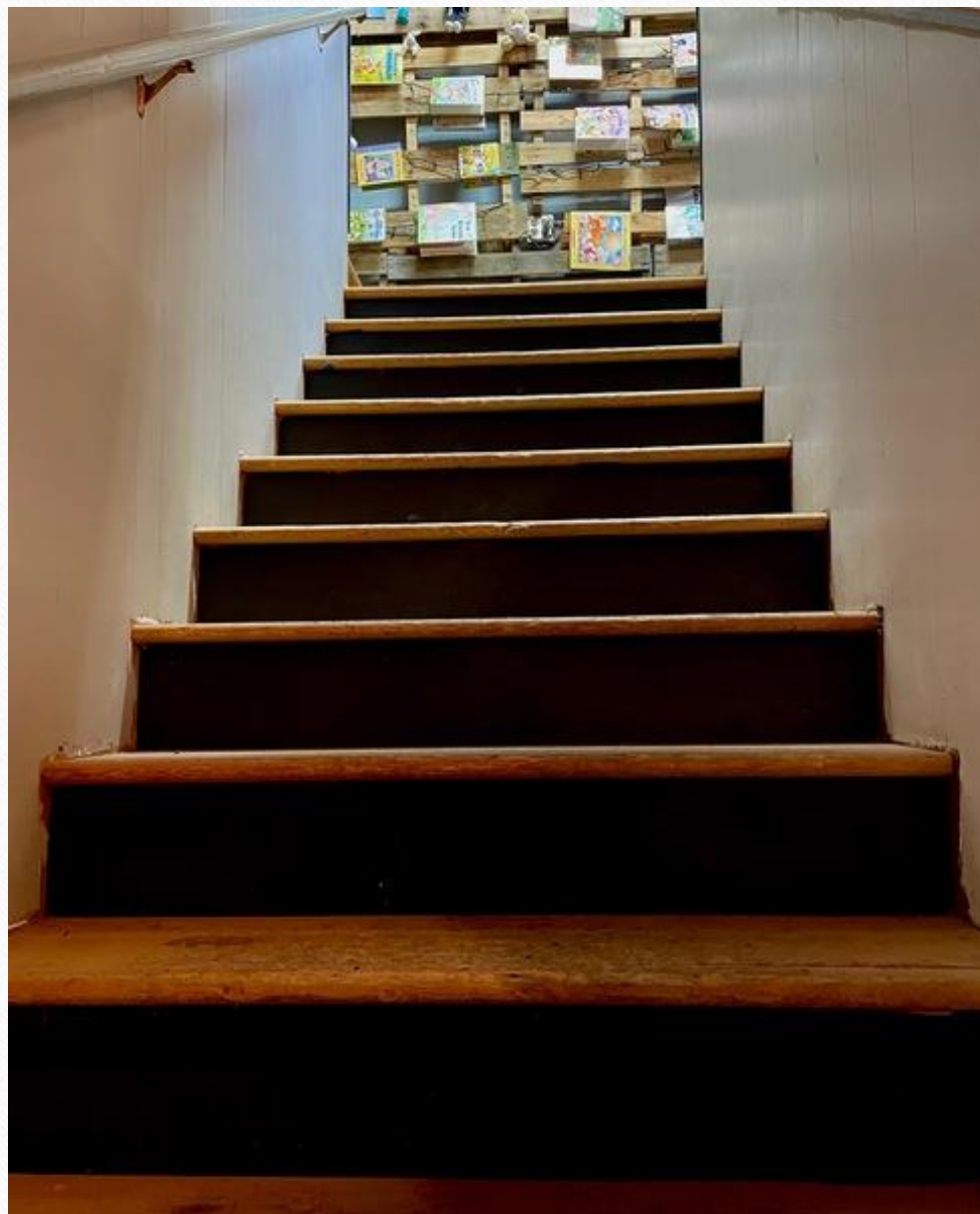
555-Betsey Howard - Stepping back in time