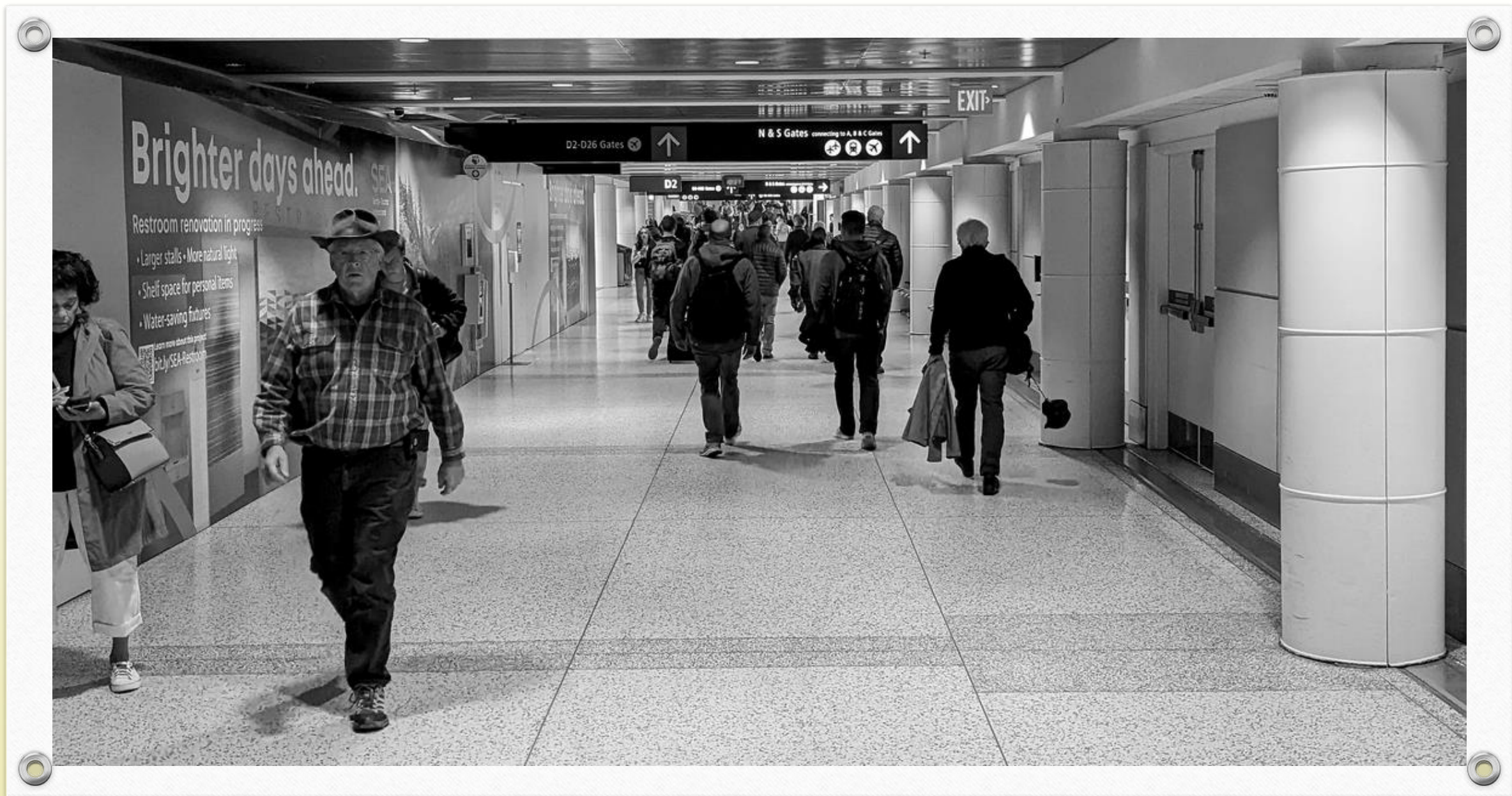
554-Glenn Cantor - Going Places-1st Choice