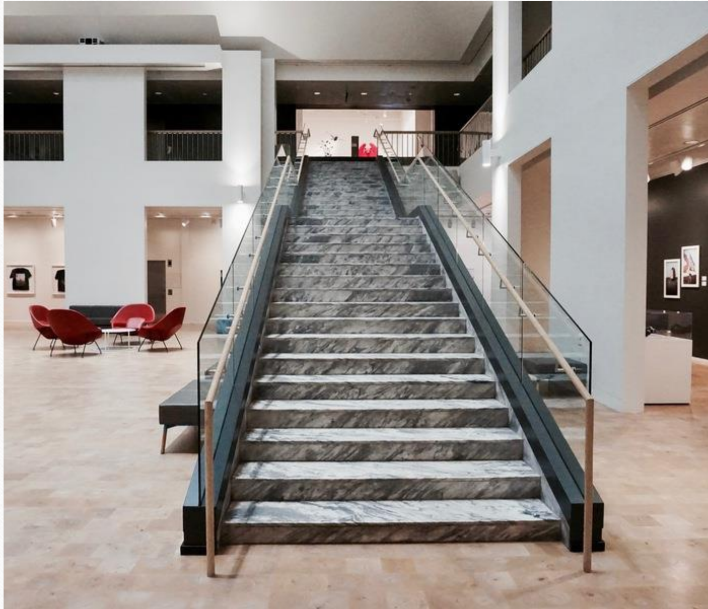
556-Ann Gray - Ann-Depth 1