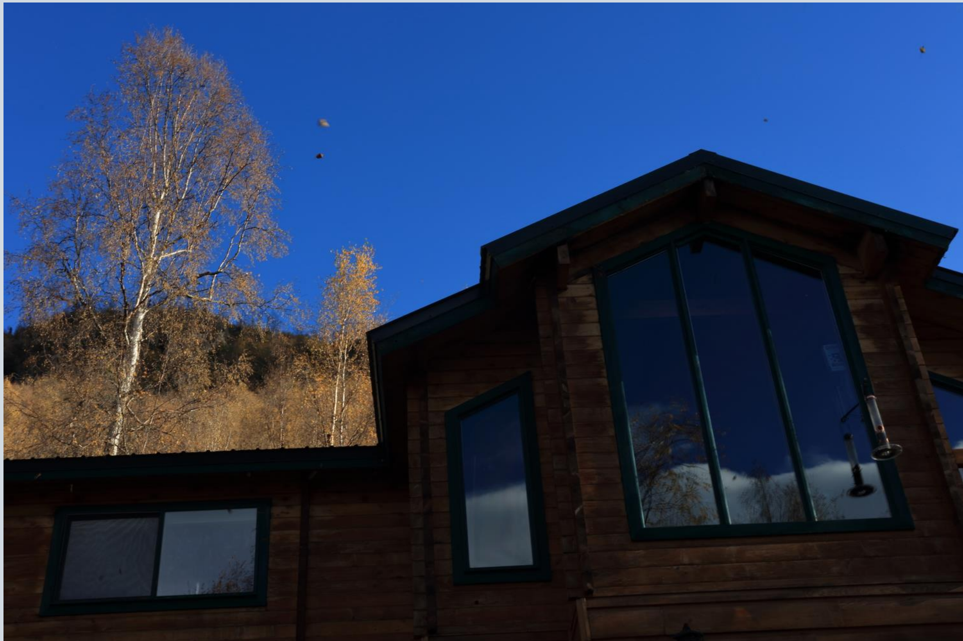
14-Christopher - Cloudy Tree House