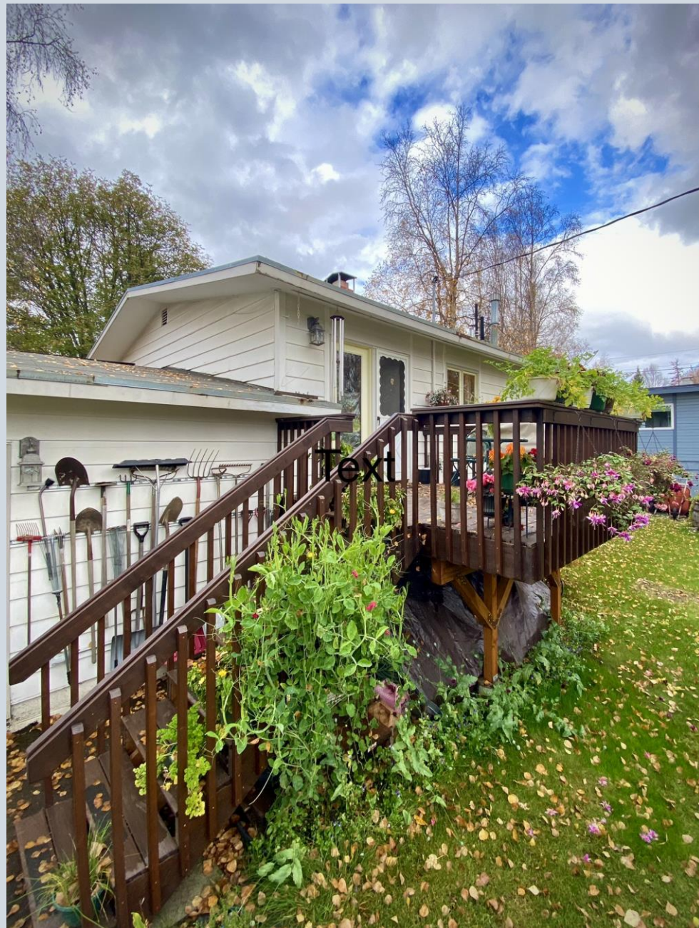
06-Shirley - New Porch!