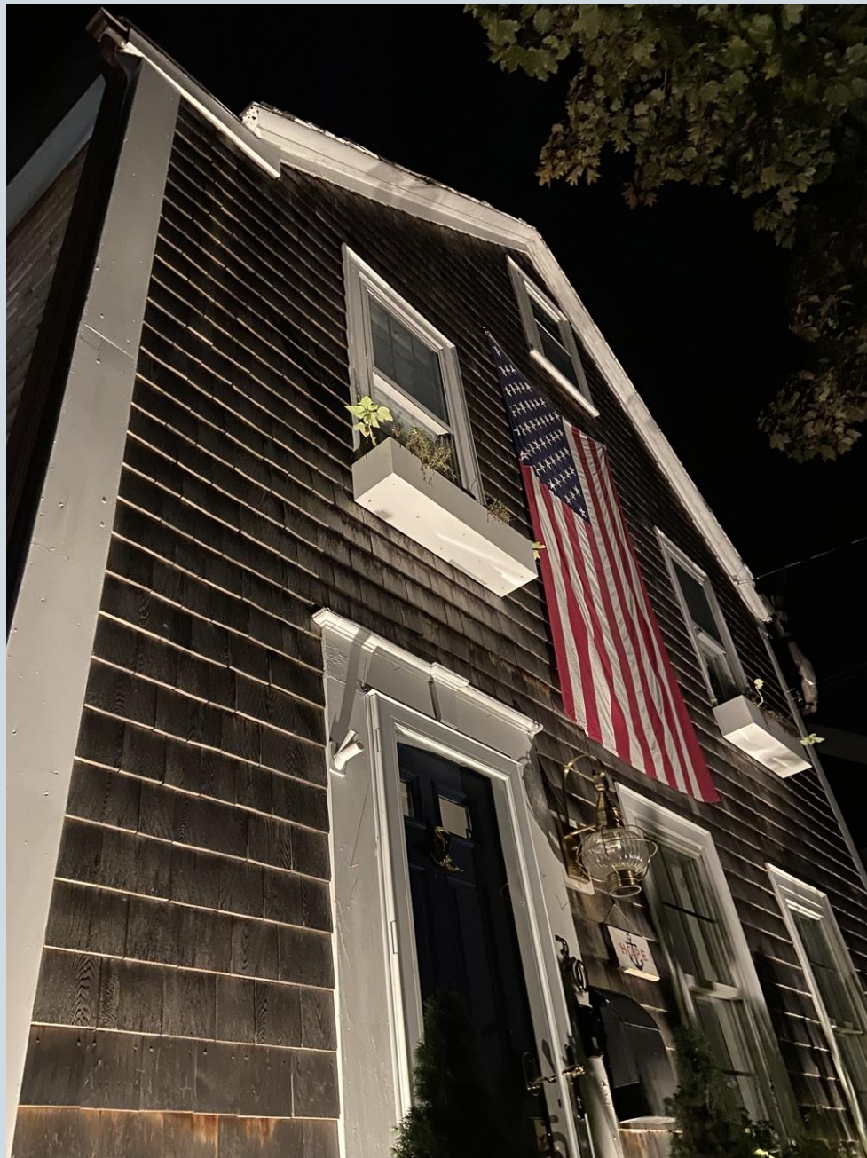
12-Paula Saindon MA AirBnB