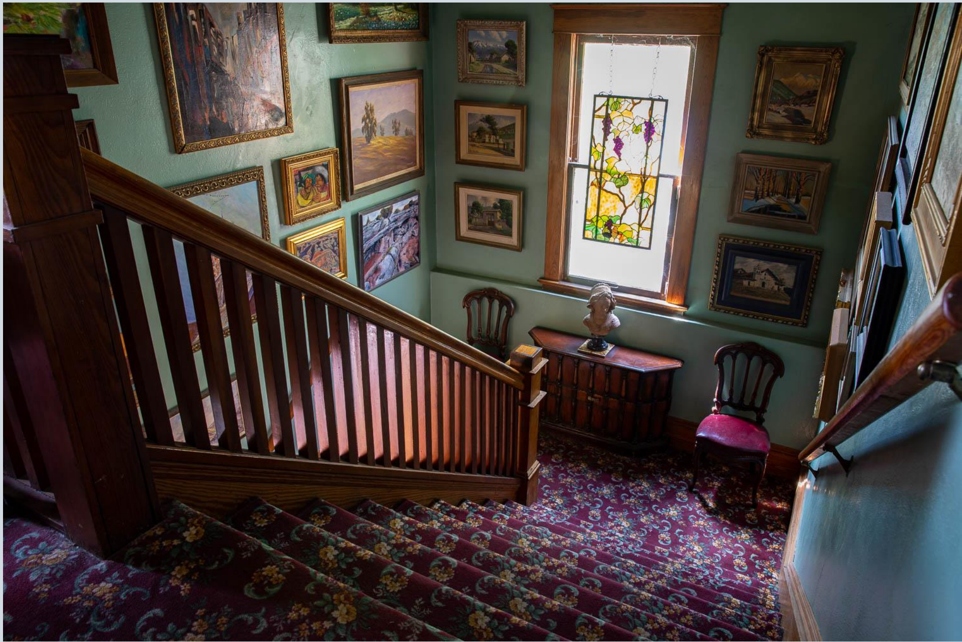
03-Bart Quimby – Simpson Hotel, Duncan, AZ