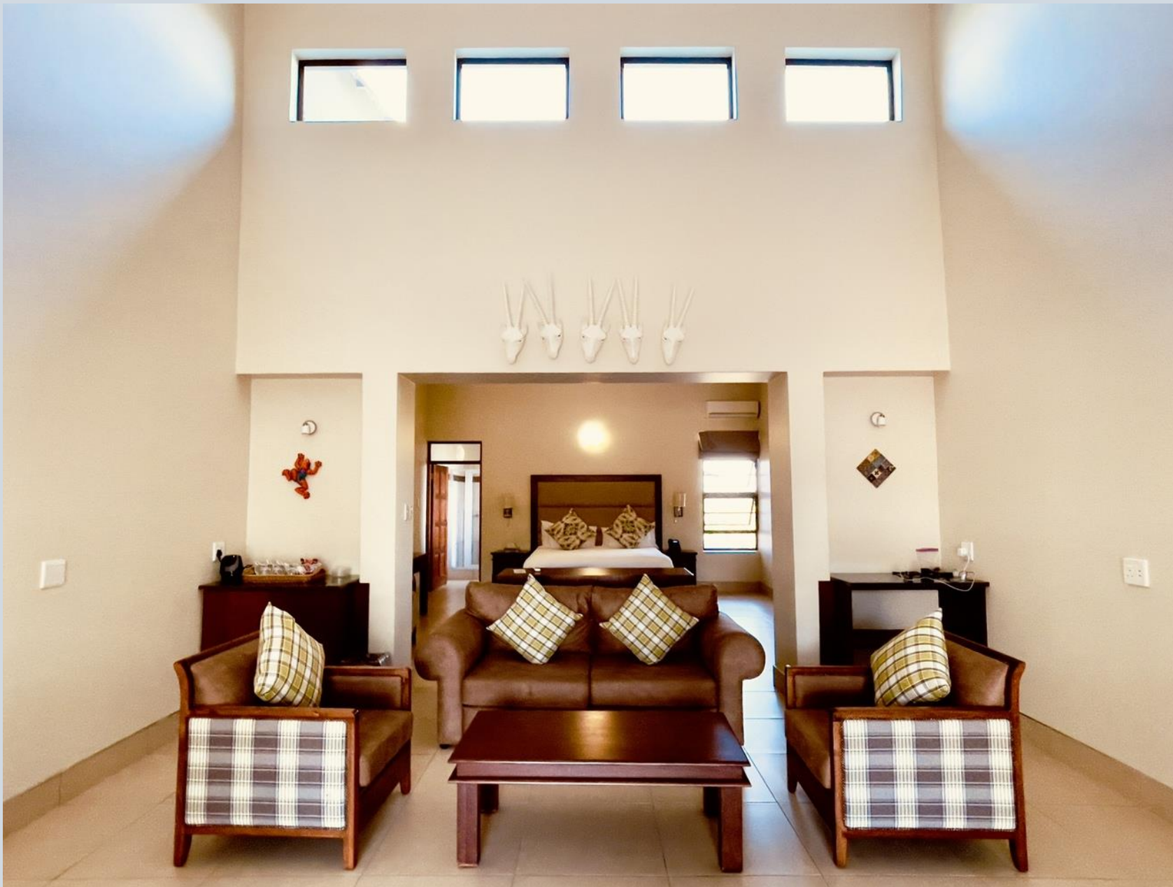
26-Amy MacKenzie - zulu nyala