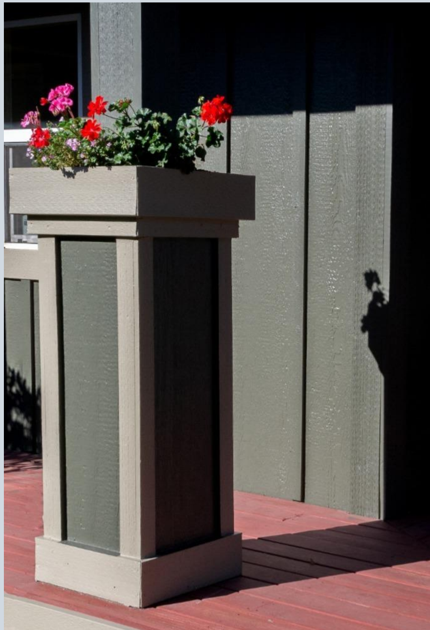
51-Glenn Cantor - House Porch Pillar