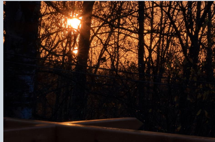
Twin Sun Reflection