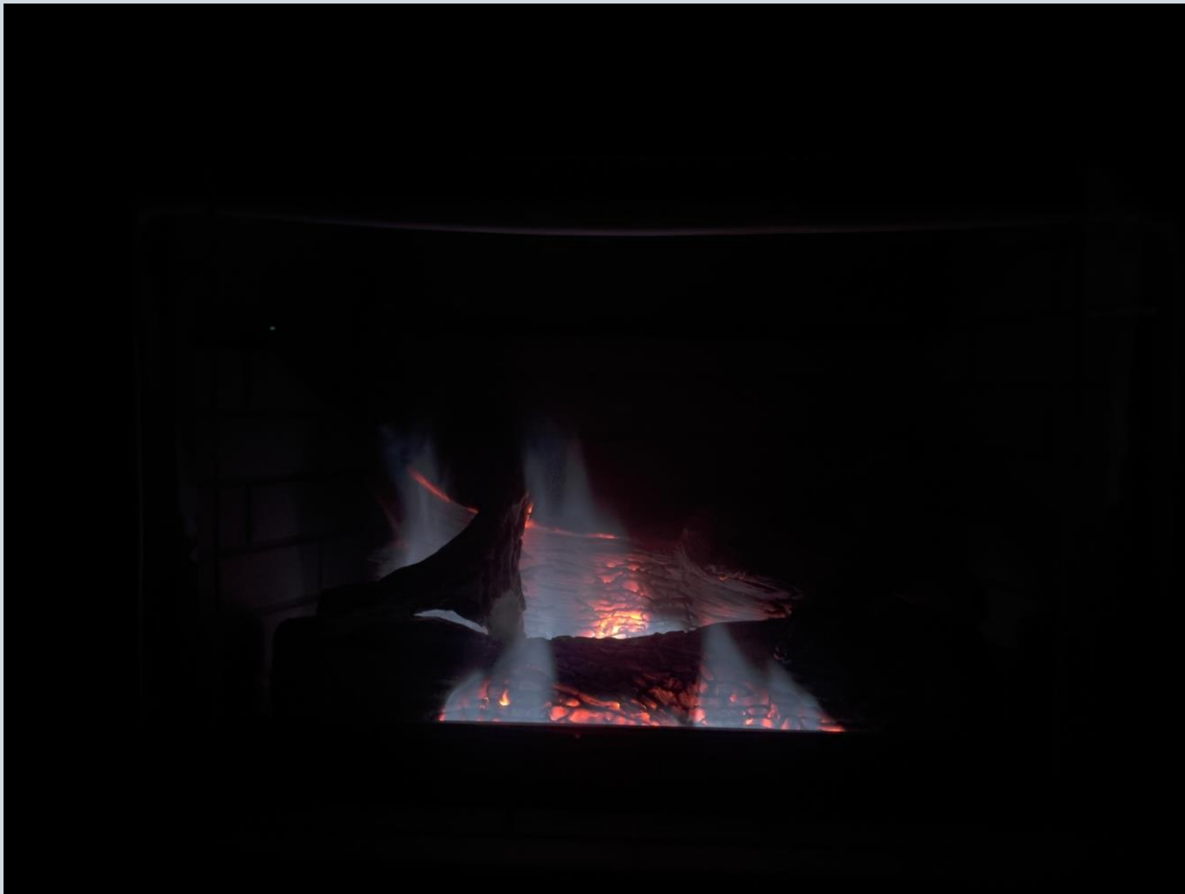
54-Chuck Iliff - Home Sweet Home - 2