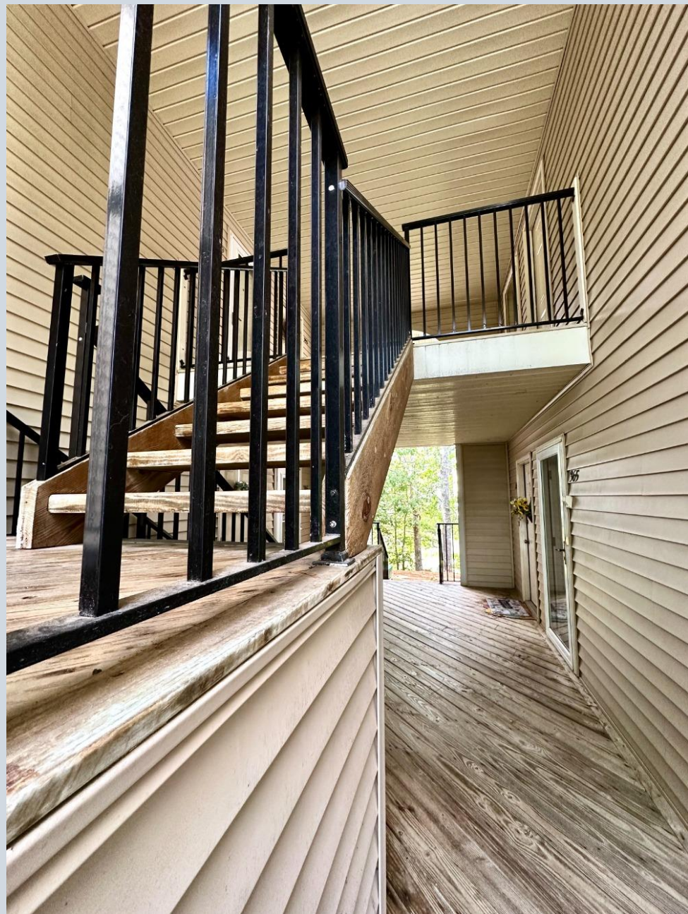
04-Sandra Knight - Home Sweet Home