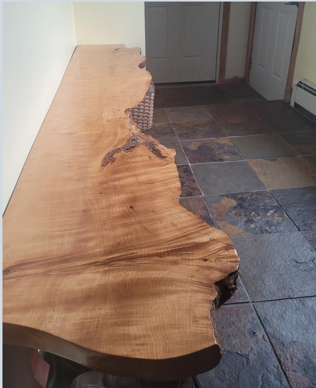
13-Rhonda B - The bench