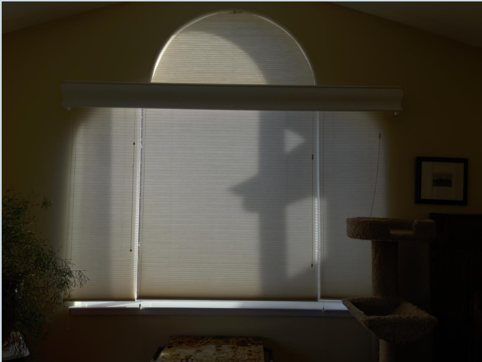
16-Chuck Iliff - Home Sweet Home - 1