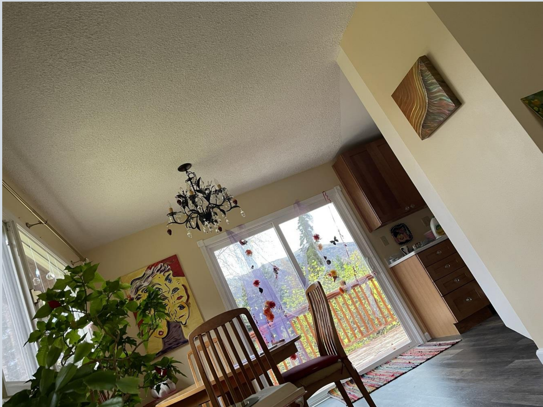
15-Pamela Mae Weaver