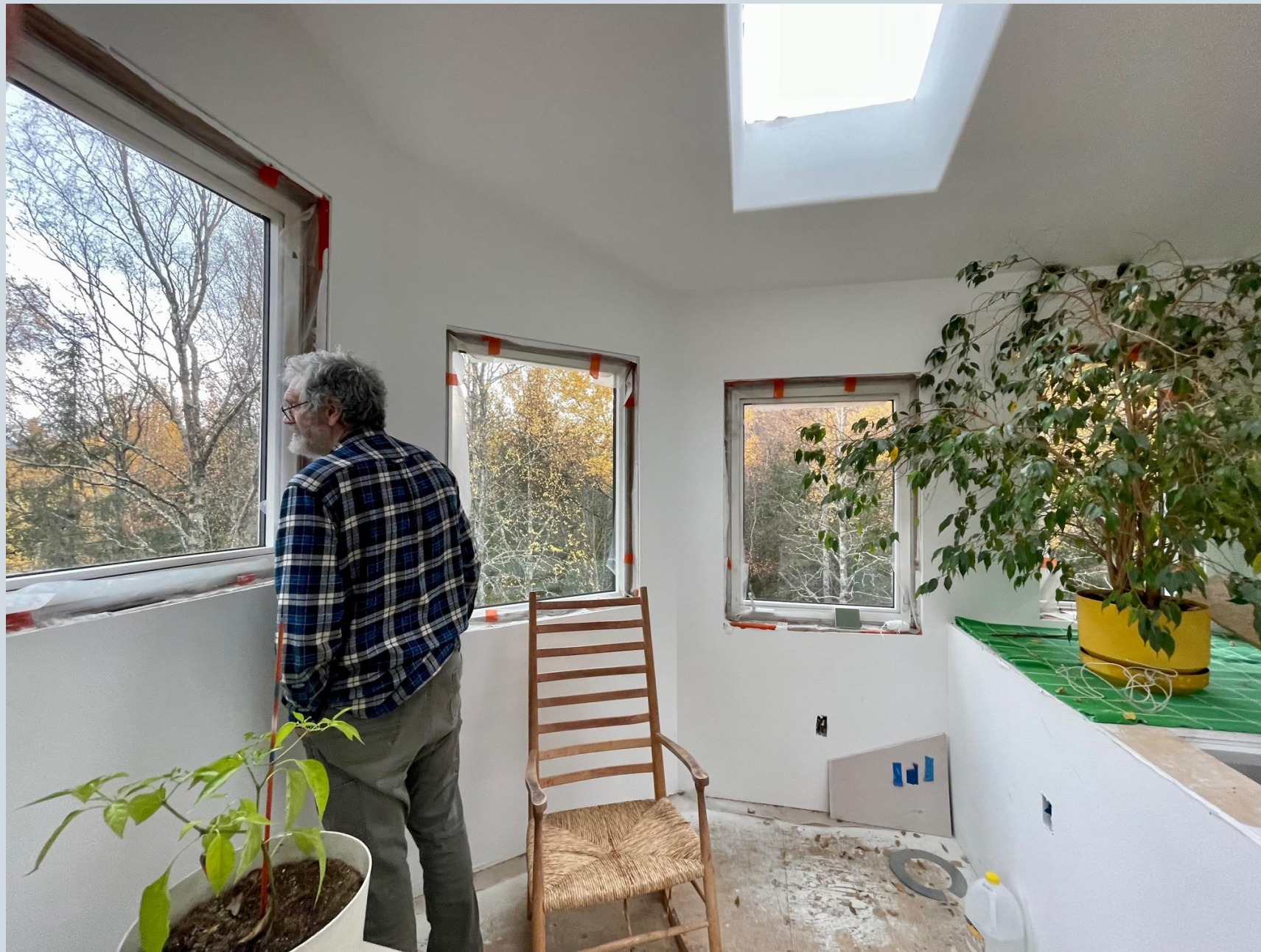
19-Elly Scott - Cupula windows