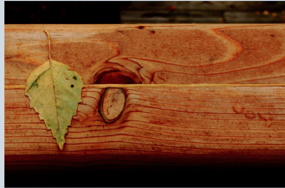
Knot a Tree