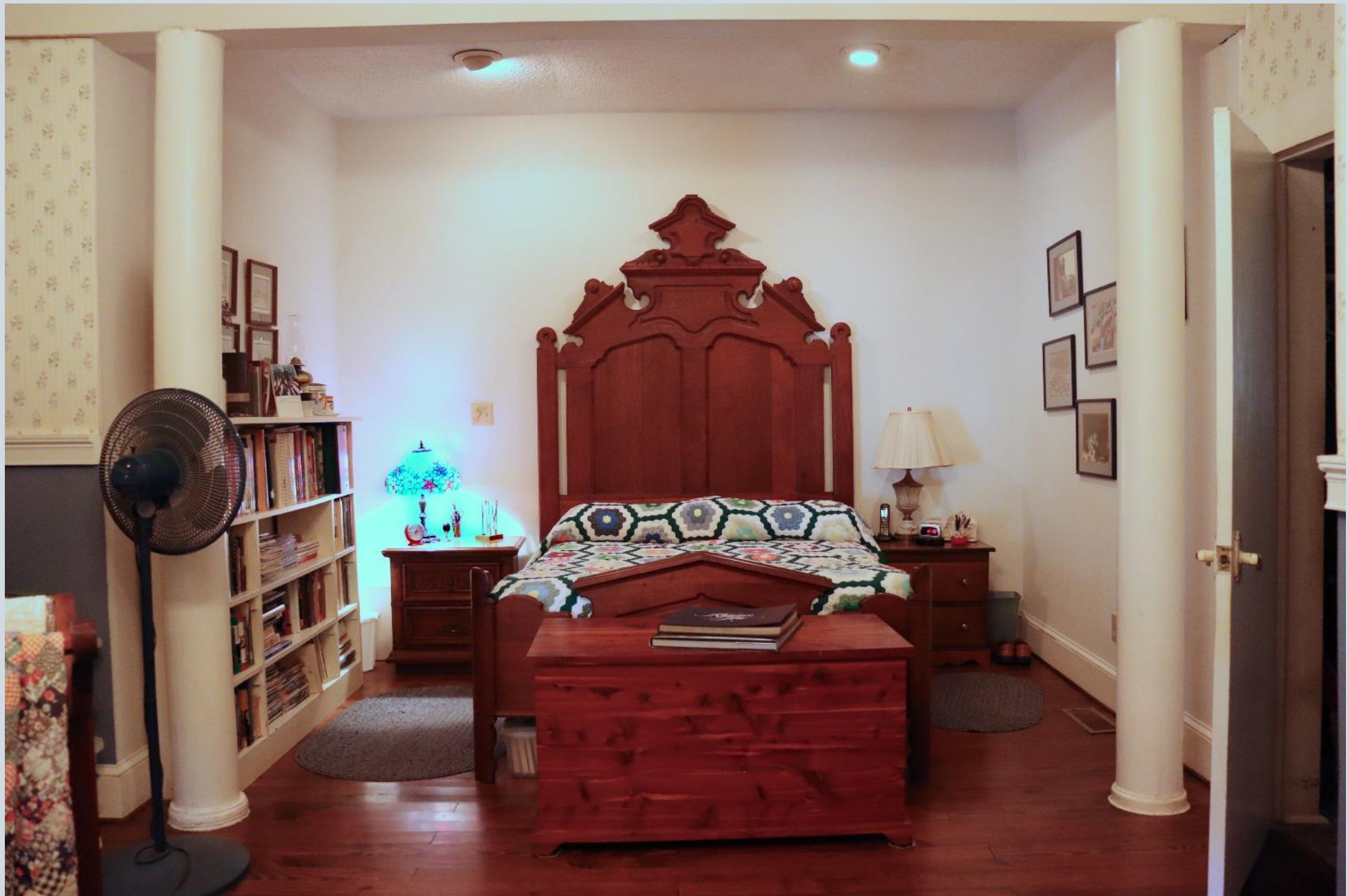
09-Carol - Bedroom, former porch