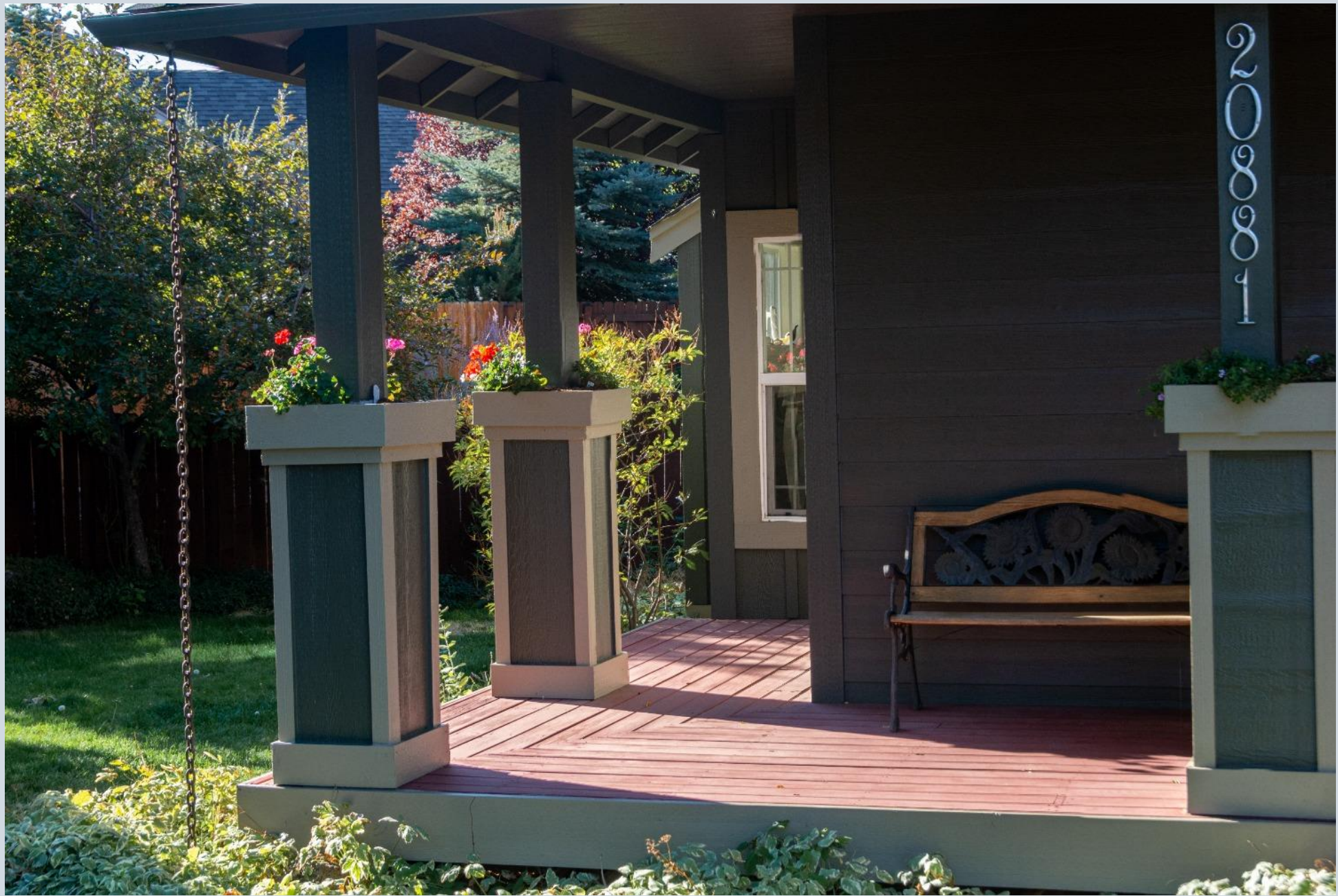
07-Glenn Cantor - House Porch