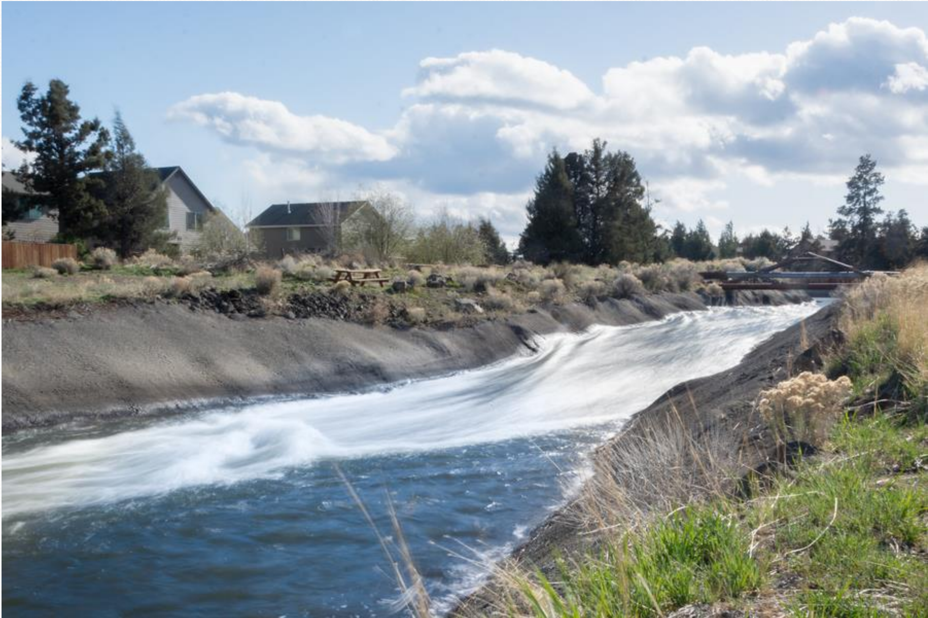
04-Glenn Cantor – North Unit Irrigation District Canal