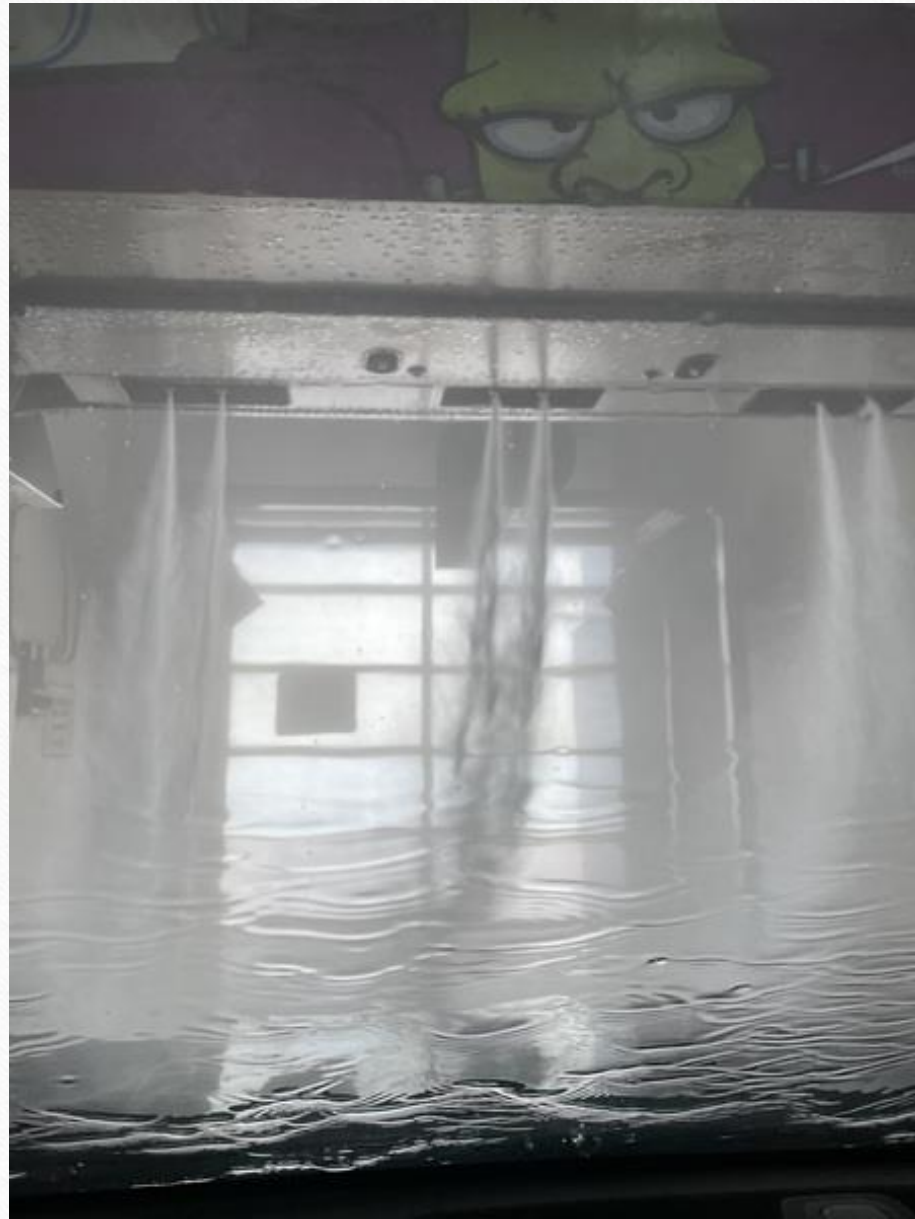
22-Helen Nielson – Windshield Watcher