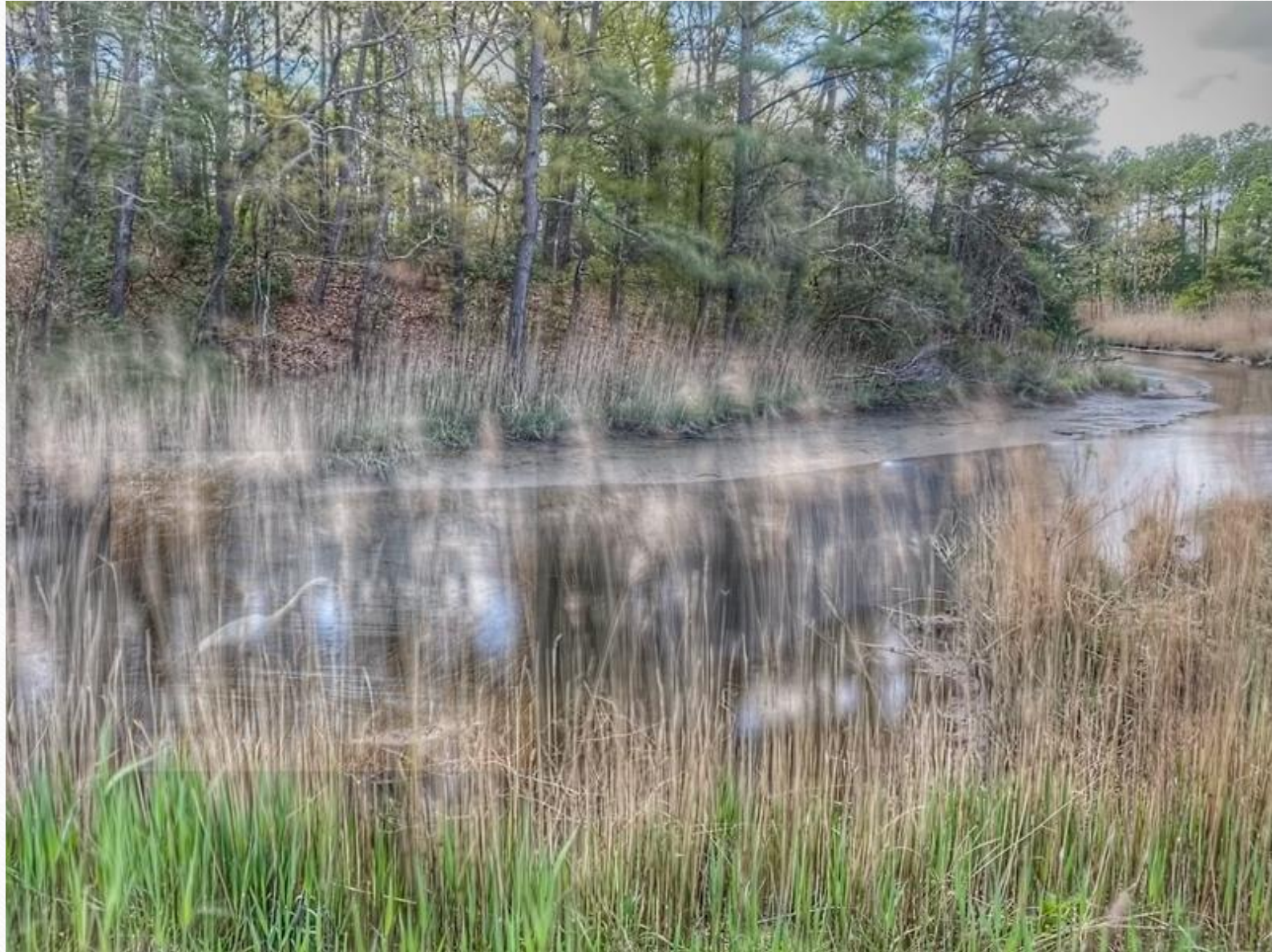
09-sandra knight - Stream 1