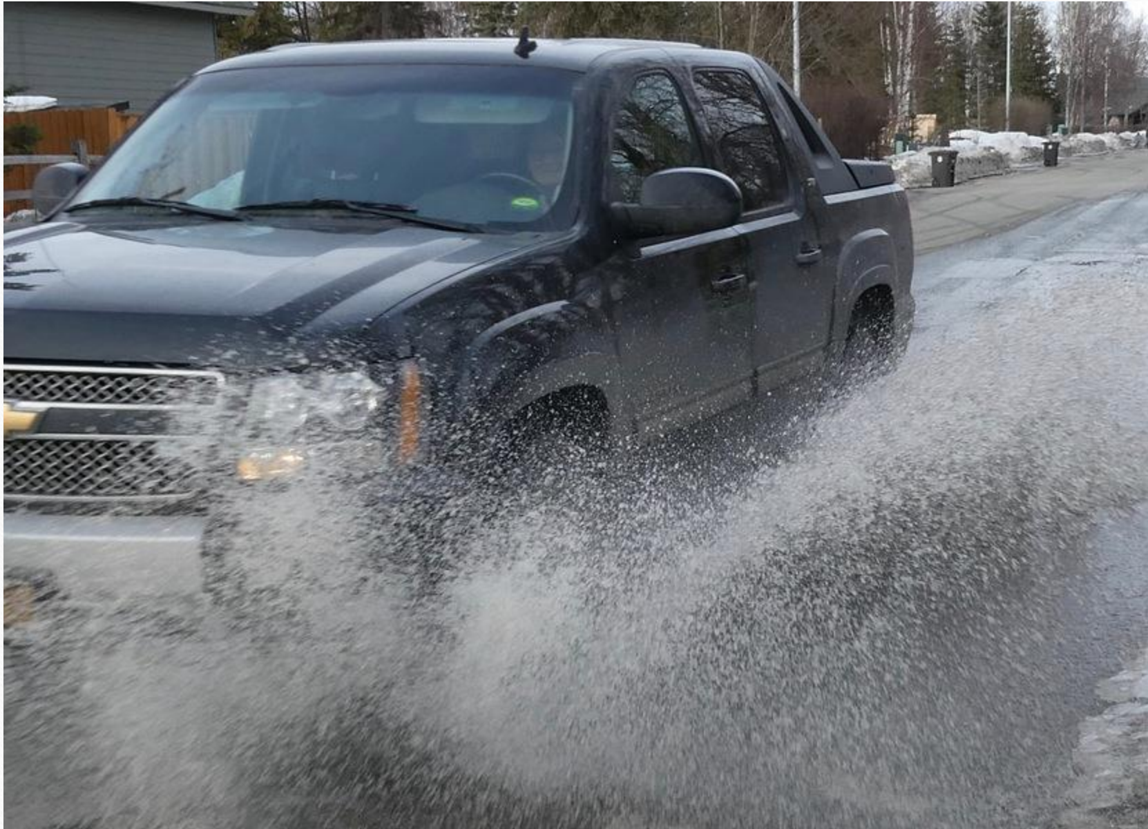
07-Betsey Howard – Making a big splash