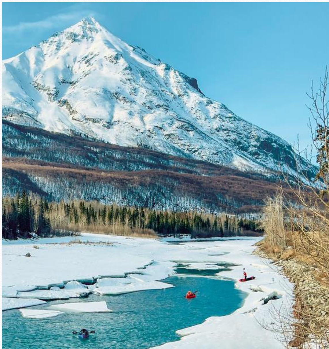
17-amy mackenzie – spring kayaks (pack rafts)