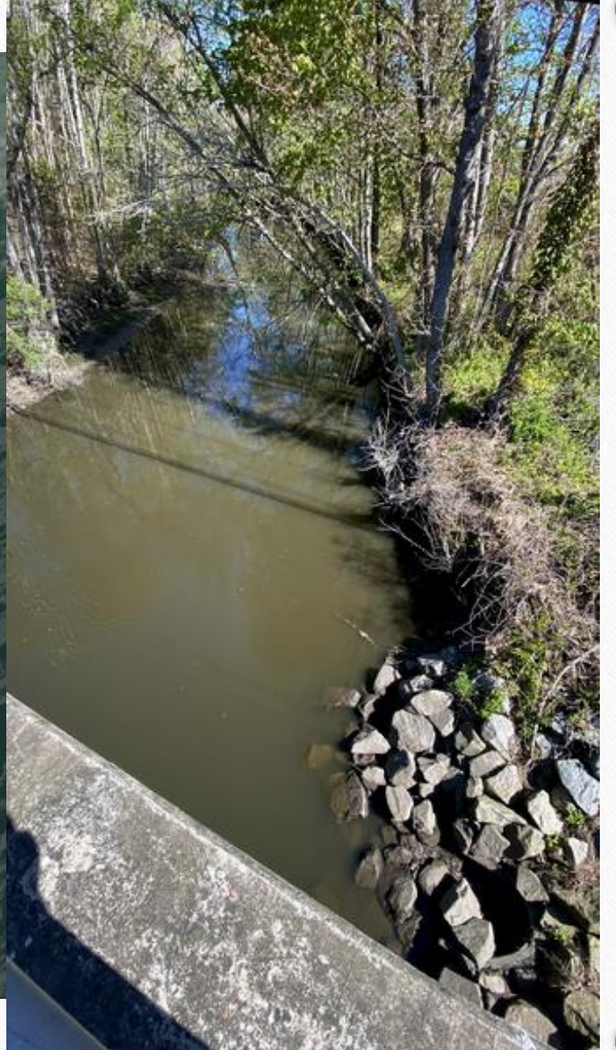
57-sandra knight – Stream 2 & 3