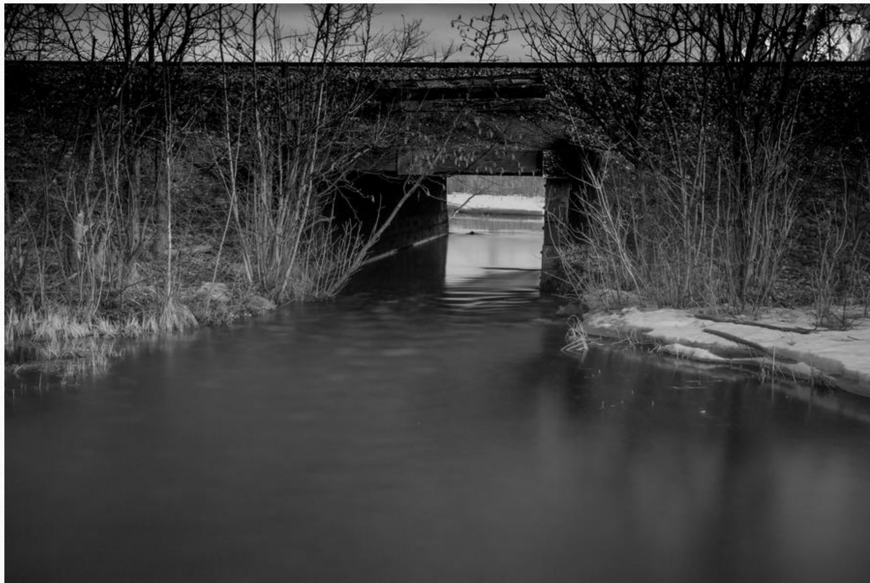
52-Chuck Iliff – Spring Creek - IR - 2