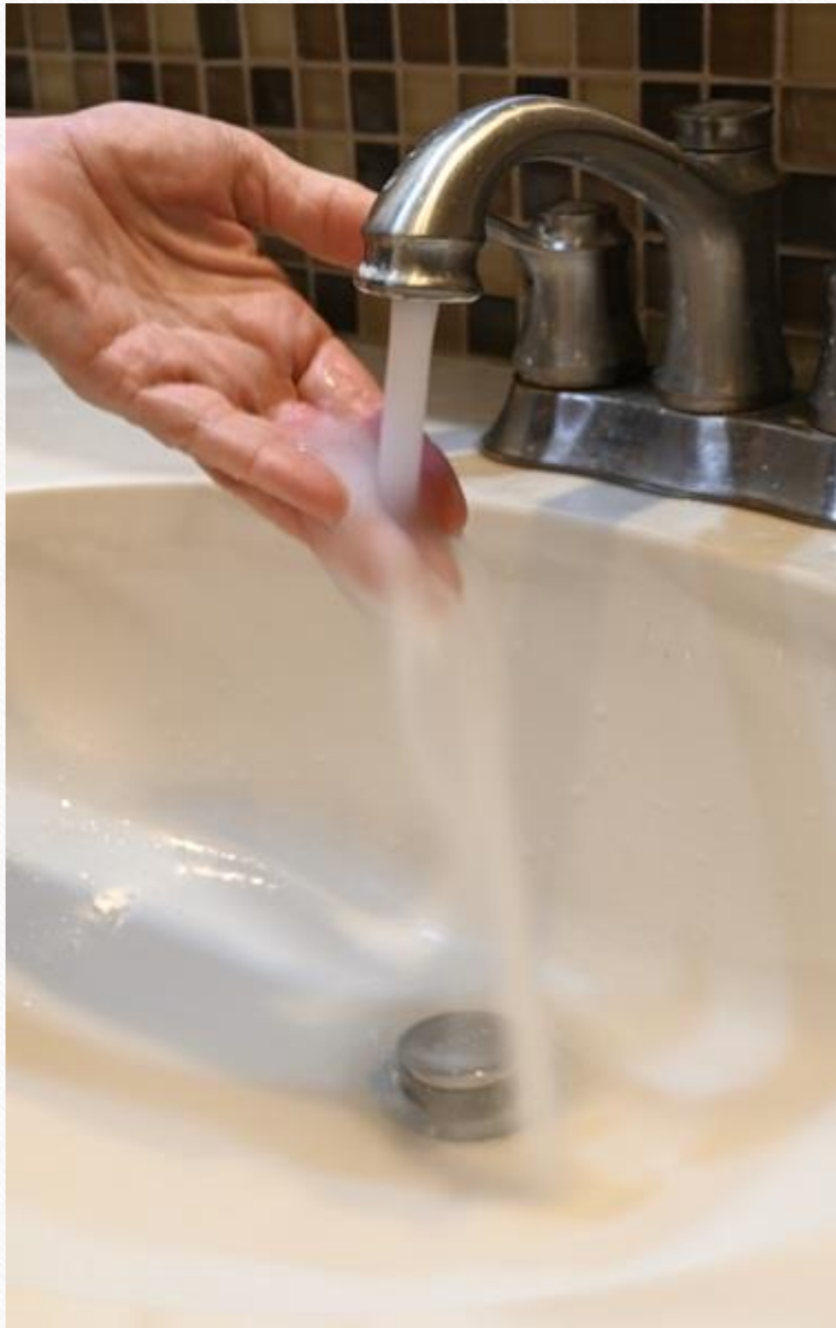
05-marty – soft flow c