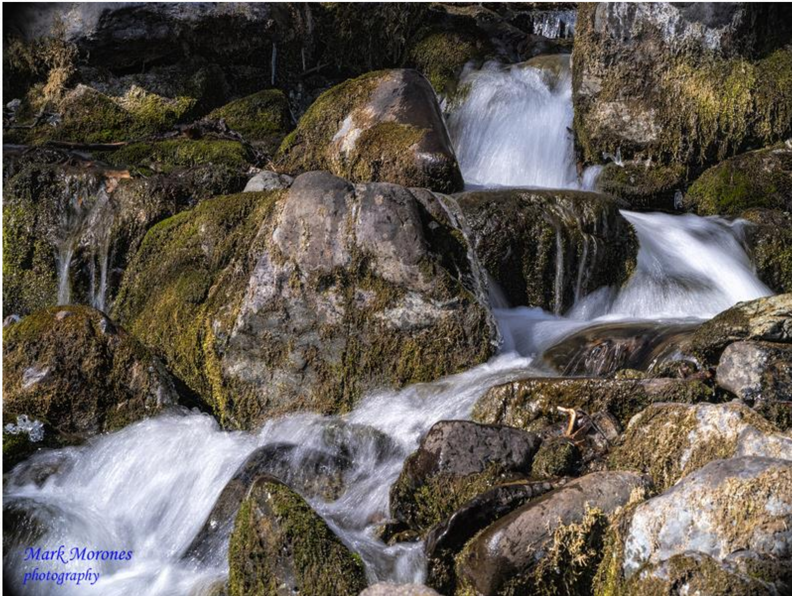
03-Mark Morones – rock traipsing