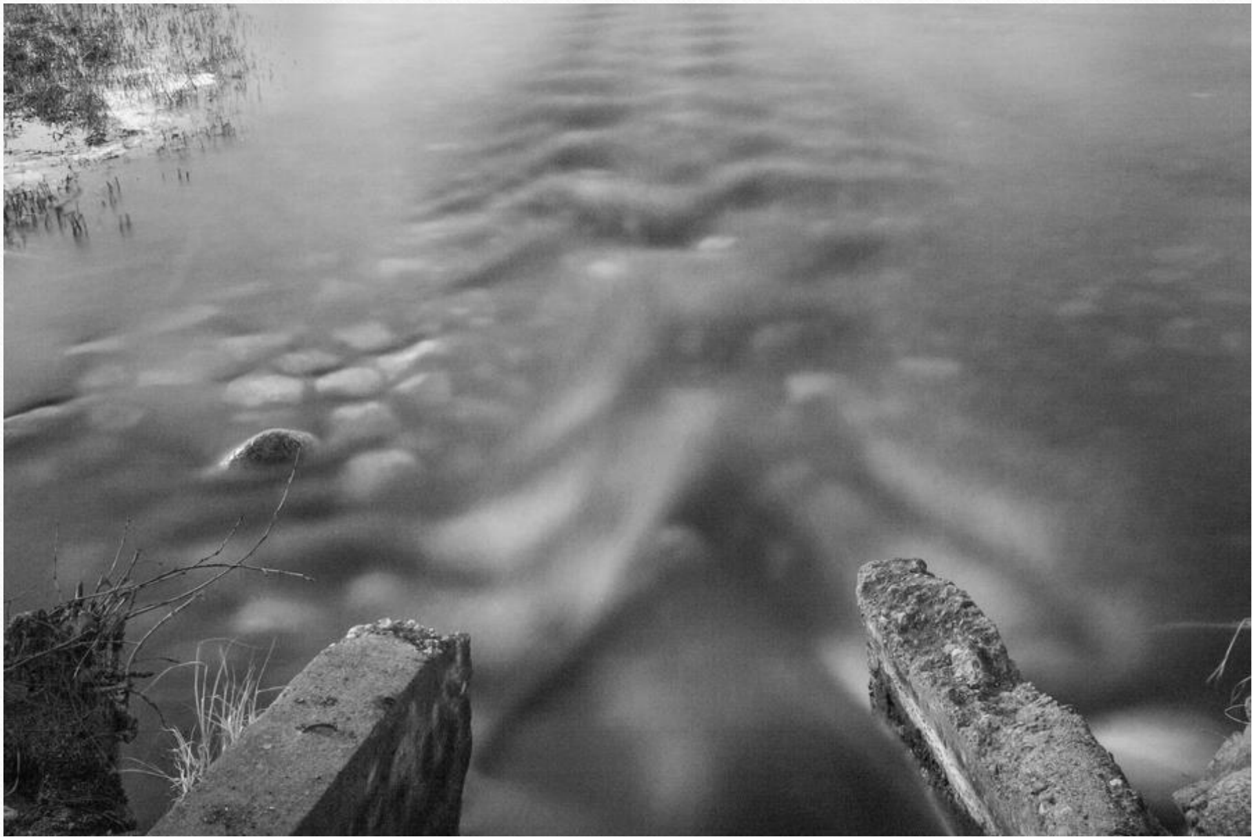
02-Chuck Iliff – Spring Creek - IR