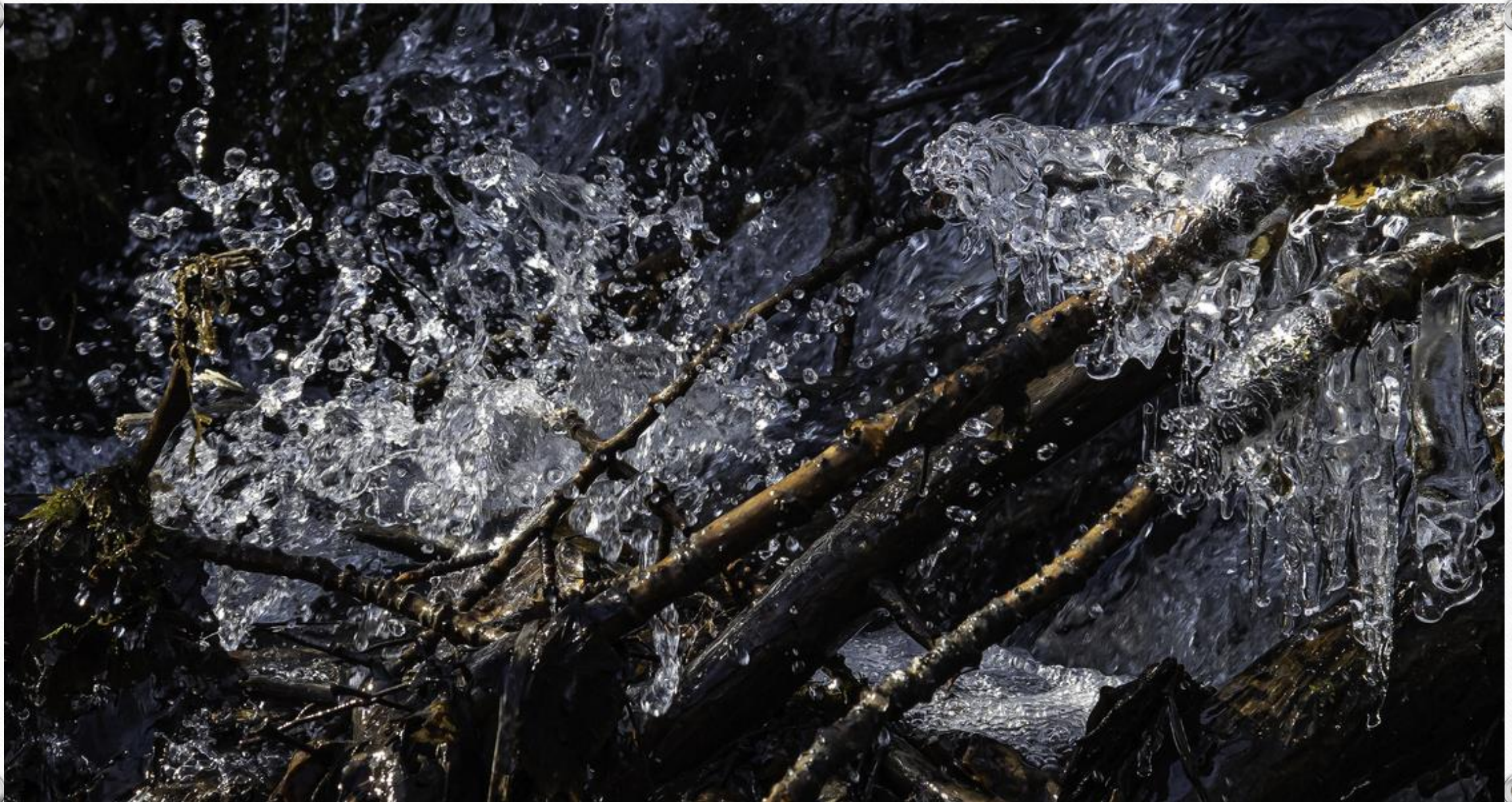
14-Bill Cole – Falls Creek Water Riot