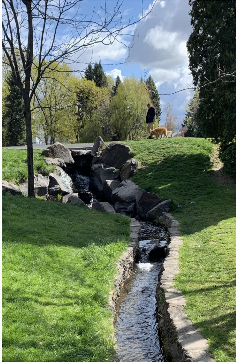
58-Walla Walla Stream-Ellen Nash