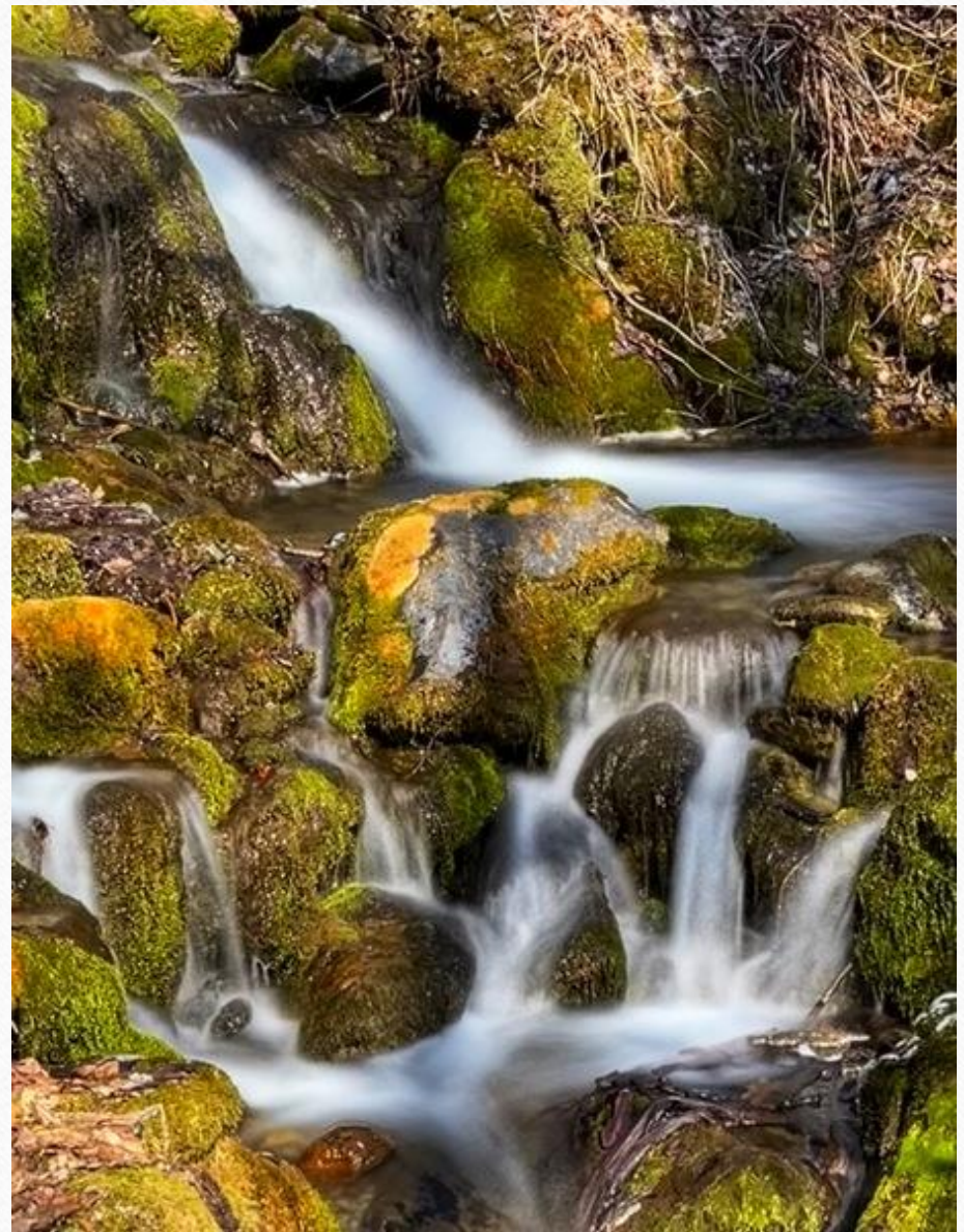
63-amy mackenzie - Dreamy Stream & Streams of Dreams