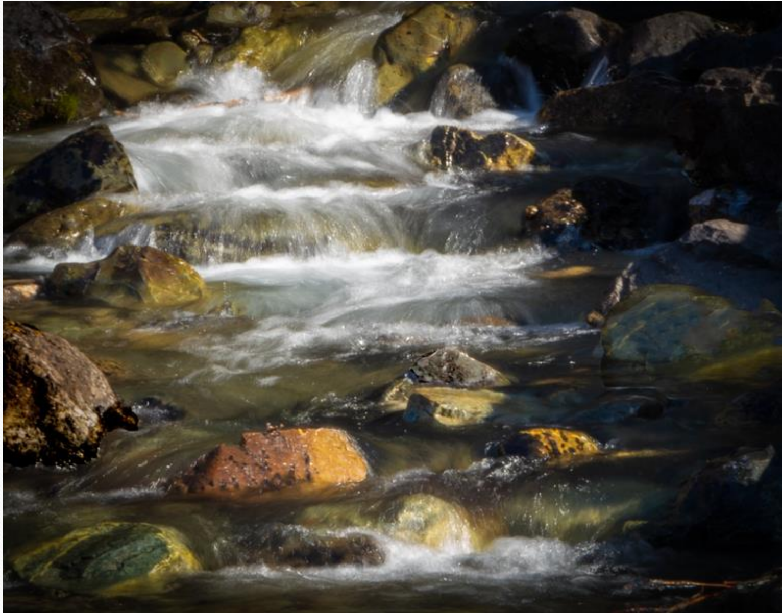
62-Jane Teller – Falling Water Creek