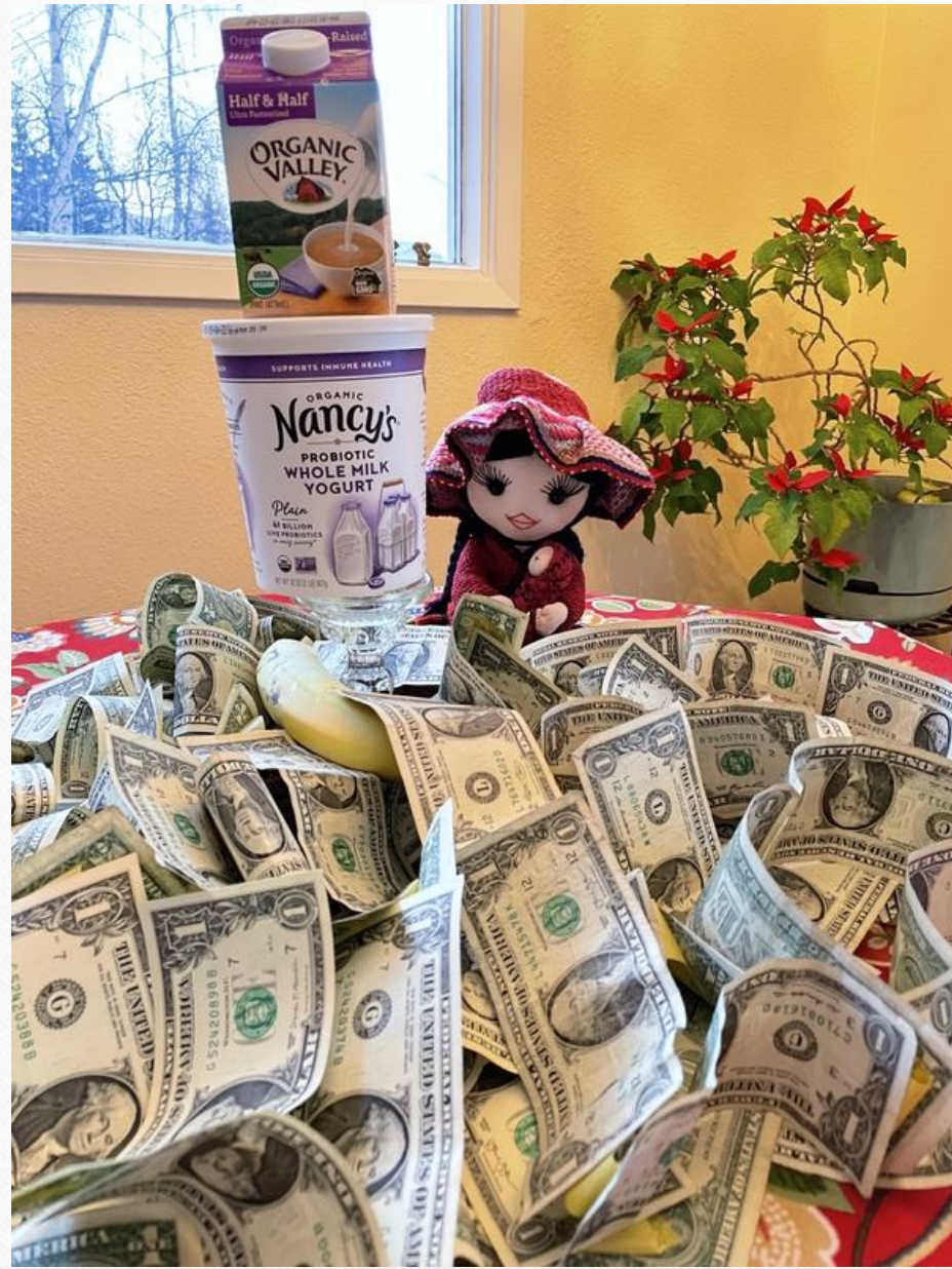
24-Life is a continuous flow - Pamela Mae