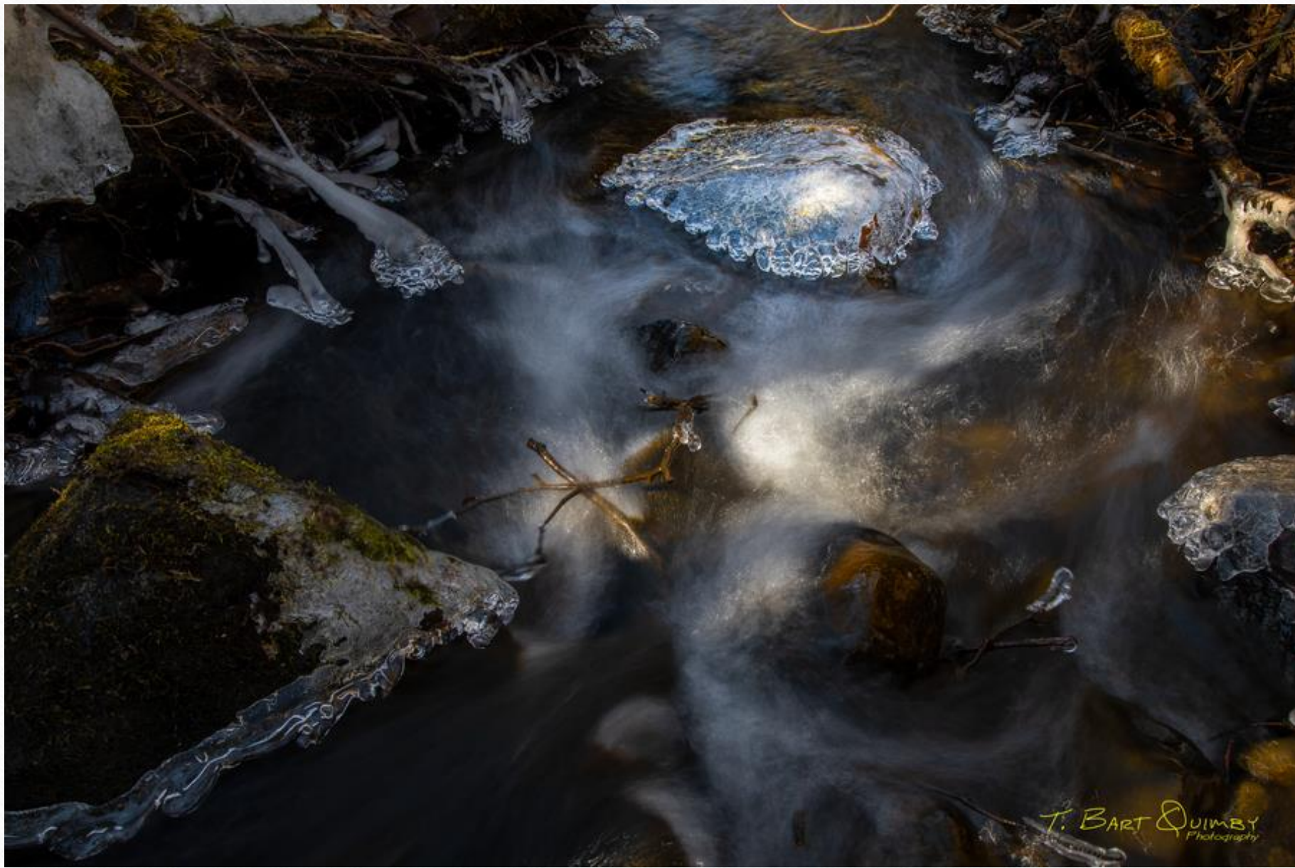
25-Bart Quimby – Ice on Fire Creek