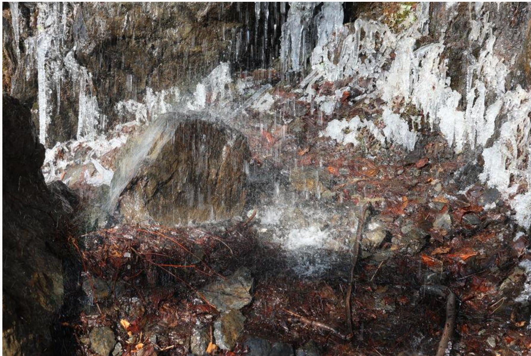
08-Bob Estey – moving water