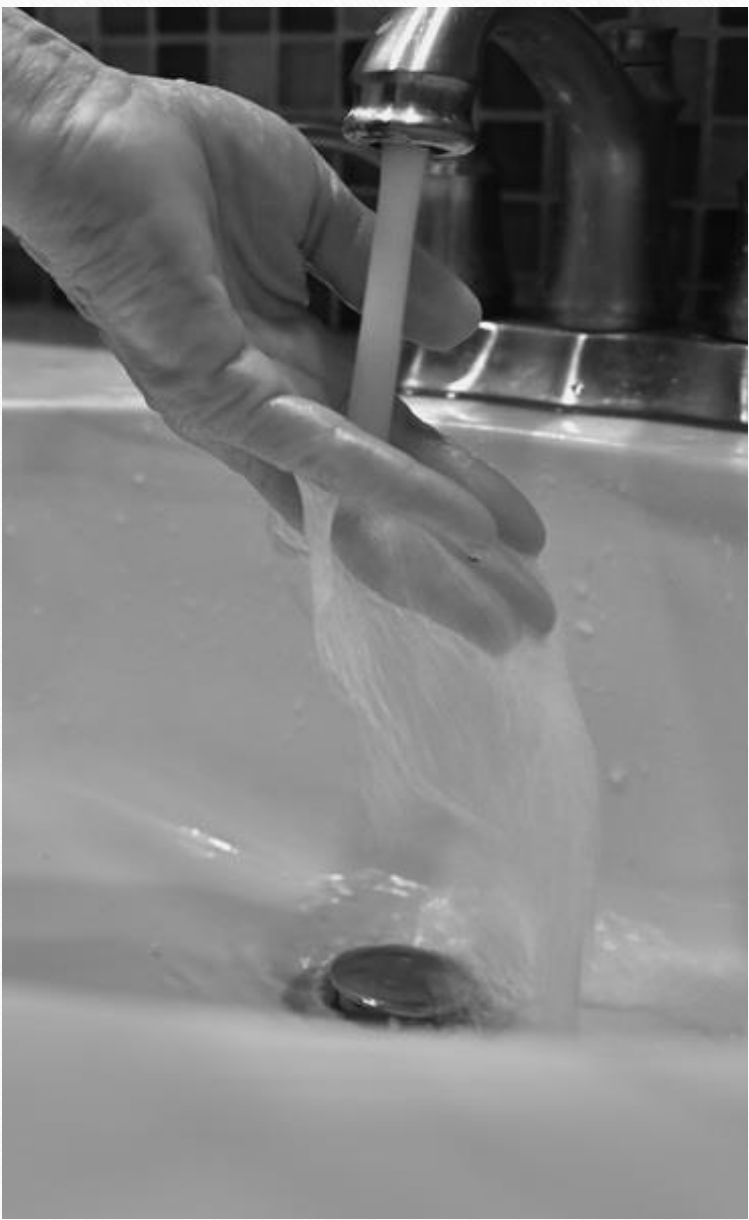
55-marty – fast flow BW