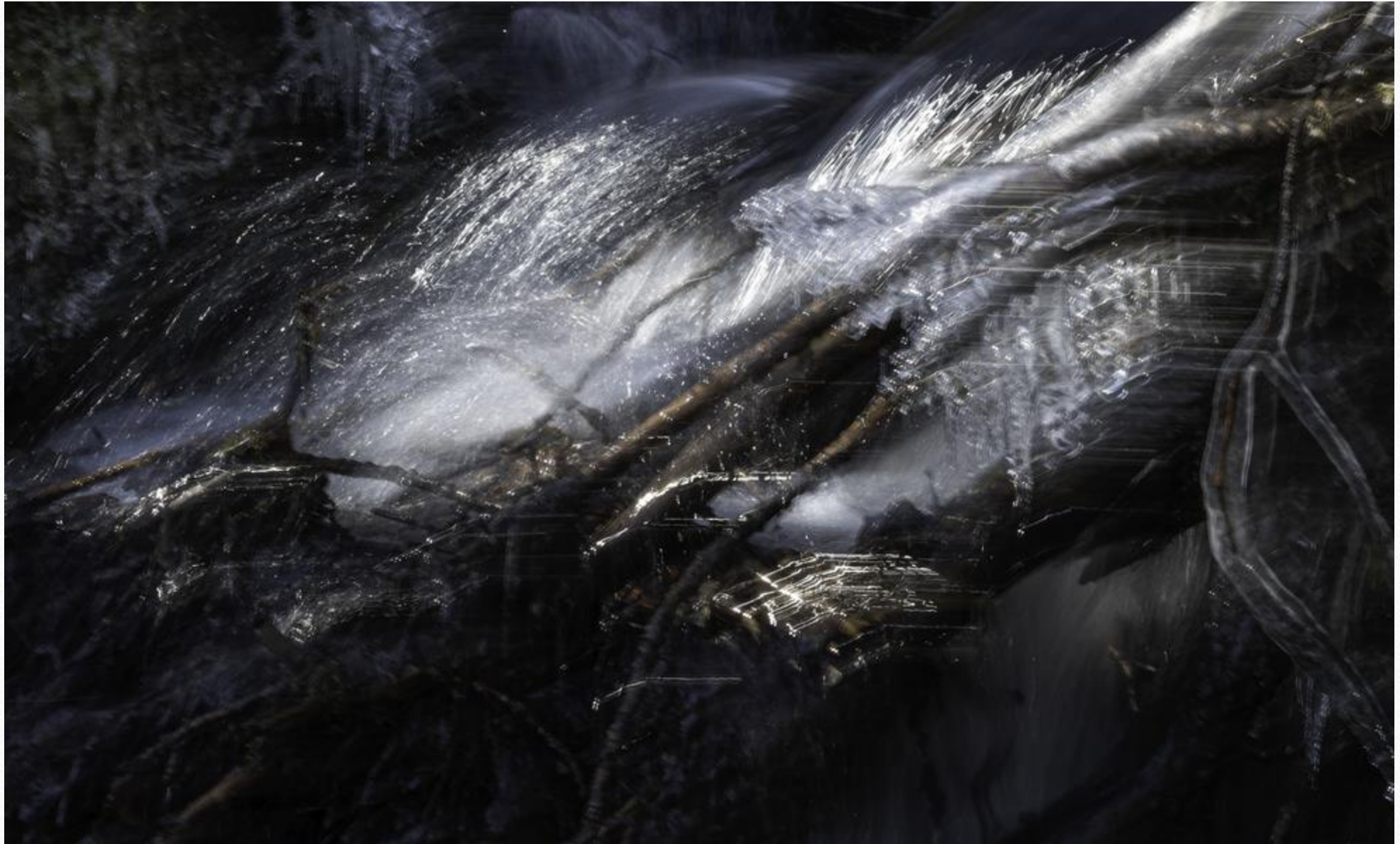
61-Bill Cole – Falls Creek Slip