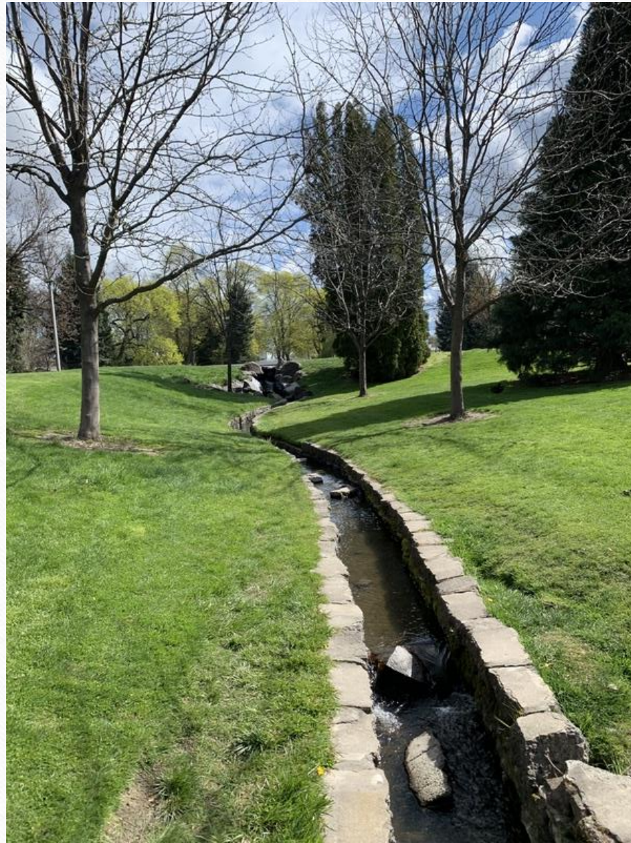
11-Walla Walla Stream-Ellen Nash