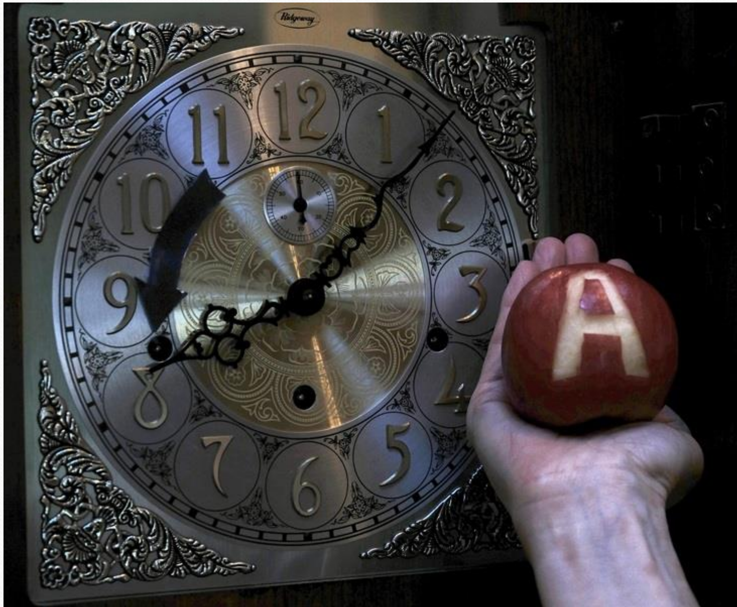
15-John Wedelich - A Noodle In Time