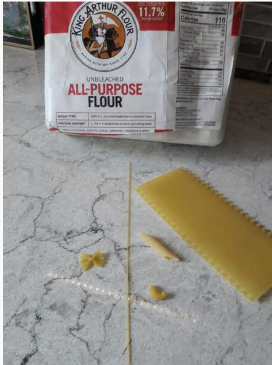
58-Pamela Weaver's Sister