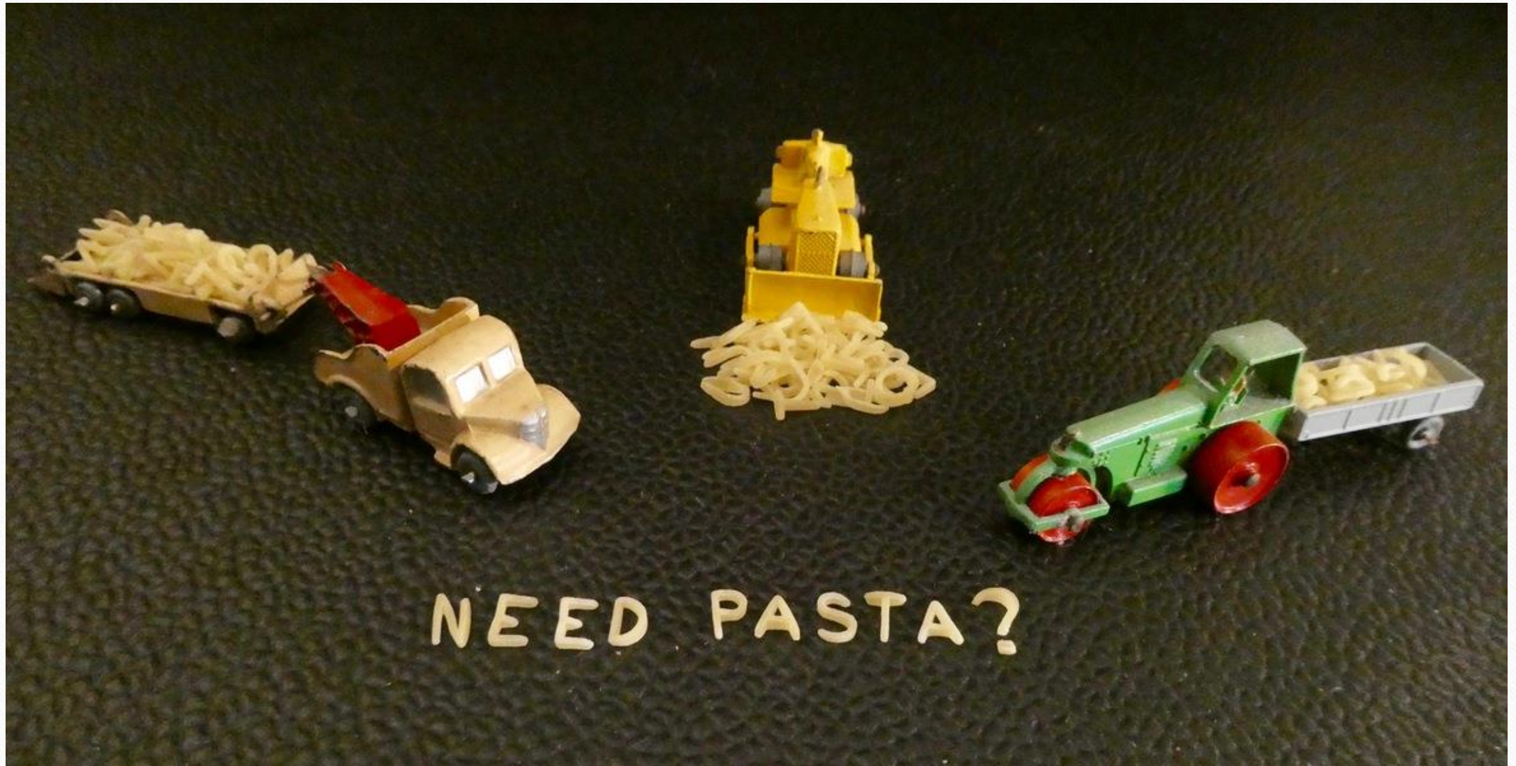
03-Betsey Howard - Pasta is the new toilet paper