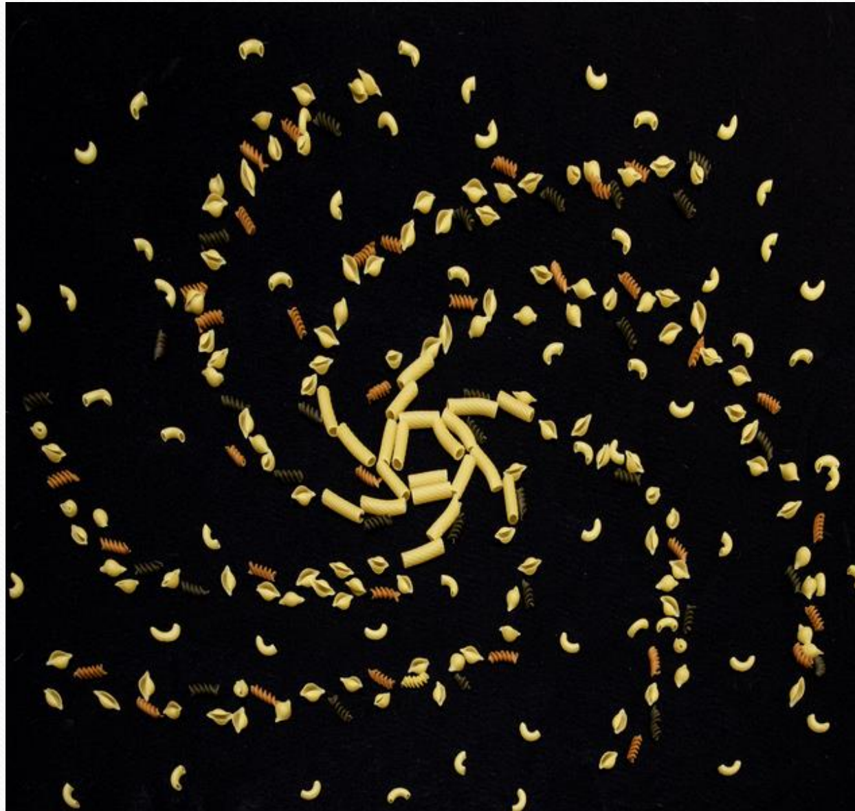
10-Bill Cole - The Pasta Way