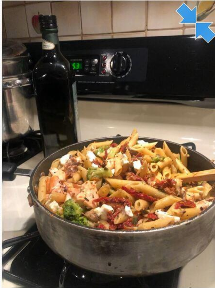
19-Jan Wachsmuth - Better Late Than Never