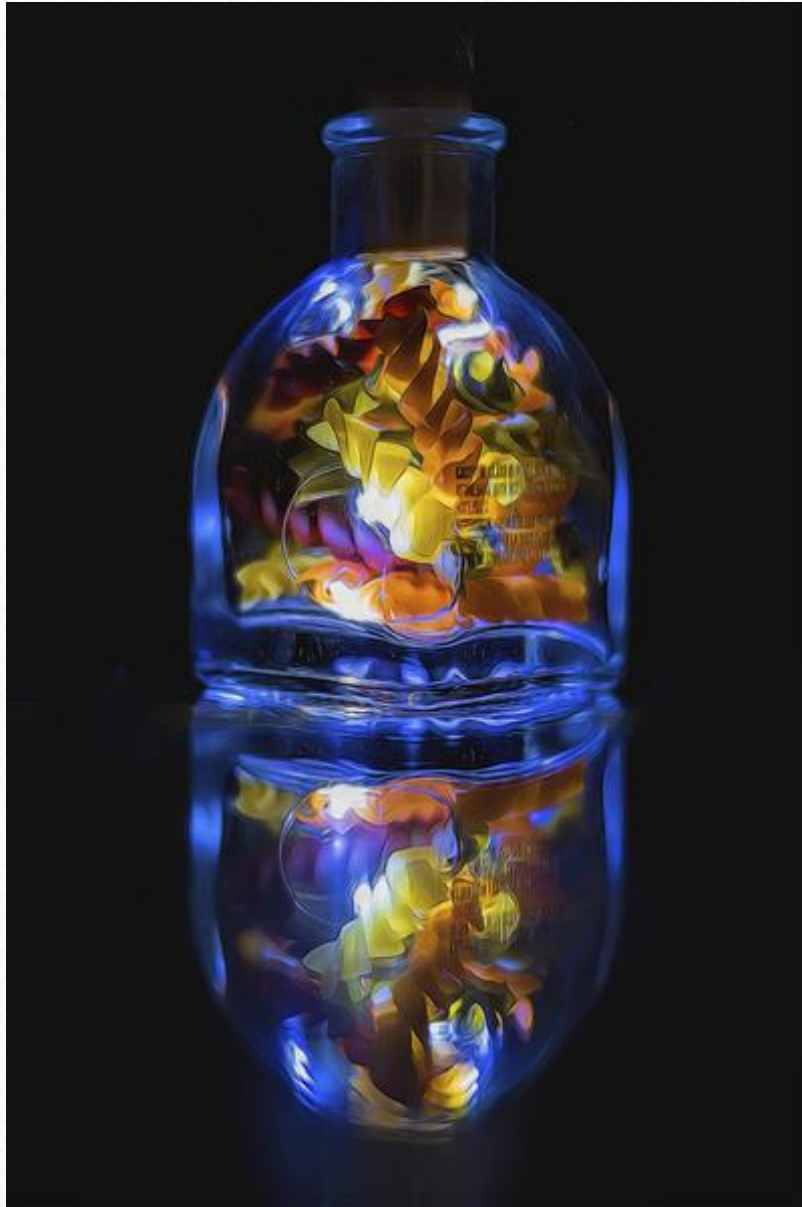
12-Mark Morones - pasta lite