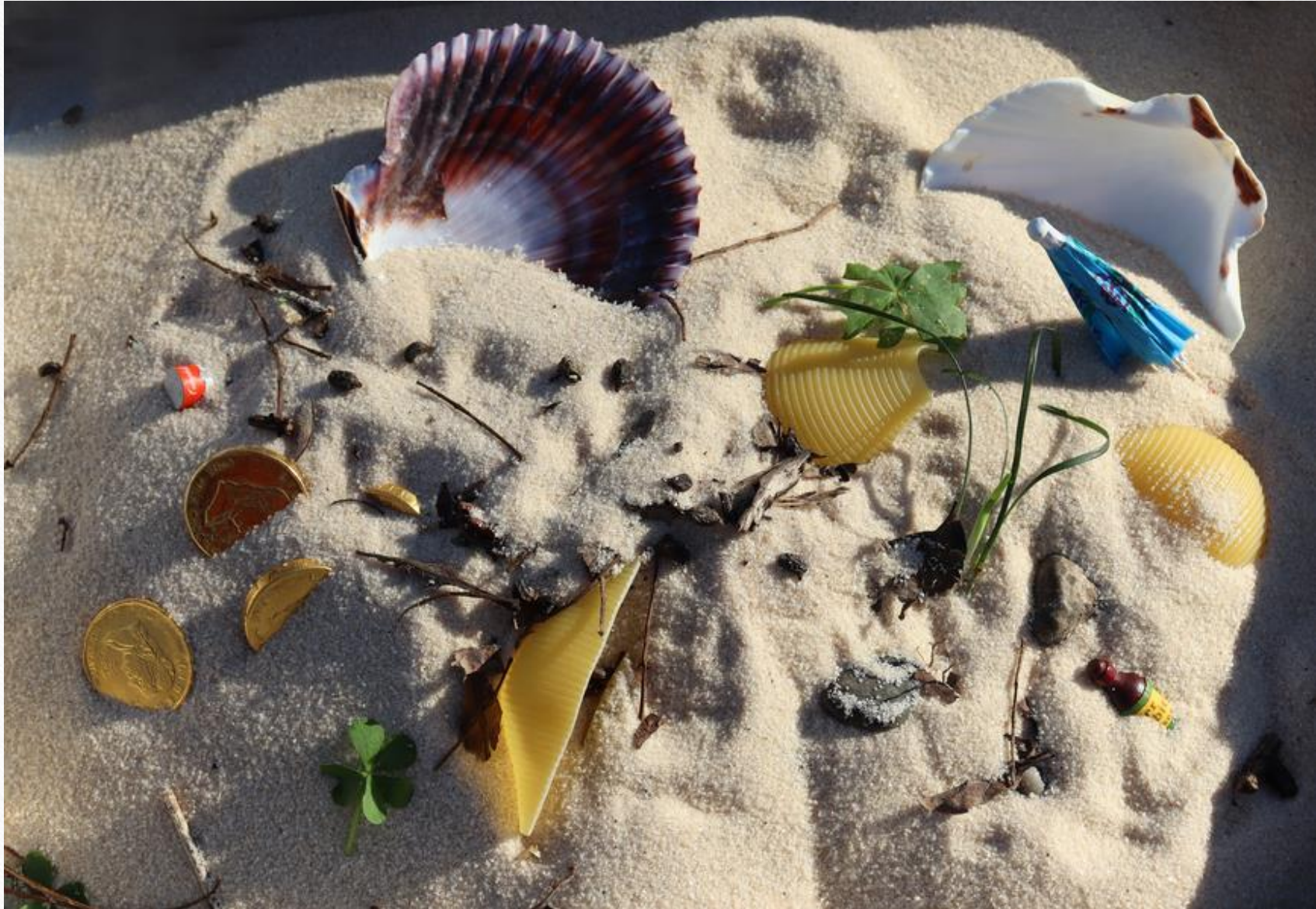
13-Carol Renfro - Pasta Beach