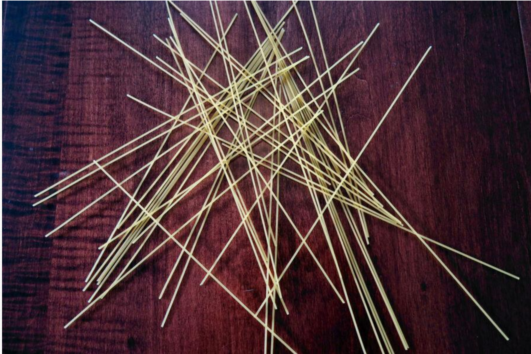
08-Bob Estey - pickup sticks