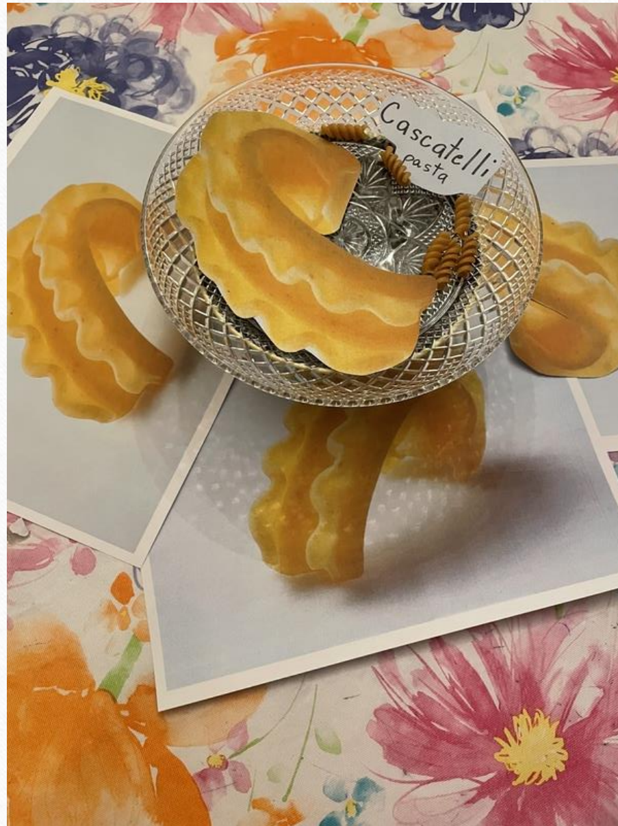
18-Pamela Mae Weaver – Playing with food