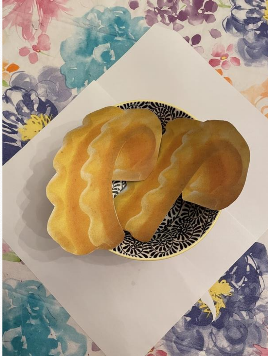
56-Pamela Mae Weaver