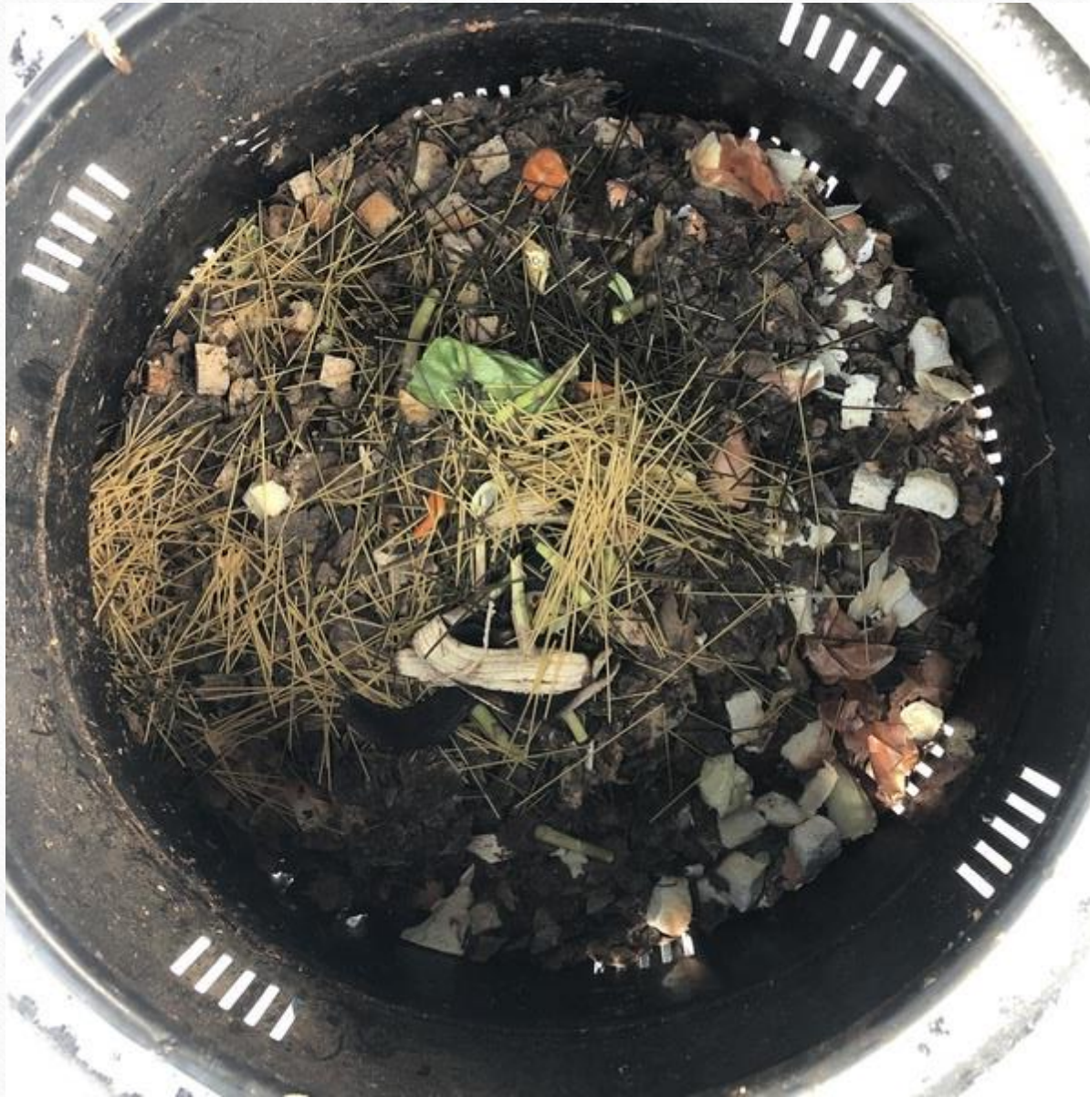
11-Meg Parsons – Spaghetti Composte, Dinner for the Garden