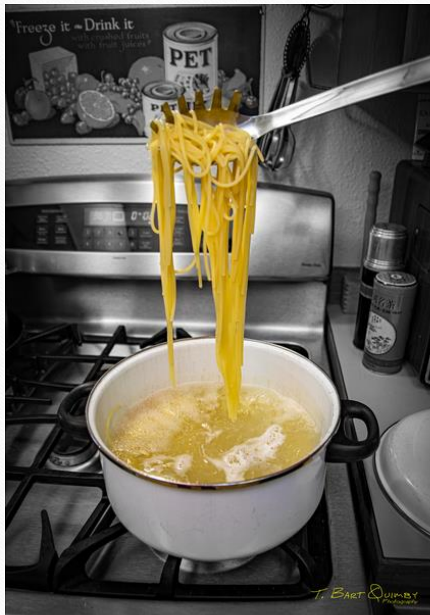
20-Bart Quimby - Wet Noodles